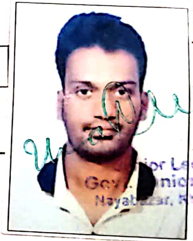
Senior Lecturer Gov. Junior College Nayabazar, Khammam.

[Signature] SECRETARY DISTRICT LEGAL SERVICES AUTHORITY, Vikarabad