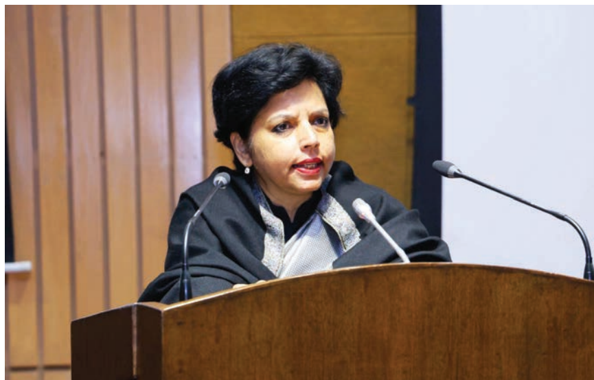
Chairperson of the GSICC, Hon'ble Ms Justice Hima Kohli addressing the participants on Gender Sensitization and Prevention of Sexual Harassment at Workplace Training

The Chief Justice concluded on a positive note, expressing optimism about society's progress in a positive direction, and emphasized that the major challenge now is to create a level playing field and elevate more women to various positions of responsibility.