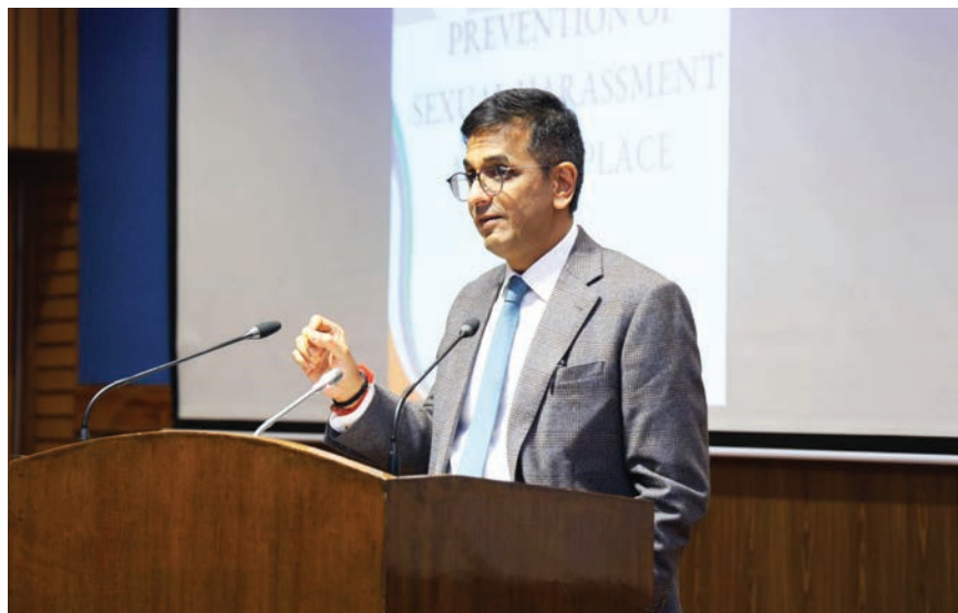
Dr D Y Chandrachud, Chief Justice of India, addressing the participants at GSICC training on 19 January, 2024