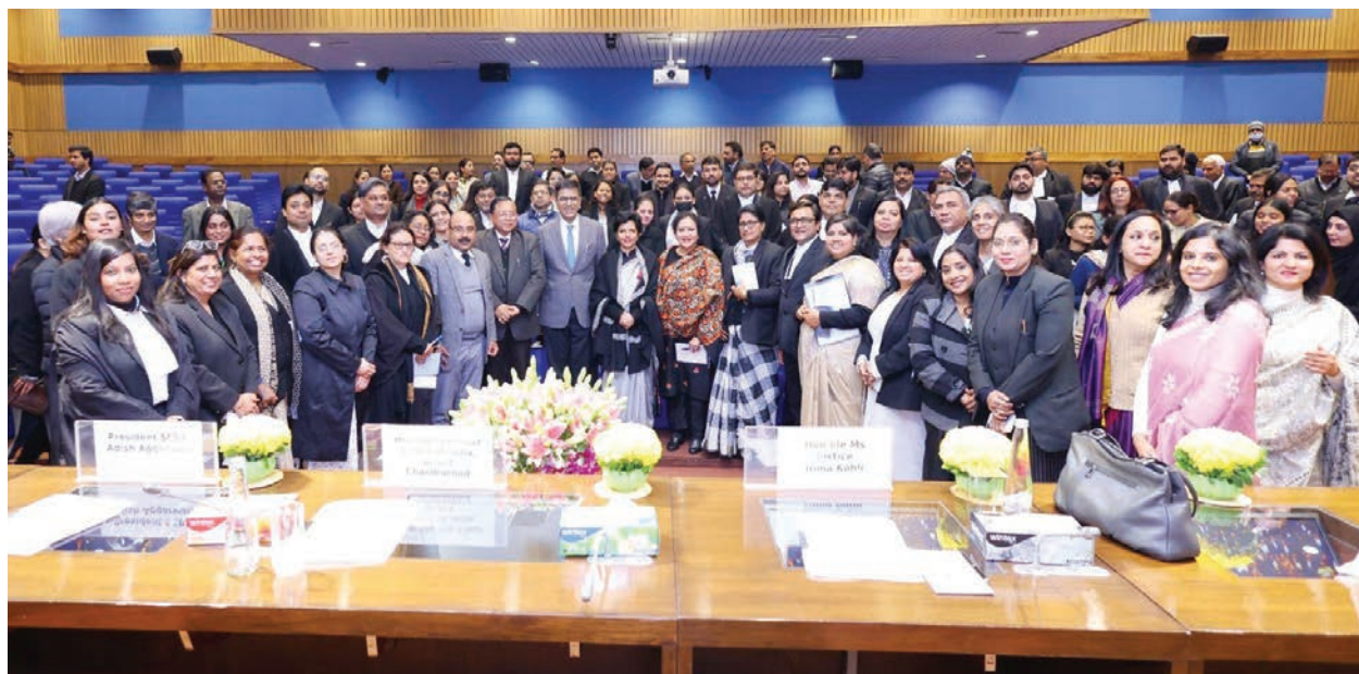
Group Photo taken during the Gender Sensitization and Prevention of Sexual Harassment at Workplace Training held on 19 January 2024