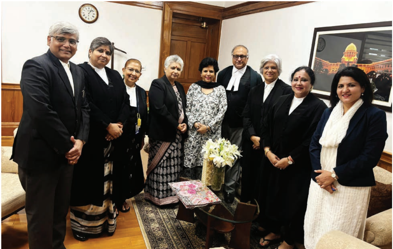
9 August 2024, Justice B.V. Nagarathna and Justice P S Narasimha with members of the Supreme Court's Gender Sensitisation and Internal Complaints Committee (GSICC) bid farewell to Justice Hima Kohli