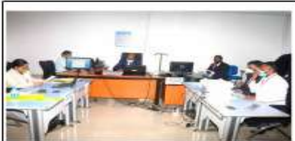
Figure 1: Court Point