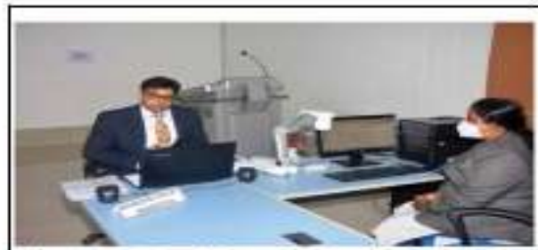
Figure 2: Hospital remote point