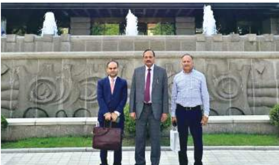
27 August 2024, Justice Surya Kant, at Korea Legislation Research Institute (KLRI), where he spoke on the topic, ‘Cross Border Challenges in Insolvency and Bankruptcy Laws’ in “KLRI Programme” Sejong, South Korea