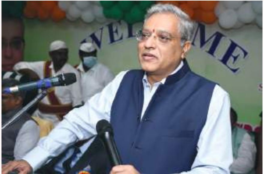
24 August 2024, Justice P S Narasimha visits the District Court Guntur and addresses the Guntur Bar Association