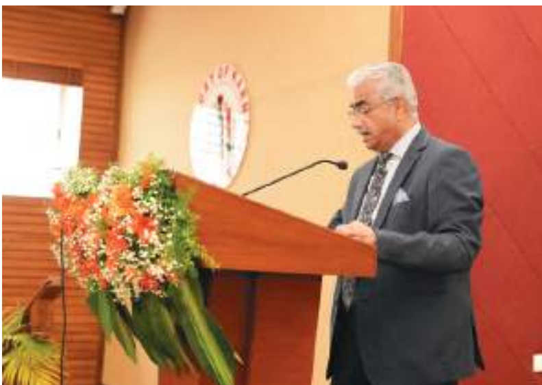
18 August 2024, Justice Aravind Kumar, Chief Guest, addresses the gathering at the Silver Jubilee Celebrations of Karnataka Judicial Academy – “Nyayajnana” - A Silver Milestone at Auditorium, Karnataka Judicial Academy, Bengaluru