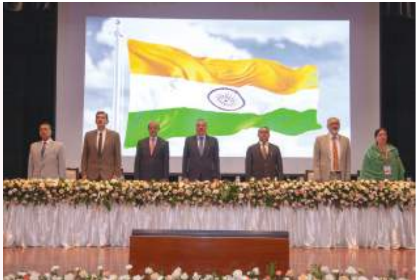
10-11 August 2024, Justice Surya Kant, Justice Rajesh Bindal and Justice A G Masih along with the Chief Justices of various High Courts attend the "National Conference at Punjab and Haryana High Court," Chandigarh