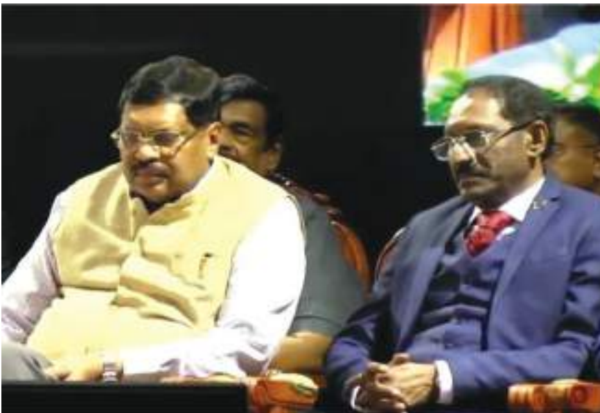
16 August 2024, Justice B R Gavai and Justice C T Ravikumar, Judges, Supreme Court of India, at the inauguration of 'Digital Courts,' Kerala High Court, Kochi. The event was also attended by Justice Rajesh Bindal, Judge, Supreme Court of India