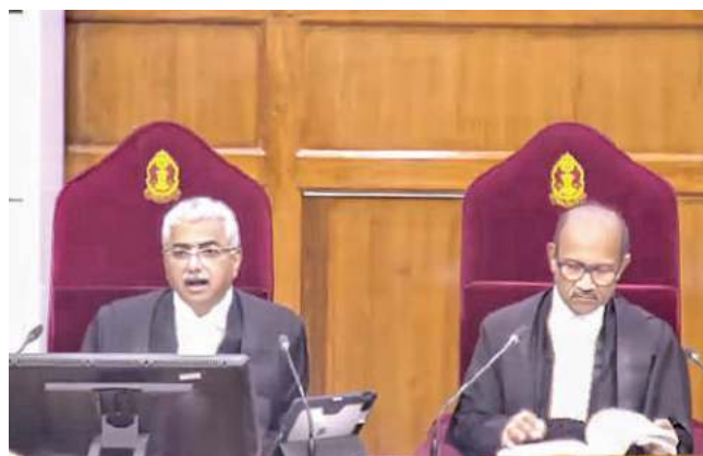
Vacation Bench in session in Courtroom No 13

While the Supreme Court of India observes its scheduled vacation, it paradoxically takes on more work than on normal days. Demonstrating its institutional commitment, the Court remains accessible through three vacation benches each day, ensuring that doors to justice are always open. Even during these