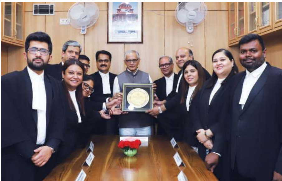
15 May 2024, the SCAORA Executive Committee presents a memento to Justice A S Bopanna on the occasion of his retirement