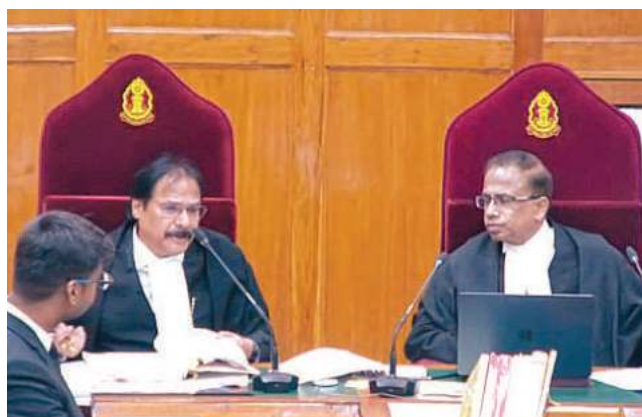
Vacation Bench in session in Courtroom No 14

breaks, urgent matters, bail cases, and other critical petitions are promptly addressed. During this period, the Court efficiently undertakes projects requiring less footfall, such as renovations, necessary repairs, and technological advancements, benefiting from reduced digital traffic. To understand the Supreme Court's operations during vacation, Supreme Court Chronicle embarked on a mission to focus on major branches that continue their