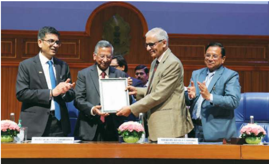
17 May 2024, Chief Justice of India, Dr D Y Chandrachud along with Attorney General of India and SCBA members bestow a ceremonious memento upon Justice A S Bopanna during a heartfelt farewell