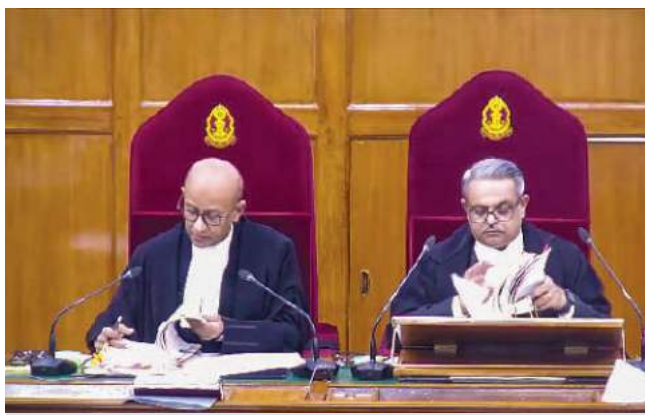
Vacation Bench in session in Courtroom No 12

While the Supreme Court of India observes its scheduled vacation, it paradoxically takes on more work than on normal days. Demonstrating its institutional commitment, the Court remains accessible through three vacation benches each day, ensuring that doors to justice are always open. Even during these