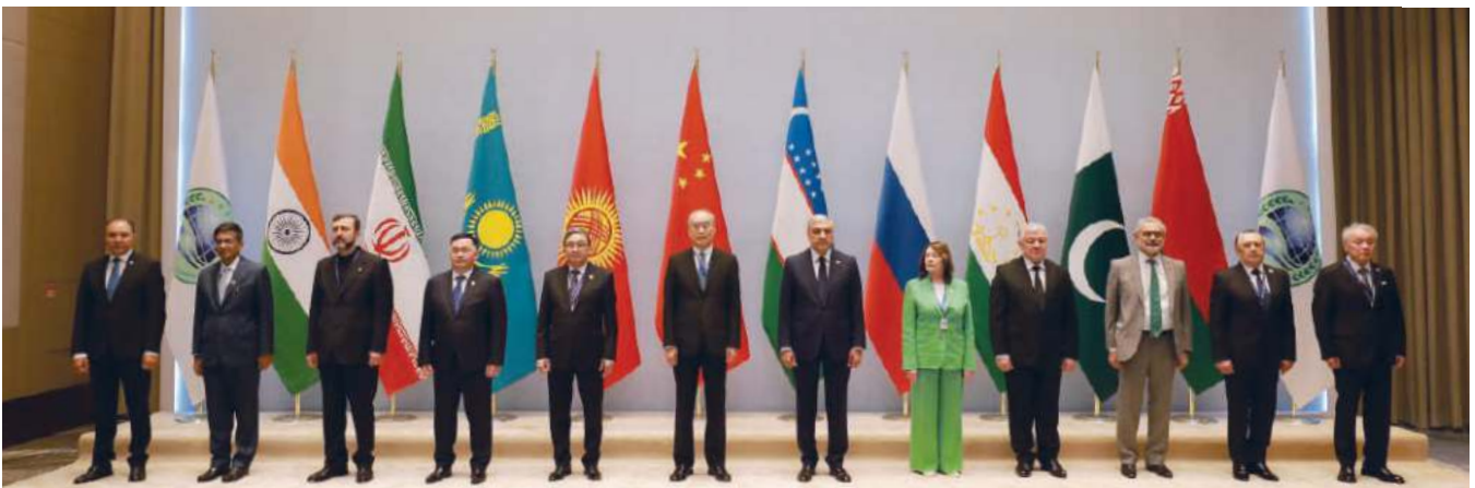
23 May 2024, Chief Justice of India, Dr D Y Chandrachud at the “XIX Meeting of Chief Justices/Chairpersons of the Supreme Courts of the Shanghai Cooperation Member States,” at Tashkent, Uzbekistan