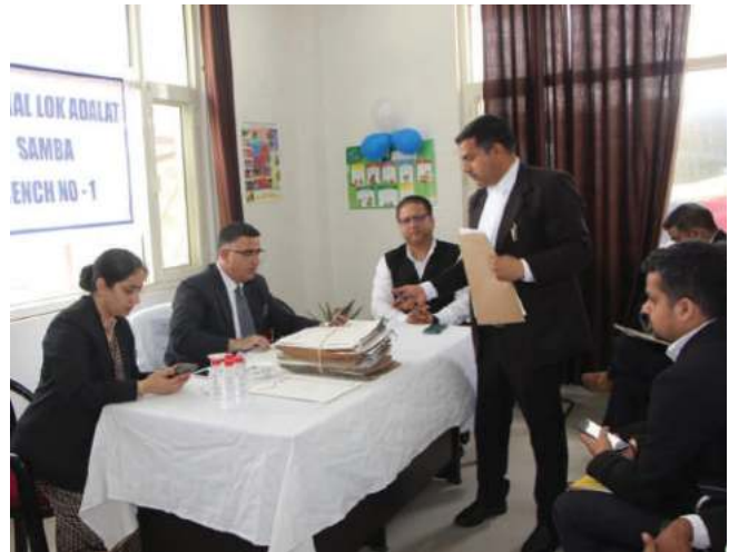
11 May 2024, 2nd National Lok Adalat for the year 2024 being undertaken in Samba, Jammu and Kashmir