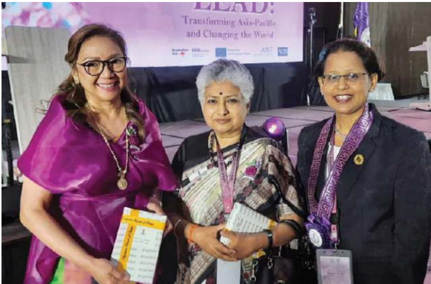
8 - 10 May 2024, Justice B V Nagarathna, at Session I- 'Initiatives of Women Judges towards Gender Parity at All Levels of the Judiciary' in the 2024 "Asia and the Pacific Regional Conference of the International Association of Women Judges and 2024 National Convention of the Philippine Women Judges Association," at Cebu City, Philippines