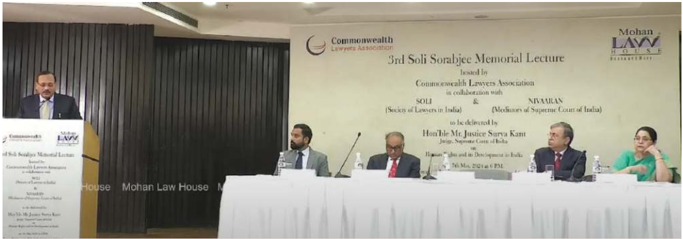
7 May 2024, Justice Surya Kant delivers a lecture on 'Human Rights and its Development in India' in the 3rd Soli Sorabjee Memorial Lecture organised by the Commonwealth Lawyers Association in collaboration with SOLI (Society of Lawyers in India) and NIVAARAN (Mediators of Supreme Court of India)