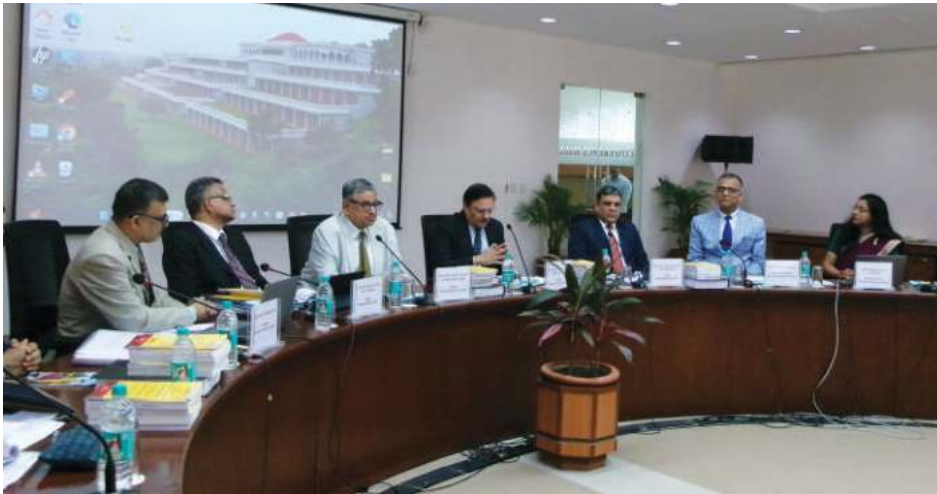
19 May 2024, Justice Abhay S Oka, chairs Session IV - Designing Curriculum for Specific Judicial Needs at National Judicial Academy, Bhopal