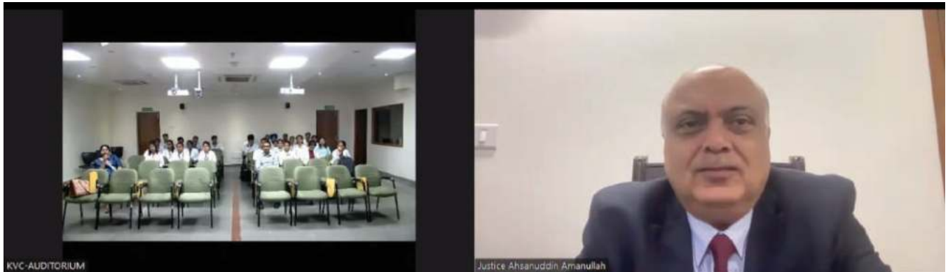
8 May 2024, Justice Ahsanuddin Amanullah, virtually delivers a lecture on 'Importance of Ethics in Professions' organised by the LV Prasad Eye Institute, Vijayawada, Andhra Pradesh