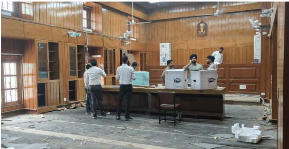
Courtroom no 6 among other courtrooms including 7, 8, and 9 being renovated to make them futuristic and technologically advanced during vacation

important centre, critical for managing overall court operations. There is also an ongoing effort to install two Justice clocks between Gates B & C and between Gates D & E, which will display the statistical information such as institution, disposal and pendency of cases in the Supreme Court of India, to the general public.