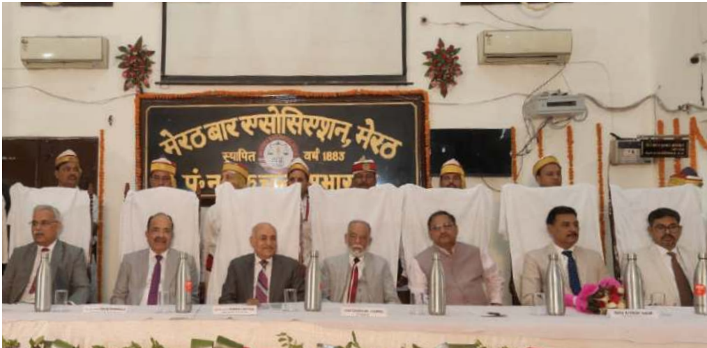
18 May 2024, Justice Pankaj Mithal at the felicitation ceremony of lawyers who put 50 years and more in the legal profession, organised by the Bar Association, Meerut, UP