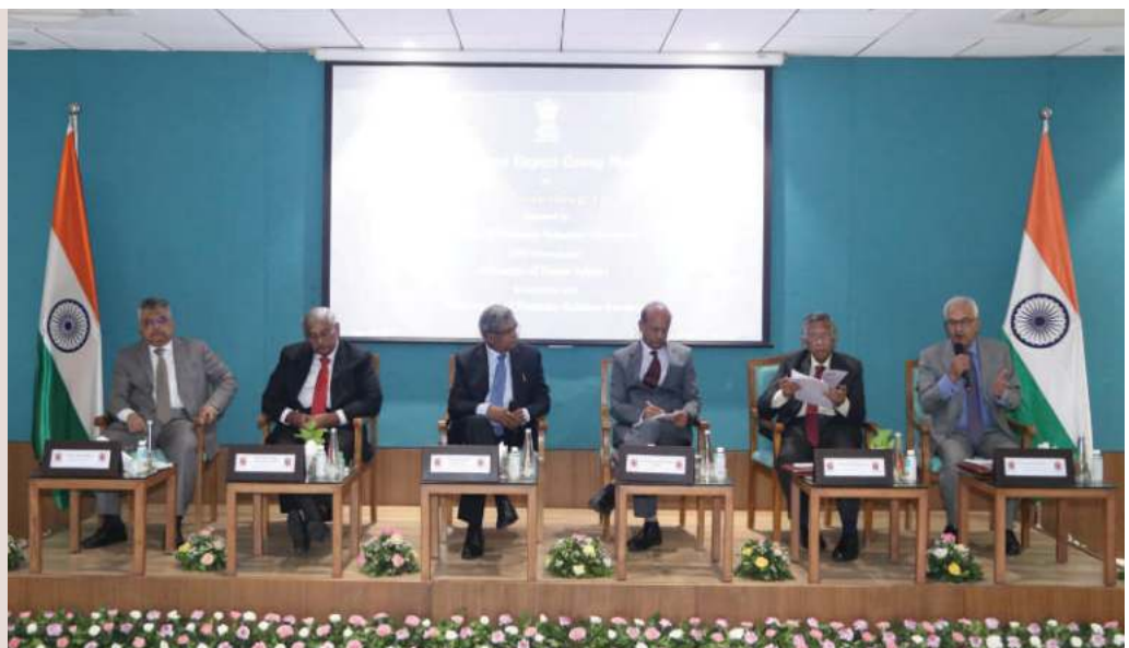
18 May 2024, Justice Rajesh Bindal and Justice Vikram Nath in Panel II : Regulatory Aspects of Forensic Sciences Sector of the High Power Expert Group meeting on strengthening criminal justice system through enhanced forensic efficiency organised by National Forensic Sciences University, Gandhinagar