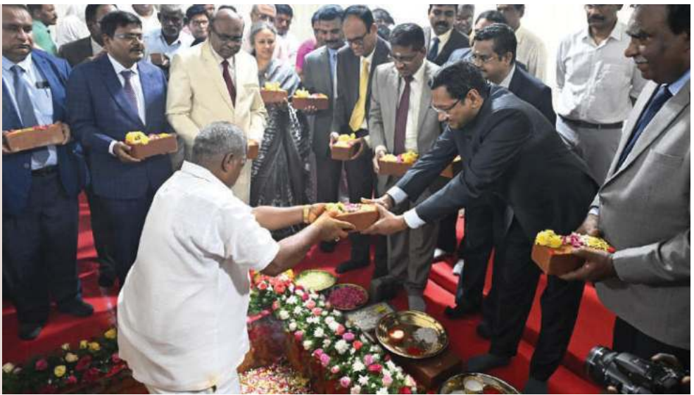
22 May 2024, Justice M M Sundresh at the foundation stone laying function for the construction of 10 Bungalows for the Judges; five storey building for the court halls; Judges' Chambers; Sections/Offices; and Record Room in the Old Law College Campus, Chennai