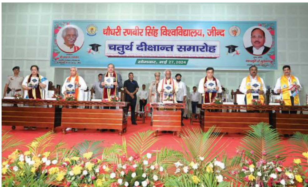
27 May 2024, Justice Surya Kant, Chief Guest, at the fourth convocation ceremony at Chaudhary Ranbir Singh University (CRSU), Jind