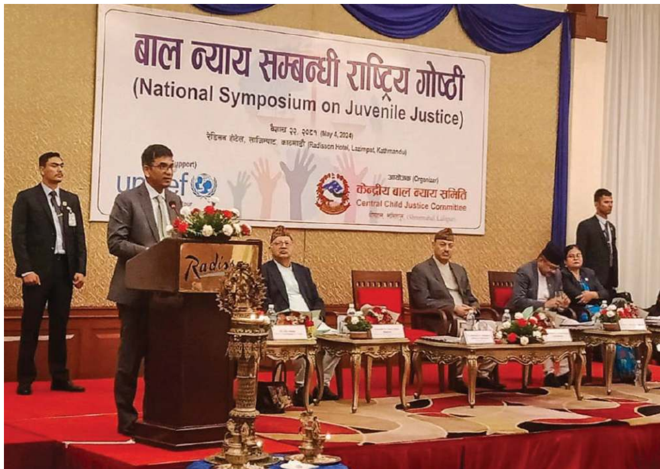
4 May 2024, Chief Justice of India, Dr D Y Chandrachud delivers a keynote address at “National Symposium on Juvenile Justice,” Nepal