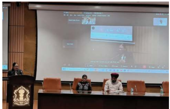
21-22 May 2024, Training cell in collaboration with Department of Personnel & Training (DoPT) conducts a training session on implementing e-HRMS 2.0 for Registry officers of the Supreme Court of India which was attended by 555 participants (266 in physical mode and 289 in virtual mode)

In the month of May, 2024, eleven 40-hour Mediation Training Programmes (MTP) and two 20-hour Refresher Programmes (RP) were conducted under the aegis of the Mediation and Conciliation Project Committee, Supreme