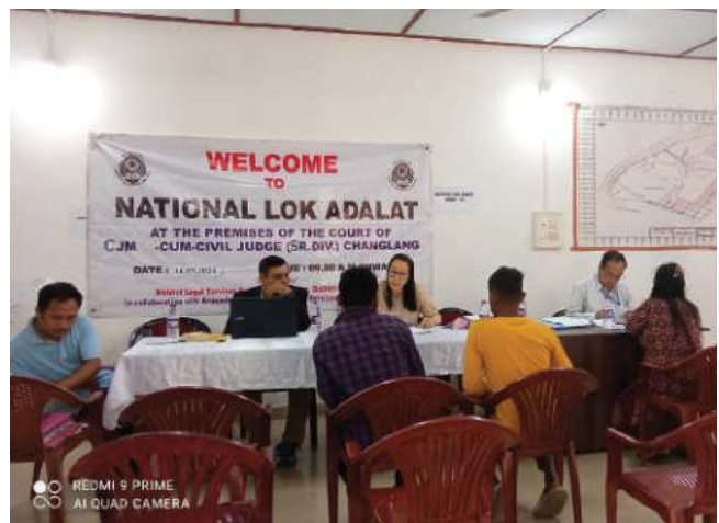
11 May 2024, 2nd National Lok Adalat for the year 2024 being undertaken in Changlang, Arunachal Pradesh