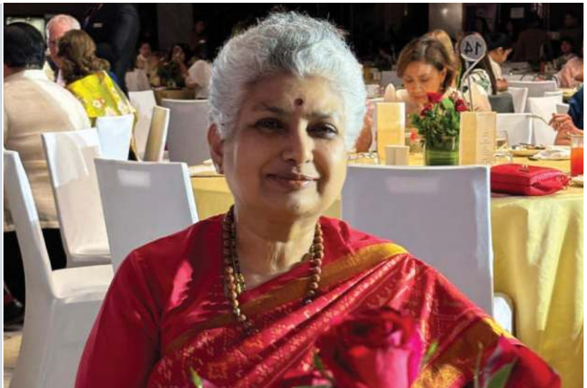
8 - 10 May 2024, Justice B V Nagarathna at the 2024 "Asia and the Pacific Regional Conference of the International Association of Women Judges and 2024 National Convention of the Philippine Women Judges Association," Philippines