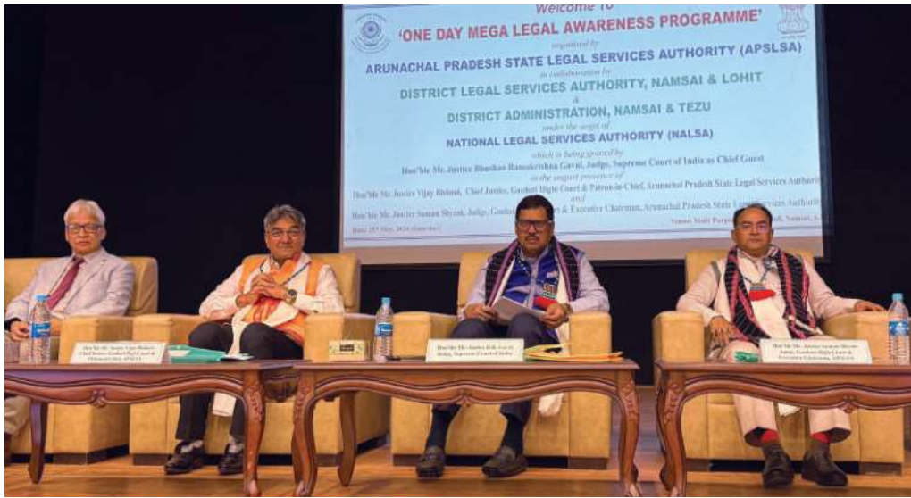
25 May 2024, Justice B R Gavai at the “Mega legal awareness programme” organised by the Arunachal Pradesh State Legal Services Authority (APLSA), Namsai