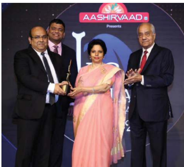
4 May 2024, Justice Hima Kohli, Chief Guest, attends the 13th Indian Legal Awards 2023-24