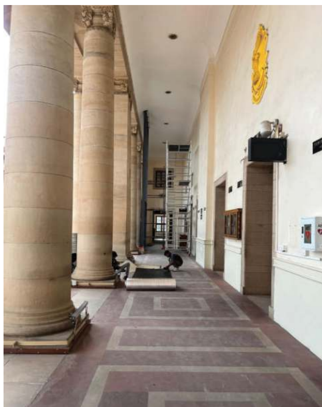
Ongoing repairs at Supreme Court during summer vacation

the West Wing of the Court. A state-of-the-art Command and Control Centre, also referred to as a ‘War Room’, is being constructed which will be equipped with advanced monitoring and communication systems. This will serve as an