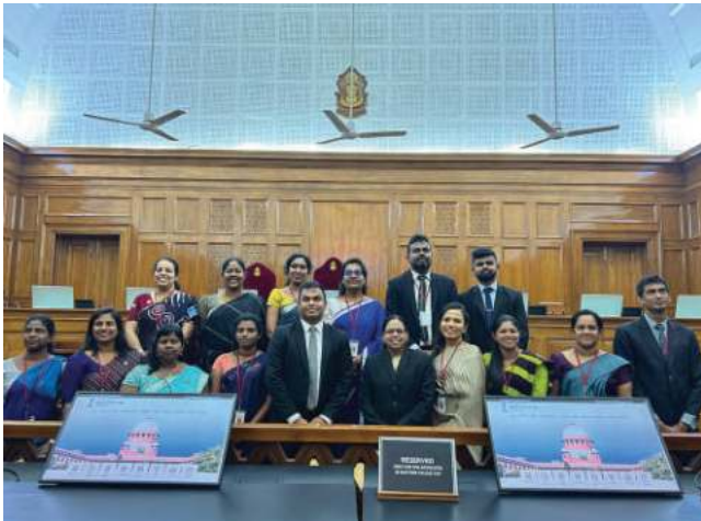
9 - 13 May 2024, the Supreme Court of India conducts a four-day training program for the delegation consisting of 15 officials of the Supreme Court of Sri Lanka