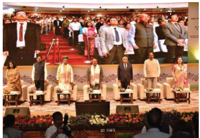
18 May 2024, Justice Hrishikesh Roy at the Conference on India's Path in the Administration of Criminal Justice system at IIT Guwahati, Assam