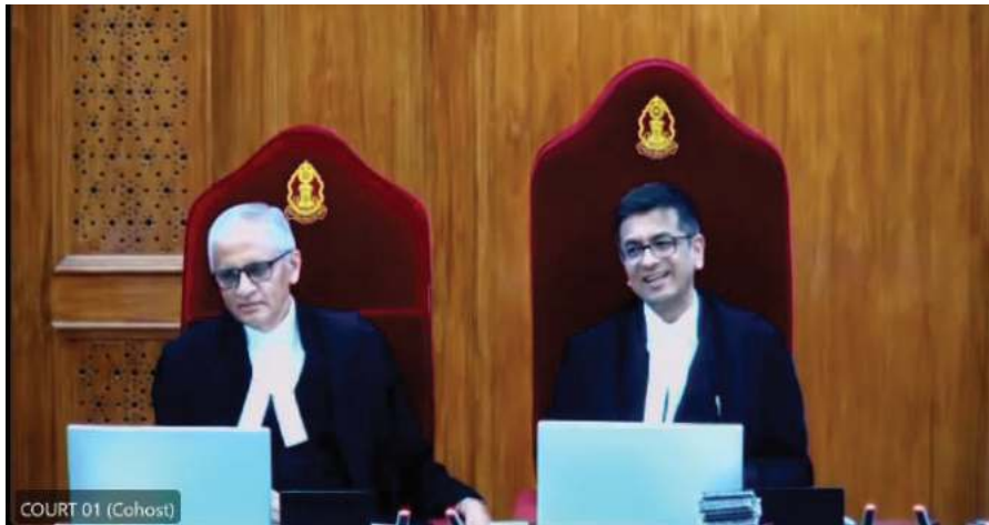
17 May 2024, Chief Justice of India, Dr D Y Chandrachud and Justice A S Bopanna during the ceremonial bench proceedings in Courtroom no 1

22-29 May 2024, SCAORA conducts a lecture series for AOR exam scheduled in June 2024