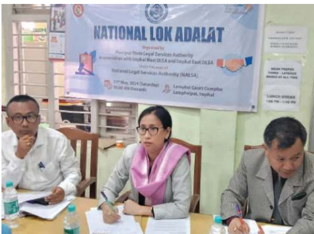
11 May 2024, 2nd National Lok Adalat for the year 2024 being undertaken in Lamphelpat, Imphal, Manipur