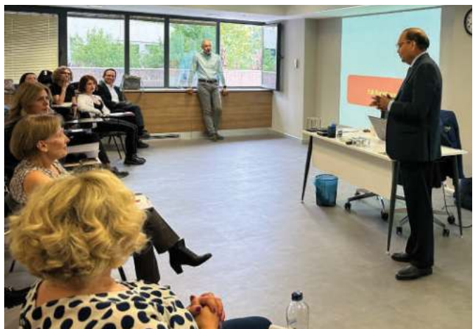
30 May 2024, Justice Surya Kant at the event organised by Energy Dispute Arbitration Centre in partnership with Ankara Bar Association, Turkey