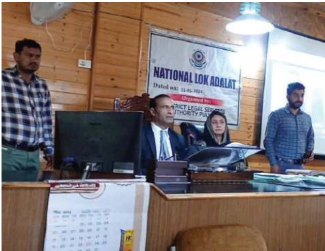
11 May 2024, 2nd National Lok Adalat for the year 2024 being undertaken in Pulkama, Jammu and Kashmir

labour disputes, and other civil cases. Pending court cases and pre-litigation cases were also taken up and settled. As per the data, 11,00,669 cases (including 6,94,450 pending cases and 4,06,219 pre-litigation cases) were settled in this particular Lok Adalat, wherein the total settlement amount was recorded to be around ₹ 3,525.77 crores.