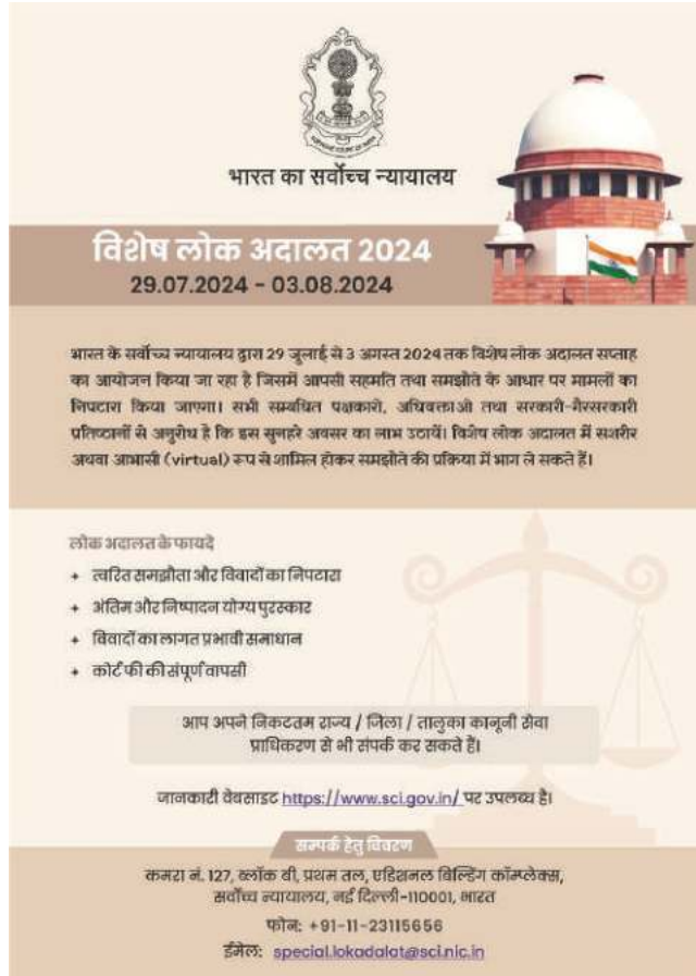
Bilingual posters of Special Lok Adalat to be held by Supreme Court of India from 29 July 2024 to 3 August 2024