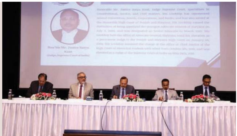
26 May 2024, Justice Surya Kant, Chief Guest, attends the Law Summit organised by the Chandigarh Judicial Academy in collaboration with IIM Rohtak