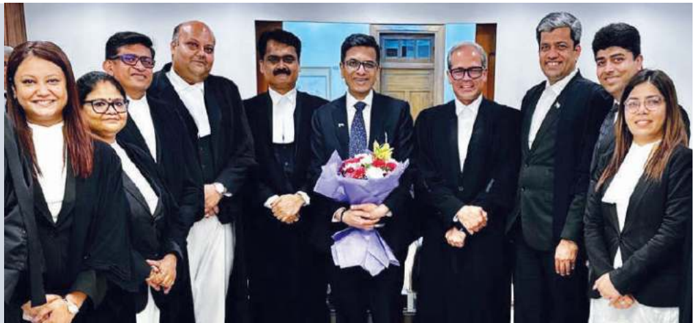
2 May 2024, the newly elected Executive Committee of SCAORA presents a bouquet to the Chief Justice of India, Dr D Y Chandrachud