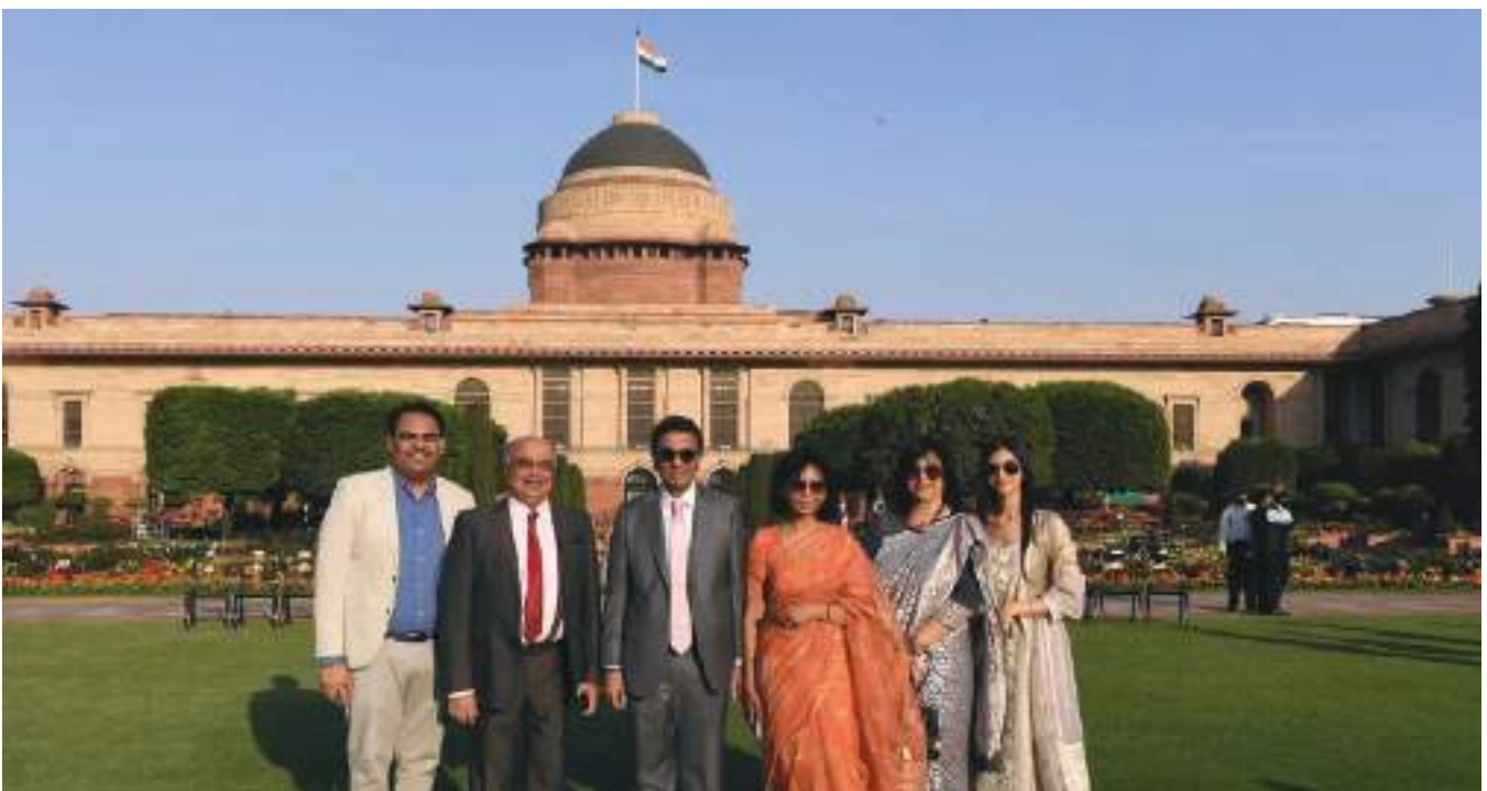
Left to right: Justice Ahsanuddin Amanullah, the Chief Justice of India, Dr D Y Chandrachud, along with their families, at the Amrit Udyan at the Rashtrapati Bhavan on 4 March 2024