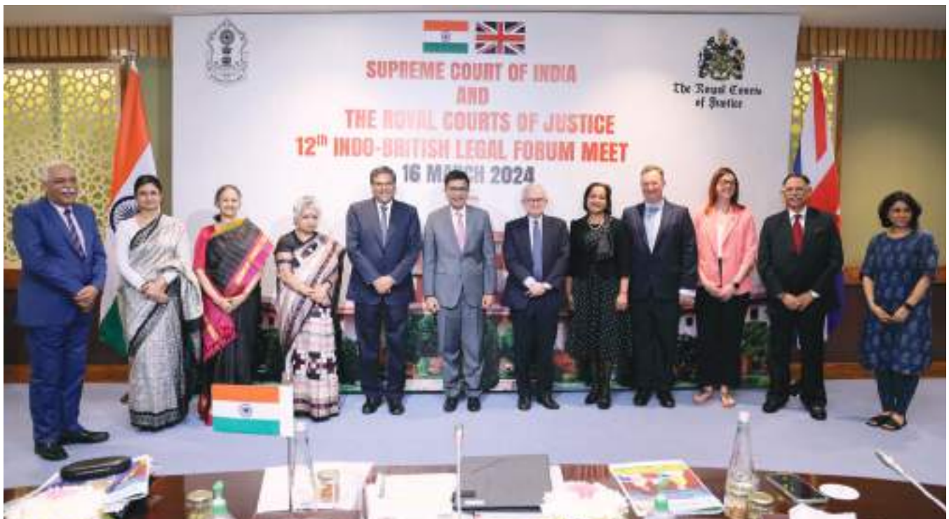
16 March 2024, the Chief Justice of India, Dr D Y Chandrachud, Justice Sanjiv Khanna, and Justice B V Nagarathna along with other dignitaries at the 12th Indo-British Legal Forum Meet held at the Supreme Court of India, New Delhi