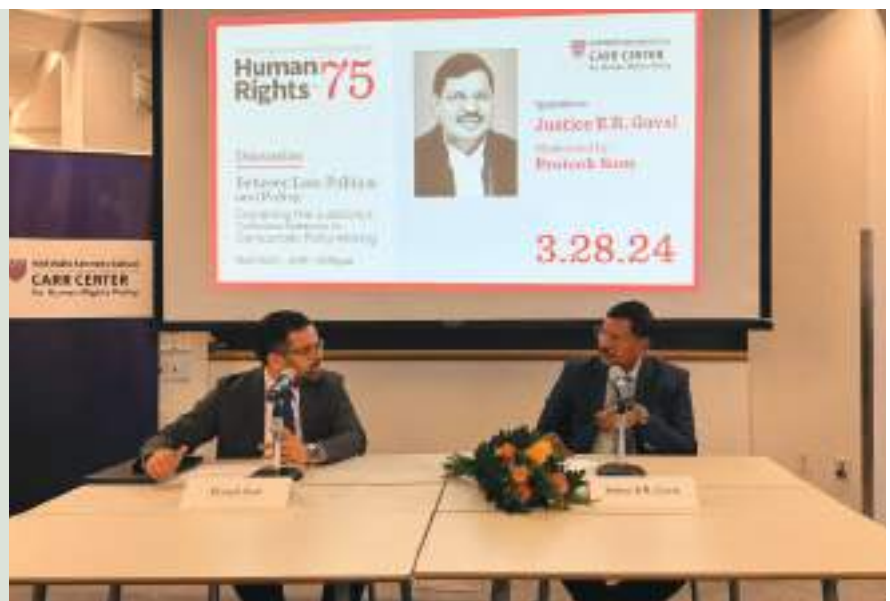
28 March 2024, Justice B R Gavai, attends the program on ‘Between Law, Politics and Policy: Examining the Judiciary’s Delicate Balance in Democratic Policy Making’ at Harvard Kennedy School, Boston