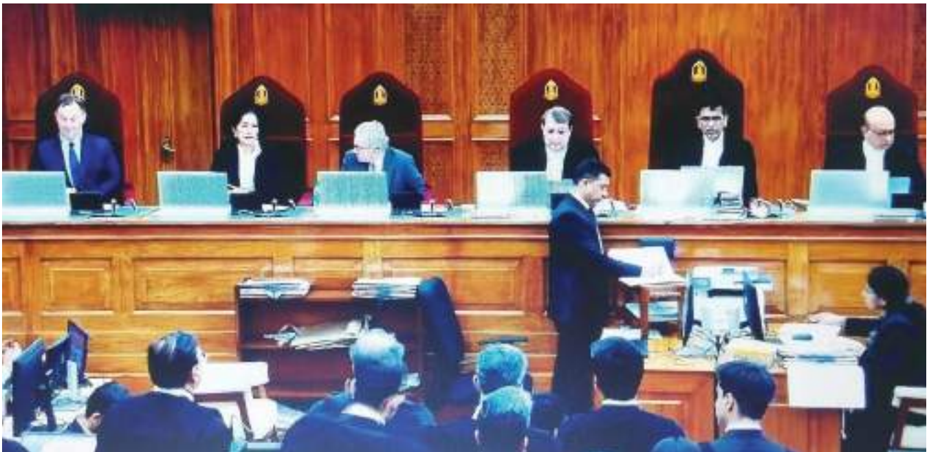
15 March 2024, the delegates for 12th Indo-British Legal Forum Meet, share the dias with the Supreme Court Judges as observers, during the Court proceedings