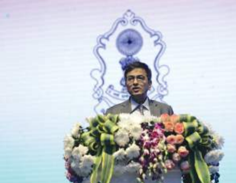
2 March 2024, the Chief Justice of India, Dr D Y Chandrachud, addresses judicial officers during the inaugural session of the All India District Judges' Conference at Kachchh, Gujarat

"Today is an extraordinary day for me personally, this is because I am present amongst the judicial officers of the district judiciary from across the country. The District Judiciary has always been said to form the backbone of our legal system. It is not just a backbone, the district judiciary, I believe, is the central nervous system of the Indian judiciary. The District judiciary represents the eyes, the ears, and the voice of the Indian Judicial system. Together, the Supreme Court, the High Courts and the District Judiciary represent the soul of the Indian Judiciary and our commitment to the rule of law."