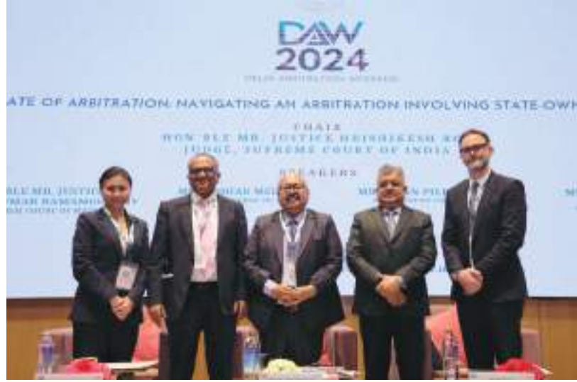
8 March 2024, Justice Hrishikesh Roy, chairs Session-I on 'The State of Arbitration: Navigating an Arbitration Involving State-owned Entities' at DAW, 2024