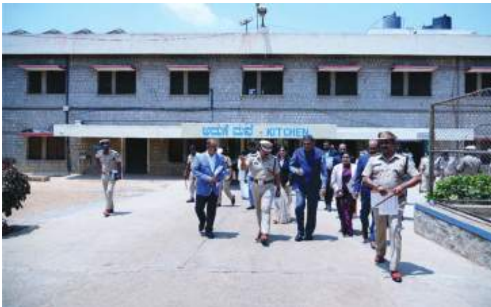
23 March 2024, Justice Sanjiv Khanna, Executive Chairman, NALSA visits the Parappana Agrahara Central Prison, Bengaluru. Justice Khanna also visits the barracks for the inmates, the prison hospital, the kitchen, the vocational training centre and the Legal Services Clinic etc. housing around 5000 inmates including convicts and undertrials

civil matters. Many recovery issues involving financial institutions, banks, government entities, and private companies were resolved before they reached litigation. In a significant achievement, a grand total of 3,11,98,807 cases were settled, comprising 38,67,082 pending cases and 2,73,31,725 pre-litigation cases, with the aggregate settlement amount reaching Rs. 17,482.47 crores.