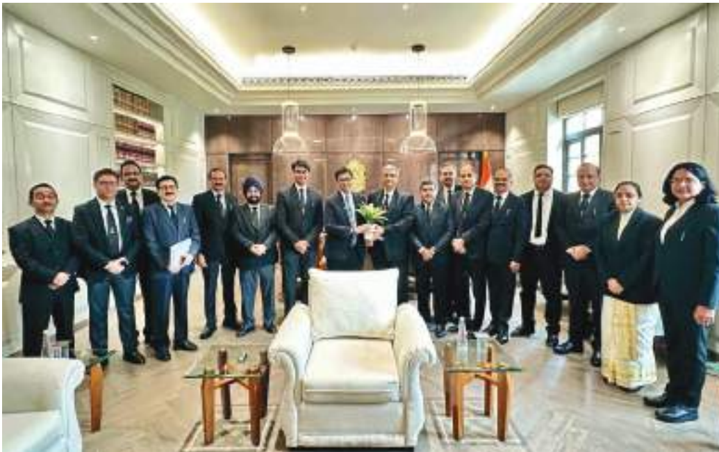
29 March, 2024, the Chief Justice of India, Dr D Y Chandrachud greeted by the Supreme Court Registry as he enters his 25th year of judgeship