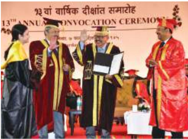
16 March 2024, Justice Hrishikesh Roy attends the 13th Convocation Ceremony of National Law Institute University (NLIU), Bhopal, held at the Justice J S Verma Memorial Convention Centre