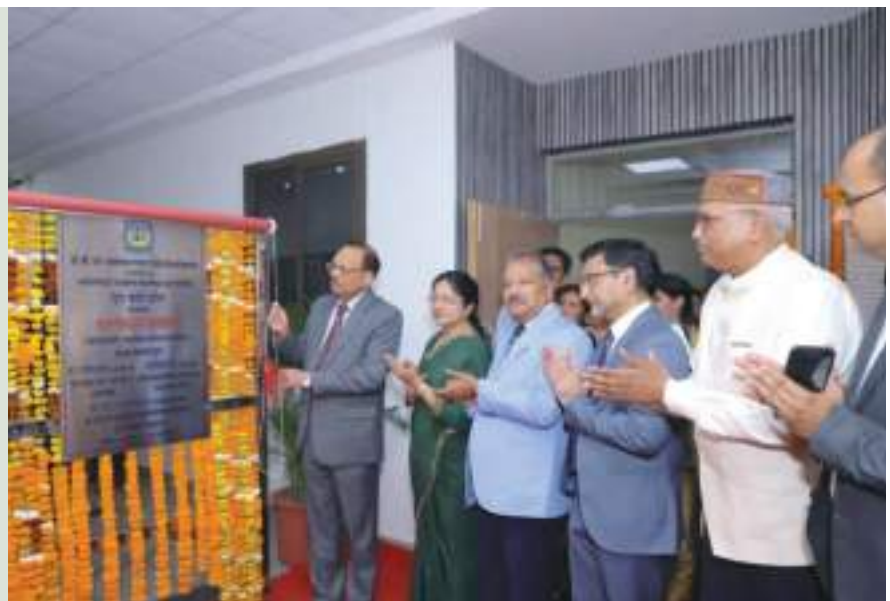
30 March 2024, Justice Surya Kant, Chief Guest, attends the inaugural ceremony of the Moot Court Hall at Dr B R Ambedkar National Law University, Sonapat