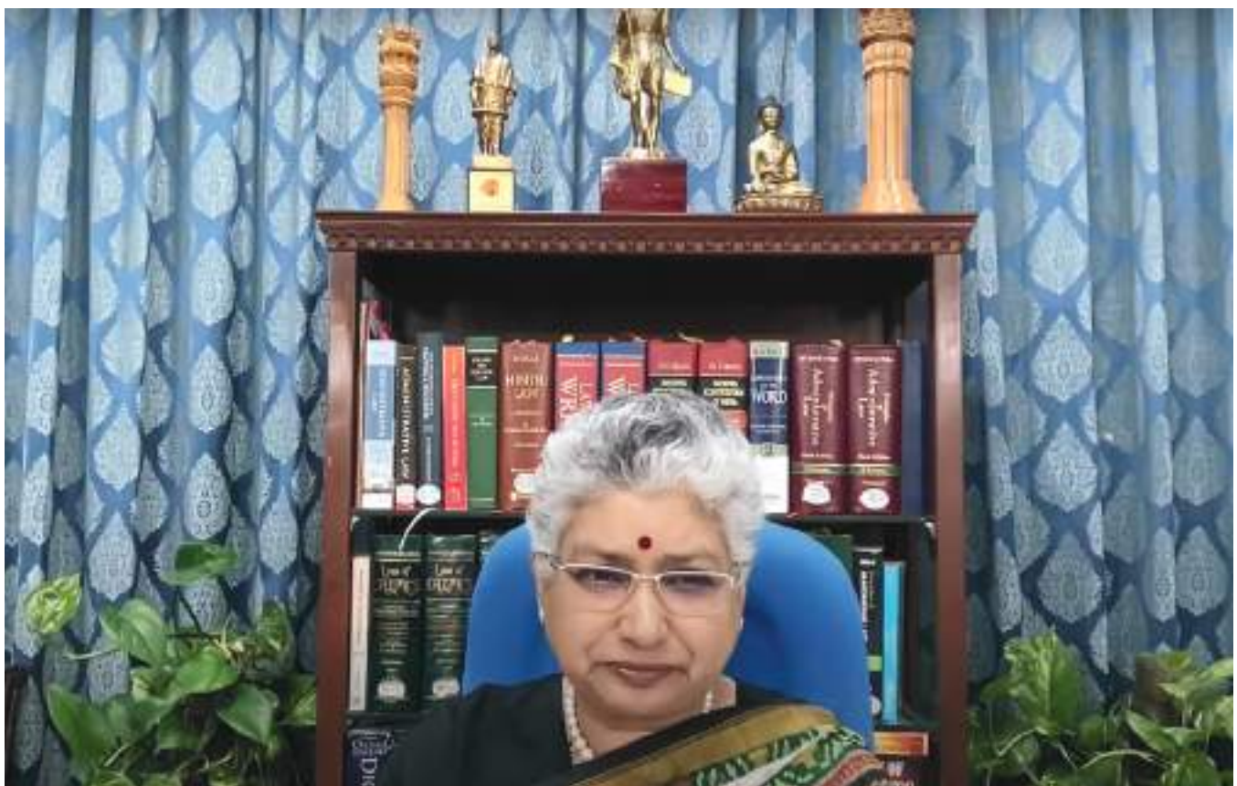
25 March 2024, Justice B V Nagarathna, delivers a virtual lecture address on the theme, 'The Indian Supreme Court and Social Justice: A 75-Year History' in the Symposium organised by Columbia Law School chapter of the American Constitution Society