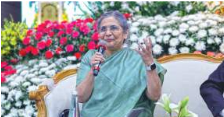
2 March 2024, Justice Bela M Trivedi, delivers an address during Session-I on 'Role of the district judiciary as the first responder of the judicial domain' at the All India District Judges' Conference, Kachchh, Gujarat

'We can perceive our commitments from the oath we take either during our appointments or elevations, that we will discharge our duties, dutifully and faithfully, without fear and favour, affection or ill will.'