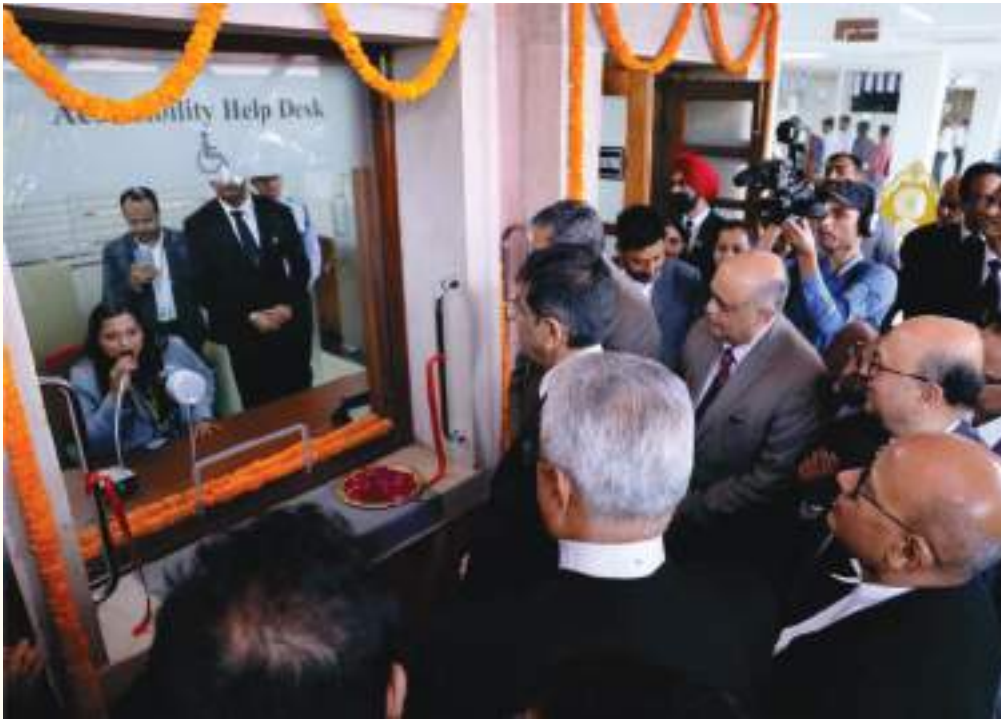
21 March 2024, the Chief Justice of India, Dr D Y Chandrachud, along with Justice Sanjiv Khanna, Justice Sanjay Kumar, Justice Ahsanuddin Amanullah, Justice Manoj Misra, Justice Aravind Kumar, and Justice K S Viswanathan, at the inauguration of the Accessibility Help Desk, near e-Seva Kendra, Supreme Court of India