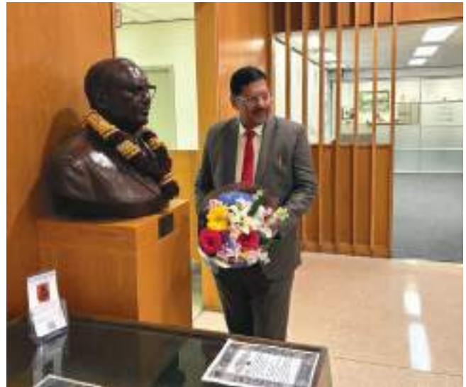
26 March 2024, Justice B R Gavai, visits the Dr Ambedkar statue at Columbia Law School, New York highlighting Dr Ambedkar's academic achievement at the institution where his sculpture now stands as a tribute