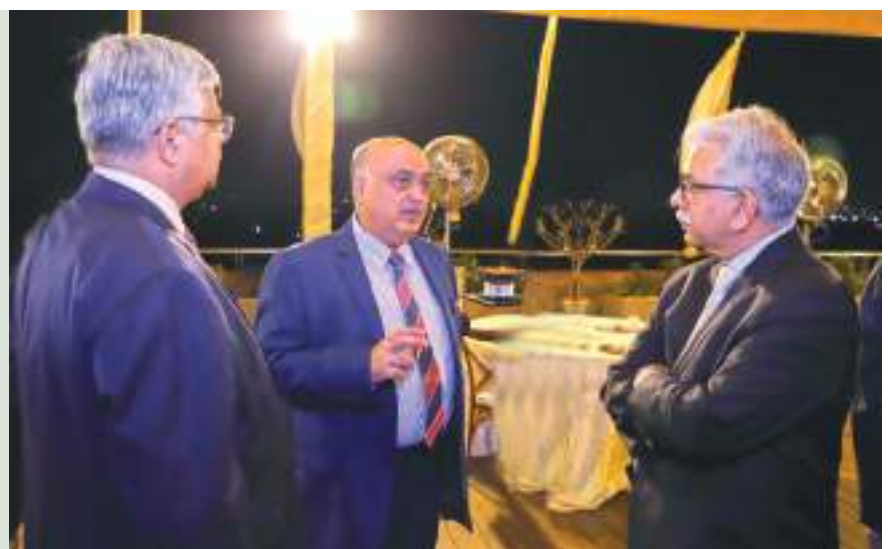
16 March 2024, Justice Ahsanuddin Amanullah, at the International Judicial Conclave on Intellectual Property Rights, hosted by the High Court of Delhi