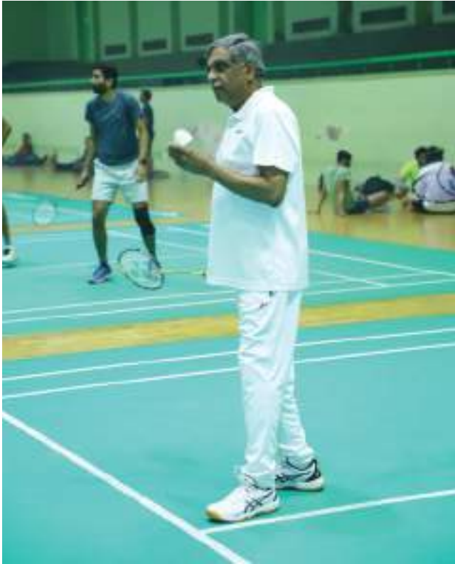
10 March 2024, Justice Vikram Nath playing a friendly Badminton (Doubles) match during the Badminton (Singles and Doubles) competition held at Siri Fort Sports Complex