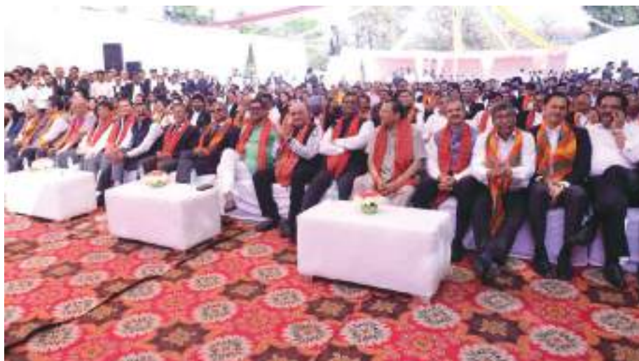
22 March 2024, Judges of the Supreme Court at the Holi Milan program organised by the Supreme Court Bar Association