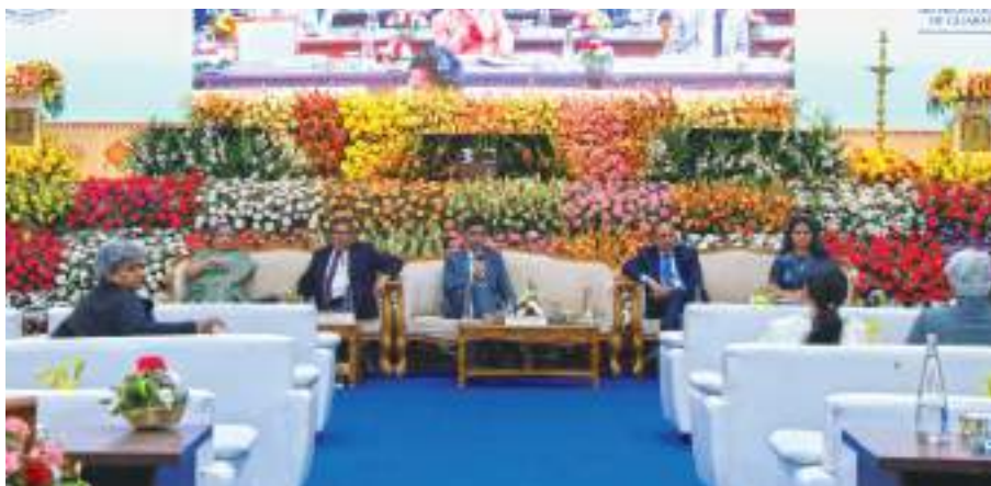
2 March 2024, the Chief Justice of India, Dr D Y Chandrachud alongside Supreme Court Judges and the Chief Justice of High Court of Gujarat, engages with the judicial officers during Session-I of the All India District Judges' Conference, Kachchh, Gujarat

'We can perceive our commitments from the oath we take either during our appointments or elevations, that we will discharge our duties, dutifully and faithfully, without fear and favour, affection or ill will.'