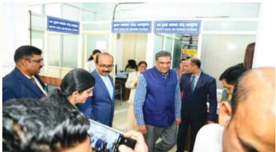
23 March 2024, Justice Sanjiv Khanna engages with the Chief, Deputy, and Assistant Legal Aid Defence Counsels alongside other panel lawyers and paralegal volunteers during his visit to the City Civil Court in Bengaluru