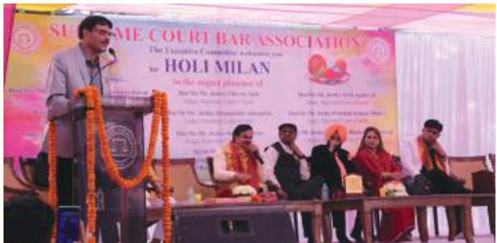
22 March 2024, the Supreme Court Bar Association hosts a Holi Milan Program on the Supreme Court Lawn

On 22 March, 2024 at 3:10 PM, the Supreme Court Bar Association hosted a vibrant Holi Milan Program in the lush environs of the Supreme Court Lawn. Among the esteemed guests were distinguished Judges of the Supreme Court of India including Justice B R Gavai, Justice Vikram Nath, Justice M M Sundresh, Justice Sanjay Karol, Justice Ahsanuddin Amanullah, Justice Prashant Kumar Mishra, Justice K V Viswanathan, Justice Sandeep Mehta, and Justice Prasanna Bhalachandra Varale.