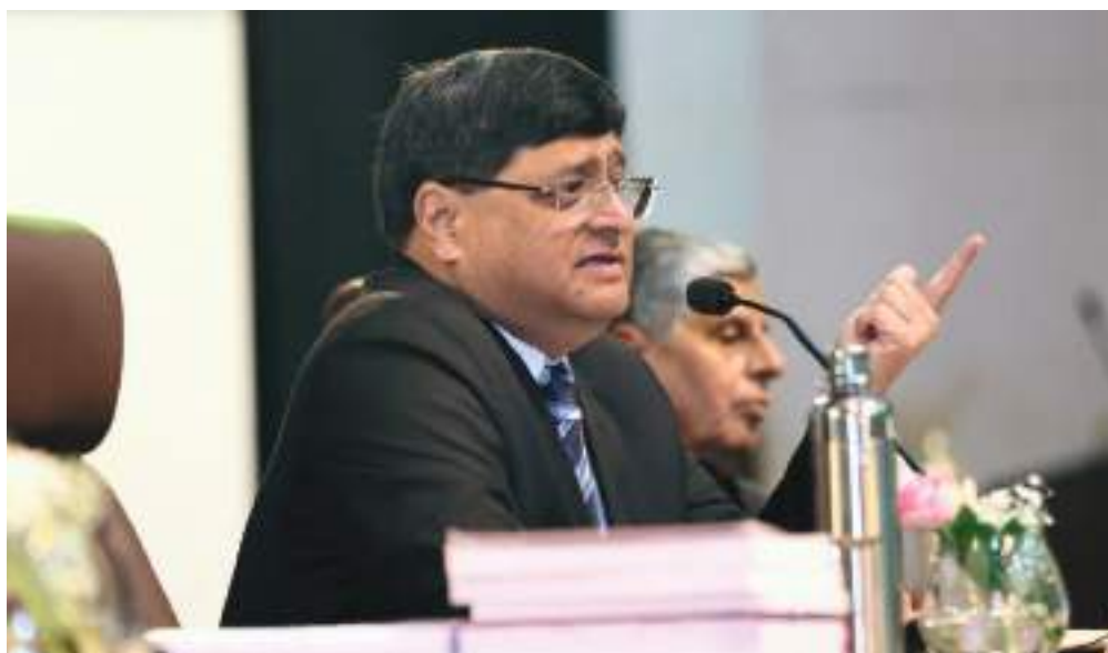
16 March 2024, Justice Sudhanshu Dhulia presides over Session-II on ‘Elements of Judicial Behaviour’ at the North Zone-II Regional Conference on ‘Contemporary Judicial Developments and Strengthening Justice through Law and Technology, NJA, Bhopal

over Session-II on ‘Elements of Judicial Behaviour’ and Justice Dipankar Datta was the resource person in Session-III on the theme ‘Judgment Writing Tool.’ On 17 March 2024, Justice Bindal presided over Session-IV on the theme ‘Overview of E-courts Projects’ as the resource person.