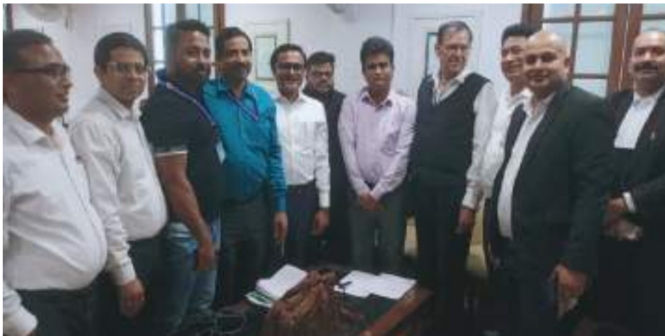
20-21 March 2024, the Supreme Court Bar Association organises a special camp drive for registration/ modification of Voter Identity Cards for its members with the assistance of the office of the Electoral Registration Officer, Assembly Constituency-40, Jam Nagar House, New Delhi

On 22 March, 2024 at 3:10 PM, the Supreme Court Bar Association hosted a vibrant Holi Milan Program in the lush environs of the Supreme Court Lawn. Among the esteemed guests were distinguished Judges of the Supreme Court of India including Justice B R Gavai, Justice Vikram Nath, Justice M M Sundresh, Justice Sanjay Karol, Justice Ahsanuddin Amanullah, Justice Prashant Kumar Mishra, Justice K V Viswanathan, Justice Sandeep Mehta, and Justice Prasanna Bhalachandra Varale.