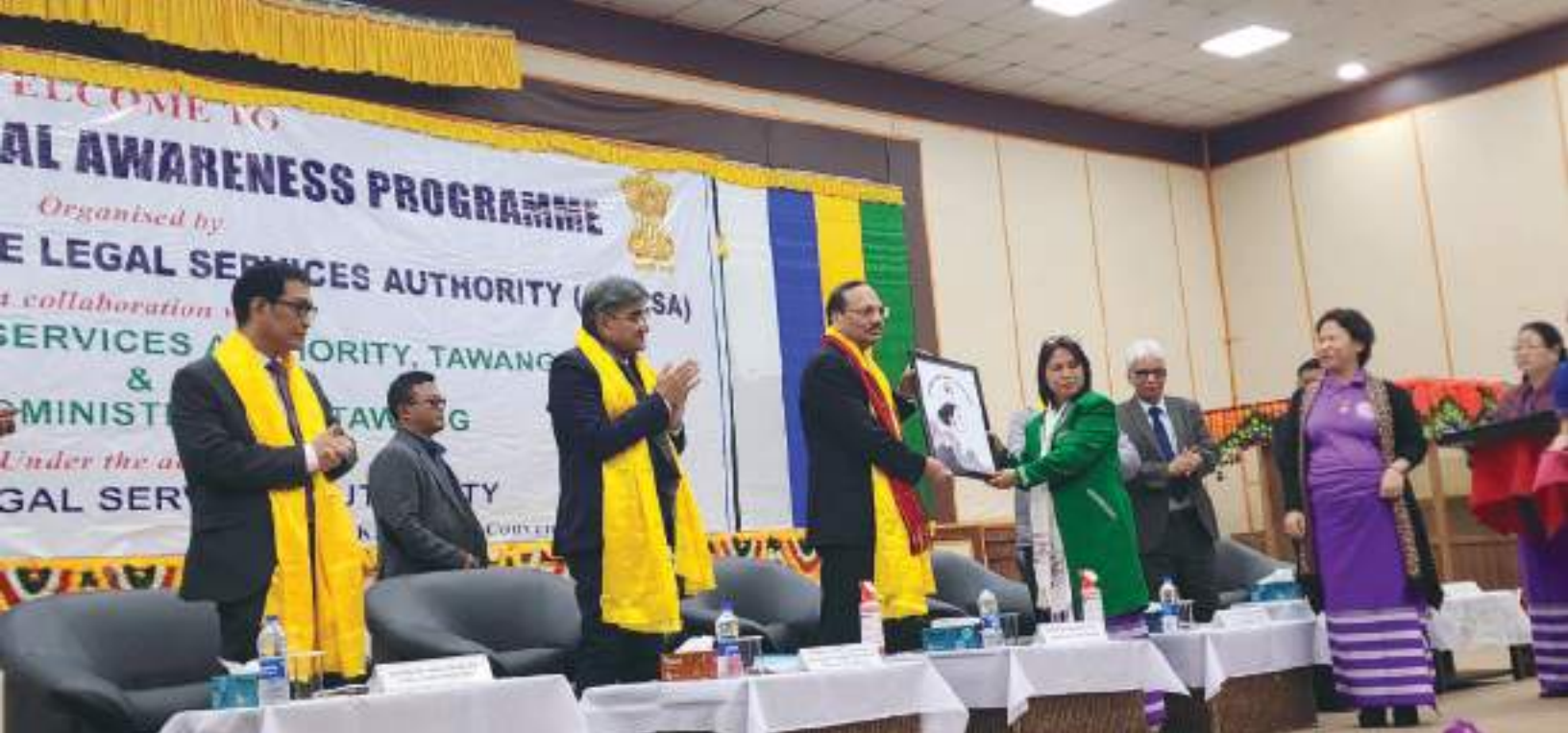
24 March 2024, Justice Surya Kant, Chief Guest, attends the Mega Legal Aid Camp organised by Arunachal Pradesh Legal Services Authority at Tawang, Arunachal Pradesh