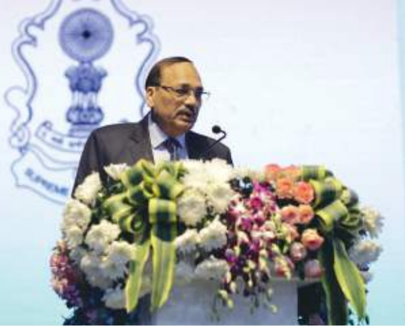
2 March 2024, Justice Surya Kant, addresses judicial officers during the All India District Court Judges' Conference, Kachchh, Gujarat

"In our judiciary set-up, the district judiciary acts as a primary interface between litigants and justice delivery and it is here that the majority of the cases are reshaping and adjudicating.. Judges must constantly and compulsorily continue to improve their judicial and administrative skills to discharge functions efficiently."