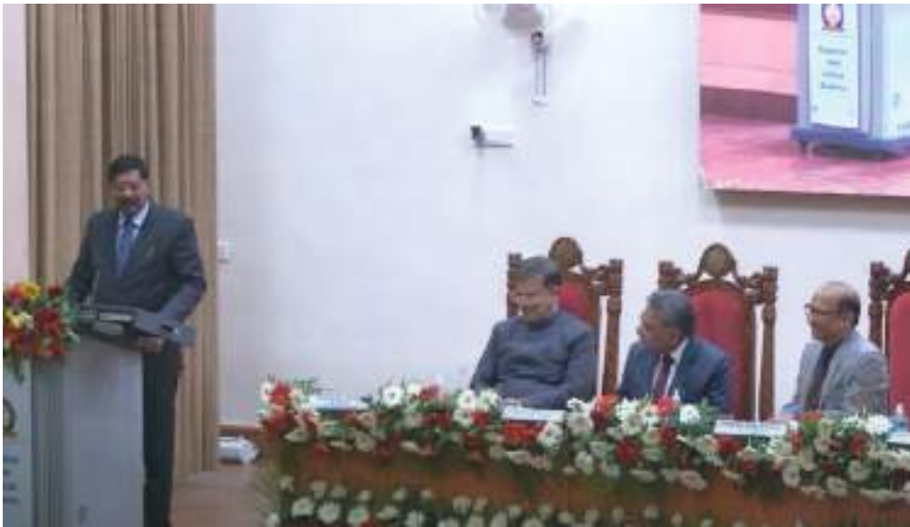
16 March 2024, Justice B R Gavai attends a One-Day Law Seminar on "Constitutional Governance in India – Dr B R Ambedkar Idea of Socio-Economic Justice and Social Engineering through Judicial Activism" at State Judicial Academy, Jodhpur, Rajasthan