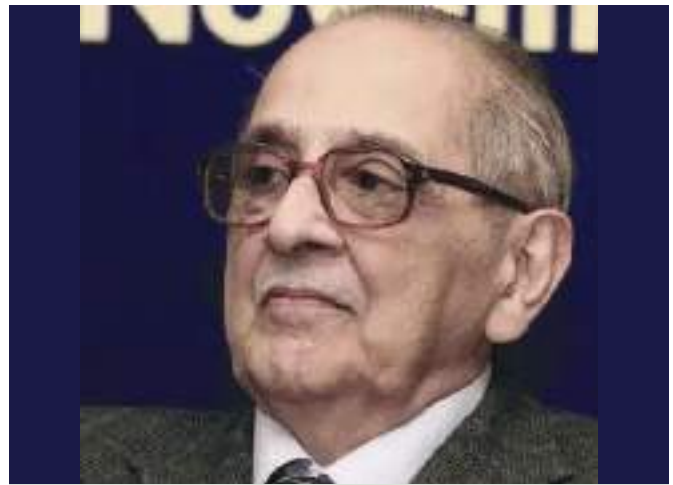
16 March 2024, Justice Hrishikesh Roy, Justice Hima Kohli, and Justice Ahsanuddin Amanullah attend the launch ceremony of the Fali Nariman Scholarship and Annual Lecture Series at the Ballroom, Oberoi Hotel, New Delhi