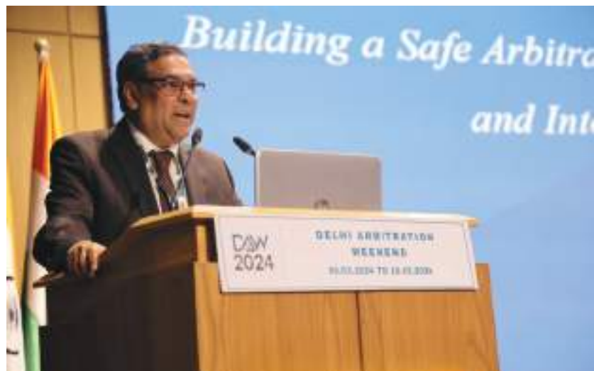
10 March 2024, Justice Sanjiv Khanna, addresses the audience on 'Building a Safe Arbitral Seat: Harmonising National Interest and International Expectations' at the closing session of DAW, 2024