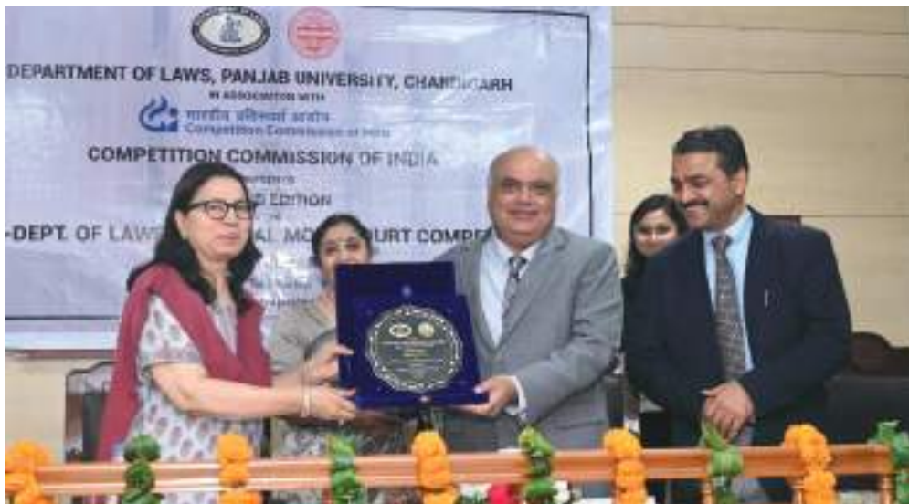
29 March 2024, Justice Ahsanuddin Amanullah, Chief Guest, attends the inaugural ceremony of the second edition of the CCI-Department of Law's National Moot Court Competition at Department of Law, Panjab University, Chandigarh