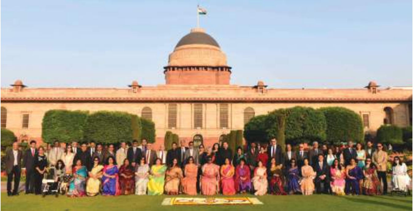
4 March 2024, the Chief Justice of India, Dr D Y Chandrachud, along with other Supreme Court judges, and their families, visit the Amrit Udyan at the Rashtrapati Bhavan