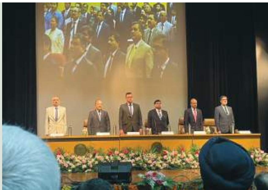
Left to right: Justice Dipankar Datta, Justice Sudhanshu Dhulia, and Justice Rajesh Bindal at the NJA North Zone-II Regional Conference, Bhopal