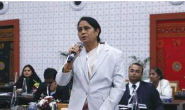
2 March 2024, a judicial officer presents her insights and suggestions in Session-II, focusing on 'Infrastructure and Resources - improving the work culture' at the All India District Judges' Conference, Kachchh, Gujarat