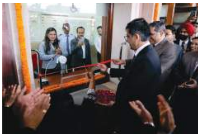
21 March 2024, the Chief Justice of India, Dr D Y Chandrachud, along with Justice Sanjiv Khanna, inaugurates the newly created Accessibility Help Desk, near e-Sewa Kendra, Supreme Court of India