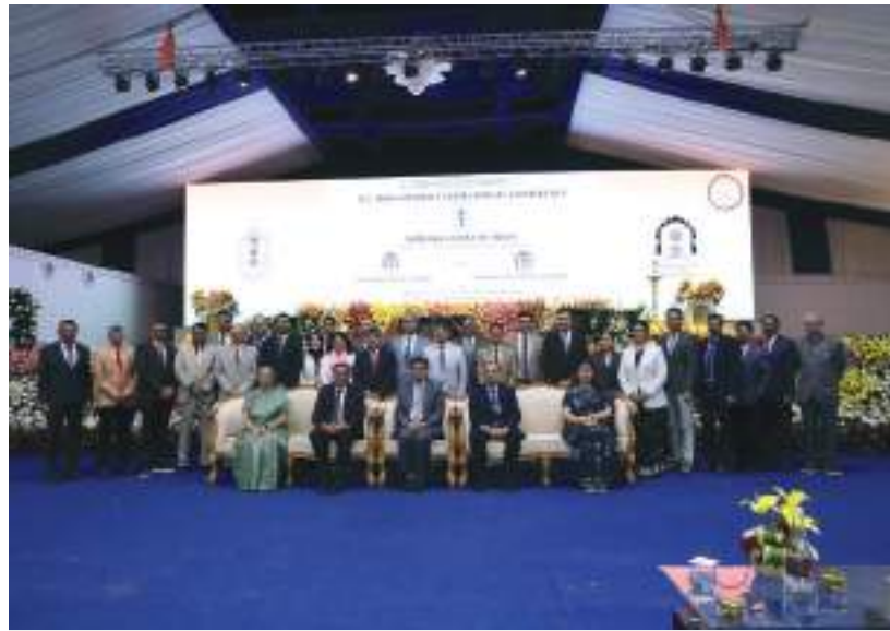
Group photo featuring the Chief Justice of India, Dr D Y Chandrachud, the Judges of the Supreme Court, the Chief Justice of High Court of Gujarat, Registry officers, Supreme Court of India and others at the All India District Judges' Conference, Kachchh, Gujarat