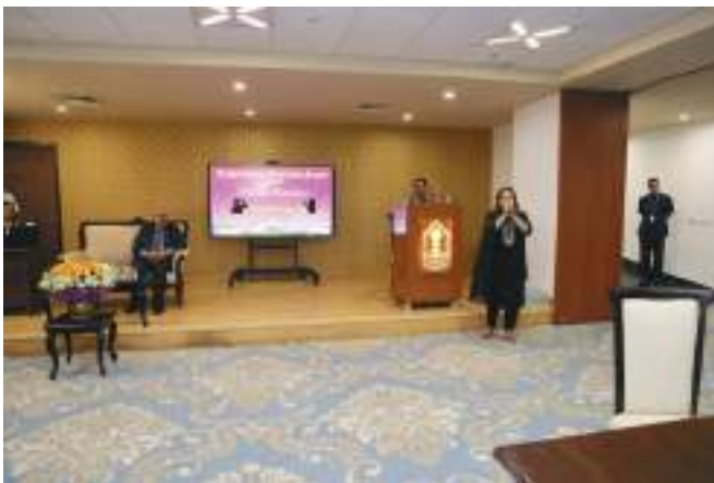
23 March 2024, Justice Hrishikesh Roy, attends the Antakshari (Male and Female) competition at the Congregation Hall, Supreme Court