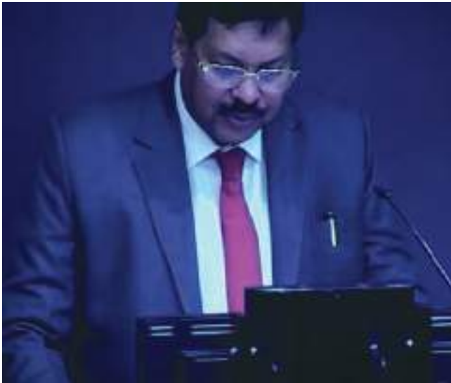
26 March 2024, Justice B R Gavai, delivers a lecture on '75 Years of Transformative Constitutionalism,' at the Columbia Law School, New York