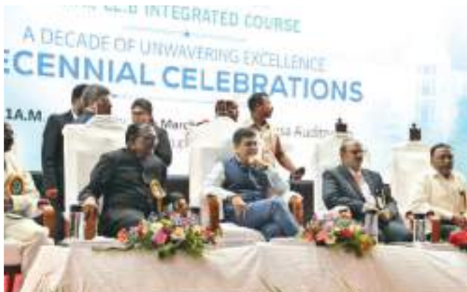
26 March 2024, Chief Justice of India, Dr D Y Chandrachud attended the decennial celebrations of the introduction of BA LLB course at Sri Venkateswara University's Department of Law, Tirupati. While addressing the students he reflected on his days at Delhi University and urged them to engage in discussions around global problems. He emphasised on the necessity of free and critical thinking in becoming efficient lawyers.