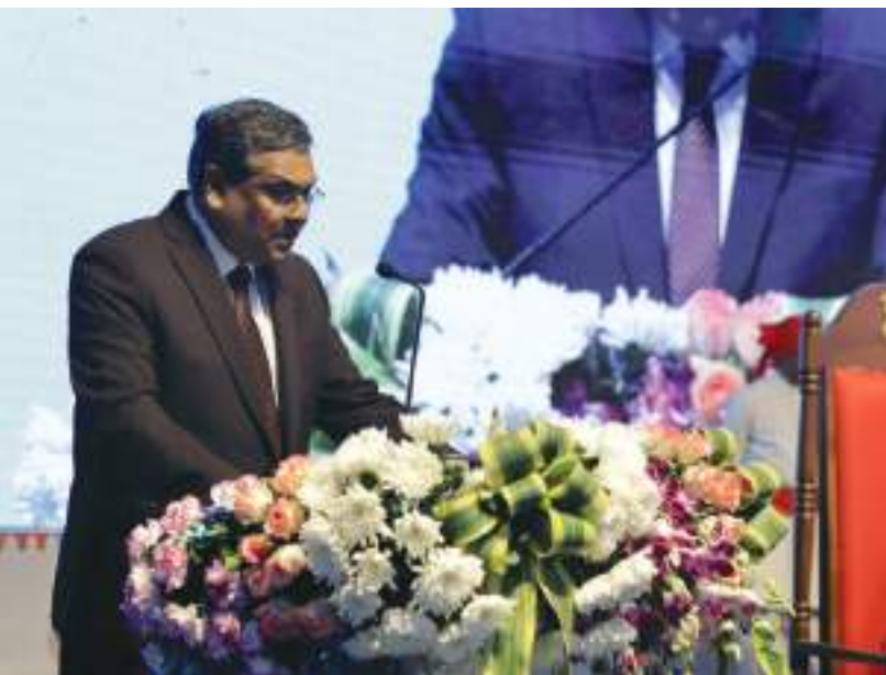
2 March 2024, Justice Sanjiv Khanna, addresses judicial officers during the inaugural session of the All India District Court Judges' Conference, Kachchh, Gujarat

Three sessions were organised to tackle critical aspects of the judicial system: (1) the role of the district judiciary as first responder of the judicial domain, (2) infrastructure and resources, and (3) the use of technology in the judicial processes.