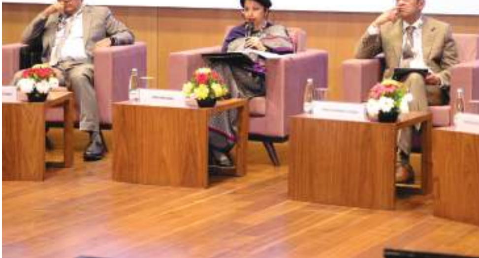
16-17 March 2024, Justice Hima Kohli participates as a panellist in the session on 'Protecting and Enforcing IP in New Digital Ecosystems' at the International Judicial Conclave on Intellectual Property Rights hosted by the High Court of Delhi

...that the model can be used to generate or output text that plausibly could have been drawn from the original dataset Large Language Models with billions/trillions of parameters have opened a new era in which generative AI models can write engaging text, paint photorealistic images and create videos.