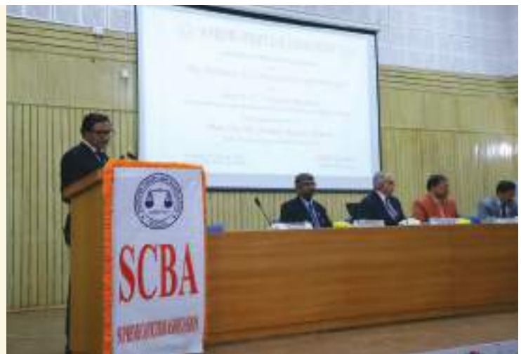
11 March 2024, the Supreme Court Bar Association hosts a lecture on 'The Mediation Act, 2023 and the Legal Profession' at V K Krishna Menon Bhawan, Indian Society of International Law