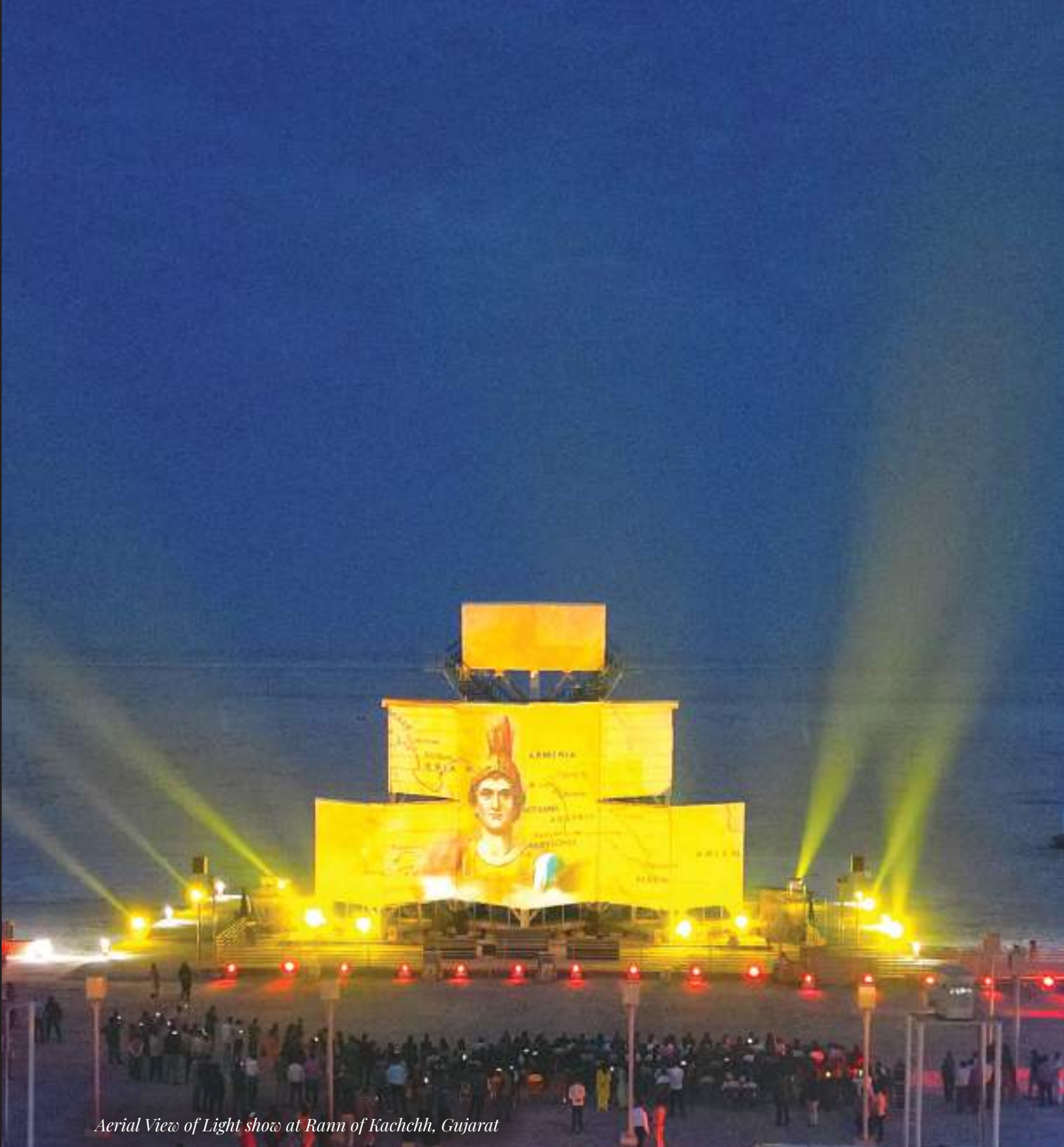
Aerial View of Light show at Rann of Kachchh, Gujarat

Supreme Court of India Tilak Marg, New Delhi-110001