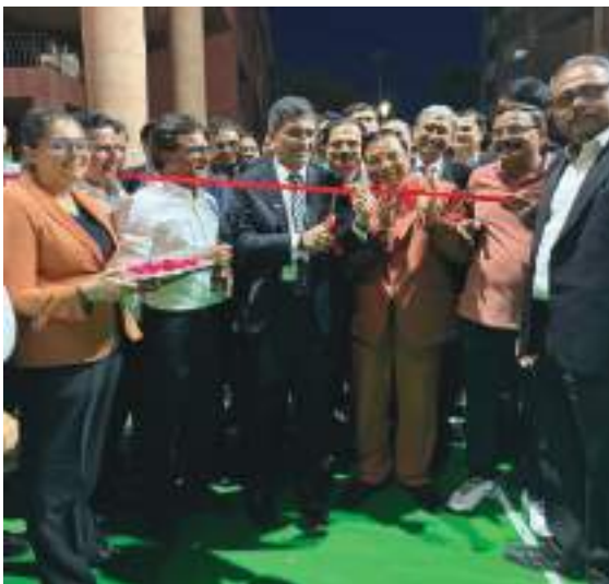
20 March 2024, the Chief Justice of India, Dr D Y Chandrachud, along with the Supreme Court Bar Association inaugurates the Badminton Court for the lawyers, in D-Block, Additional Building Complex, Supreme Court of India