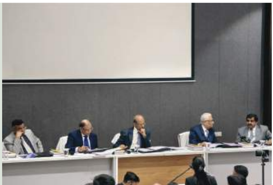
31 March 2024, Justice Rajesh Bindal, delivers a valedictory address and adjudicates the final round of the 2nd NFSU National Technological Moot Court Competition 2024, organised by the National Forensic Sciences University, Gandhinagar