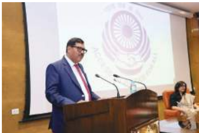
19 March 2024, Justice B R Gavai, chairs a workshop for Panel Lawyers of the Supreme Court Legal Services Committee (SCLSC) organised by SCLSC at the Additional Building Complex, Supreme Court of India

Justice B R Gavai, Chairman, Supreme Court Legal Services Committee (SCLSC), chaired a training workshop held for the Advocates-on-Record (AOR) Panel of the SCLSC on 19 March 2024. The workshop aimed to enhance AORs' grasp of utilising digital tools in their practice, thereby improving the efficacy and accessibility of legal services. Justice Gavai emphasised the importance of establishing a video conferencing platform to facilitate communication between legal aid counsels and incarcerated individuals. Furthermore, the workshop addressed concerns regarding the quality of legal aid and outlined the strategies for promptly identifying and resolving legal aid challenges.