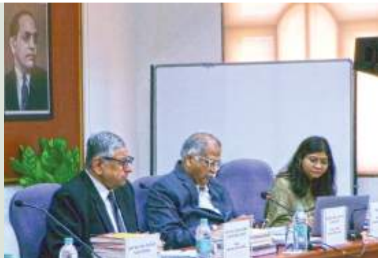
2 March 2024, Justice Aniruddha Bose chairs Session-II on 'Confluence of Anti-Conversion Legislations and Matrimonial Laws' in the Conference on Matrimonial Laws, held at National Judicial Academy, Bhopal