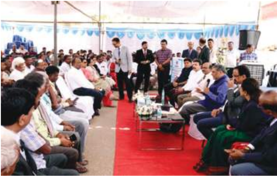
25 March 2024, Justice Sanjiv Khanna, Executive Chairman, NALSA, inaugurates Legal Services Clinic at the Panchayat Bhawan in Jalige Village, Kundana Hobli, Devanahalli Taluk, Bengaluru Rural District. Justice Khanna informs the villagers about the diverse legal services available through Legal Services Institution including the NALSA Helpline and the National Lok Adalats and exhorting them to resort to ADR mechanism to solve disputes