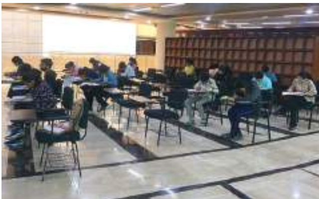
16 March 2024, an Essay Writing competition held at the Supreme Court Judges' Library for the children of Supreme Court employees