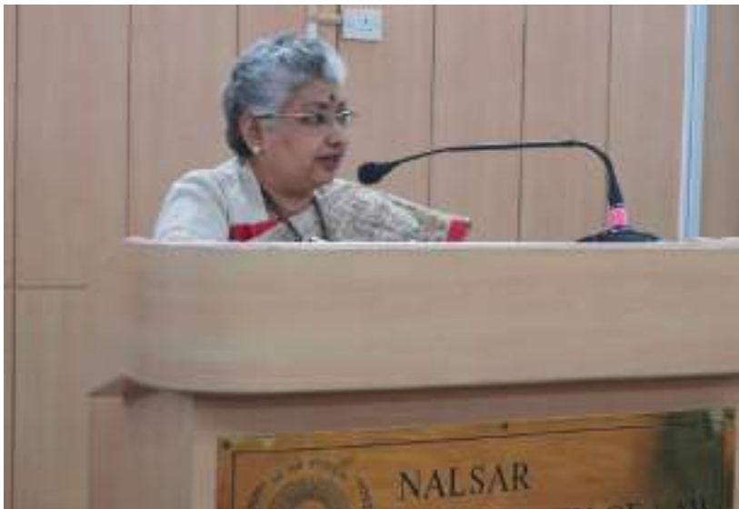
30 March 2024, Justice B V Nagarathna, delivers an inaugural address on 'Supreme Court in 2023' at the 'Courts and the Constitution-2023 in Review Conference' organised by the NALSAR University of Law, Bengaluru