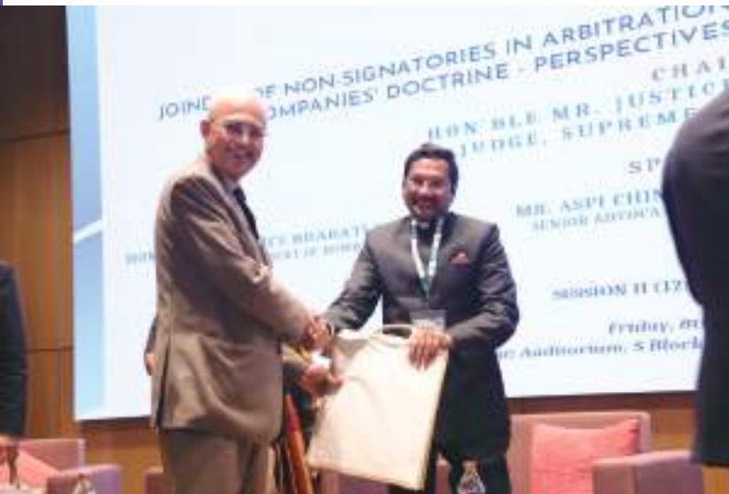
8 March 2024, Justice M M Sundresh, chairs Session-II on 'Joiner of Non-signatories in Arbitration Proceedings: Analysing the 'Group of Companies' Doctrine – Perspectives from India, UK and Singapore' at DAW, 2024