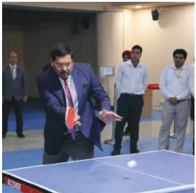
19 March 2024, Justice B R Gavai playing a friendly Table Tennis match during the Doubles Table Tennis (Male) competition, at the Additional Building Complex of the Supreme Court