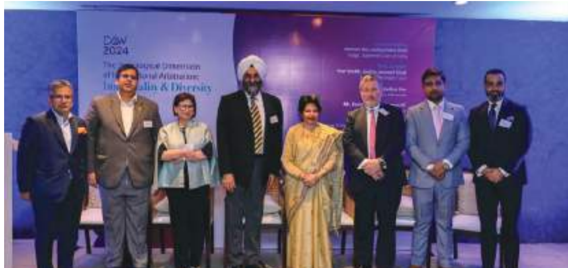
5 March 2024, Justice Hima Kohli, delivers a keynote address in the Pre DAW Session - II on 'Sociological Dimension of International Arbitration: Impartiality and Diversity'

On 6 March 2024, the Chief Justice of India, Dr D Y Chandrachud gave the plenary address in the inaugural session of the DAW conducted at the Auditorium Hall of the Additional Building Complex of the Supreme Court. During the inaugural ceremony, the Chief Justice also released the Delhi Arbitration Review, the official