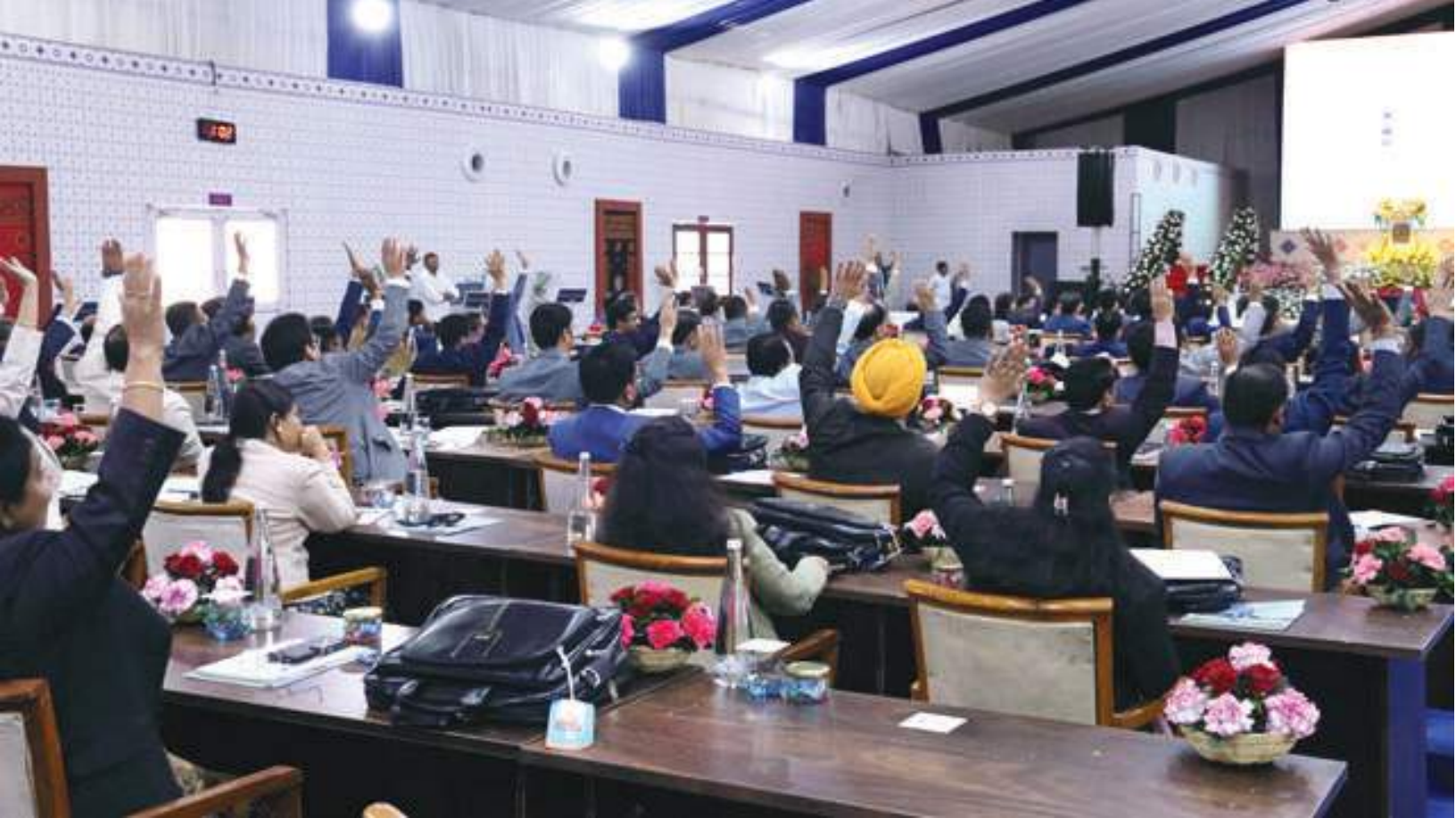
2 March 2024, Judicial officers interact with Supreme Court Judges at the All India District Judges' Conference, Kachchh, Gujarat