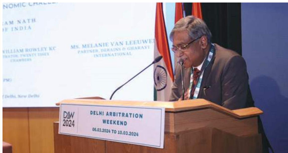
8 March 2024, Justice Vikram Nath, chairs Session-IV on 'Where do we stand?: Revisiting the Investor-State Dispute Settlement (ISDS) mechanisms in light of today's economic challenges' at DAW, 2024