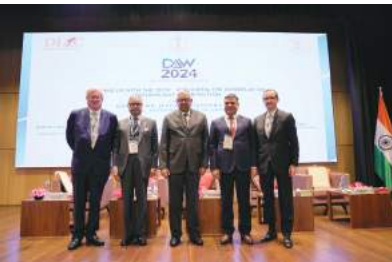
10 March 2024, Justice Aniruddha Bose, chairs Session-V on 'Keeping Up with the Tech – Exploring the Interplay of Technology and Arbitration' at DAW, 2024