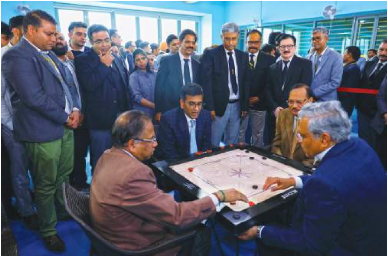
20 March 2024, the Chief Justice of India, Dr D Y Chandrachud alongside Judges of the Supreme Court engage in a friendly Carrom match during the Carrom (Male and Female) competition at the Additional Building Complex of the Supreme Court