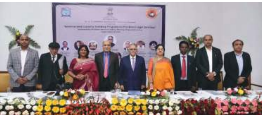
26 March 2024, Justice Sanjay Karol, Chief Guest, attends a Seminar and Capacity Building Program on Pro Bono Legal Services organised by the Pro Bono Club of Dr B R Ambedkar National Law University, Sonapat