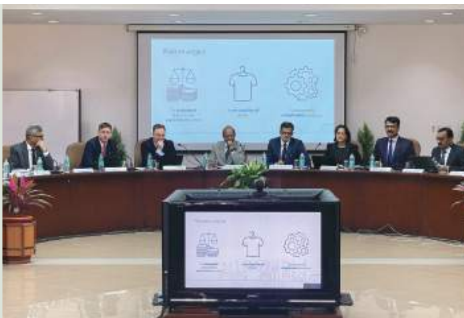
10 March 2024, Justice Rajesh Bindal presides over Session-II on the theme "Security Concerns: Institutional and Individual" as a resource person in the International Conference of the National Judicial Academy (NJA) on "The implications and ramifications of Information and Communication Technology (ICT) on Re-engineering Judicial Process through Information and Communication Technology (ICT)" organised in collaboration with the Ministry of Justice (MoJ), United Kingdom, at Bhopal