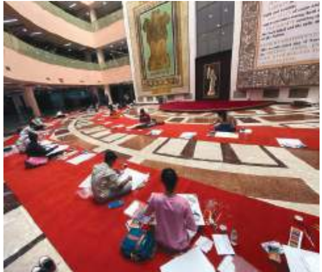
16 March 2024, Painting/Drawing Competition held at the Supreme Court Judges' Library for the children of Supreme Court employees