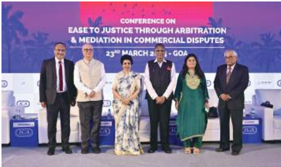
23 March 2024, the Indian Council of Arbitration (ICA) hosts a conference on “Ease to Justice Through Arbitration and Mediation in Commercial Disputes,” Goa. Justice Hima Kohli delivers a keynote address, emphasising the imperative of facilitating accessible justice in commercial disputes through arbitration and mediation