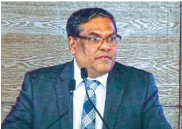
7 March 2024, Justice Sanjiv Khanna, Chief Guest, inaugurates the Master Class on Intellectual Property Adjudication - Judicial Perspectives organised by the High Court of Delhi and World Intellectual Property Organisation (WIPO) in New Delhi