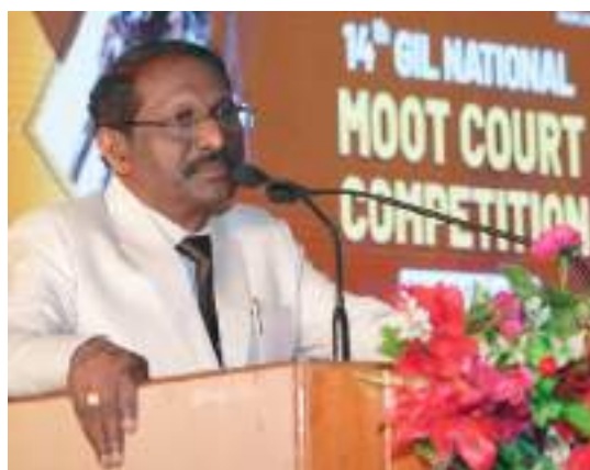
10 March 2024, Justice C T Ravikumar, Chief Guest, delivers a valedictory address at the 14th GIL National Moot Court Competition, 2024 organised by the Geeta Institute of Law, Panipat