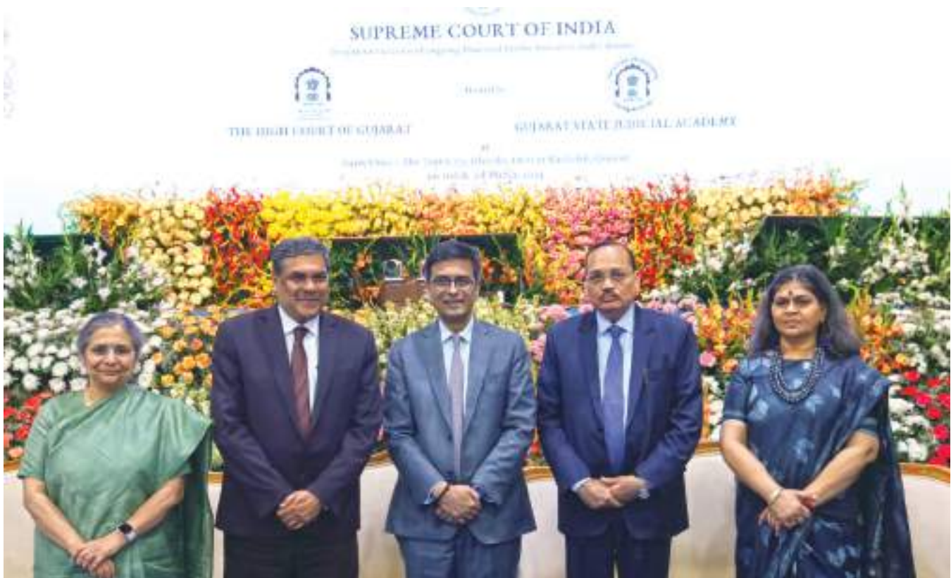
Left to Right: Justice Bela M Trivedi, Justice Sanjiv Khanna, the Chief Justice of India, Dr D Y Chandrachud, Justice Surya Kant and the Chief Justice of High Court of Gujarat, Justice Sunita Agarwal at the All India District Judges' Conference, Kachchh, Gujarat on 2 March 2024

The Chief Justice of India highlighted the vital role of the district judiciary as the backbone and central nervous system of the Indian judicial system. He emphasised the importance of addressing challenges faced by the district judiciary and encouraged direct conversations with judicial officers for solutions. He addressed the various concerns such as the adjournment