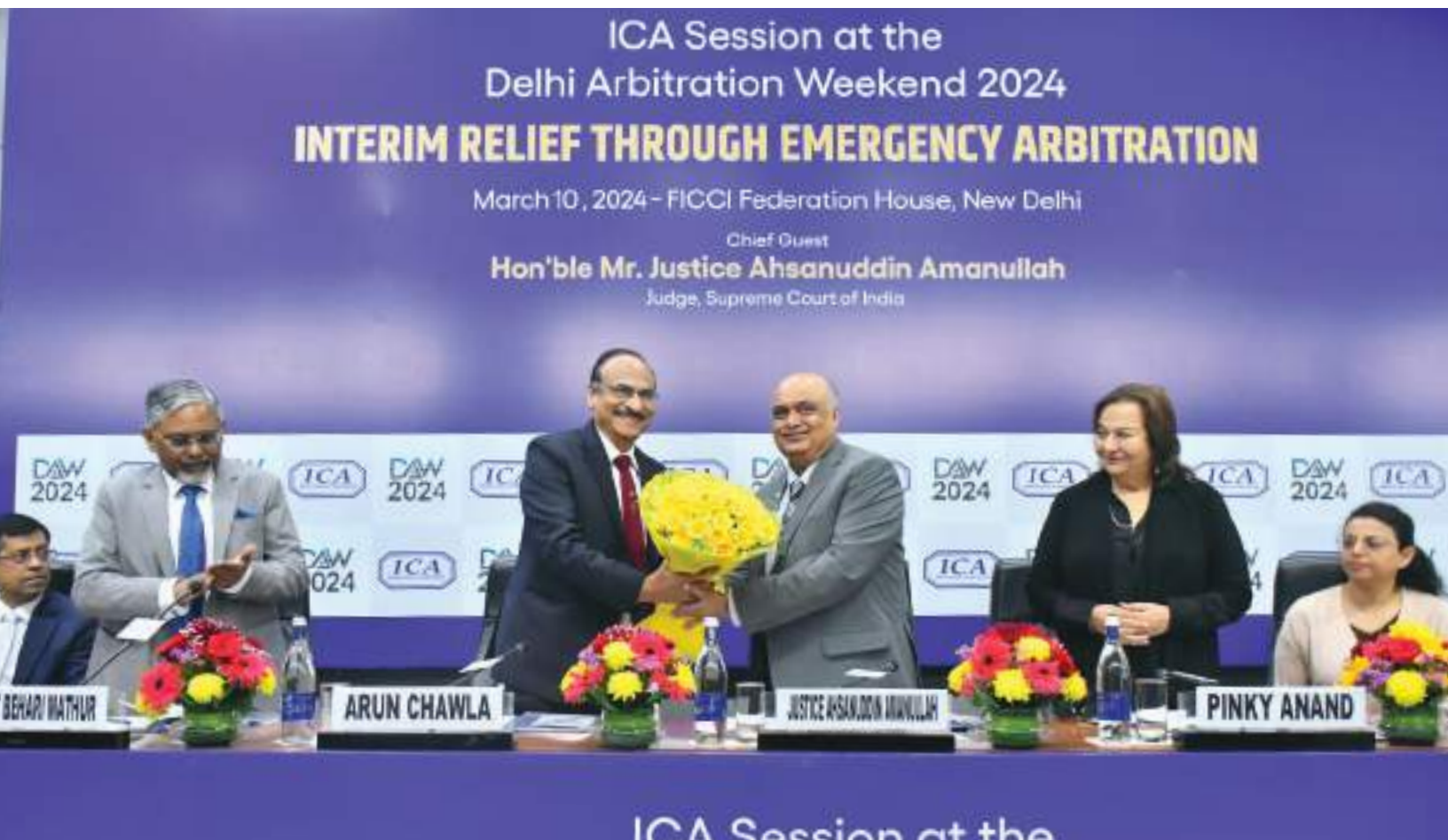
10 March 2024, Justice Ahsanuddin Amanullah presides as Chief Guest during the inauguration of Indian Council of Arbitration's (ICA) session on 'Interim Relief through Emergency Arbitration' at DAW-2024, FICCI Federation House.