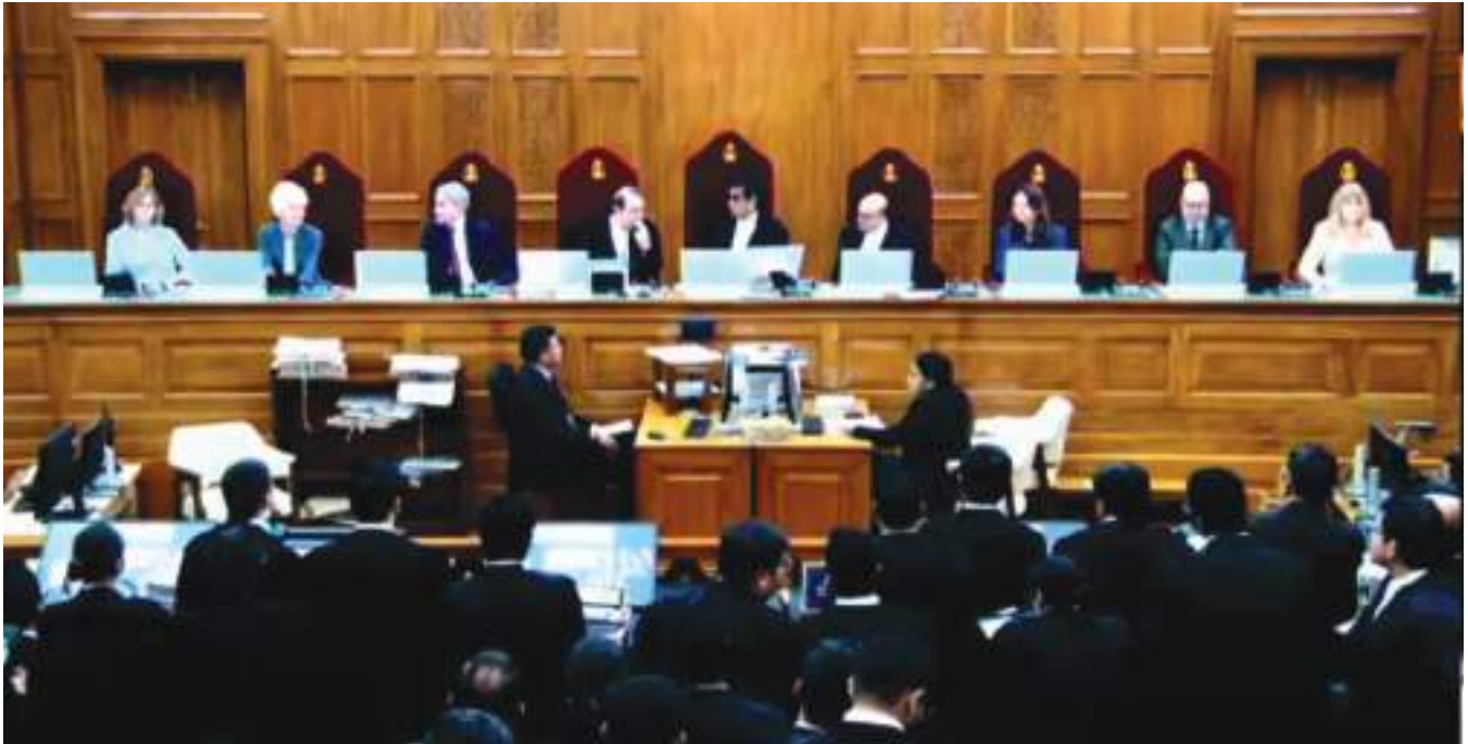
7 March 2024, the delegates for Bilateral Judicial Dialogue - Indo-German Conference, share the dias with the Supreme Court Judges as observers, during the Court proceedings