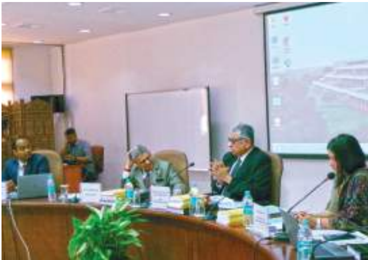
2 March 2024, Justice Aniruddha Bose chairs Session-I on 'Writ Jurisdiction- Nature, Scope and Limits' at the National Workshop For High Court Justices on Constitutional Remedies and Administrative Law, held at National Judicial Academy, Bhopal