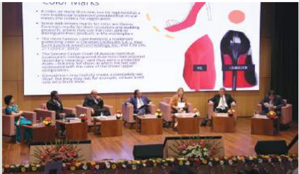
16-17 March 2024, Justice K V Viswanathan participates as a panellist in the session on 'New Frontiers of Trademark Law' at the International Judicial Conclave on Intellectual Property Rights hosted by the High Court of Delhi