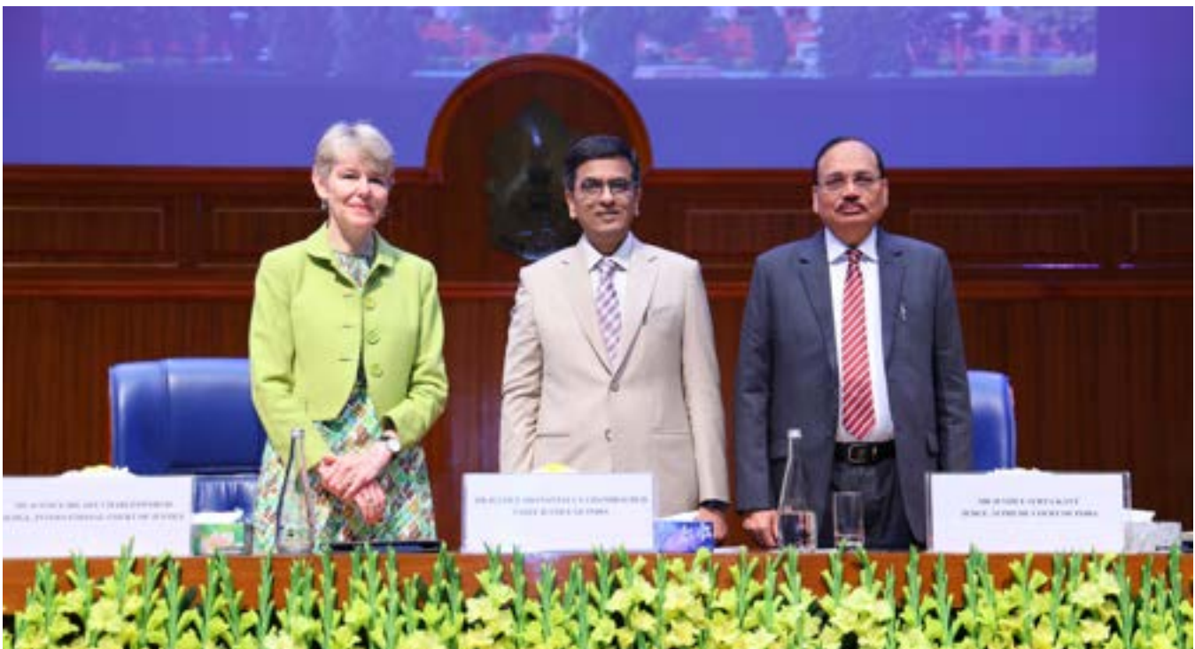
Left to right: Judge, International Court of Justice, Ms Hilary Charlesworth, the Chief Justice of India, Dr D Y Chandrachud and Justice Surya Kant during second annual lecture series on 10 February 2024

Ms Hilary Charlesworth, a Judge of the International Court of Justice delivered the second edition of the Supreme Court's Annual Lecture Series. During her talk, she examined the history of the International Court of Justice, which replaced the former Permanent Court of International Justice. She also referred to how the Permanent Court of Arbitration was established after successful Hague Peace conferences in 1899 and 1907, which were initiated by Czar Nicholas II of Russia and is still operational today.