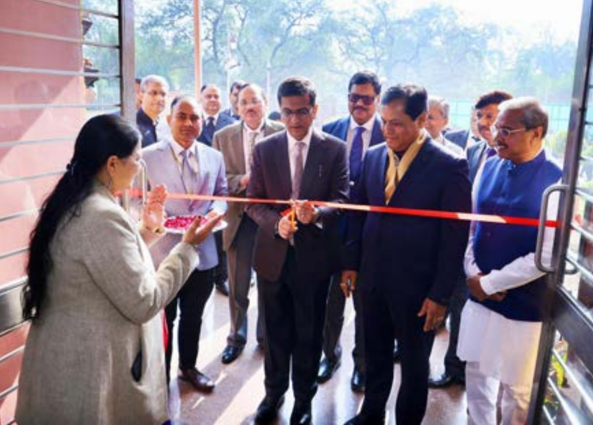
The Chief Justice of India, Dr D Y Chandrachud inaugurated 'AYUSH Holistic Wellness Centre' in the premises of the Supreme Court of India on 22 February 2024