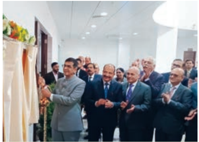
Left to right: The Chief Justice of India, Dr D Y Chandrachud, Justice Pankaj Mithal, and Justice Rajesh Bindal at the inauguration of the 'Arbitration Centre' in the Allahabad High Court on 17 February 2024