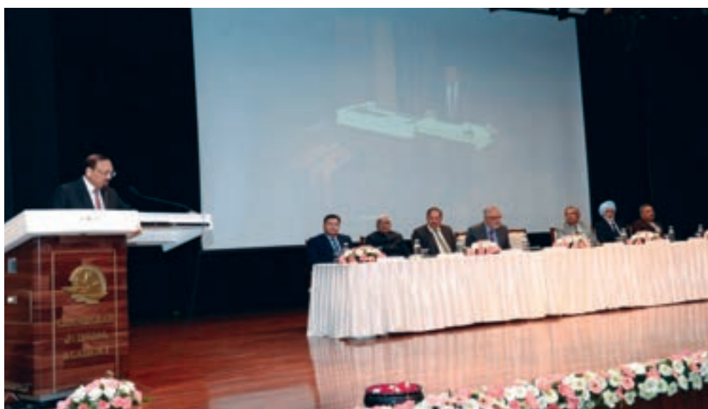
Justice Surya Kant delivered a valedictory address as Chief Guest at the 'Completion of One Year Induction Training Programme' of Judicial Officers from the State of Haryana, at the Chandigarh Judicial Academy on 17 February 2024