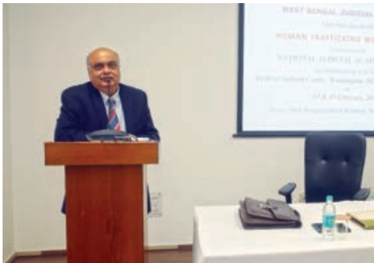
Justice Ahsanuddin Amanullah chaired a 'Human Trafficking Workshop-2' conducted by Federal Judicial Centre (FJC), Washington and CEELI Institute, Prague in collaboration with the National Judicial Academy at West Bengal Judicial Academy, Kolkata, 3 and 4 February 2024