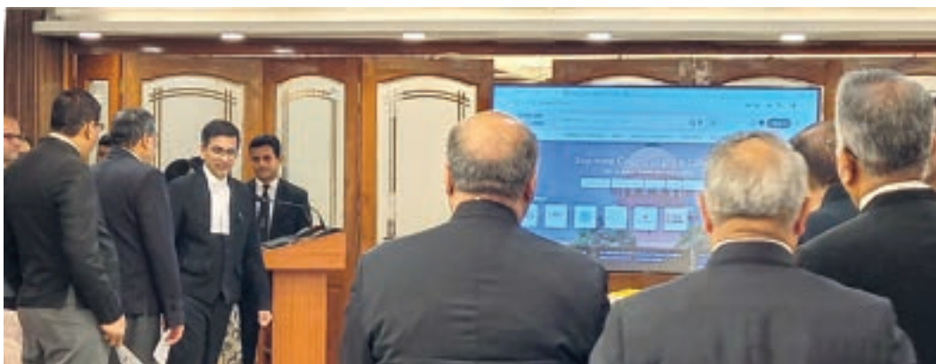
The Chief Justice of India releasing the Supreme Court Judges e-library Website and Mobile App at the Judges' Assembly Hall on 29 February 2024

The Chief Justice of India, Dr D Y Chandrachud released the Supreme Court Judges e-library website and mobile app on 29 February 2024 in the Judges Assembly Hall. This occasion marked a significant leap forward in the judiciary's embrace of digital technology, emphasising its endeavours to utilise technology to increase efficiency and enhance the administration of justice. The Supreme Court Judges e-library website and mobile app is hosted on the remote access platform of Refread Solutions. This comprehensive platform offers a unified gateway to subscribed legal databases, in-house databases and open-access legal sources,