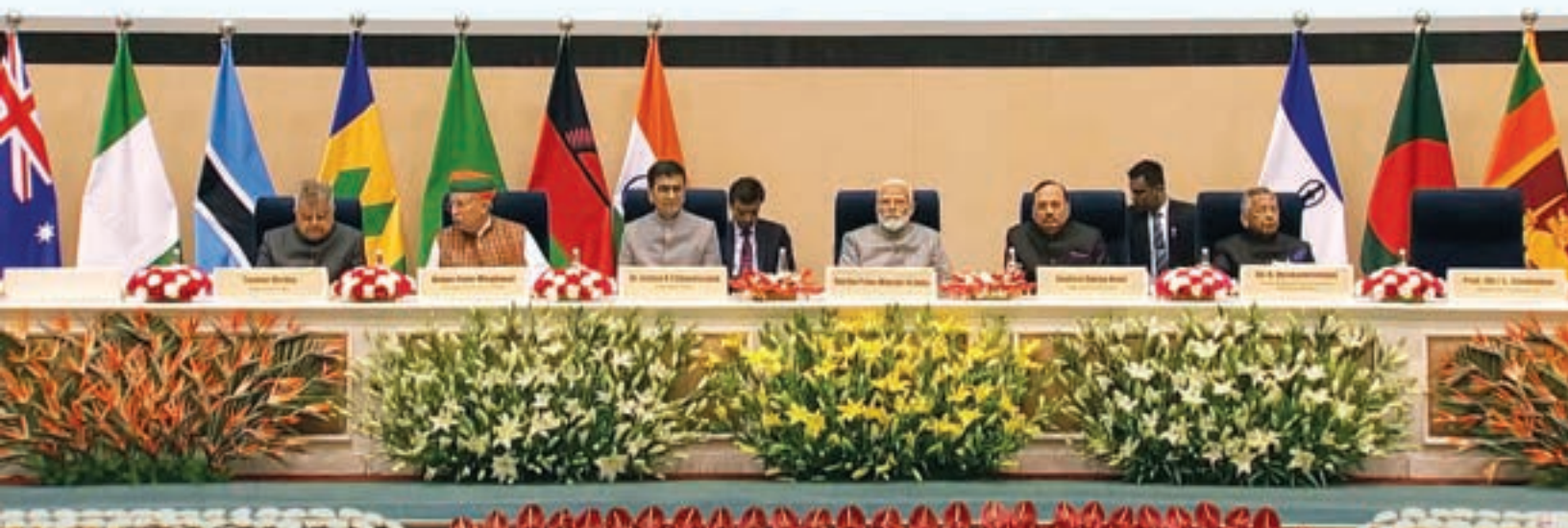
Left to right: Solicitor General, Mr Tushar Mehta, Minister of Law and Justice (I/C), Mr Arjun Meghwal, the Chief Justice of India, Dr D Y Chandrachud, the Prime Minister, Shri Narendra Modi, Justice Surya Kant, and Attorney General, Mr R Venkataramani, at the inauguration of the CLEA–CASGC on 3 February 2024