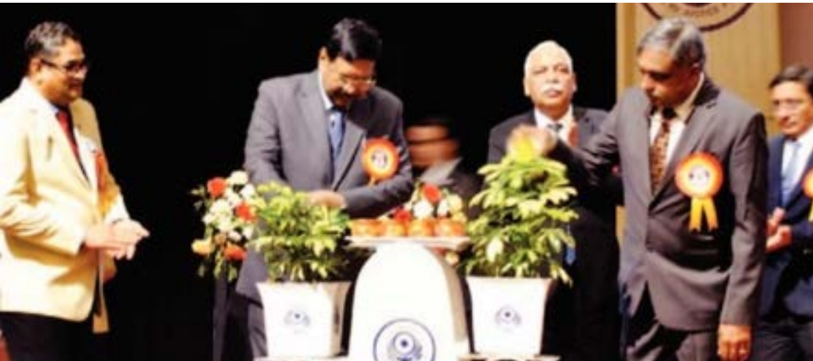
Justice B R Gavai attended the inauguration of the Regional Conference on Mediation, Nagpur on 11 February 2024