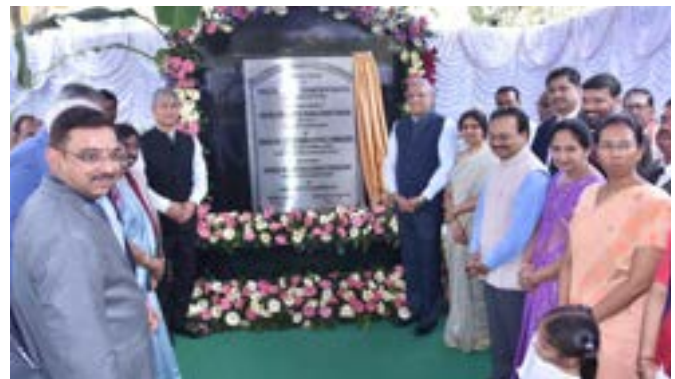
Justice P S Narasimha laid the foundation stone for construction of District Court Building Complex, Vizianagaram on 25 February 2024