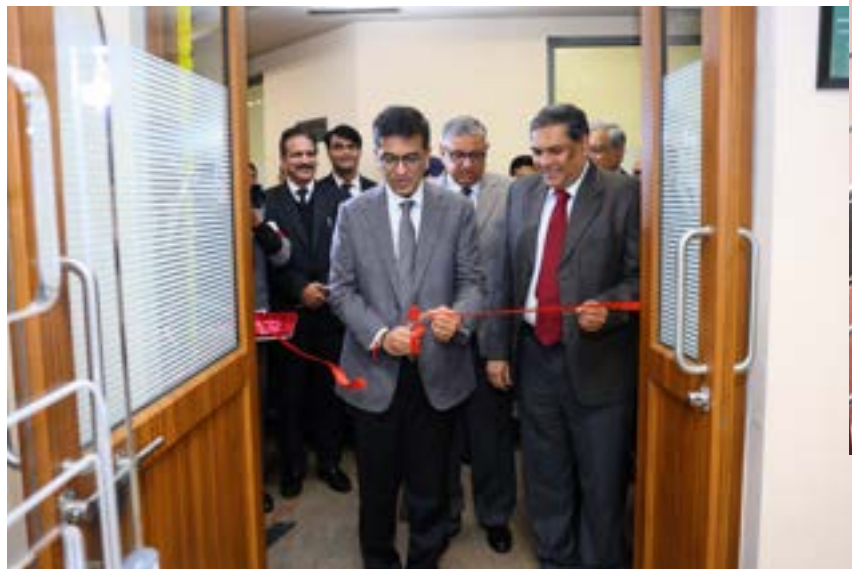
Left to right: Front row - The Chief Justice of India, Dr D Y Chandrachud, Justice Sanjiv Khanna Back row - Justice Aniruddha Bose and Justice P S Narasimha inaugurating the Staff Library in the Additional Building Complex of the Supreme Court

The Chief Justice of India, Dr D Y Chandrachud inaugurated the Staff Library in the Additional Building Complex of the Supreme Court on 1 February 2024. The Library aims to cultivate and enhance the culture of reading among the staff of the Supreme Court Registry. It is located in Room No. 404, B-Block of the Additional Building Complex. Open to all officials of the Registry, the Staff Library boasts a diverse collection of reading materials. These include legal books, materials for departmental and judicial entrance examinations, and general books in a variety of genres. The Library also provides access to print and e-newspapers, and magazines in both English and Hindi. Radio Frequency Identification (RFID) technology has streamlined the issue and return of books.