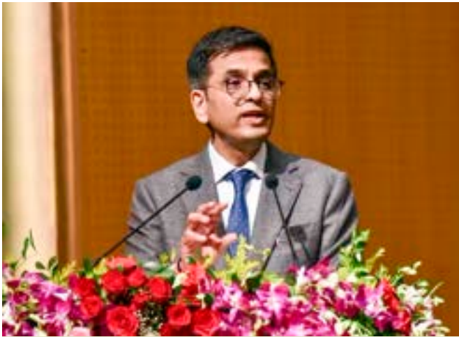
The Chief Justice of India, Dr D Y Chandrachud, inaugurated Dr Rajendra Prasad National Law University in the auditorium of Allahabad Medical Association (AMA) Hall on 16 February 2024