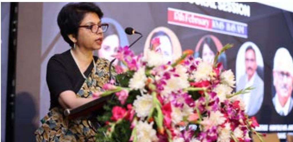
Justice Hima Kohli addressing the gathering during ‘The India-MENA Arbitration Summit,’ at Hyatt Hyderabad, Gachibowli on 17 February 2024

Justice Hima Kohli was the Chief Guest at ‘The India-MENA Arbitration Summit.’ The event was a gathering of notable arbitration experts from India and the Middle East and North Africa (MENA), organised by the International Arbitration and Mediation Centre (IACM), Hyderabad on 17 and 18 February 2024, at the Hyatt