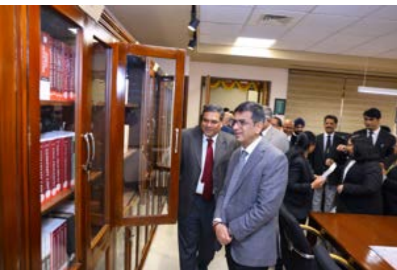
The Chief Justice of India, Dr D Y Chandrachud, and Justice Sanjiv Khanna taking a glance of the the newly inaugurated Staff Library