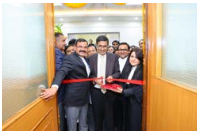
The Chief Justice of India, Dr D Y Chandrachud inaugurating the Supreme Court Bar Association's (SCBA) new Consultation Room near the Bar Lounge, ground floor on 5 February 2024