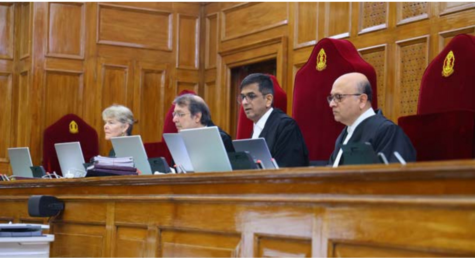
Left to right: Judge, International Court of Justice, Ms Hilary Charlesworth, Justice J B Pardiwala, the Chief Justice of India, Dr D Y Chandrachud, and Justice Manoj Misra in courtroom no 1 on 12 February 2024

"Supreme Court's courageous capacity of introspection which, to quote, the Chief Justice's recent talk at the ceremonial sitting and I quote from him 'introspection is the art of bringing the seemingly unattainable within the line of vision' this it seems to me is a vital quality—introspection for true judicial independence."