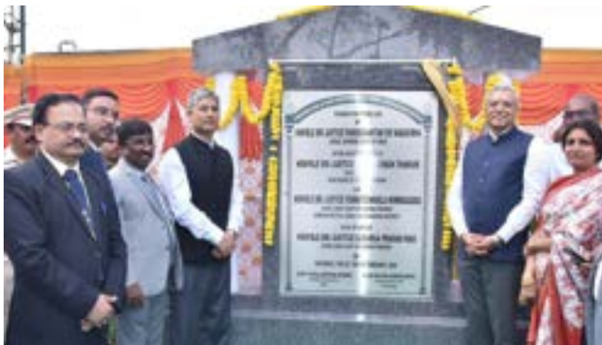
Justice P S Narasimha laid the foundation stone of the Four Court Building at the District Court Building Complex at Bobbili, Vizianagaram District, Andhra Pradesh on 24 February 2024