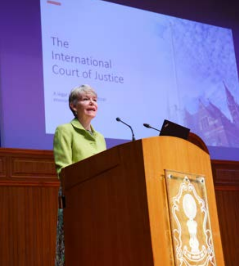
Judge, International Court of Justice, Ms Hilary Charlesworth delivering the Second Edition of the Supreme Court's Annual Lecture Series

Explaining the difference between ‘compulsory jurisdiction’ and ‘voluntary jurisdiction’ concerning the International Court of Justice, Judge Charlesworth indicated the limitation with which the International Court of Justice works.