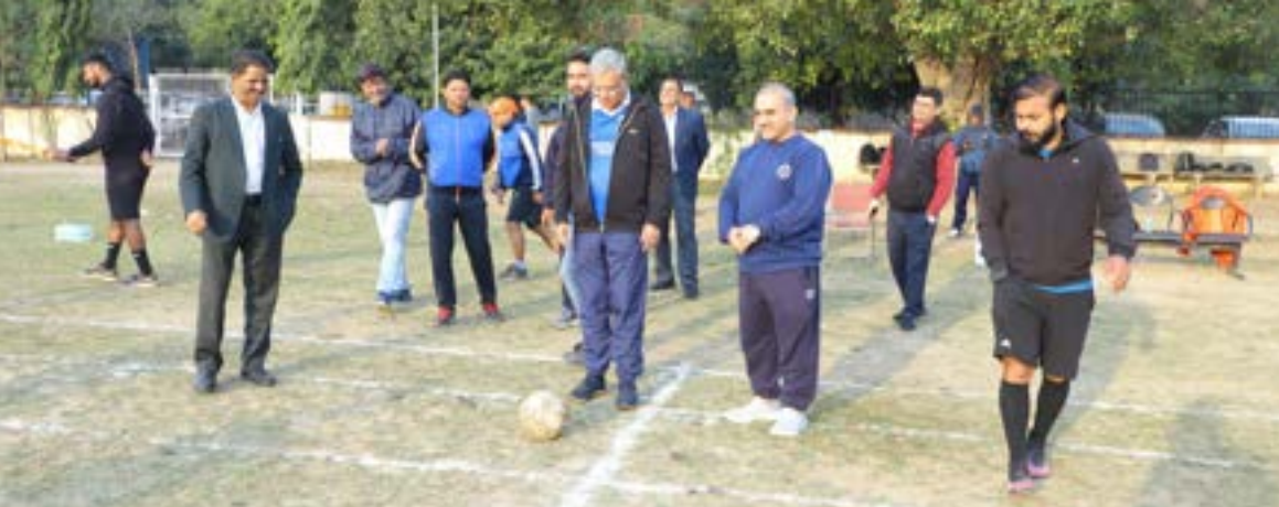
Justice P S Narasimha at the finals of the Football match organised by the Supreme Court on 26 February 2024