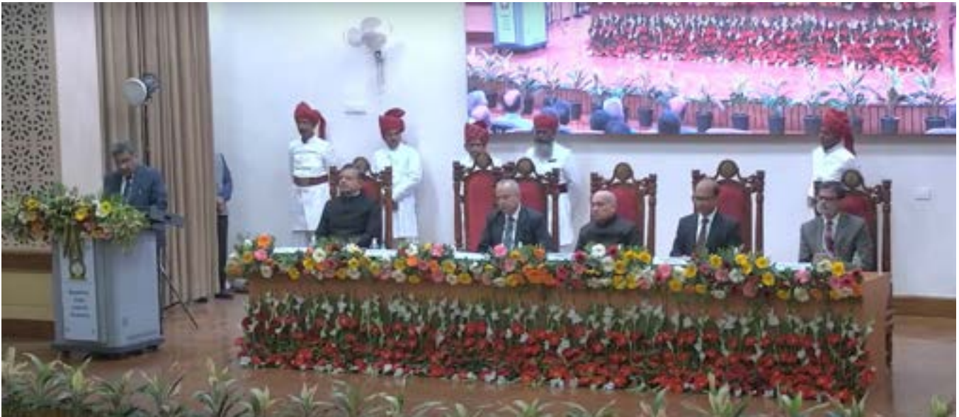
Justice Pankaj Mithal delivered the keynote address at the inaugural session of the West Zone-II: Regional Conference on 'Contemporary Judicial Developments and Strengthening Justice through Law & Technology' and presided over Session-II on 'Elements of Judicial Behaviour' at Jodhpur on 24 February 2024