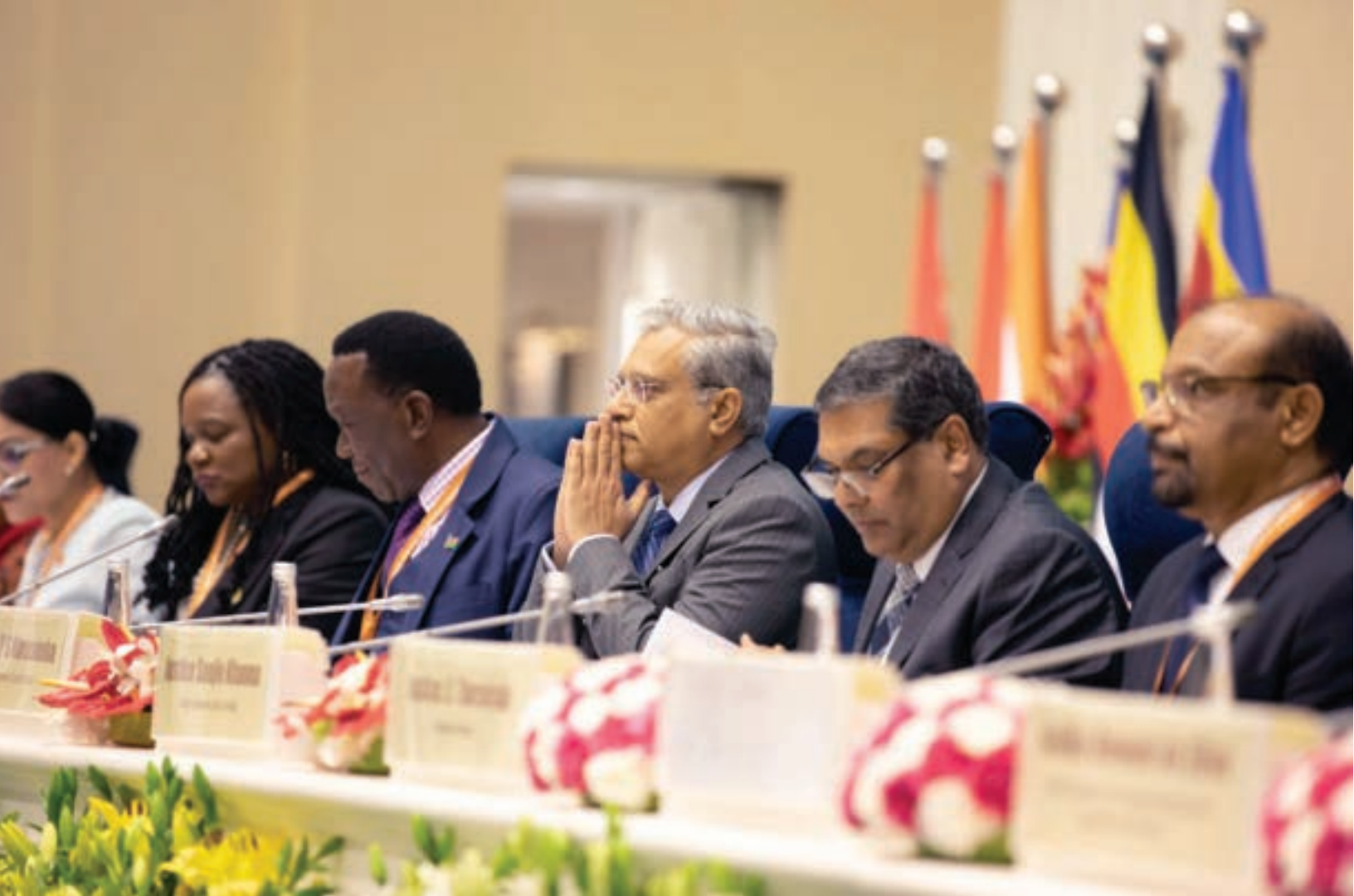
Justice Sanjiv Khanna and Justice P S Narasimha co-chaired Session 1: Legal Frameworks and Advocacy in Justice Delivery, CLEA– CASGC, on 3 February 2024

Institutional Resilience on ‘Technological Advancements for Legal Dynamics: Exploring the intersection of technology, law and justice’ and ‘Cross Border Challenges in Justice: