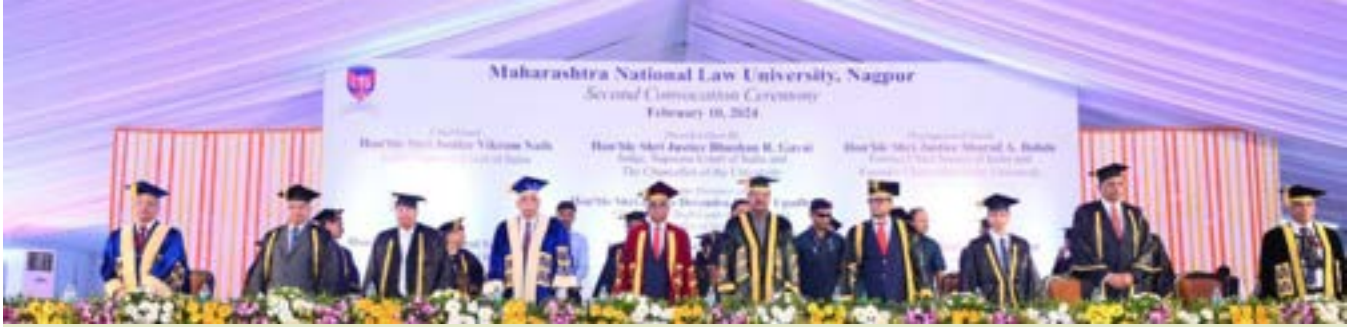
Justice B R Gavai and Justice Vikram Nath at the second convocation of Maharashtra National Law University, Nagpur on 10 February 2024