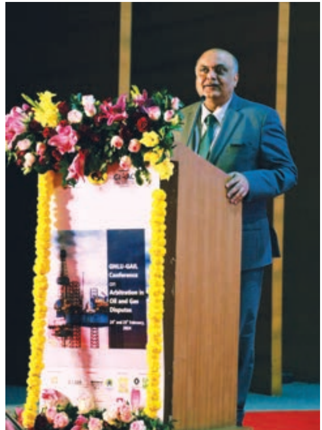
Justice Ahsanuddin Amanullah presided as the Chief Guest at the inaugural session of the first GNLU-GAIL Arbitration Conference on Oil and Gas Disputes at Gujarat National Law University on 24 February 2024