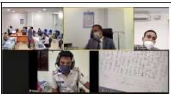
Figure 5: Marking of document using document Visualizer