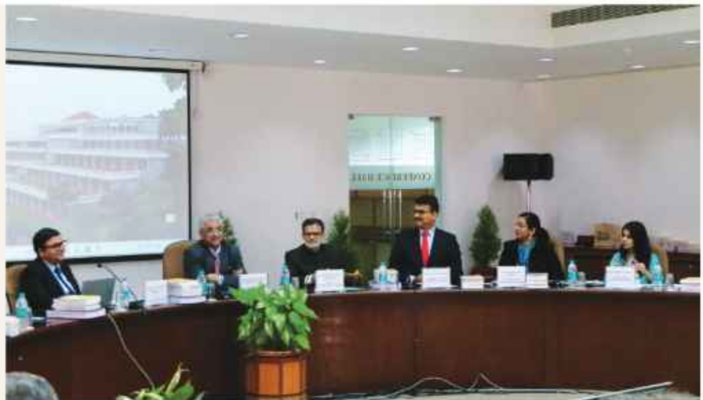
Justice Aravind Kumar presided over Session 4 - Court and Case Management and Session 5 - Interim Orders and Judicial Discretion during an orientation course for newly elevated high court judges on 21 January 2024 at National Judicial Academy, Bhopal