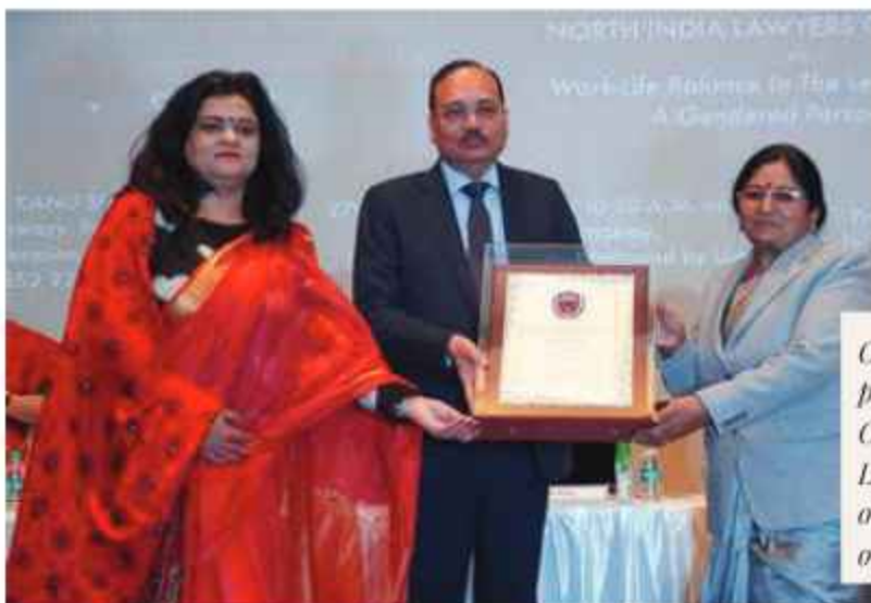
On 27 January 2024, Justice Surya Kant presided as the Chief Guest at the North-India Conference on "Work Life Balance in the Legal Profession – A Gendered Perspective" organised by Punjab and Haryana Federation of Women Lawyers, Chandigarh