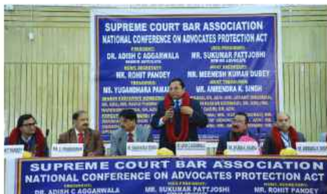
On 27 January 2024, Supreme Court Bar Association organised a National Conference on Advocates Protection Act, at V K Krishna Menon Bhatwan, Indian Society of International Law, New Delhi