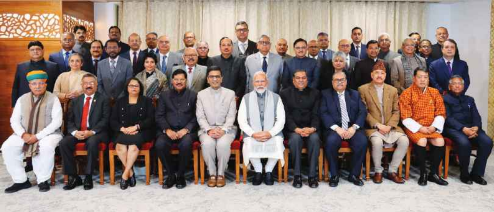
The Prime Minister of India, the Chief Justice of India, Judges of the Supreme Court, the Minister of State for Law and Justice (I/C), Attorney General of India, Solicitor General of India, President, Supreme Court Bar Association, Chairman, Bar Council of India at the commemoration of Diamond Jubilee Year