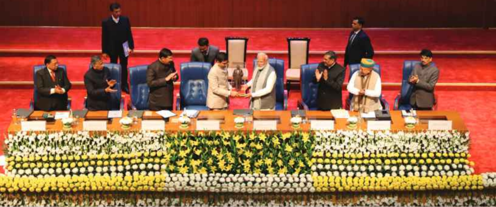
The Chief Justice of India, Dr. D. Y. Chandrachud presenting a memento to the Prime Minister of India, Shri Narendra Modi in the presence of the Judges of the Supreme Court, Minister of State for Law and Justice (I/C), President of the Supreme Court Bar Association and Chairman of the Bar Council of India, at the commemoration of Diamond Jubilee Year