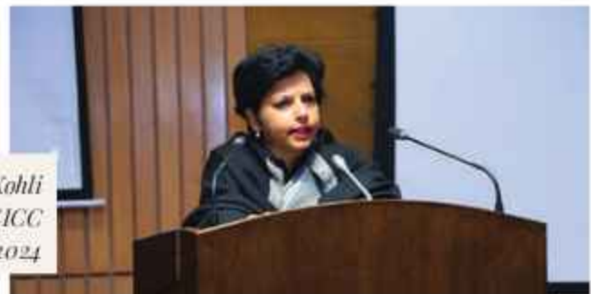
Chairperson, GSICC, Justice Hima Kohli addressing the participants at GSICC training on 19 January 2024