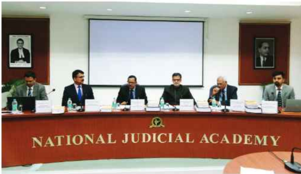
On 20 January 2024 Justice Ujjal Bhuyan presided over Session 1 - Fair Trial and Session 2 - The Triple Method of Plea Bargain, Compounding and Probation at the National Conference on 'Sentencing, Probation and Victim Compensation,' held by the National Judicial Academy, Bhopal