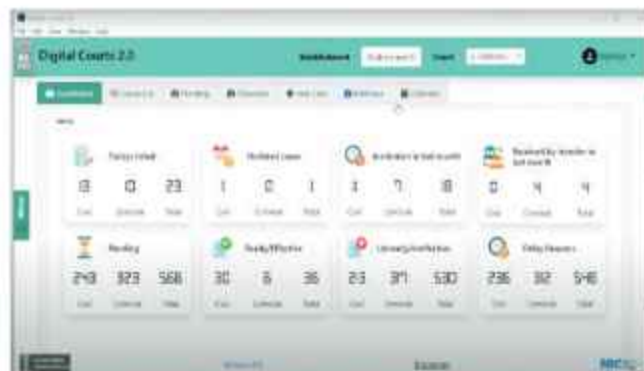
Digital Courts 2.0

Digital Courts 2.0 was launched through a collaborative effort between the e-Committee and the Department of Justice under the e-Courts project. Leveraging the power of artificial intelligence, particularly in transcribing speech to text, the platform empowers judges to efficiently dictate orders, judgments, and record testimonies in real-time. Incorporating National Informatics Centre's artificial intelligence-powered tool AI-Shruti, the platform further facilitates automatic speech recognition for multiple languages, thereby streamlining the transcription process.