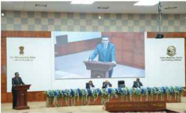
Justice Dipankar Datta addressing the audience at the inaugural session of the West Zone-I Regional Conference on “Contemporary Judicial Developments and Strengthening Justice through Law and Technology” at Uttan, Maharashtra on 13 January 2024