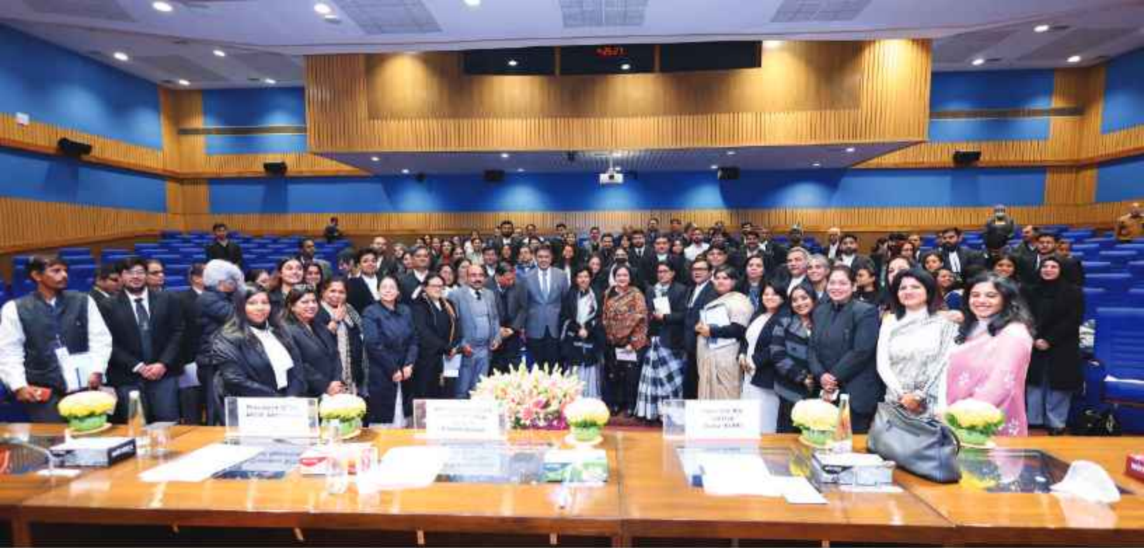
Group Photo taken during the 'Gender Sensitisation and Prevention of Sexual Harassment at Workplace' training held on 19 January 2024