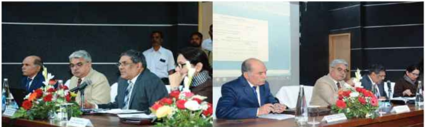
Executive Chairman, NALSA, Justice Sanjiv Khanna chaired the first-ever State Level Conference of District Legal Services Authorities of Madhya Pradesh on 13 January 2024 at Bhopal, Madhya Pradesh

NALSA organised two important programmes in January 2024 namely the State Level Conference of District Legal Services Authorities of Madhya Pradesh on 13 January 2024 at Bhopal and the Launch of Pan-India Campaign, "Restoring the Youth: Pan-India Campaign for Identifying Juveniles in Prisons and Rendering Legal Assistance – 2024" on 25 January 2024.