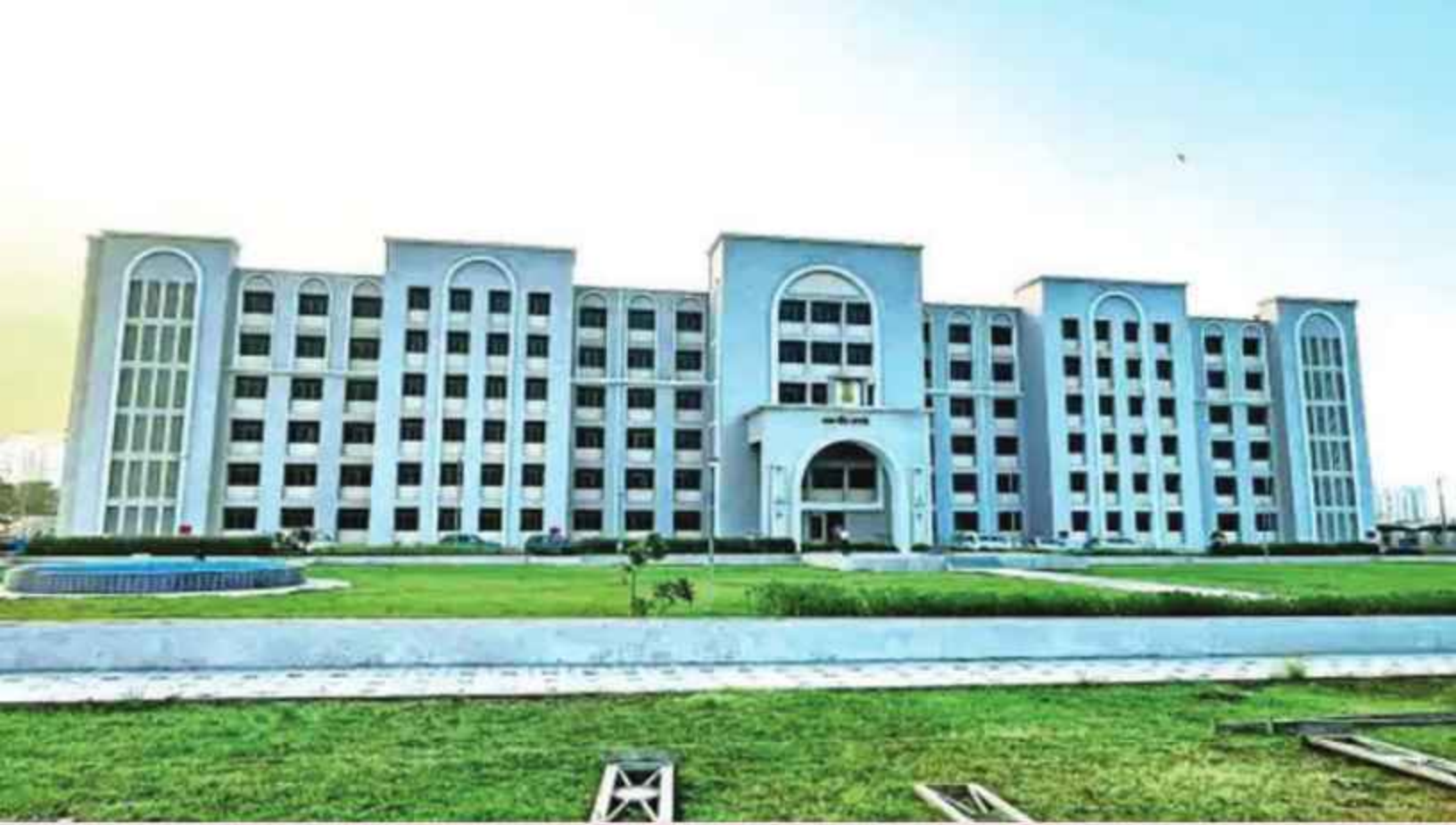
New District Court Complex (Nyaya Mandir) at Rajkot, Gujarat

This exemplary establishment, equipped with amenities such as crèches and accessible toilets, alongside cutting-edge technology integration, marks a pivotal milestone in ensuring equitable access to justice. The launch of e-filing 3.0 for Gujarat's district judiciary, coupled with the introduction of a video conferencing witness deposition centre and an AI-based text-to-speech callout system by the Gujarat High Court, represents a groundbreaking advancement in legal proceedings.