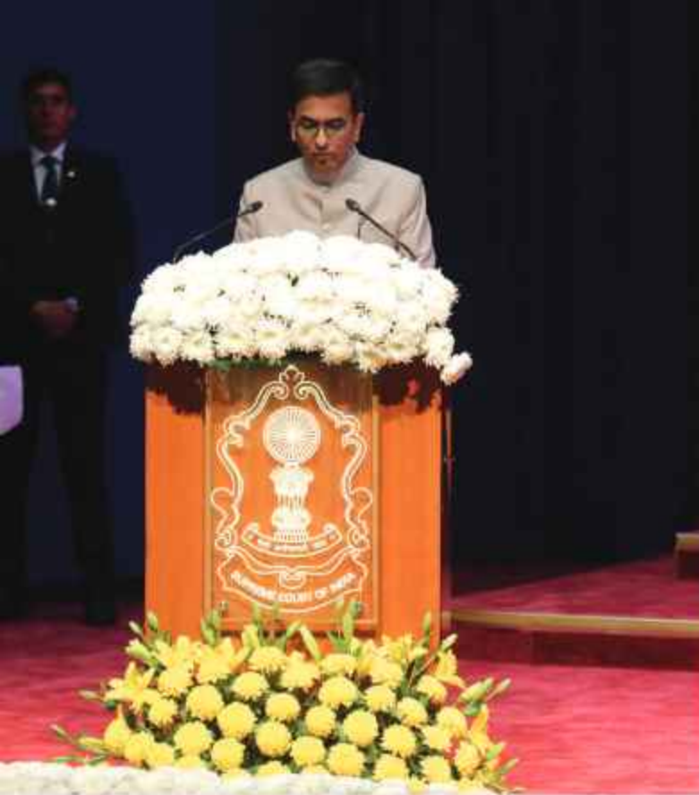
The Chief Justice of India, Dr D Y Chandrachud addressing the audience on the occasion of the Diamond Jubilee Celebrations of the Supreme Court of India

During the celebrations, the Chief Justice of India, Dr D Y Chandrachud delivered a profound address expressing gratitude to the dignitaries and recognising the historical significance of the occasion: