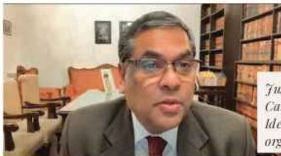
Justice Sanjiv Khanna during the virtual launch of Pan-India Campaign – "Restoring the Youth: Pan-India Campaign for Identifying Juveniles in Prisons and Rendering Legal Assistance" organised by NALSA on 25 January 2024

Justice Sanjiv Khanna while launching the campaign, emphasised, "Criminals are made by circumstances. No one is born a criminal. The path towards criminality is often a result and consequence of experiences and circumstances mostly shaped by neglect, external influences or lack of guidance." 'Restoring the Youth' is a call to action, aligning with the principles of juvenile justice, marking a significant step towards ensuring implementation of the juvenile justice laws in letter and spirit.