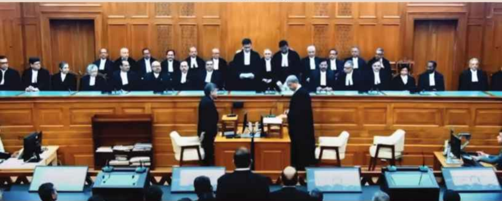
Justice Prasanna B Varale, taking oath as Judge of the Supreme Court on 25 January 2024

Justice Prasanna B Varale was appointed as an Additional Judge of the Bombay High Court on 18 July 2008, and made permanent on 15 July 2011. He was elevated as the Chief Justice of Karnataka High Court on 15 October 2022. On 25 January, Justice Prasanna was elevated as the 34th Judge of the Supreme Court.