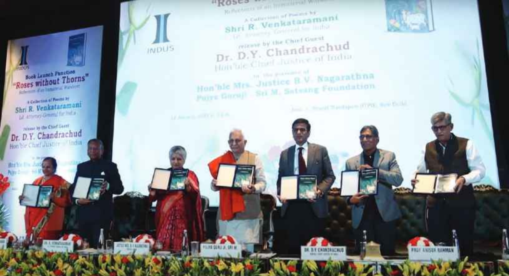
On 12 January 2024, the Chief Justice of India, Dr D Y Chandrachud released the book 'Roses without Thorns' penned by Attorney General for India, R Venkataramani in presence of Justice B V Nagarathna at Audi-1, Bharat Mandapam (ITPO), New Delhi