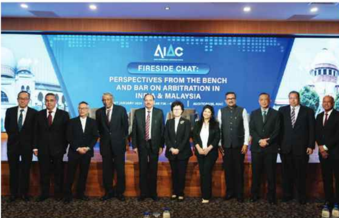
Justice Surya Kant presided as the Chief Guest at the Asian International Arbitration Centre's (AIAC) seminar on 'Perspectives from the Bench and Bar on Arbitration in India and Malaysia' on 16 January 2024