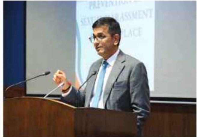
The Chief Justice of India, Dr D Y Chandrachud addressing the participants at GSICC training on 19 January 2024