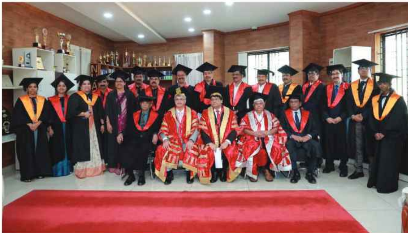
On 6 January 2024, Justice Sudhanshu Dhulia presided as the Chief Guest and delivered a convocation address at the 17th convocation ceremony of the National University of Advanced Legal Studies (NUALS) at Kochi.