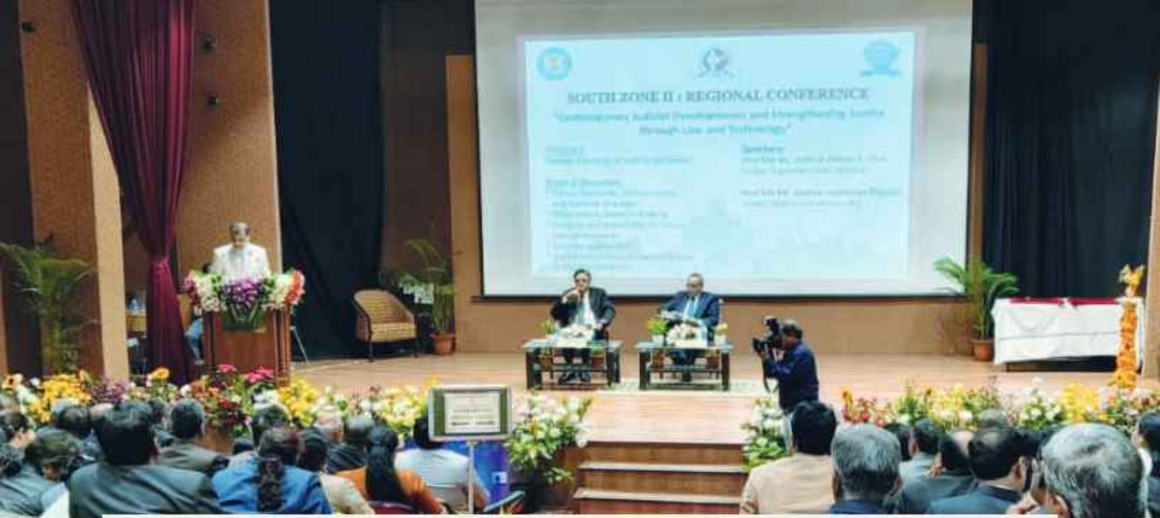
Justice Abhay S Oka presiding over Session-2 on the theme 'Elements of Judicial Behaviour' conducted at South Zone-II: Regional Conference on Contemporary Judicial Developments and Strengthening Justice through Law and Technology at Dr M C R, H R D Institute, Jubilee Hills, Hyderabad

The South Zone-II: Regional Conference on "Contemporary Judicial Developments and Strengthening Justice through Law and Technology" was organised by National Judicial Academy (NJA) in collaboration with the High Court for the State of Telangana and the Telangana State Judicial Academy at Dr MCR HRD Institute, Jubilee Hills, Hyderabad. On 6 January 2024, Justice Abhay S Oka presided over Session-2 on the theme 'Elements of Judicial Behaviour' and the Session-3 titled 'Judgment Writing Tools' was presided over by Justice Ujjal Bhuyan. On 7 January 2024, Justice Rajesh Bindal presided over Session-4 on the theme "Overview of e-Courts Projects" as a resource person.