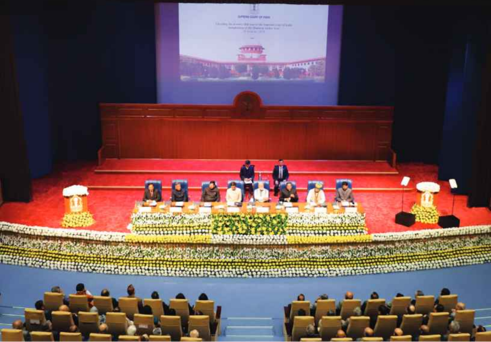
The Chief Justice of India, Dr D Y Chandrachud with the Hon'ble Prime Minister of India, Shri Narendra Modi in the presence of the Judges of the Supreme Court, Minister of State for Law and Justice (I/C), President of the Supreme Court Bar Association and Chairman of the Bar Council of India, at the commemoration of Diamond Jubilee Year

ensuring that the length of oral arguments does not interminably delay judicial outcomes and lead to the capture of judicial institutions by the powerful and the mighty; third, the provision of a level playing field for first generation lawyers and men and women from marginalised segments of society who have the will to work hard and the potential to succeed; and fourth, to beginning the conversation on long vacations and to decide, in consultation with the Bar, whether alternatives such as flexi-time for lawyers and judges is possible.