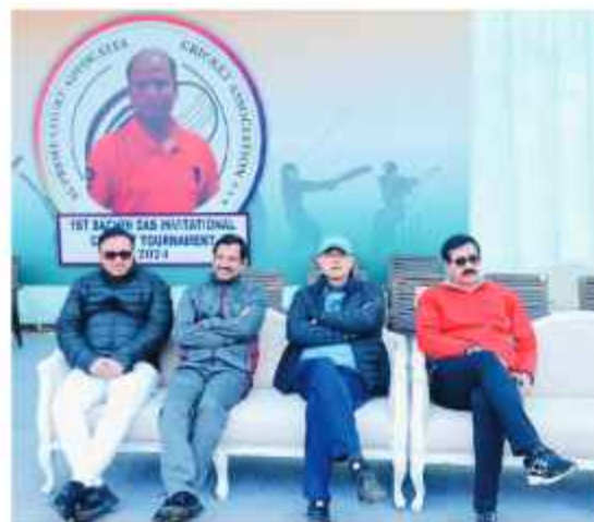
Justice M M Sundresh at the 1st Sachin Das Invitational Cricket Tournament inauguration conducted by the Supreme Court Advocates Cricket Association at Modern School, New Delhi on 13 January 2024