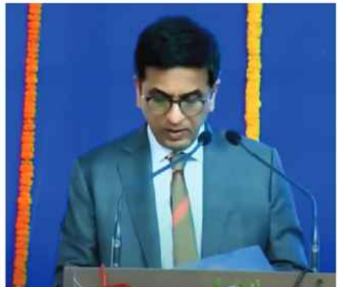
The Chief Justice of India, Dr D Y Chandrachud inaugurating the District Court Complex (Nyaya Mandir) at Rajkot, Gujarat

Such initiatives not only underscore the judiciary's proactive approach to embracing innovation but also reflect the Chief Justice of India, Dr D Y Chandrachud's commitment to enhancing accessibility and efficiency in the delivery of justice.