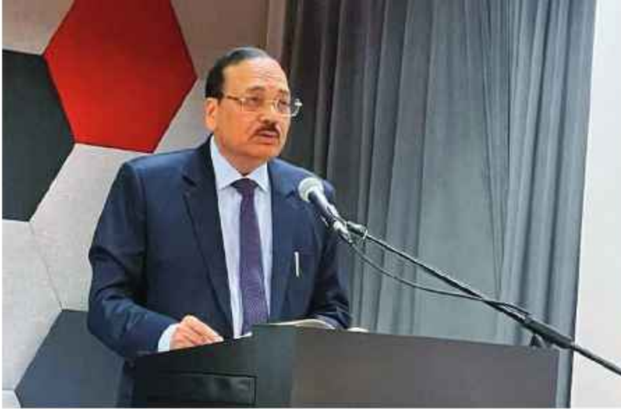
On 15 January 2024, Justice Surya Kant presided as the keynote speaker at the launch of the Malaysian International Mediation Centre at Kuala Lumpur