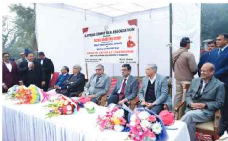
From left to right: Justice KV Viswanathan, Justice Ahsanuddin Amanullah, Justice Aniruddha Bose, the Chief Justice of India, Dr D Y Chandrachud, Justice P S Narasimha, and Justice Rajesh Bindal at the Blood Donation Camp organised by Supreme Court Bar Association on 12 January 2024

along with other Judges of the Supreme Court of India, inaugurated the camp. A total of 71 SCBA members and numerous volunteers donated blood on this occasion.