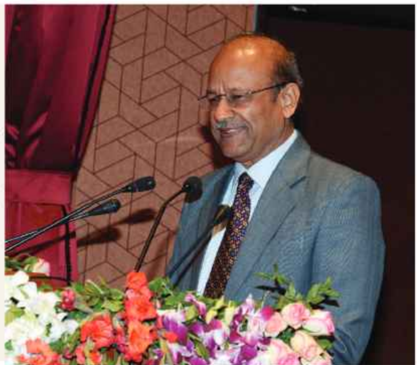
Justice Rajesh Bindal presiding over Session-4 on the theme "Overview of e-Courts Projects" conducted at South Zone-II: Regional Conference on Contemporary Judicial Developments and Strengthening Justice through Law and Technology at Dr M C R, H R D Institute, Jubilee Hills, Hyderabad

The South Zone-II: Regional Conference on "Contemporary Judicial Developments and Strengthening Justice through Law and Technology" was organised by National Judicial Academy (NJA) in collaboration with the High Court for the State of Telangana and the Telangana State Judicial Academy at Dr MCR HRD Institute, Jubilee Hills, Hyderabad. On 6 January 2024, Justice Abhay S Oka presided over Session-2 on the theme 'Elements of Judicial Behaviour' and the Session-3 titled 'Judgment Writing Tools' was presided over by Justice Ujjal Bhuyan. On 7 January 2024, Justice Rajesh Bindal presided over Session-4 on the theme "Overview of e-Courts Projects" as a resource person.