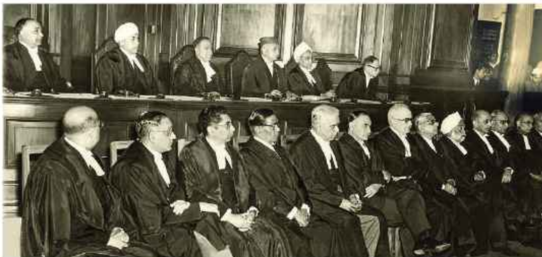
First sitting of the six Judges of the Supreme Court along with 13 Chief Justices from various High Courts on 28 January 1950

Today, the Supreme Court operates with a more streamlined approach, typically convening with a Bench of two Judges, unless the complexity of the case warrants a larger panel. Recent years have seen a concerted effort to tackle the backlog of cases, with a proactive measure towards reducing pendency. In 2023 alone, a remarkable 52,221 cases were disposed of and much credit is owed to technology, which has been instrumental in expediting processes, particularly through e-filing systems that minimise delays.