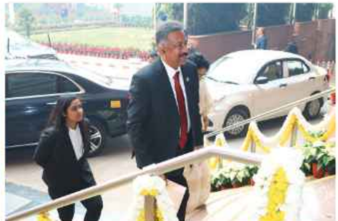
Justice Jayantha C Jayasuriya (Chief Justice of Sri Lanka) heading towards the auditorium on the occasion of Diamond Jubilee Celebrations