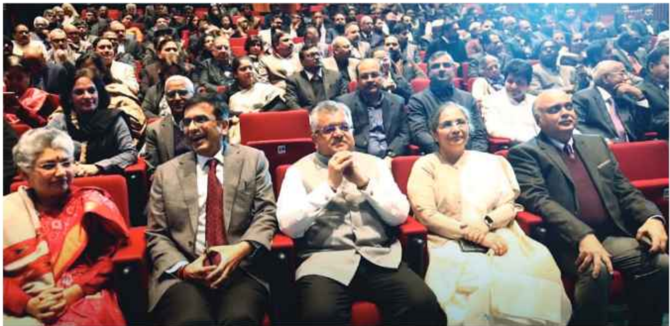
From left to right: Justice B V Nagarathna, the Chief Justice of India, Dr D Y Chandrachud, Solicitor General, Tushar Mehta, Justice Bela Trivedi and Justice Ahsanuddin Amanullah at the book launch 'Roses without Thorns' on 12 January 2024