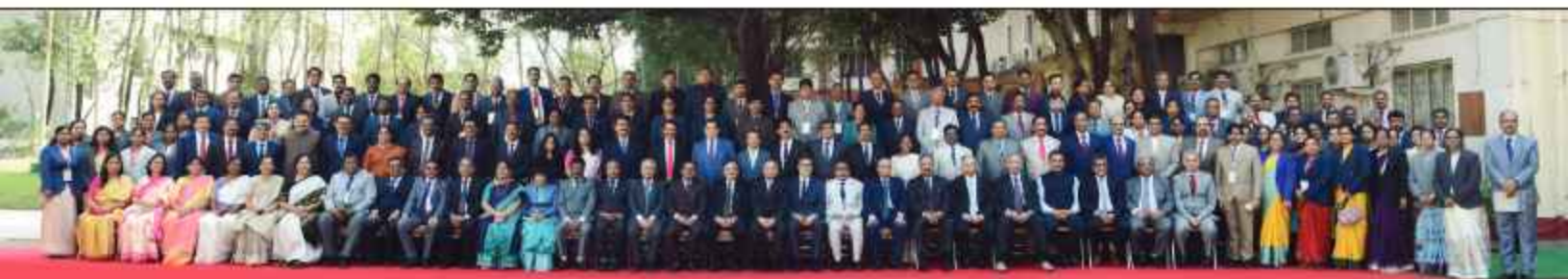
On 6 January 2024, Justice Ujjal Bhuyan and Justice Abhay S Oka presided over the sessions conducted at South Zone-II: Regional Conference on Contemporary Judicial Developments and Strengthening Justice through Law and Technology at Dr M C R, HRD Institute, Jubilee Hills, Hyderabad.