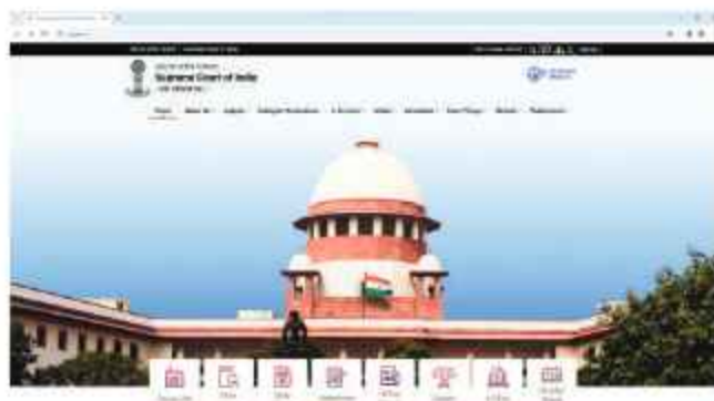
New Supreme Court Website

The new website of the Supreme Court was launched for an enhanced user experience, characterised by a dynamic and functional design, a user friendly interface, and robust content management. It provides users with convenient access to comprehensive information about the organisation, pivotal technology based services, crucial documents, and important updates. The website has been meticulously crafted within the 'Secure, Scalable and Suganya Website as a Service' (S3WAAS) framework of National Information Centre (NIC), prioritising accessibility for differently-abled users.