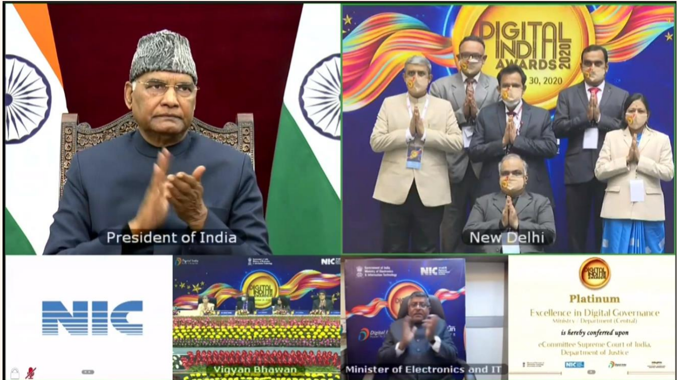
Platinum Award for Excellence in Digital Governance for the year 2020 presented by the President of India

The e-Committee of the Supreme Court has been awarded the Platinum Award for Excellence in Digital Governance for the year 2020 by the President of India. The e-Committee with its citizen centric services and host of digital reforms has played a crucial role in bringing the