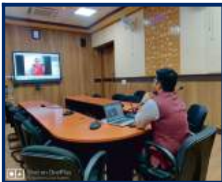
Video Conference Room