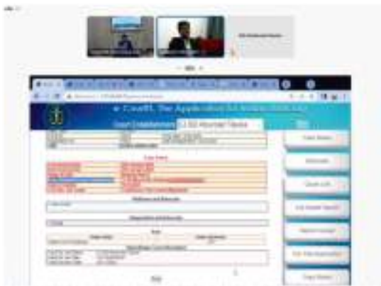
eCommittee, Supreme Court Of India Special Drive and Outreach Training Programme (ECT_4) Programme for Advocates and Advocate Clerks at District Judiciary (12th January, 2024)