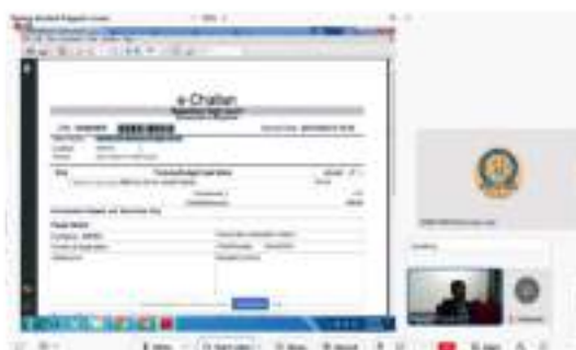
eCommittee, Supreme Court Of India Special Drive and Outreach - Online Refresher Training Programme for Court Staff(ECT_9_2024) (20th January, 2024)