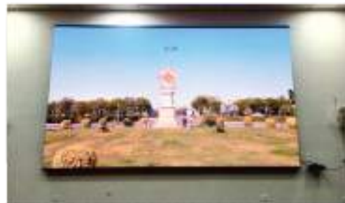
216 Inches LED Video Wall

RSJA is equipped with a Video Conference Hall, enabling smooth conduct of meetings, webinars, and online training sessions. The ultramodern Active LED Video Wall, measuring 8'x15', in the RSJA Auditorium offers an immersive visual experience, perfect for presentations and training.