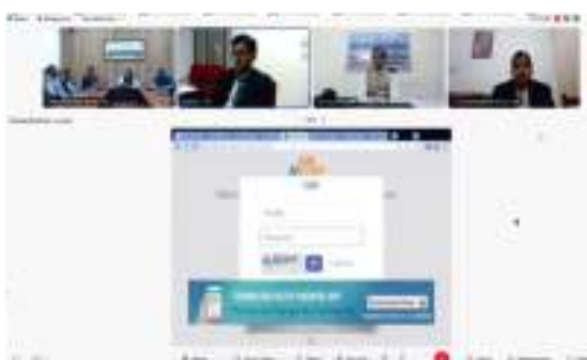
eCommittee, Supreme Court Of India Special Drive and Outreach - Online Refresher Training Programme for Court Staff and N Step Training (ECT_8_2024) (15th February, 2024)