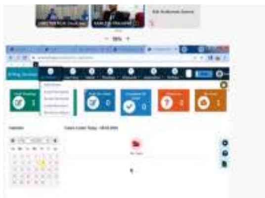
eCommittee, Supreme Court Of India Special Drive and Outreach Training Programme (ECT_7_2024) Programme for Advocates and Advocate Clerks at Taluka/Village (8th February, 2024)