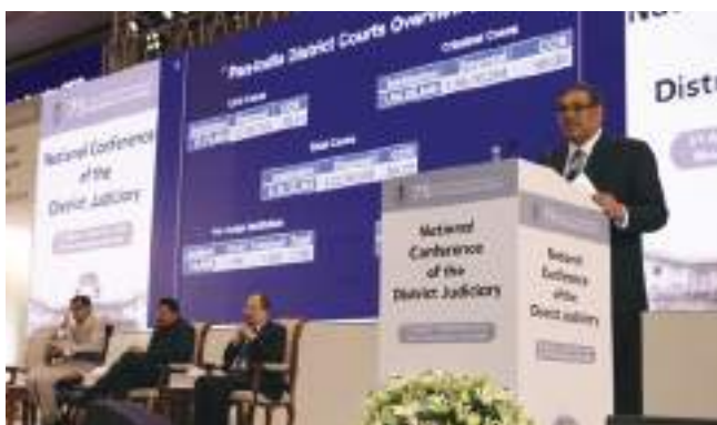
31 August 2024, Justice Sanjiv Khanna, Judge, Supreme Court of India, discusses the case pendency pan India during his presentation in Session I