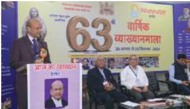
31 August 2024, Justice Rajesh Bindal, Judge, Supreme Court of India, delivers a lecture during the 63rd Annual Lecture series by the Abhyas Mandal, at Indore, Madhya Pradesh