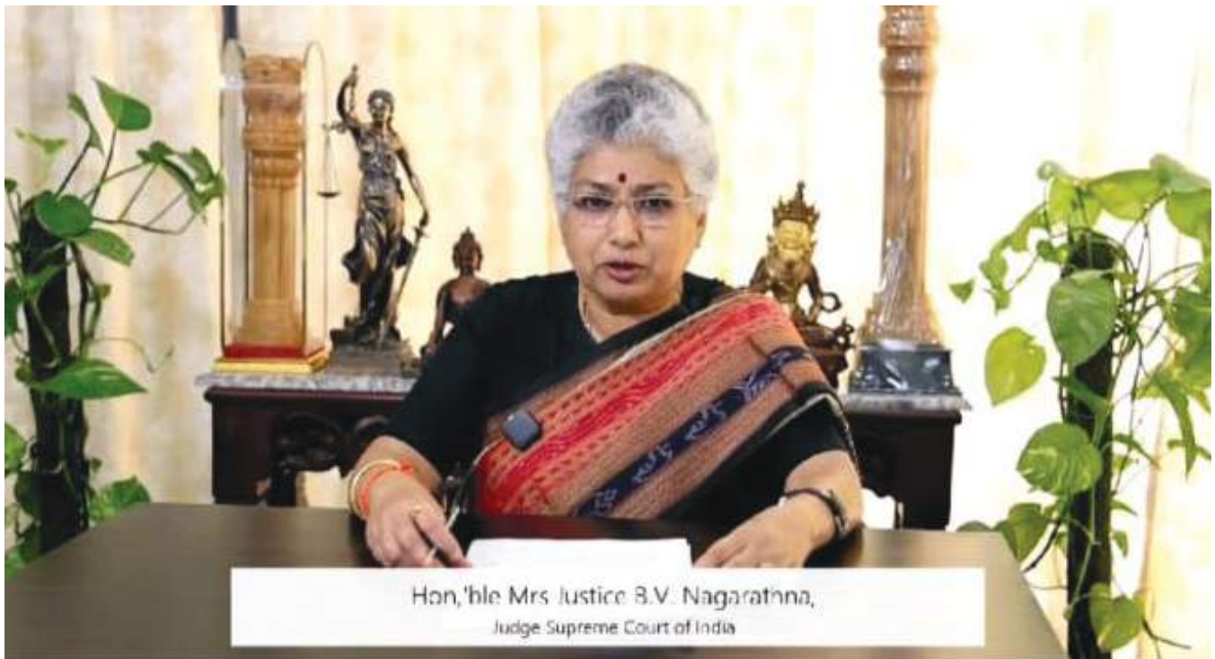
3 August 2024, Justice B V Nagarathna conveys her greetings through a videographed message at "Alumni Meet and Platinum Jubilee Celebration" of Sophia High School at Bengaluru