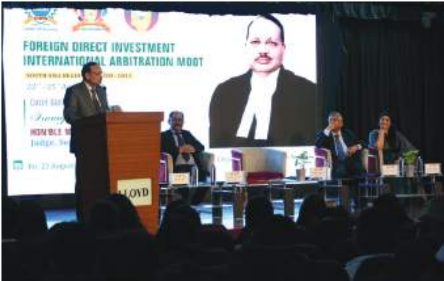
23 August 2024, Justice Surya Kant delivers a keynote address at the “South Asia Regional Round of Foreign Direct Investment International Arbitration Moot, 2024” organised by Lloyd Law College, Greater Noida