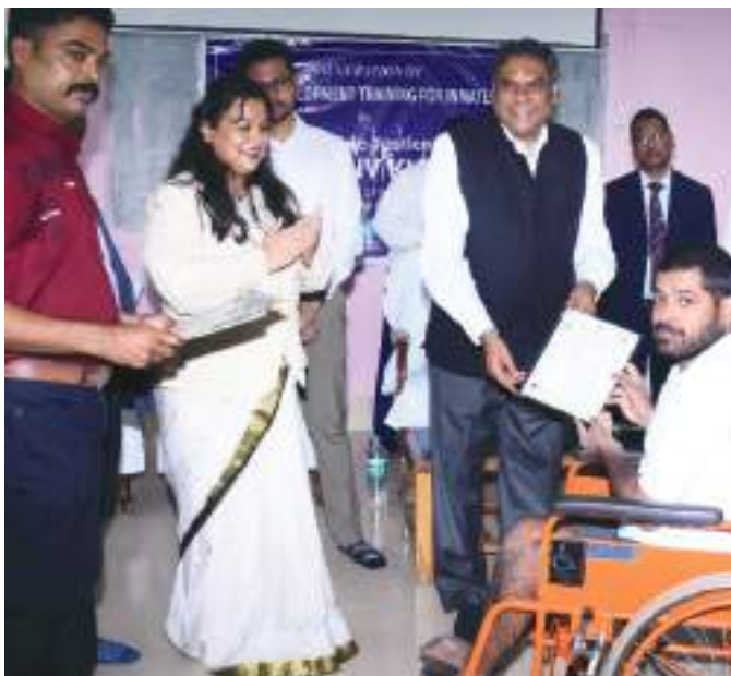
16 - 18 August 2024, Justice Sanjiv Khanna inaugurates Vocational Training Programme on Electronics at Special Jail, Bhubaneswar and distributes certificates to the jail inmates who passed the courses of Journalism and Mass Communication