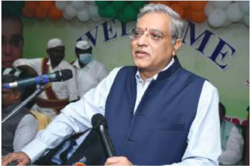
24 August 2024, Justice P S Narasimha visits the District Court Guntur and addresses the Guntur Bar Association