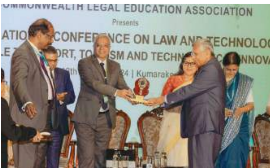
17 August 2024, Justice P S Narasimha chairs Technical Session II: Regulatory Challenges and Innovations in Transportation Technologies and Eco-Tourism in the CLEA Conference at Kumarakom, Kerala