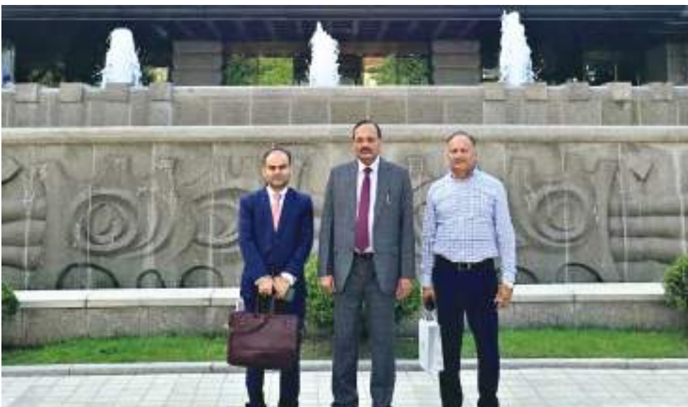
27 August 2024, Justice Surya Kant, at Korea Legislation Research Institute (KLRI), where he spoke on the topic, ‘Cross Border Challenges in Insolvency and Bankruptcy Laws’ in “KLRI Programme” Sejong, South Korea