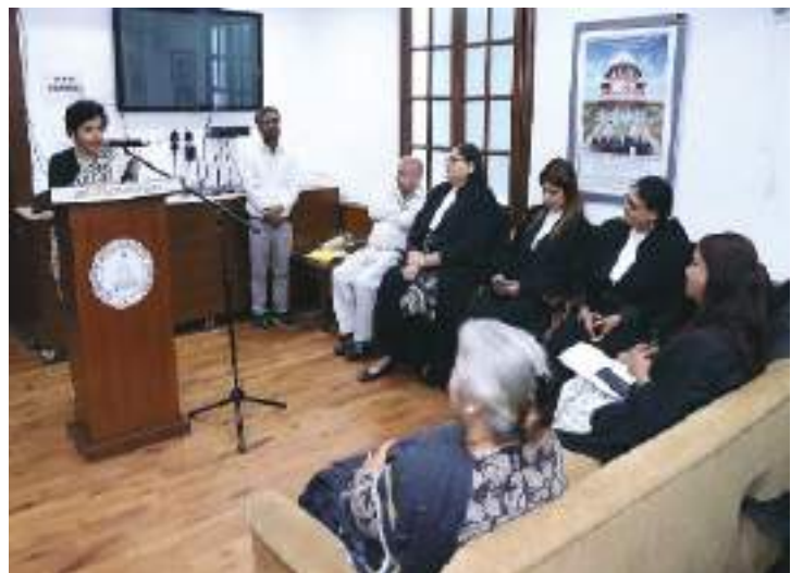
27 August 2024, Justice Hima Kohli receives a farewell from the executive members of the SCAORA on the occasion of her retirement