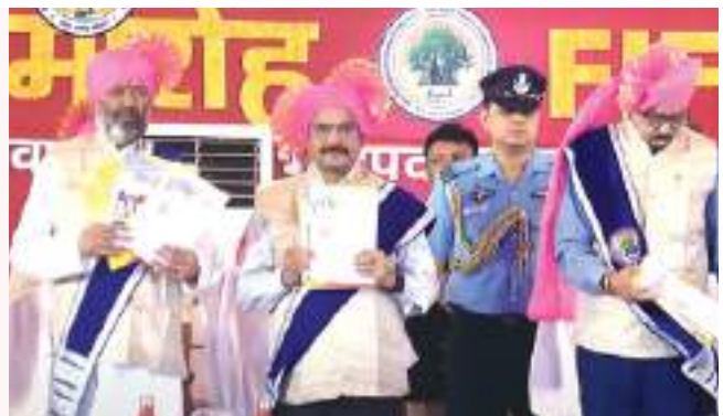
31 August 2024, Justice Prashant Kumar Mishra attends the 5th Convocation of Atal Bihari Vajpayee Vishwavidyalaya, Bilaspur, Chhattisgarh