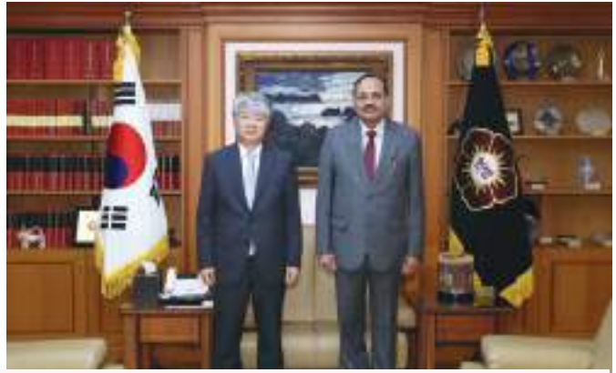
25 - 29 August 2024, Justice Surya Kant along with the Chief Justice of Supreme Court of Republic of Korea (ROK), Justice Cho Hee-dae and Chief Justice of Constitutional Court of ROK, Justice Lee Jongseok, at the Supreme Court and the Constitutional Court of ROK. Justice Kant had insightful and engaging discussions on several topics including judicial reforms and use of technology in the judiciary, during the visit