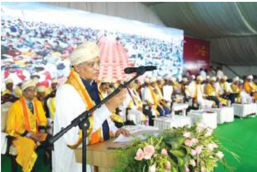
24 August 2024, Justice P S Narasimha, Chief Guest, delivers an address at the 12th Convocation Ceremony, VIGNAN (Deemed to be University), Guntur