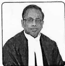
Justice K V Vishwanathan Judge, Supreme Court of India