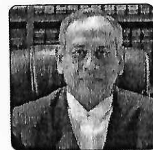
Justice Vibhu Bakhru Judge, High Court of Delhi