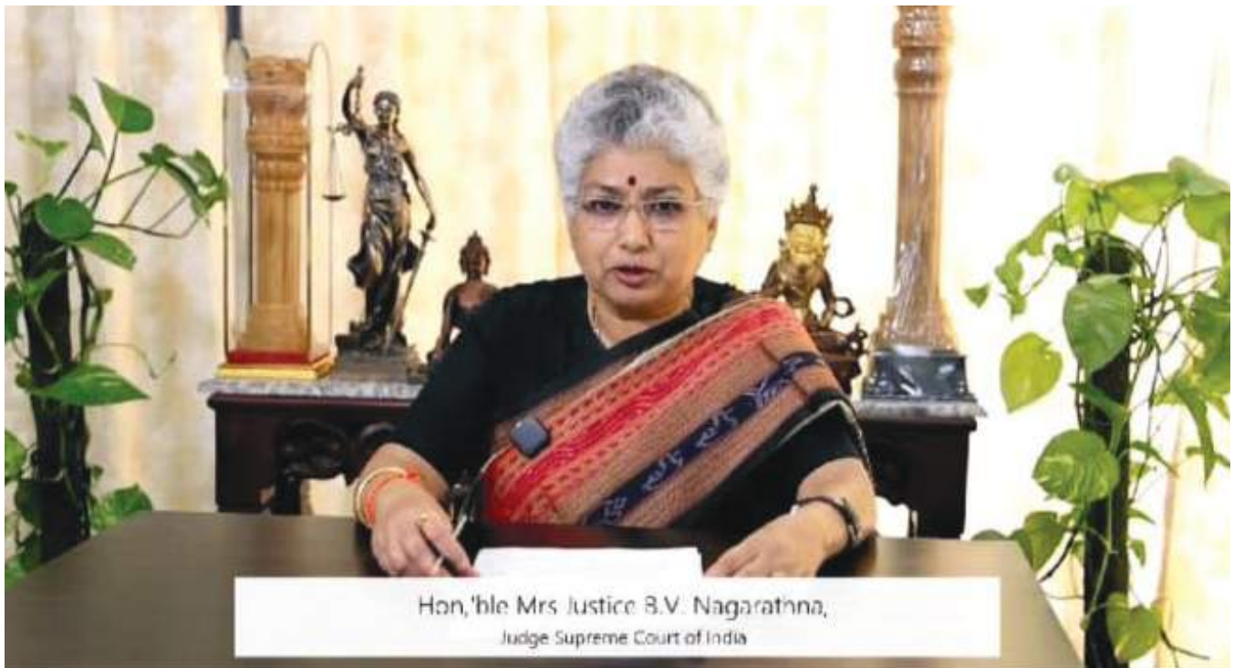
3 August 2024, Justice B V Nagarathna conveys her greetings through a videographed message at "Alumni Meet and Platinum Jubilee Celebration" of Sophia High School at Bengaluru