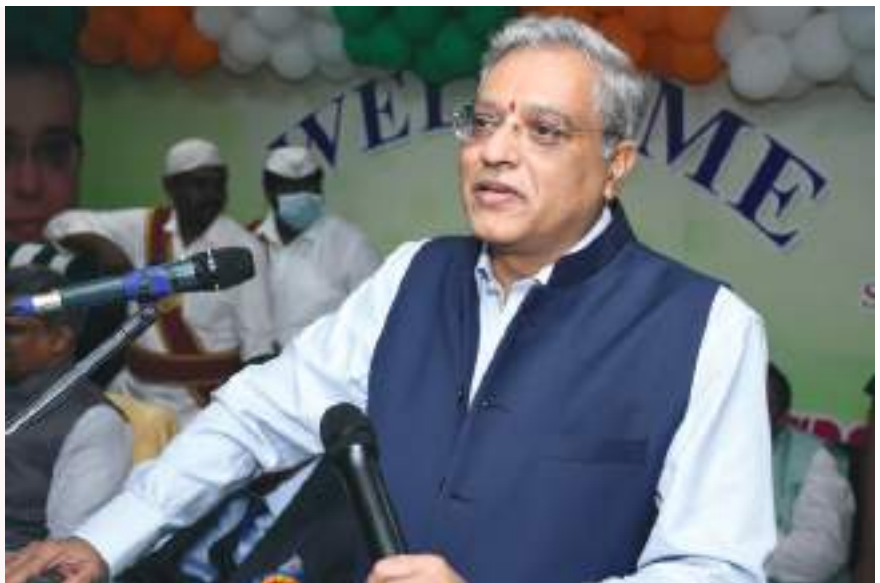
24 August 2024, Justice P S Narasimha visits the District Court Guntur and addresses the Guntur Bar Association