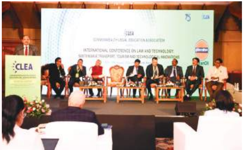
17 August 2024, Justice Surya Kant, Chief Patron, CLEA, addresses the gathering on International Conference by Commonwealth Legal Education Association, on the theme "Law and Technology: Sustainable Transport, Tourism and Technological Innovations," at Kumarakom, Kerala