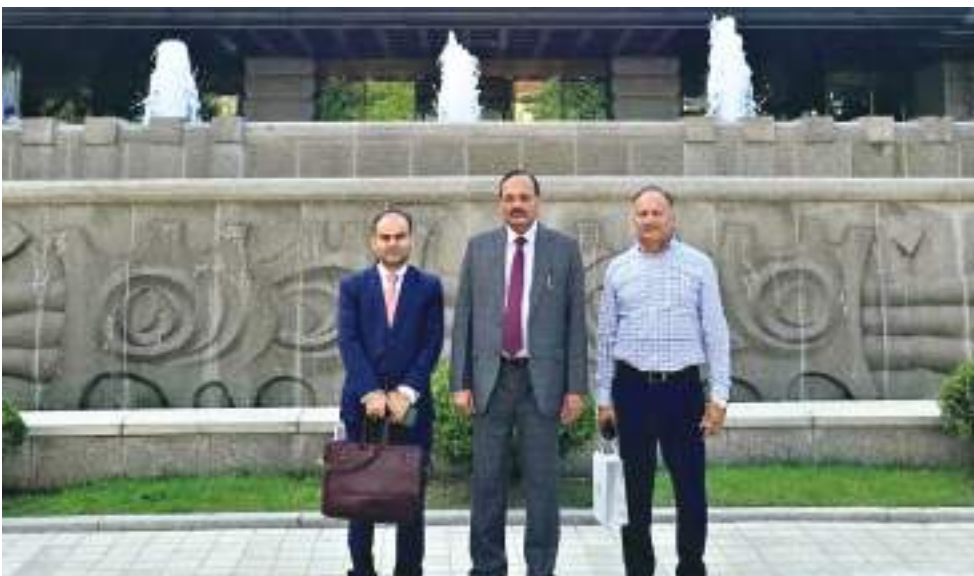
27 August 2024, Justice Surya Kant, at Korea Legislation Research Institute (KLRI), where he spoke on the topic, ‘Cross Border Challenges in Insolvency and Bankruptcy Law’ in “KLRI Programme” Sejong, South Korea