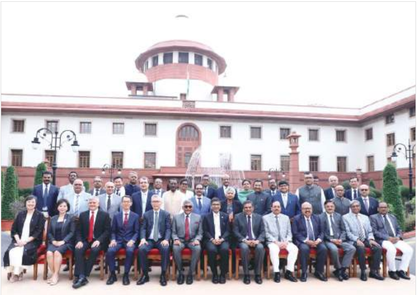
23 August 2024, Chief Justice of India, Dr D Y Chandrachud, Judges, Supreme Court of India, Chief Justice of Singapore, Mr Sundaresh Menon, and the Singapore Delegation at the Supreme Court of India for the “2nd Indo-Singapore Judicial Roundtable”