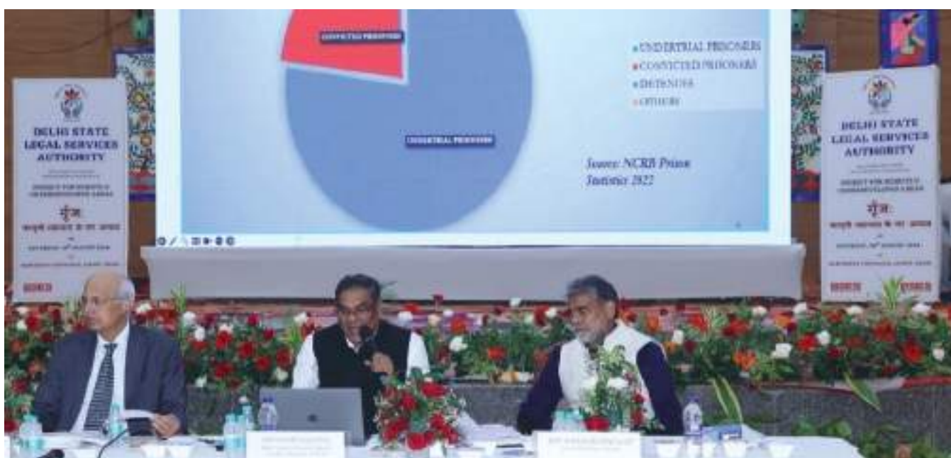
10 August 2024, Justice Sanjiv Khanna visits Jail No. 4, Central Jail, Tihar Complex organised by Delhi State Legal Services Authority