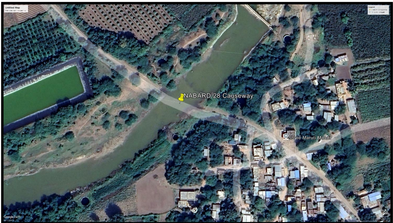
Causeway location On Google Map

The satellite map highlights the location of the NABARD 28 Causeway constructed over the Dhora River, surrounded by agricultural fields and rural settlements in Shevgaon Taluka. The causeway serves as a vital link across the water body, connecting nearby villages and facilitating movement of goods and people. local roads indicate the strategic importance of this infrastructure in improving access to essential services and enhancing rural connectivity.