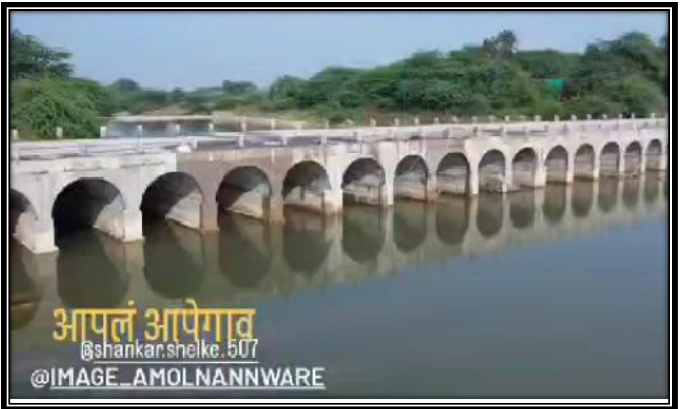
After Completion Photographs