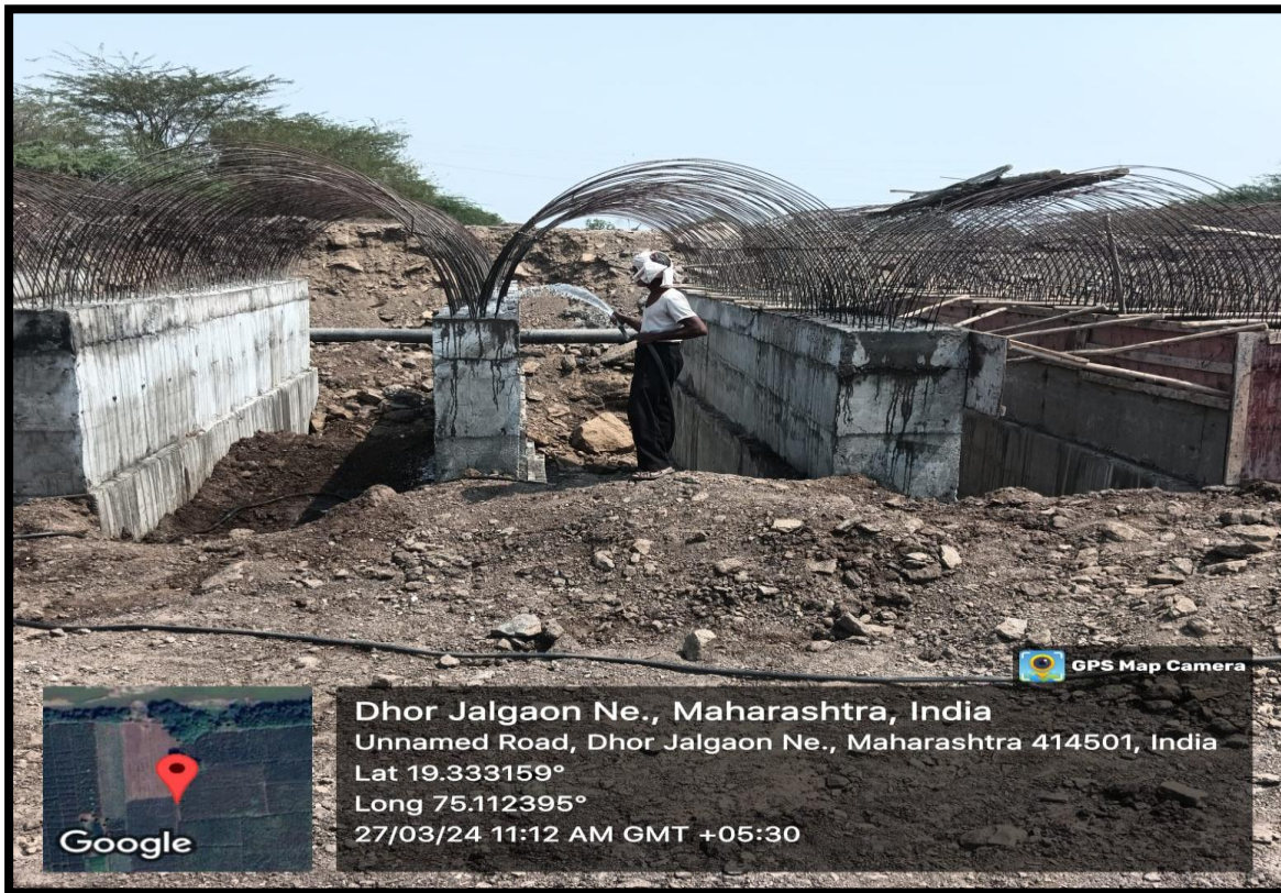
Curing of piers