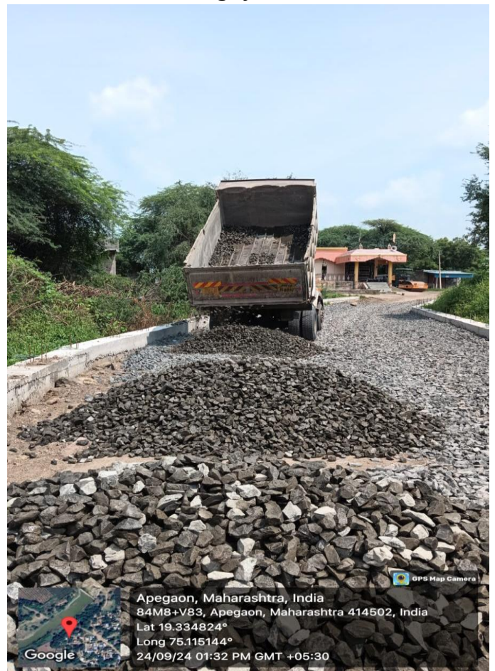
Approach Road Construction