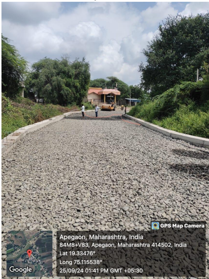
Approach Road Construction