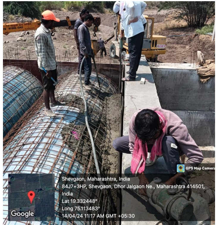
Construction of Protection Wall