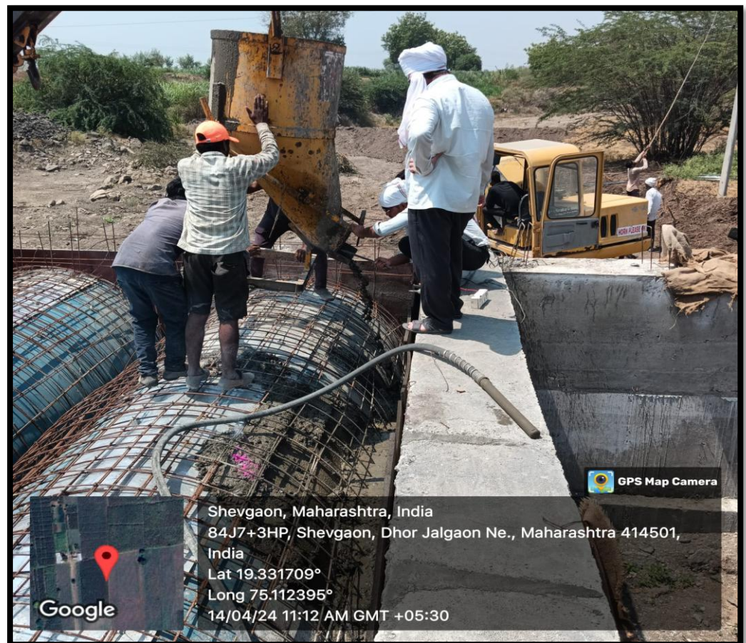
Casting of Arches