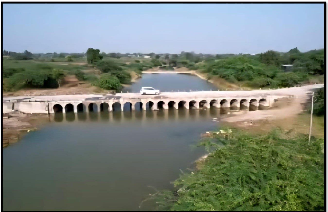
Completed Causeway on Dhora River

For the construction of the Major Bridge on SH-52 to Apegaon–Tulapurwadi Road (VR-93 Km 1/000) across the Dhora River in Taluka Shevgaon, District Ahmednagar, a tested low-cost construction technique was adopted. The construction of large bridges over natural rivers had long remained pending due to high estimated costs and limited availability of funds. With the approval of senior authorities, cost-effective estimates utilizing 2.00-meter diameter arch bridges—already proven in Shevgaon Taluka—were prepared and executed. This approach ensured technical adequacy and durability while achieving nearly 40% savings in government expenditure compared to conventional bridge structures, making it possible to complete long-pending works within the available budget. The savings allowed the Public Works Department to extend resources to multiple projects, thereby maximizing infrastructure development across the region. Traffic has already commenced on several such bridges, and public representatives along with villagers have expressed satisfaction, as the project has delivered reliable connectivity and significant relief to the local community