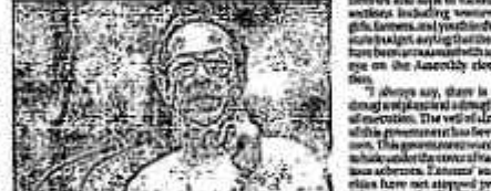
Dr. J. P. Nadda