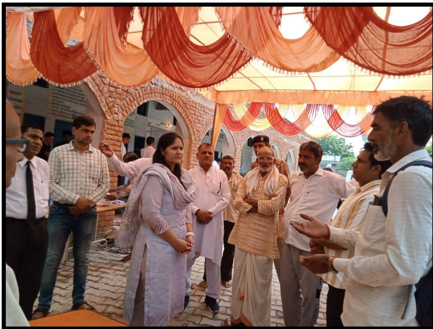
CJM-cum-Secretary, Faridabad interacting with farmers at Faridabad