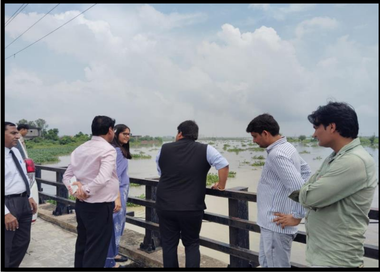
CJM-cum-Secretary, DLSA Faridabad alongwith core team while visiting Village Mahawatpur.

On-Ground Visits by Ld. Secretaries DLSAs to the affected area