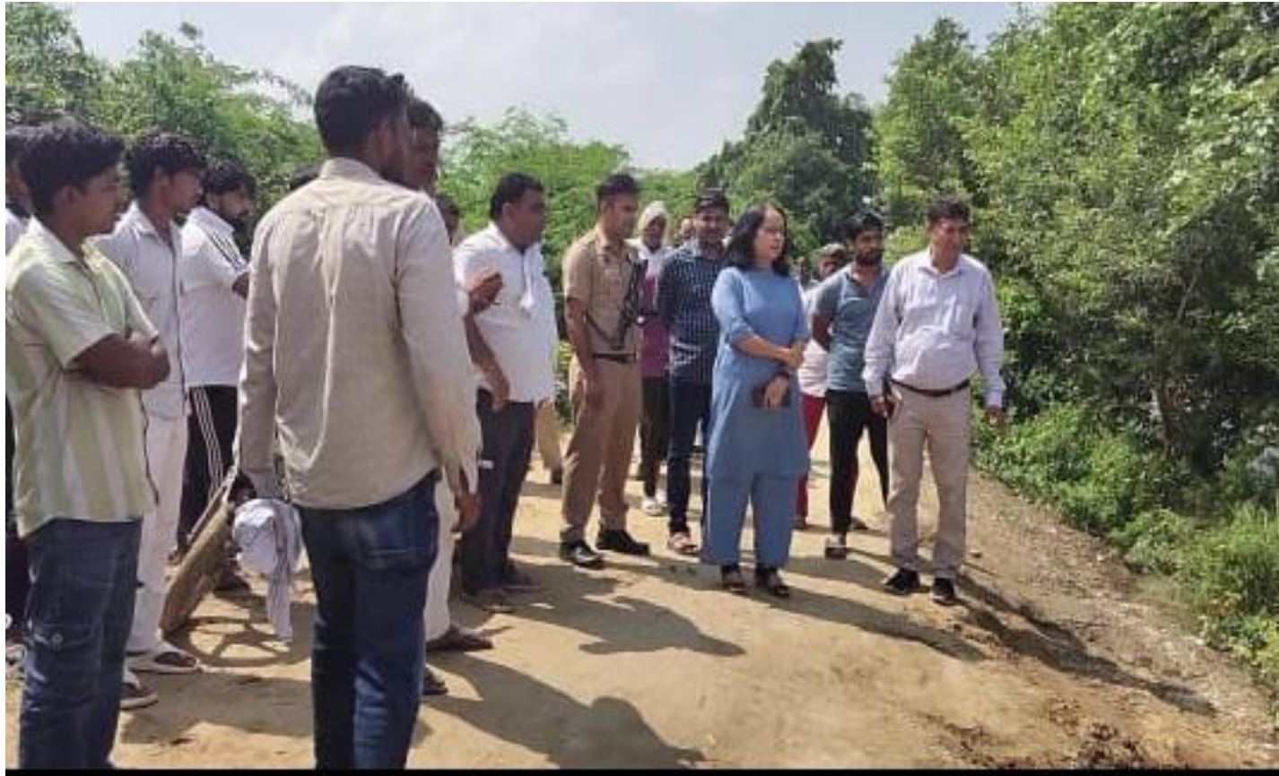
Ld. CJM-cum-Secretary, DLSA Palwal in talks with villagers and District Administration.

As a part of community support and relief monitoring Ld. CJM-cum-Secretaries are in constant supervision of the affected areas to ensure timely assistance to victims.