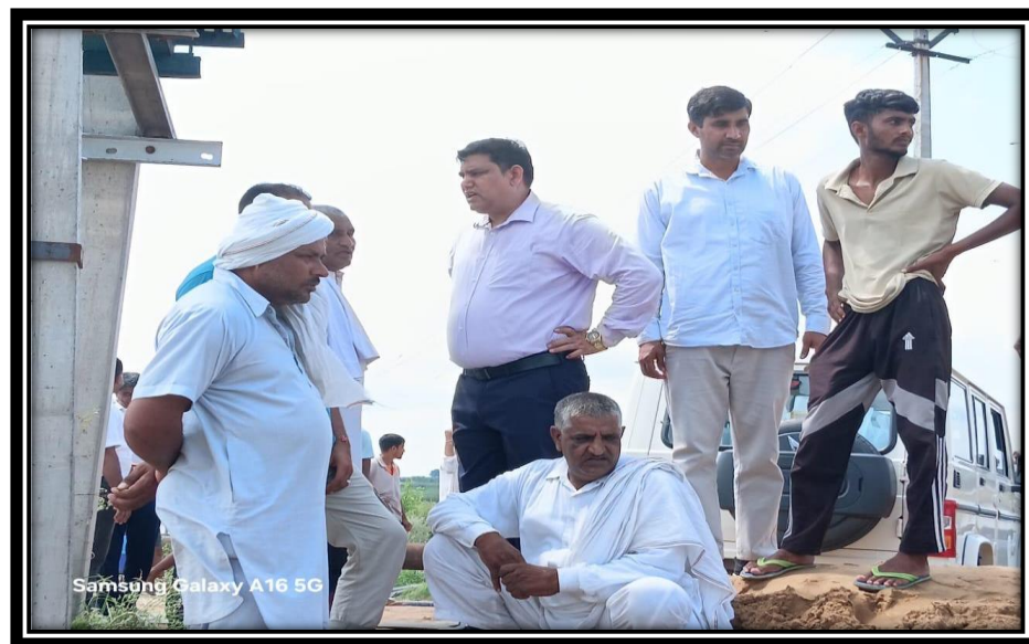
CJM-cum-Secretary, Bhiwani interacting with villagers at Bhiwani