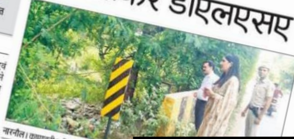
नारनौल। कृष्णावती नदी का दौरा करती सीजेएम ने गांवों का गहन निरीक्षण किया।