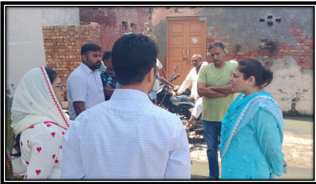
CJM-cum-Secretary, DLSA Rohtak interacting with victims