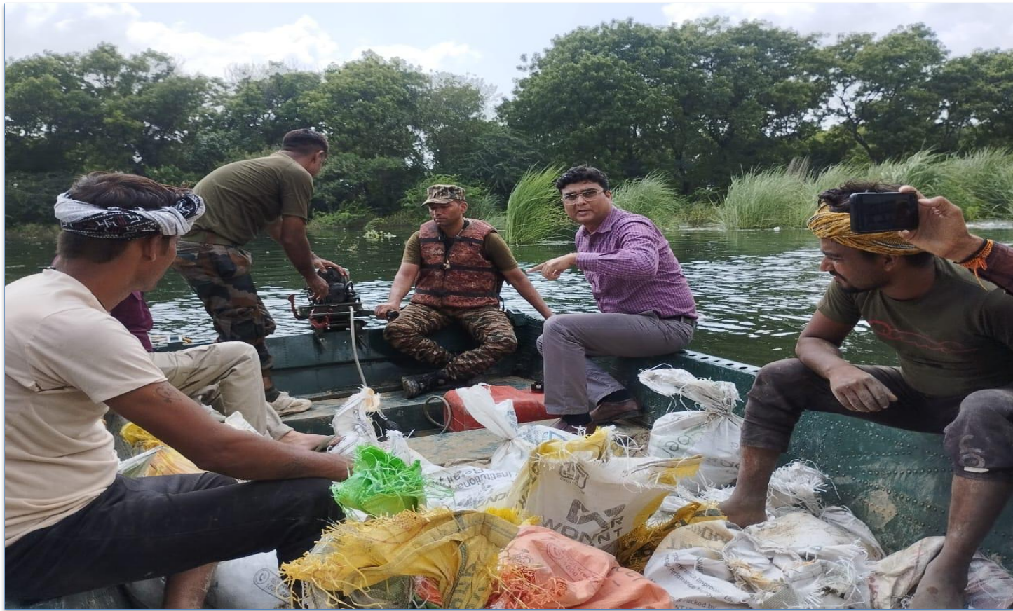
Ld. CJM-cum-Secretary, DLSA Jhajjar ensures embankment of flooded area alongwith locals.

It is being ensured by CJM-cum-Secretaries, DLSAs that no family left behind – supplies reaching remote corners.