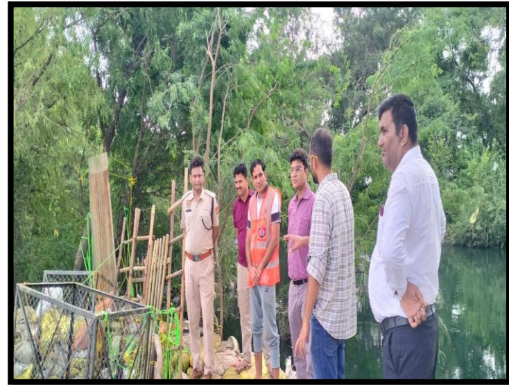
CJM-cum-Secretary, DLSA Jhajjar alongwith core team during a visit to Mungeshur Canal, Bahadurgarh.

These images capture the direct impact of the DLSAs' unwavering commitment, showcasing the human element of their tireless work on the ground.