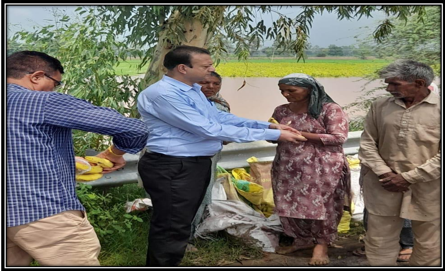
Ld. CJM-cum-Secretary, DLSA Sirsa while delivering food items to the villagers.

DLSAs are showing their Commitment and unity driving relief efforts in challenging times.