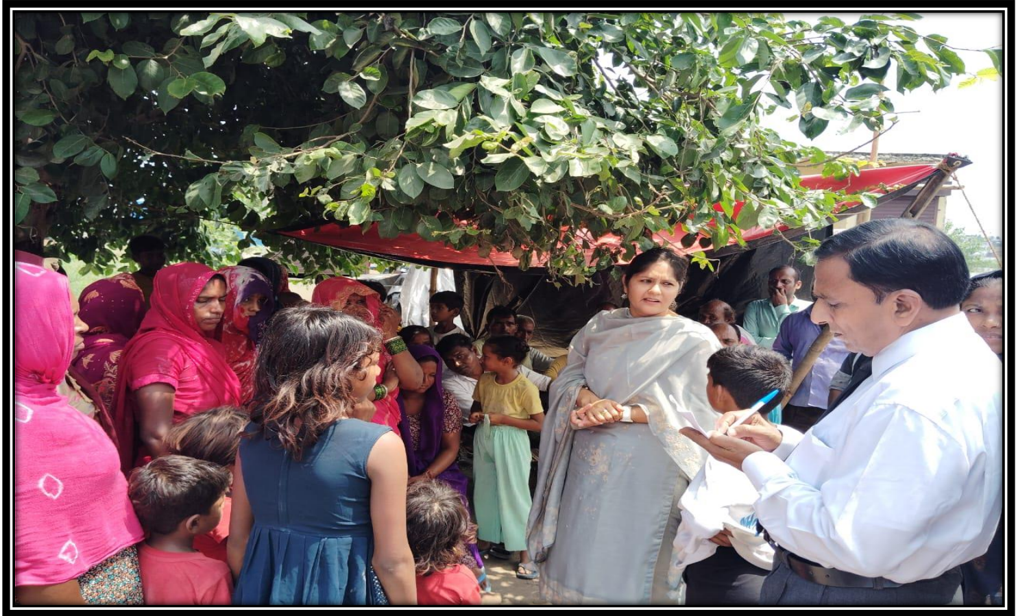
Ld. CJM-cum-Secretary, DLSA Faridabad ensuring children and women are at safe place and receive daily needs timely.