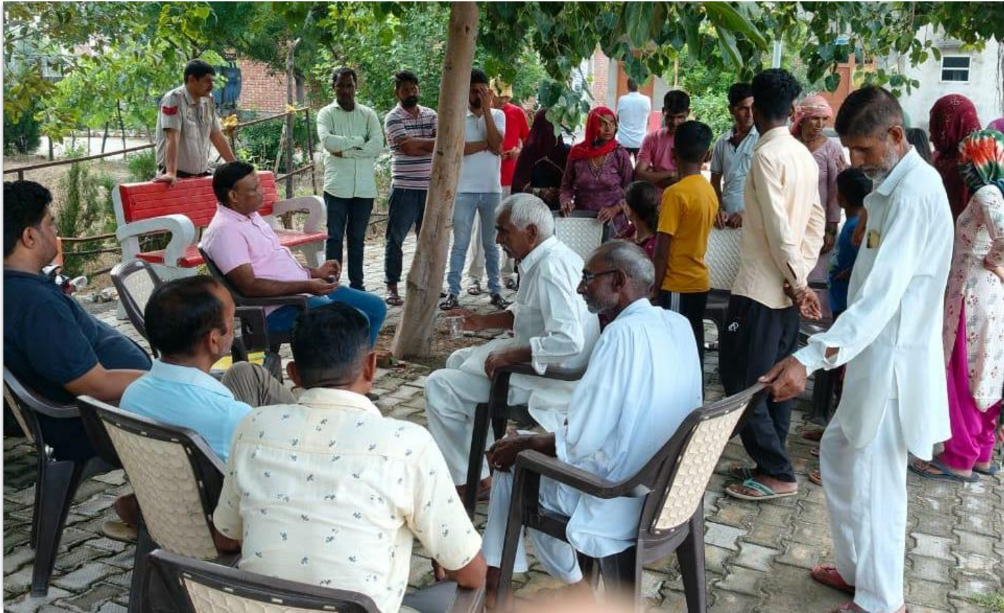
Ld. CJM-cum-Secretary, DLSA Hissar communicating and counselling villagers.