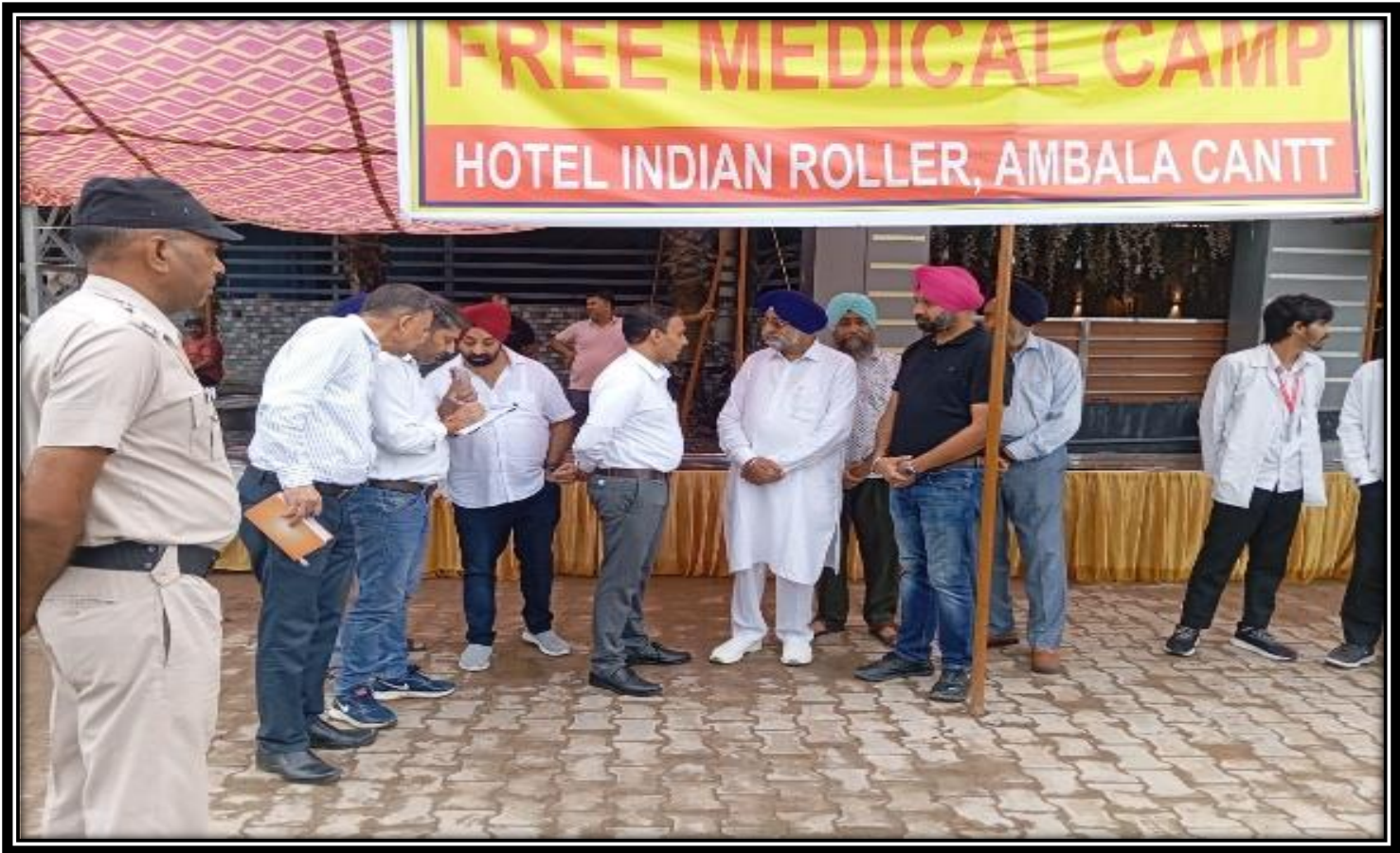
Ld. CJM-cum-Secretary, DLSA Ambala during a visit to health check camp organized for victims.

Special focus on children, women and elderly in ensuring health benefits.