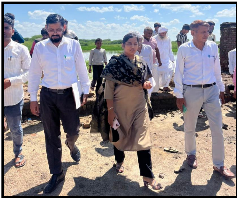
Ld. CJM-cum-Secretary, DLSA Mewat during a visit to affected areas of Mewat.

Recognizing the significant impact on agricultural communities, DLSA teams have focused on specialized support to help farmers navigate the recovery process.