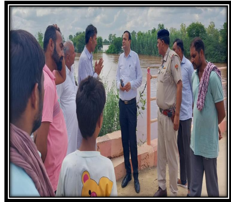
Ld. CJM-cum-Secretary, DLSA Sirsa at village Nesadella Kalan

Ld. CJM-cum-Secretaries ensured direct interaction with flood-affected families, understanding their specific challenges and helping them navigate the complexities of relief applications.