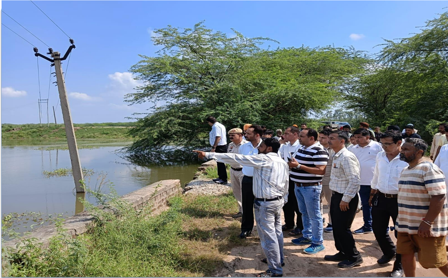
CJM-cum-Secretary, Kaithal while on a visit to affected area at Gulha

Secretaries, DLSAs are themselves monitoring relief distribution to maintain fairness and transparency.