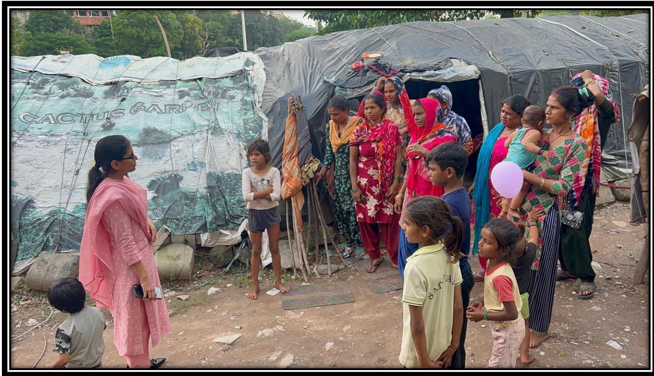
Ld. CJM-cum-Secretary, DLSA Panchkula interacting with residents of basti.