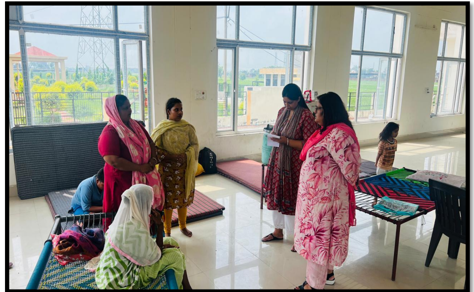
Ld. CJM-cum-Secretary, DLSA Kurukshetra on a visit to Shelter Home at Village Thaska Meeraji, District Kurukshetra.