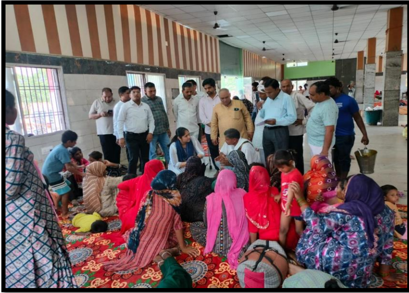
Ld. CJM-cum-Secretary, DLSA Faridabad interacting with victims at a Shelter Home.