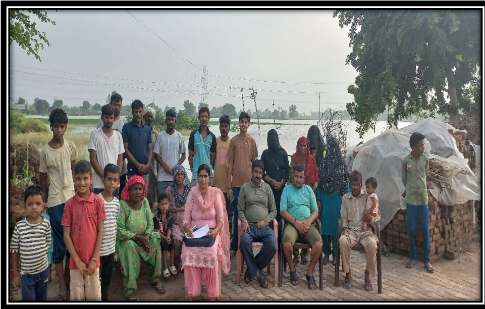
Awareness camp organised by DLSA Fatehabad