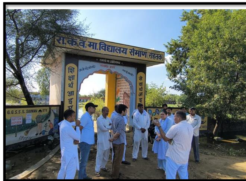
Ld. CJM-cum-Secretary, DLSA Rohtak during a visit at affected area (agricultural land) of Rohtak.