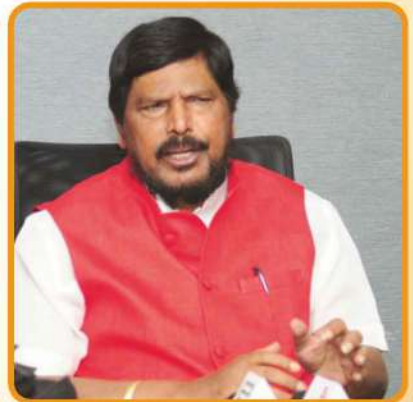
Shri Ramdas Athawale Minister of State of Social Justice & Empowerment