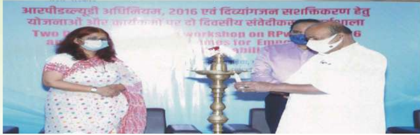
Two day workshop on RPwD Act 2016