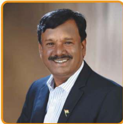
Shri A. Narayanaswamy Minister of State of Social Justice & Empowerment