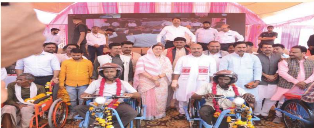
Distribution camp conducted on 25.03.2023 in the presence of Honble Union Minister of Social Justice and Empowerment at Datia, Madhya Pradesh.