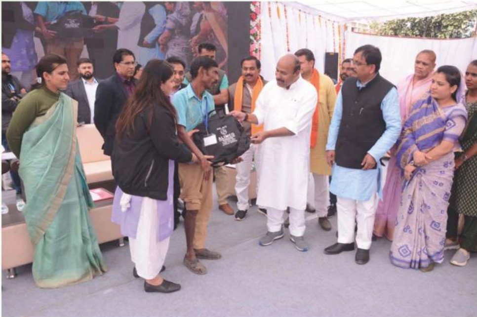
Distribution camp conducted on 14.01.2023 in the presence of Honble Union Minister of Social Justice and Empowerment at Jhabua, Madhya Pradesh.