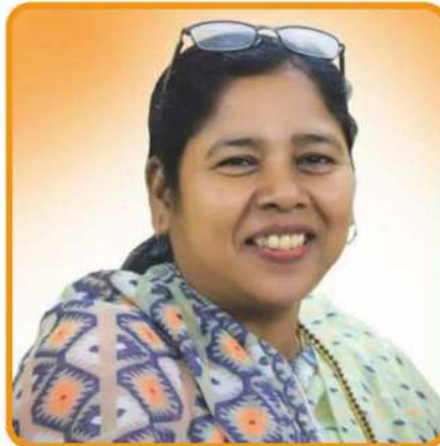
Km. Pratima Bhoumik Minister of State of Social Justice & Empowerment