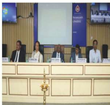
National Seminar on Building Legal Capacity/Capacity Building of Persons with Intellectual and Developmental