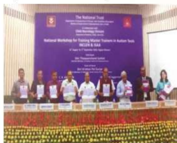
Training of Doctor’s on Evaluation and Assessment of Autism and procedure for Certification