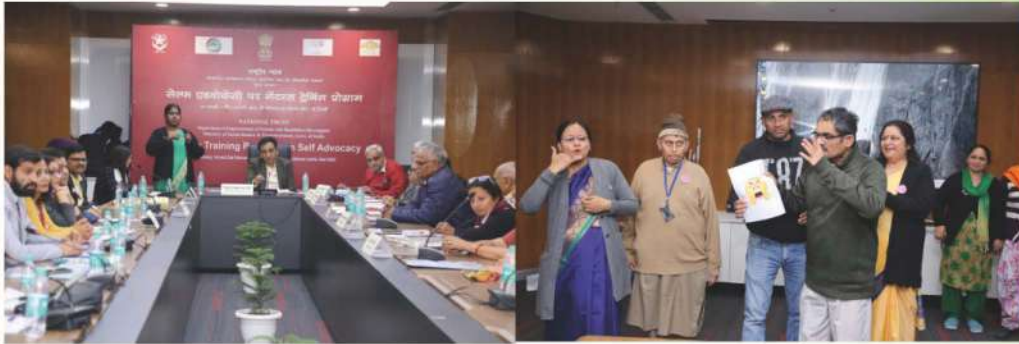
Training Program on Self Advocacy held on 31 st January 2023, 1 st and 2 nd in the presence of Secretary, DEPwD & Chairperson, National Trust

11. The National Trust for the Welfare of Persons with Autism, Cerebral Palsy, Mental Retardation (Intellectual Disability) and Multiple Disabilities, Department of Empowerment of Persons with Disabilities (DEPwD), Ministry of Social Justice & Empowerment organized a One day National Level Exhibition on ‘Talent and Scope of Persons with Intellectual and Developmental Disabilities (PwIDDs)’ at Dr. Ambedkar International Centre, New Delhi on 3 rd March 2023. The Exhibition was inaugurated by the Chairperson, National Trust and Secretary, DEPwD.