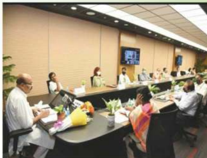
Hon'ble Minister, Social Justice and Empowerment addressing the National Convention on Digital Best Practices and North East Summit for PwIDDs on 7 th August, 2021

5. National Convention on Digital Best Practices and North East Summit inaugurated by Hon'ble Minister, MSJE on 7 th August, 2021 for Persons with Intellectual and Developmental Disabilities (PwIDDs).