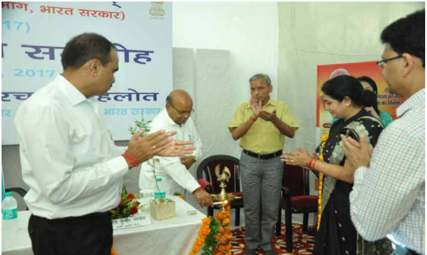
Hon'ble Dr. Thaawarchand Gehlot, Hon'ble Minister for Social Justice & Empowerment, Govt. of India Lighting the Lamp on the occasion of Silver Jubilee Celebration of Rehabilitation Council of India on 20 September, 2017 at RCI, New Delhi. Dr. Kamlesh Kumar Pandey, CCPD & Chairperson, RCI and Shri S.K. Srivastava, Member Secretary, RCI are also seen in the picture

The Council celebrated Silver Jubilee Foundation Day Celebration on 20th September, 2017. Hon'ble Minister for SJ&E was the Chief Guest on this auspicious occasion.