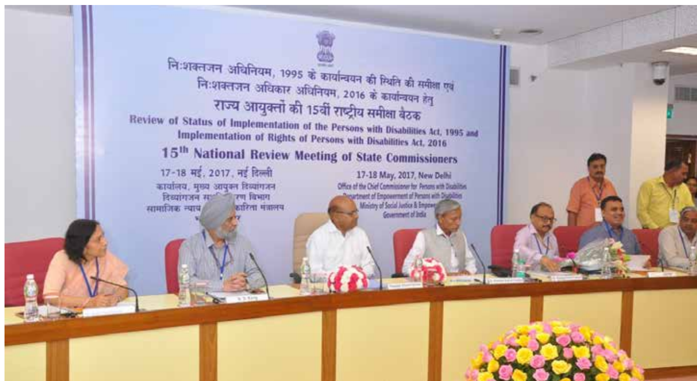
Hon. Minister, SJ&E inaugurated 15th National Review Meeting of State Commissioners organized by Office of CCPD on 17-18 May, 2017