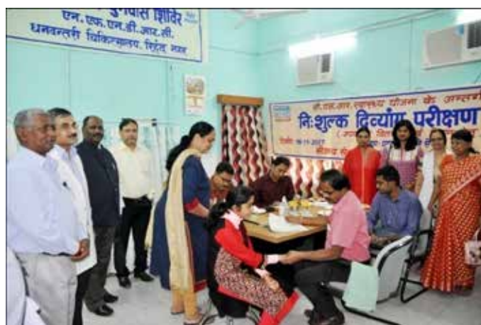
Sensitization Programme at Identification Camp at NFNDRC, Rihand