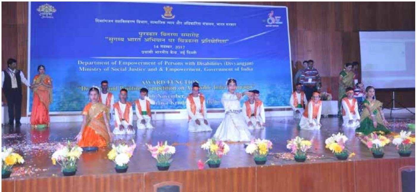
Cultural performance being made by the Persons with Disabilities at the Award function held on 14.11.2017 at the Pravasi Bhartiya Kendra for felicitation of the winners of the Drawing and Painting Competition organised on 02.11.2017 at the National BalBhawan, New Delhi