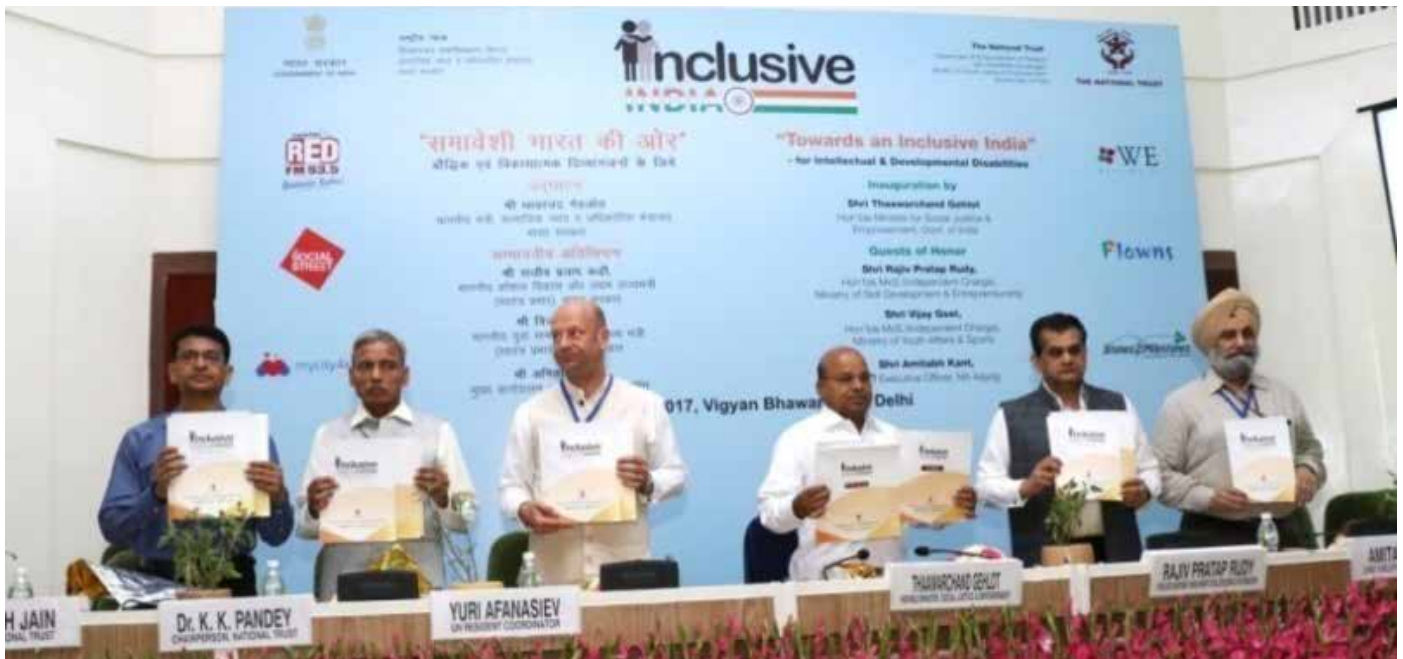
Release of Vision document of the Inclusive India Initiative released by Dr. Thaawarchand Gehlot, Union Minister for Social Justice and Empowerment in presence of Shri Rajiv Pratap Rudy, the then Minister of State (Independent Charge) for Skill Development and Entrepreneurship, Shri Vijay Goel, Minister of State (Independent Charge) for Youth Affairs & Sports and Shri Amitabh Kant, CEO, Niti Aayog.