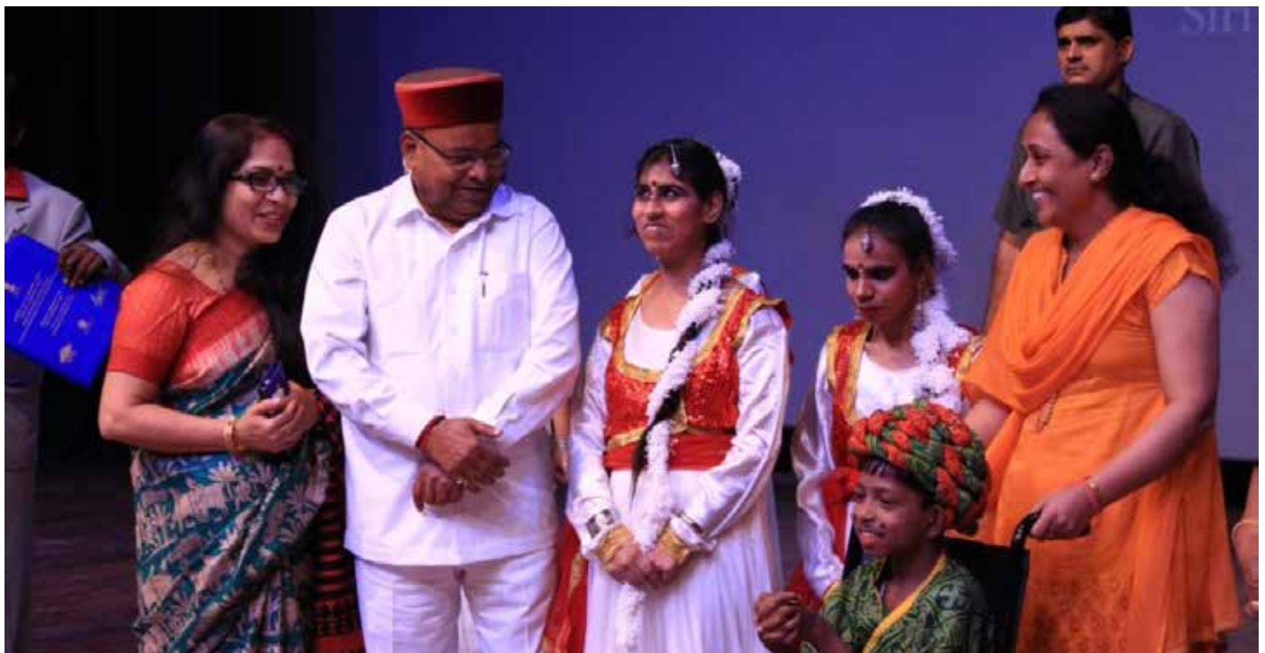
Dr. Thawarchand Gehlot with the Persons with Disabilities who participated in the cultural dance performance on 09.11.2017 during the Award function at the Siri Fort Auditorium, New Delhi.