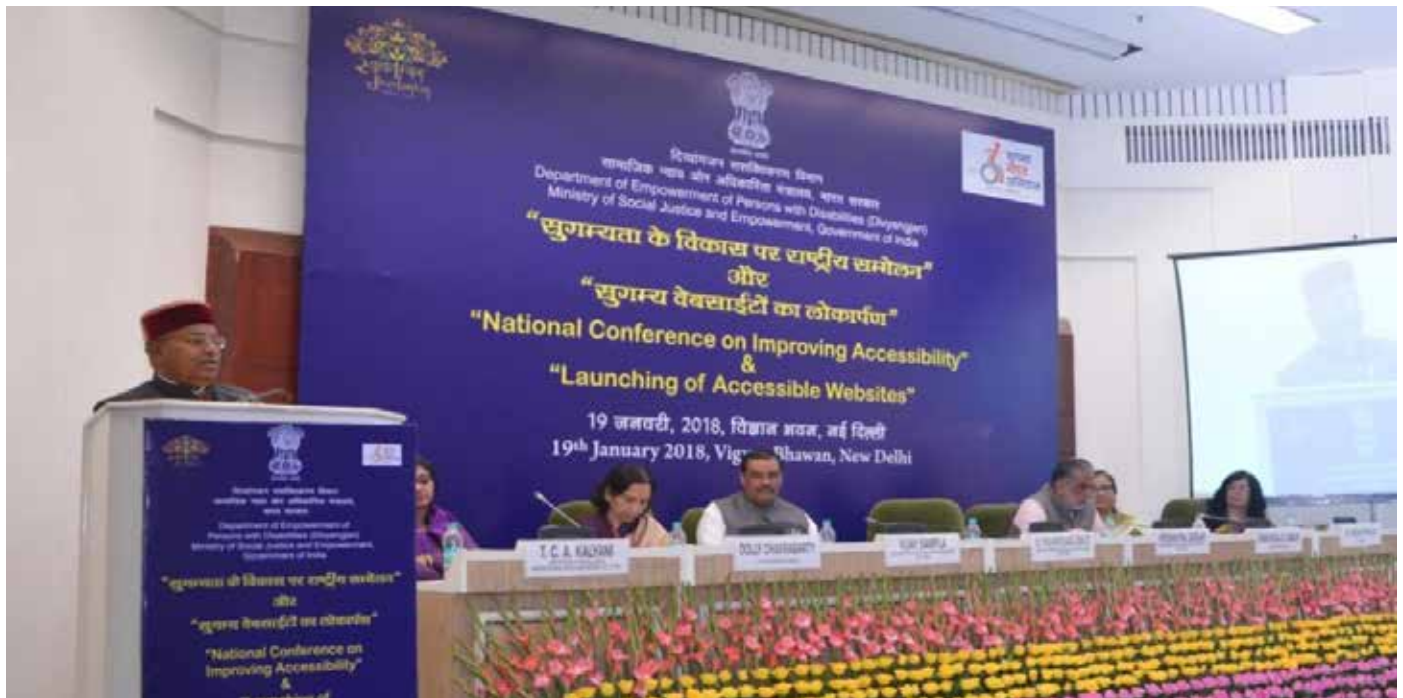
Dr. Thaawarchand Gehlot launched the 100 accessible websites of various State Governments/UTs under Accessible India Campaign at Vigyan Bhawan, New Delhi on 19th January, 2018 on the occasion of ‘National Conference on Improving Accessibility’.