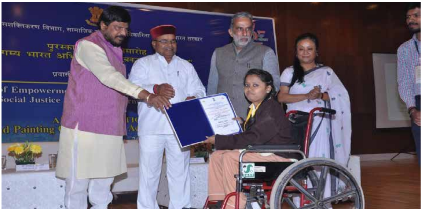
A student with Disabilities receiving award from Dr. Thawarchand Gehlot, Hon'ble Minister of Social Justice and Empowerment on 14.11.2017 at the Pravasi Bhartiya Kendra during felicitation of the winners of the Drawing and Painting Competition organised on 02.11.2017 at the National Bal Bhawan, New Delhi