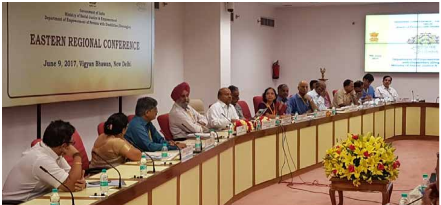
Eastern Regional Conference chaired by Hon. Minister, SJ&E was organized at New Delhi on 09.06.2017 to review the implementation of schemes and programmes of the Department in respect of States of Eastern Region – Assam, Arunachal Pradesh, Meghalaya, Manipur, Mizoram, Nagaland, Odisha, Sikkim, Tripura and West Bengal.