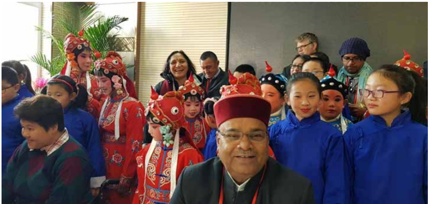
Hon'ble Minister Dr. Thaawarchand Gehlot interacted with children of Special School in Beijing during the visit to Beijing, China.