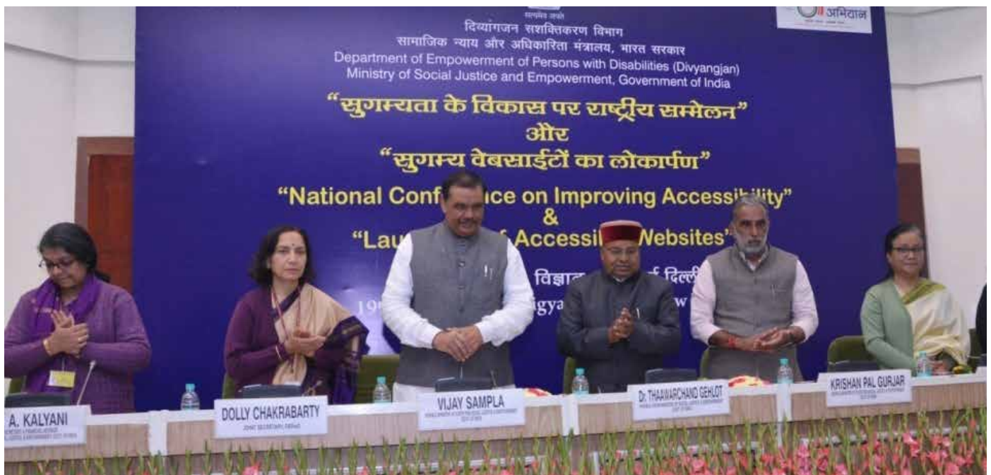
Delegates including the State secretaries, representatives of Central Governments, State Disability Commissioners, representatives of Civil society, etc from various parts of the country attended the National Conference on Improving Accessibility held at the Vigyan Bhawan on 19.01.2018