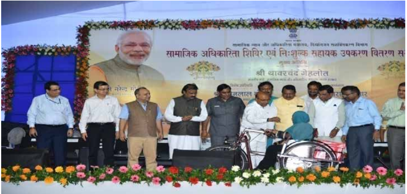
Mega Distribution Camp for providing Aids and Assistive Devices to Divyangjan under ADIP scheme of Govt. of India organised by ALIMCO in Ahmedabad, Gujarat on 27.08.2017.