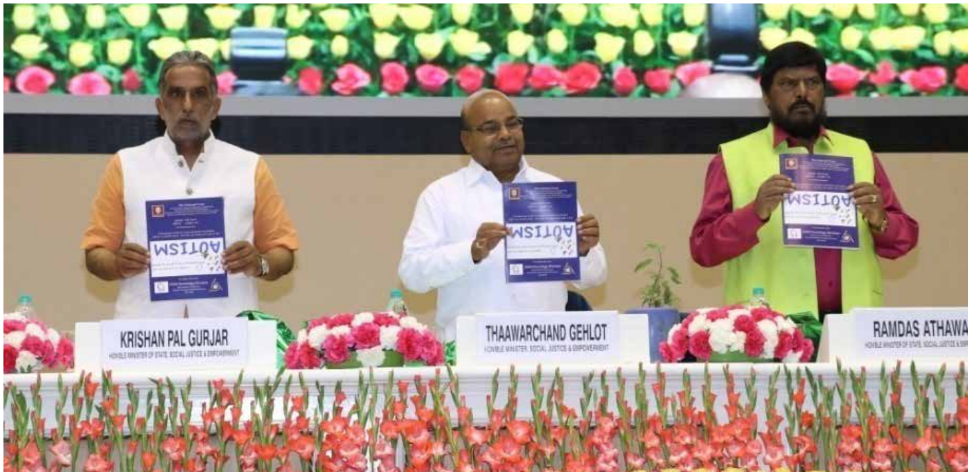
Release of booklets on Autism by Dr. Thaawarchand Gehlot, Hon'ble Minister, Social Justice & Empowerment in presence of Shri Ramdas Athawale and Shri Krishan Pal Gurjar, Ministers of State, Social Justice & Empowerment on 03-04-2017 in New Delhi