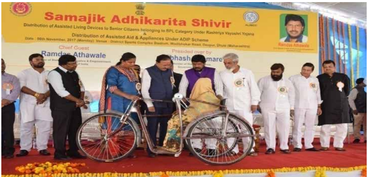
Hon'ble Union MoS for Social Justice & Empowerment Shri Ramdas Athawale & Hon'ble Union MoS for Defence distributing assisted aids & appliances under ADIP & Rastriya Vayoshri Yojana scheme in Dhule, Maharashtra on 06.11.2017.