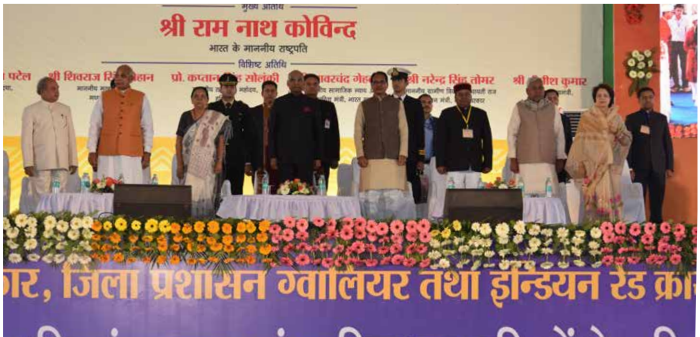
His Excellency, President of India, Shri Ramnath Kovind at an ADIP distribution programme at Gwalior on 11 February 2018