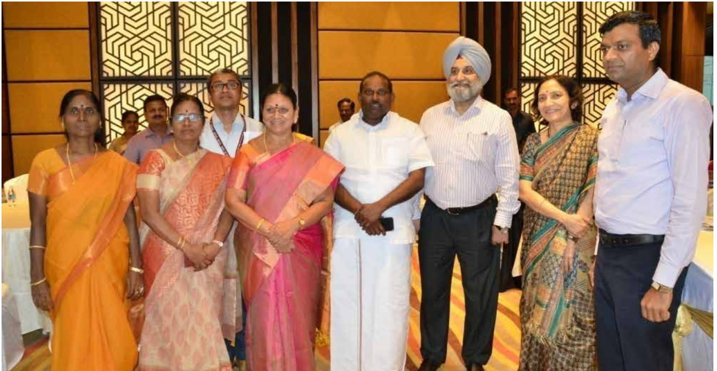
Southern Regional Conference chaired by Secretary, DEPwD was organized at Chennai on 12.5.2017 to review the implementation of schemes and programmes of the Department in respect of States/UTs of Southern Region – Tamil Nadu, Andhra Pradesh, Karnataka, Kerala, Telangana, Andaman & Nicobar Islands, Lakshadweep & Puducherry.