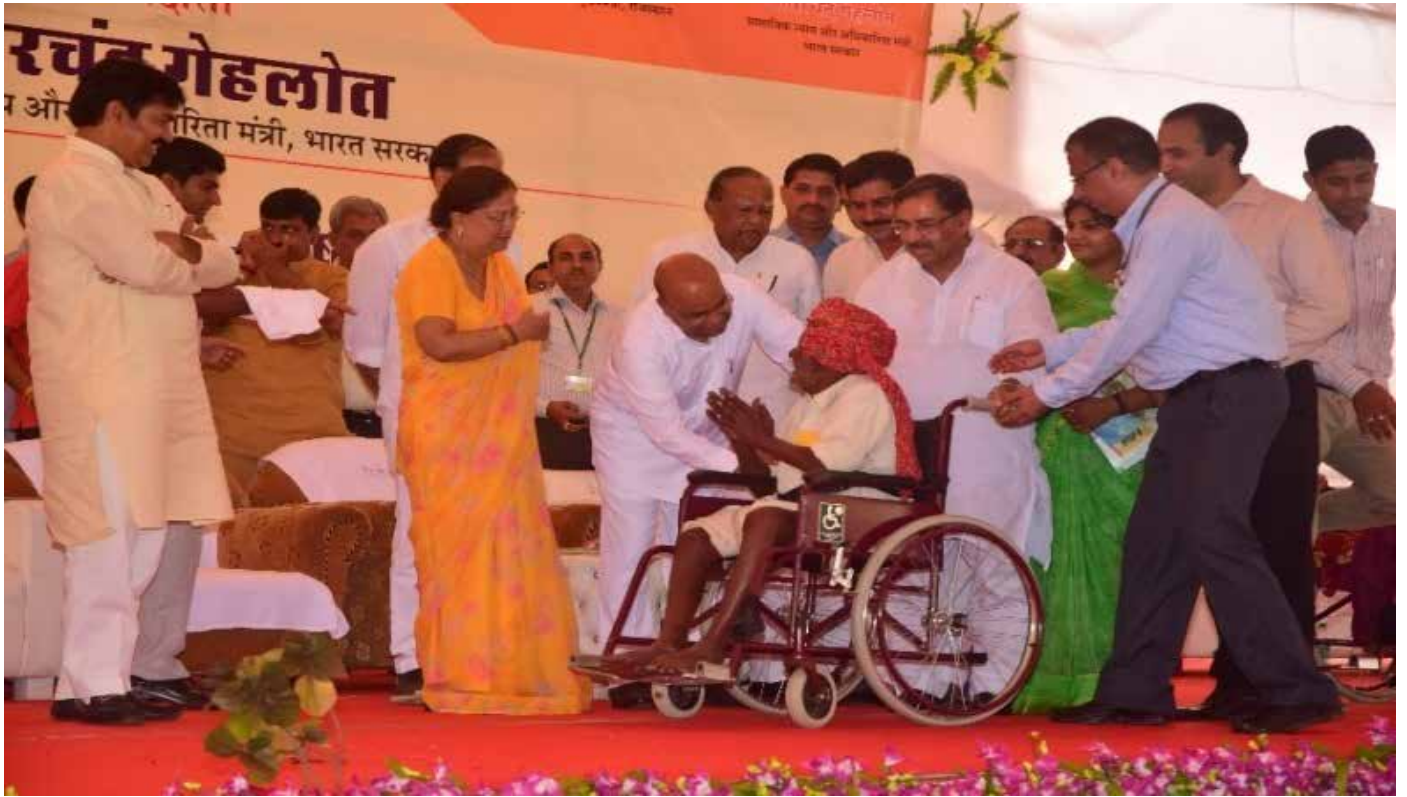
Hon'ble Smt. Vasundhara Raje, Chief Minister of Rajasthan and Dr. Thaawarchand Gehlot, Hon'ble Union Minister for Social Justice and Empowerment, distributed Aids and Assisted devices to Sr. Citizens of BPL Category at Jhalawar, Rajasthan on 17.09.2017 under the Rashtriya Vayoshri Yojana.