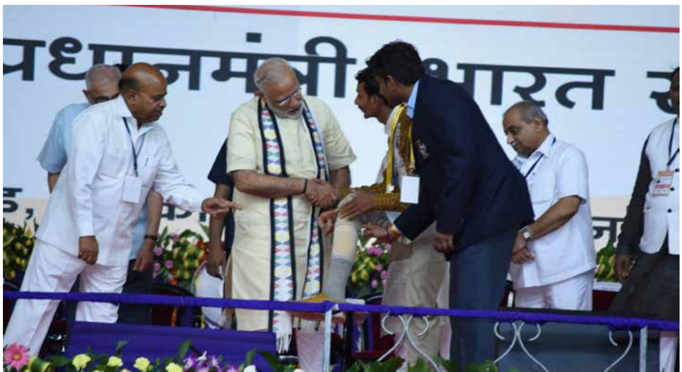
Hon'ble Prime Minister Shri Narendra Modi interacting with beneficiary during an ADIP distribution camp at Rajkot on 29 June, 2017