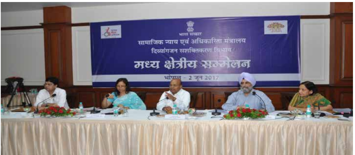
Central Regional Conference chaired by Hon. Minister, SJ&E was organized at Bhopal on 02.06.2017 to review the implementation of schemes and programmes of the Department in respect of States of Central Region – Madhya Pradesh, Uttar Pradesh, Chhattisgarh, Bihar & Jharkhand.