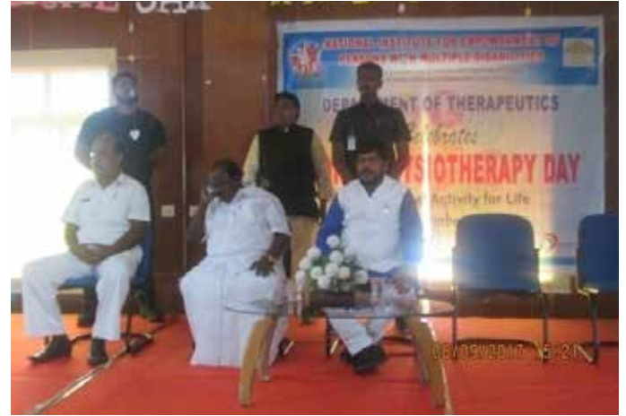
Shri. Ramdas Athawale, Hon'ble Minister of State for Social Justice & Empowerment, Govt. of India inaugurated the World Physiotherapy Day on 8th September 2017 at NIEPMD, Chennai.