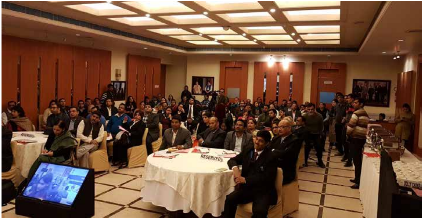
Participants from Private Sector, Disability Rights Activists, NGOs, Access Auditors etc. in the workshop on 'Accessibility & Inclusion at Workplace: Rights of Persons with Disabilities Act, 2016' at Federation House, FICCI, New Delhi on 08.12.2017.