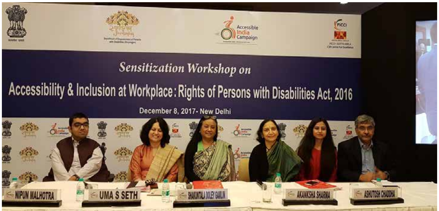
Sensitization Workshop on 'Accessibility & Inclusion at Workplace: Rights of Persons with Disabilities Act, 2016' in collaboration with FICCI at Federation House, New Delhi on 08.12.2017.