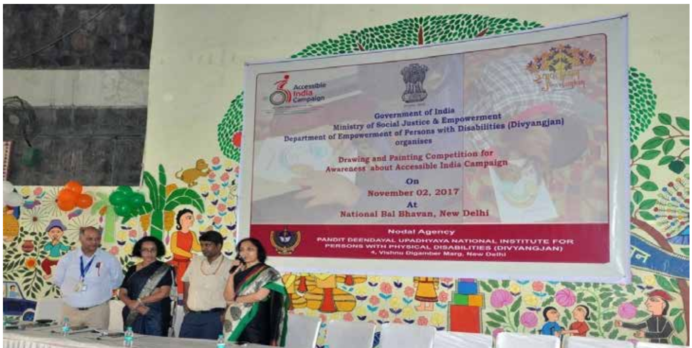
Inauguration of Drawing and Painting Competition organized by the Department on 02.11.2017 at the National Bal Bhawan, New Delhi