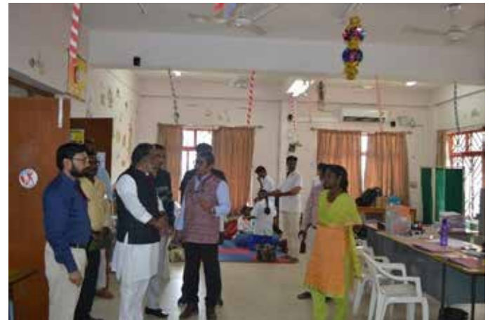
Shri. Krishan Pal Gurjar, Minister of State for Social Justice & Empowerment, Govt. of India visit of NIEPMD on 26th December 2017