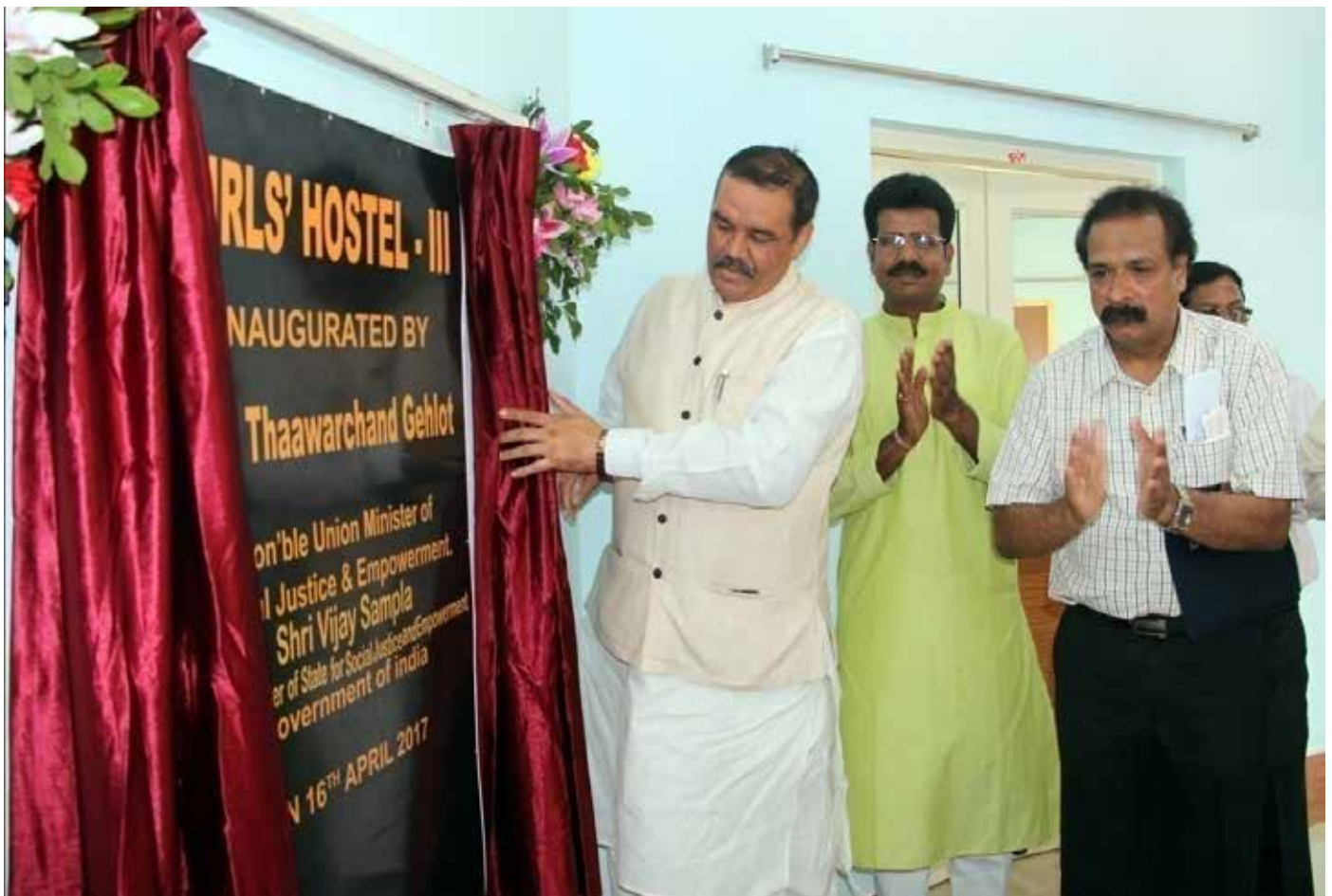
Hon'ble Minister of State for SJ&E, Govt. of India Shri Vijay Sampla inaugurating the Girls' Hostel during the visit to SVNRTAR, Chttack on 16.04.2017

to multiple and diverse disabilities, under one roof. Today, it is fully-equipped and functional to provide rehabilitative and educational services to all types of disabilities. Located at Old Hospital Campus Rajnandgaon, CRC offers end-to-end solutions for the Divyangjan in Chhattisgarh. With services that range from the academic to clinical, it continues to be committed to further the cause of the Divyangjan. Persons having different disabilities, served by CRC, include persons with locomotor disabilities, Blindness, Low-vision, Hearing Impairment, Mental Retardation, Mental Illness, Leprosy Cured, Cerebral Palsy, Autism Spectrum Disorder, and Multiply Disabled of all ages.