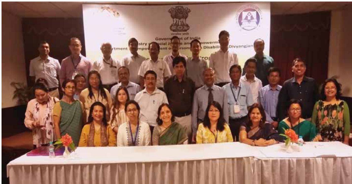
State level Training on UDID project in West Bengal and North East States (except Tripura) held at Guwahati, Assam on 21.08.2017.