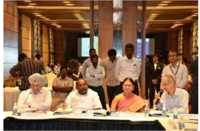
Regional conference of States/ UTs – Souther Region on meeting the needs of Individuals with disabilities as the provisions of the Rights of Persons with Disabilities Act 2016 at Residency Towers, Chennai on 12th May 2017