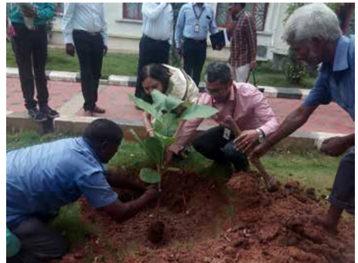
Swachh Bharat Tree plantation by program on 9th May 2017 at NIEPMD, Chennai