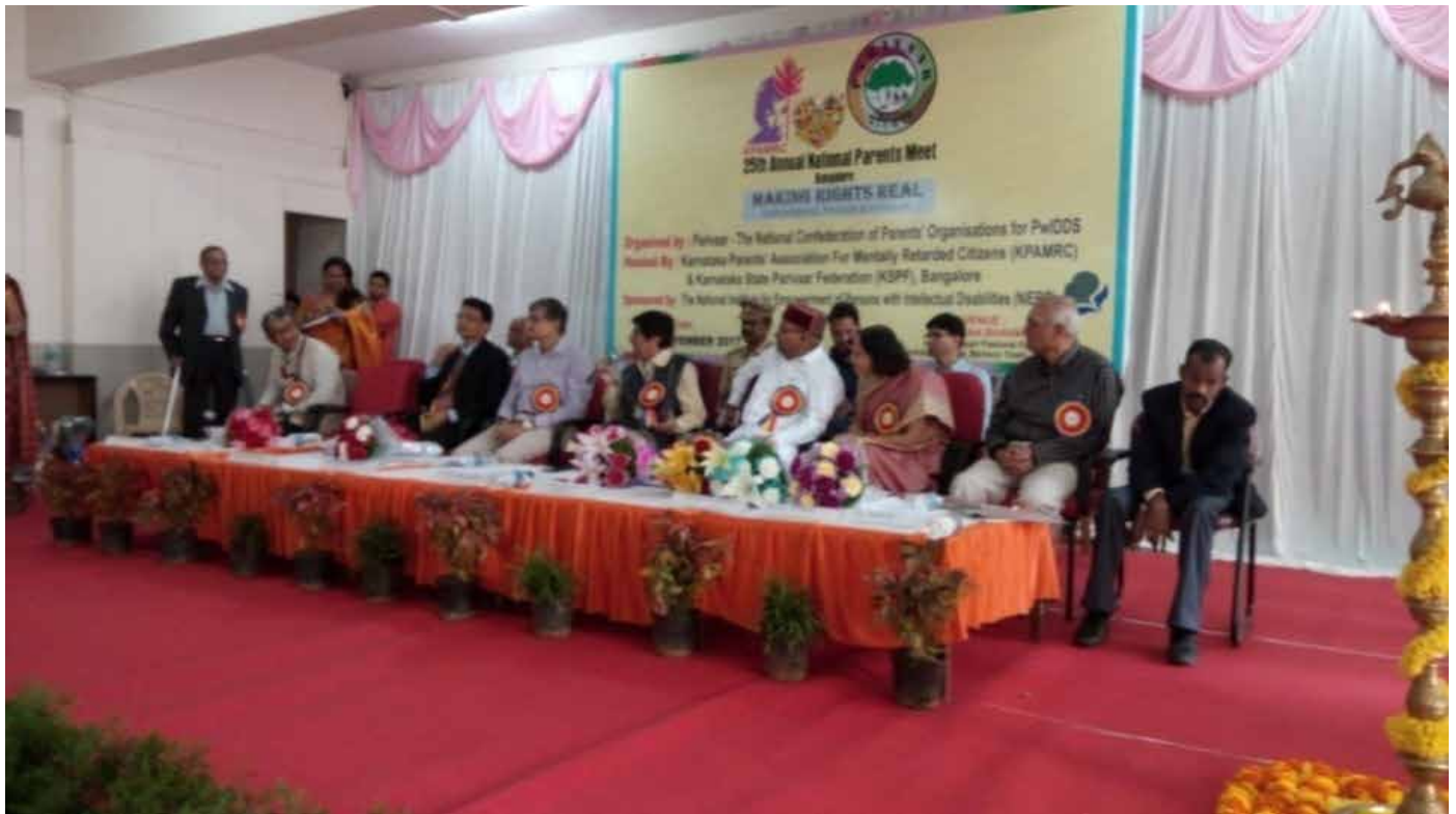
Hon'ble Minister Dr.Thaaawarchand Gehlot and other dignitaries at the inauguration of National Parent Meet organised by NIEPID at Bangalore on 11th November, 2017