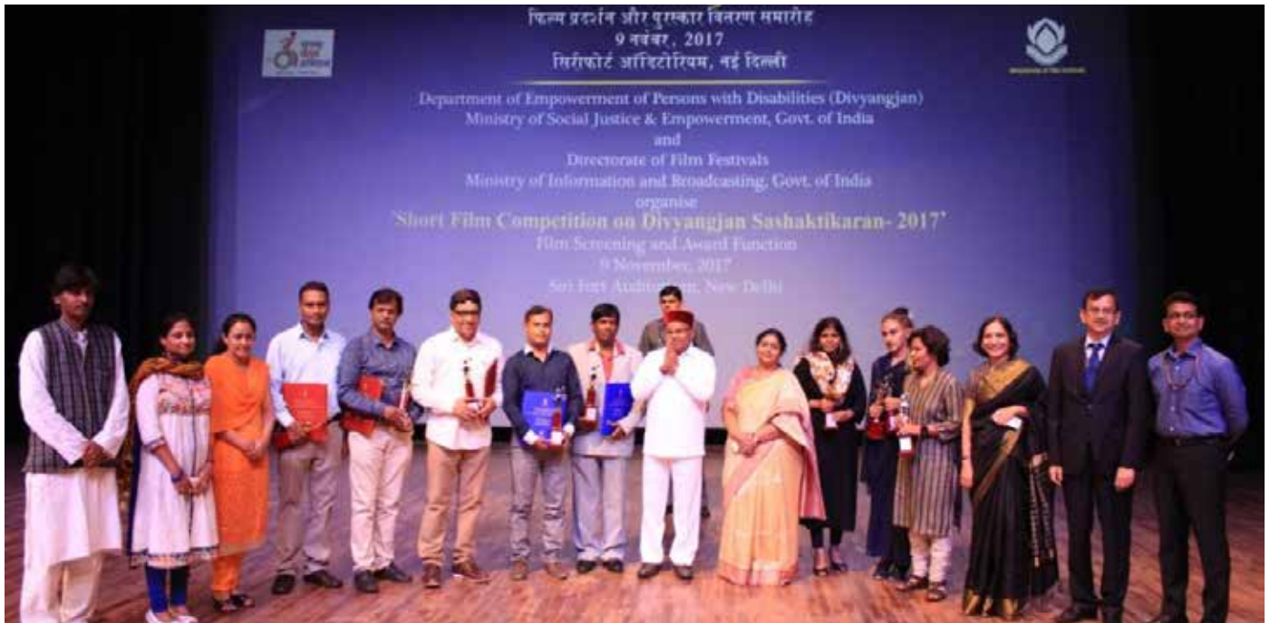
DEPWD organised a 'Short Film Competition on Divyangjan Sashaktikaran-2017' in association with Directorate of Film Festivals (DFF), Ministry of Information & Broadcasting, Govt. of India and awarded the winners in a function held on 09.11.2017 at the Siri Fort Auditorium, New Delhi