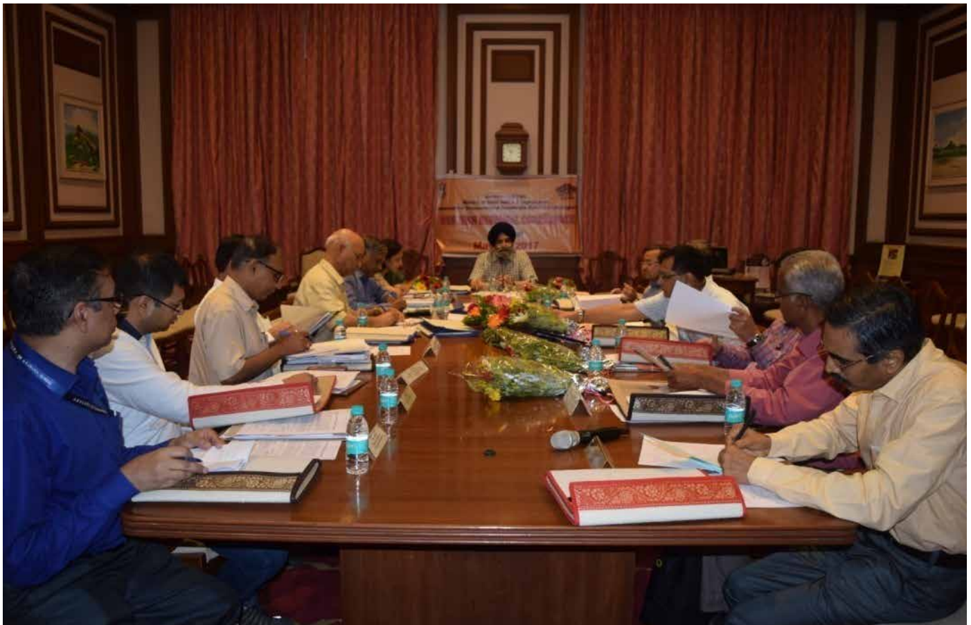
Western Regional Conference chaired by Secretary, DEPwD was organized at Mumbai on 11.5.2017 to review the implementation of schemes and programmes of the Department in respect of States of Western Region – Maharashtra, Gujarat, Rajasthan, Goa, Dadra & Nagar Haveli and Daman & Diu