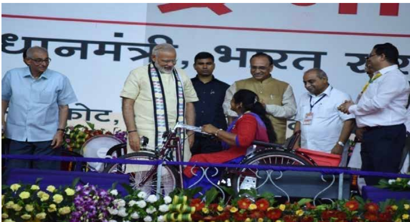
A beneficiary of Motorized Tricycle with Hon'ble Prime Minister, Shri Narendra Modi during the camp held at Rajkot, Gujarat on 29.06.2017.

Biggest ever Samajik Adhikarita Shivir held on 29.06.2017 at Rajkot, Gujarat where aids and assistive devices worth Rs. 11.19 Crore were distributed among 17589 Divyang beneficiaries. Hon'ble Prime Minister Shri Narendra Modi graced the occasion as Chief Guest.