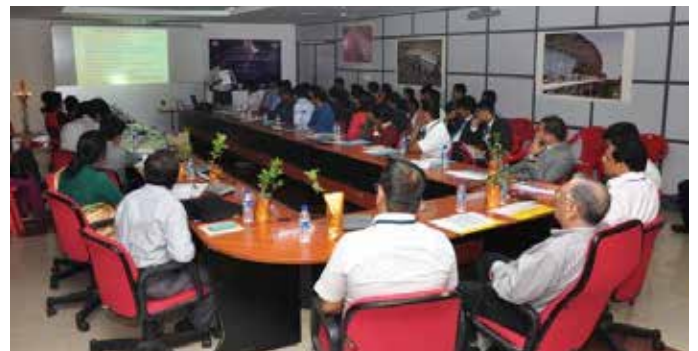
Workshop on "Soft Skill Training Workshop on Handling Individuals with Disabilities" 11th - 12th December 2017 and 13th - 14th December 2017 at NIEPMD, Chennai