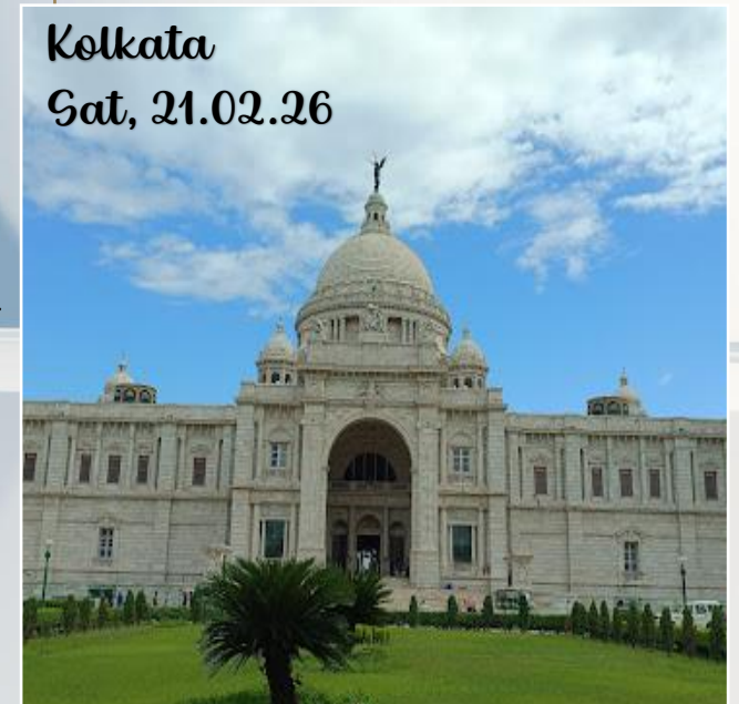
Kolkata Sat, 21.02.26

Association of Corporate Advisers and Executives (ACAE), Kolkata