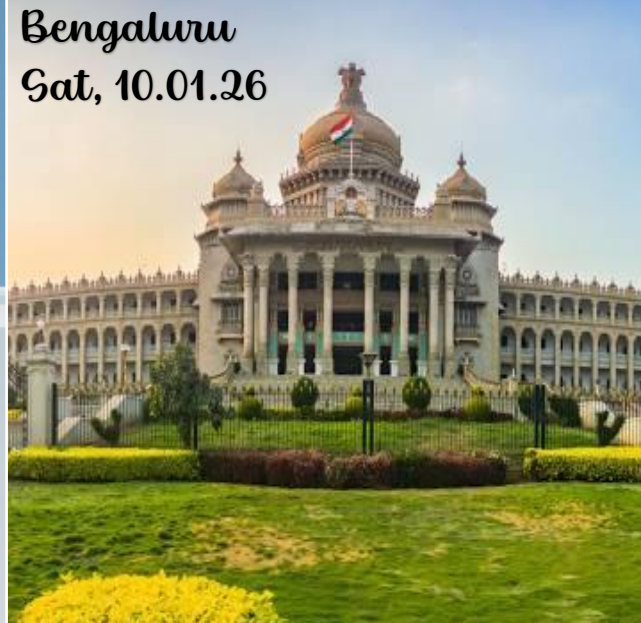
Bengaluru Sat, 10.01.26

Karnataka State Chartered Accountants Association (KSCAA), Bengaluru