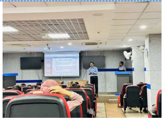
Network & Security Session