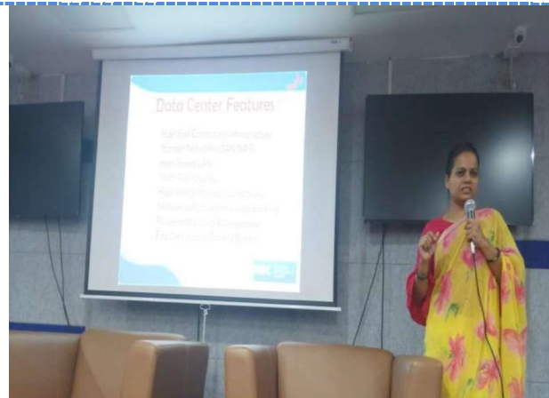
Data Centre Session