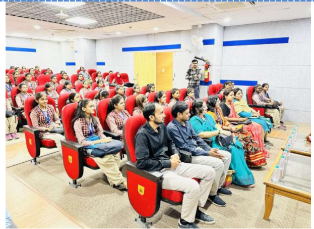
Participants During the Session