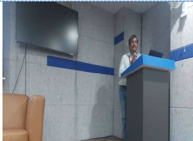
NIC Real Time Working Session