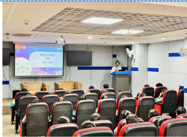
Extended Warm Welcome to Students