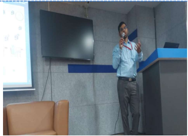
Web Technologies Session