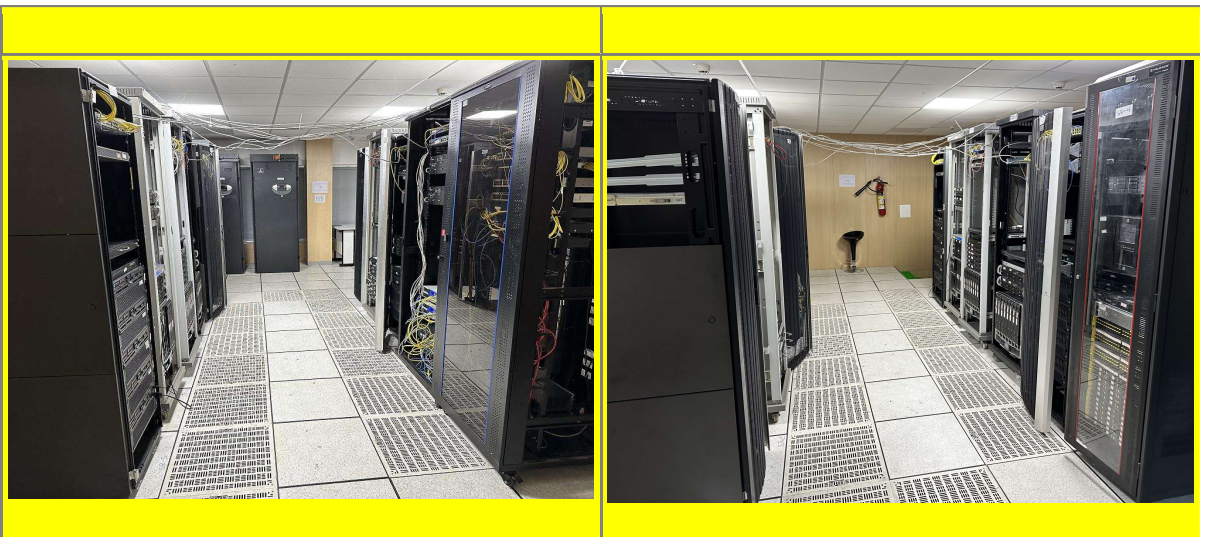
D. IDC Operational @ Satpura Bhawan