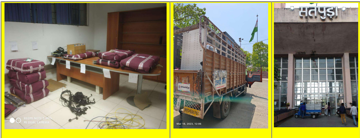
B. Packing & Transportation