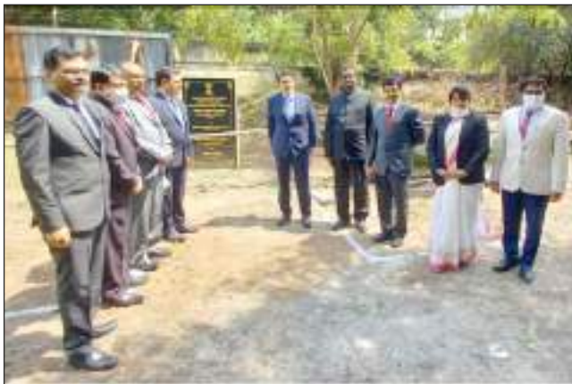
(Hon'ble Shri. Justice P.B.Varale, Judge Bombay High Court and Guardian Judge of Judicial District Aurangabad while delivering speech.)

(Hon'ble Shri. Justice A.A.Sayed, Judge Bombay High Court and Executive Chairman, MSLSA, Mumbai visit ADR Centre at Aurangabad, Hon'ble Shri. Justice P.B.Varale, Judge Bombay High Court and Guardian Judge of Judicial District Aurangabad, Hon'ble Shri. Justice B.U.Debadwar, Judge Bombay High Court and Guardian Judge of Judicial District Aurangabad present over there )