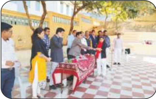
Constitution day Play to be held on 16/01/2020 at Shroff High School at Nandurbar in the presence of Hon'ble Principal District and Sessions Judge, Nandurbar.