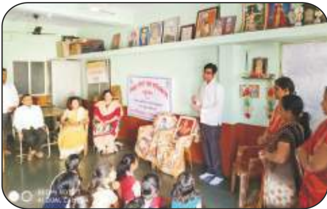
Womens day to be held on 08/03/2020 at Juvenile Justice Board, Nandurbar.