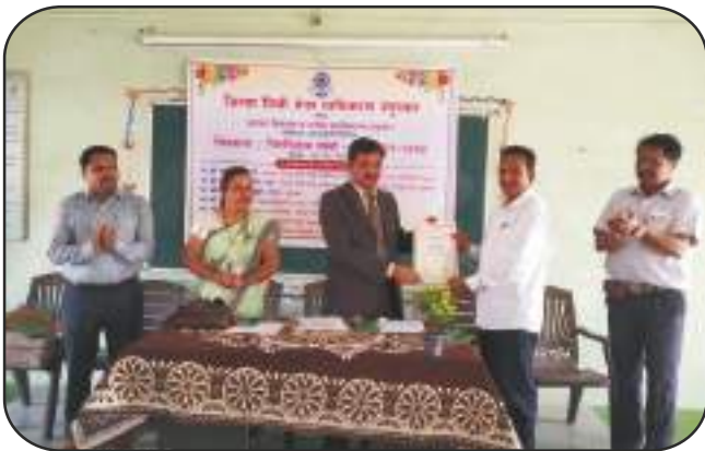
Constitution day Drawing competition to be organised at Yashwant Vidyalaya Nandurbar, on 29/02/2020