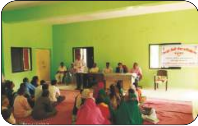
Legal Awareness programme on 11/02/2020 on the subject of PC and PNDT Act.