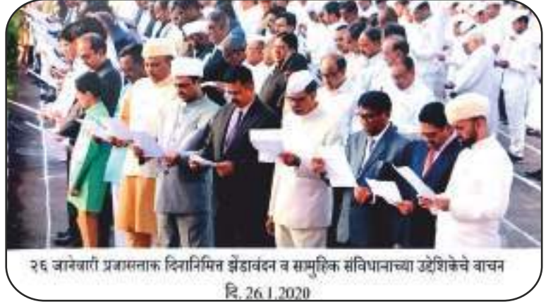
२६ जानेवारी प्रजासत्ताक दिनानिमित्त झेंडावंदन व सार्वजनिक संविधानाच्या उद्देशिकेचे वाचन दि. 26.1.2020

Note : Programme organised was on dt.15.01.2020 for the aware of importance of Marathi Language. In the programme approximately 40 persons were presented.