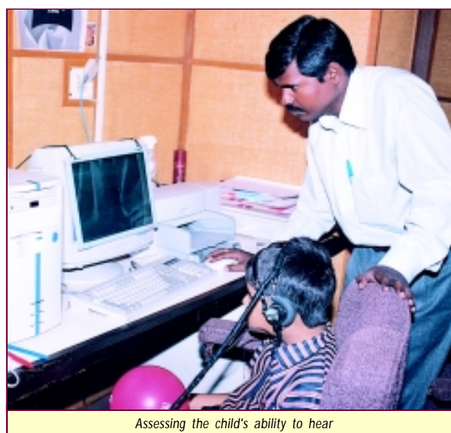
Assessing the child's ability to hear

Delayed development of speech and language is one of the features of mental retardation. Many children also present a variety of hearing defects. Those clients requiring services are taken up for detailed assessment. Speech and language intervention package is developed according to the individual needs of the child. Parents are guided to carry out intervention at home under the advice of the professionals.