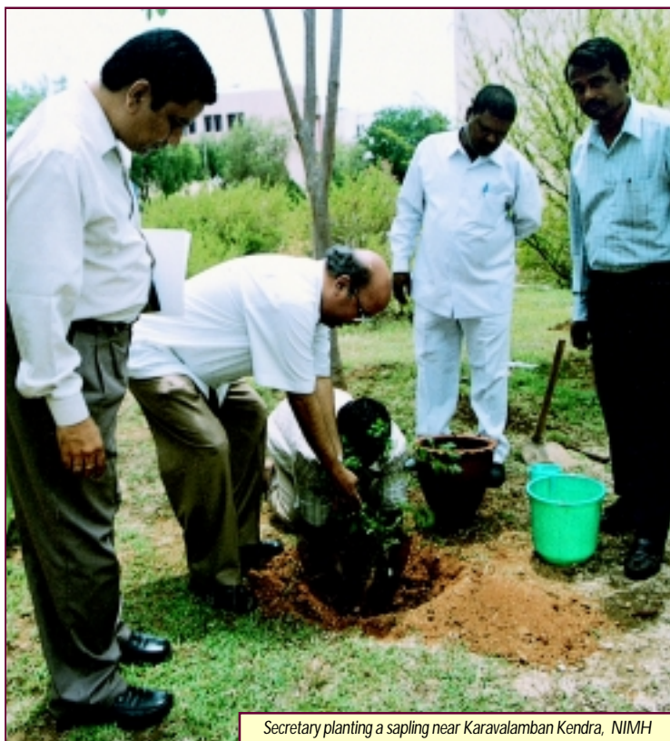
Secretary planting a sapling near Karavalamban Kendra, NIMH