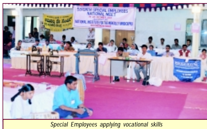
Special Employees applying vocational skills