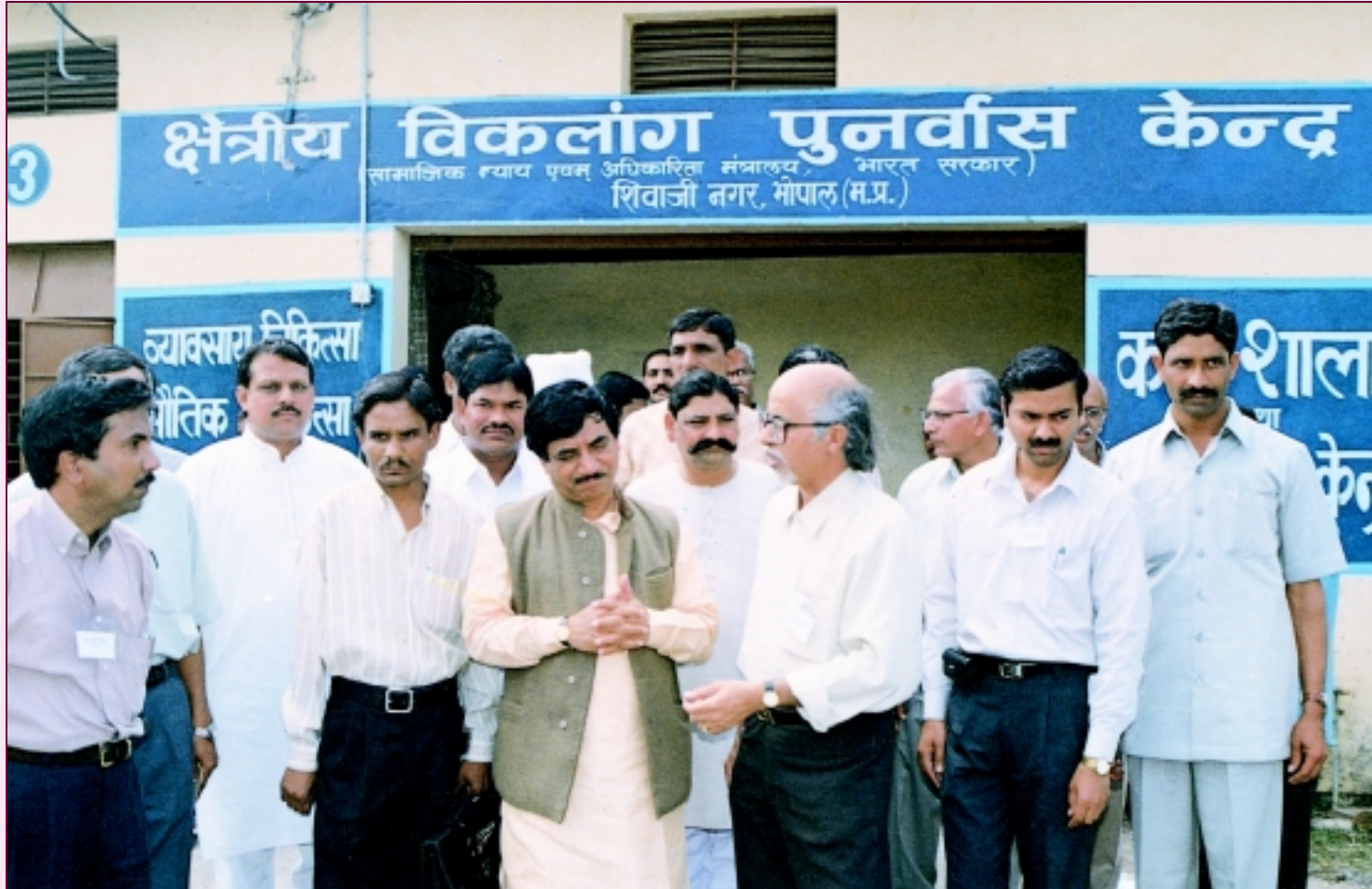
Visit of Hon'ble Minister Dr. Satyanarayan Jatiya to CRC, Bhopal