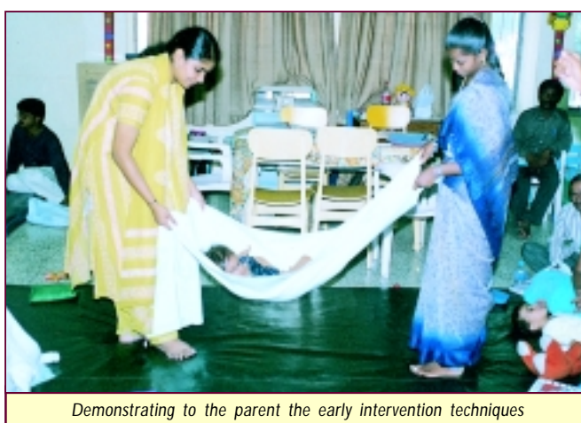
Demonstrating to the parent the early intervention techniques

Infants and toddlers with suspected or at-risk of delayed development in the age group of 0-3 years are provided services of early intervention which constitute nearly one third of total number of clients seen in general services. These services are provided by a multi-disciplinary team of experts. The parents are given guidance regarding immunization, nutrition, feeding, sensory-motor development, speech and language development and psycho-social interventions.