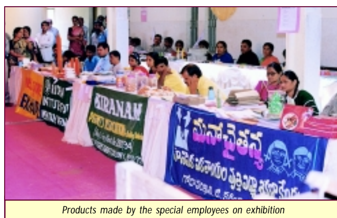
Products made by the special employees on exhibition