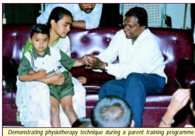
Demonstrating physiotherapy technique during a parent training programme

The objective of this programme is to involve the parents in the care, management and training of their children, encourage mutual support amongst parents and exchange ideas and information. 87 parent training programmes benefiting 4,307 parents were conducted during the year under report. Details of the programmes are given in Annexure III.