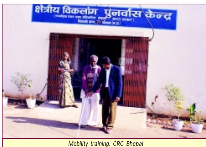
Mobility training, CRC Bhopal