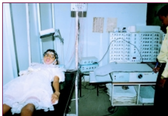
Recording EEG of a child with seizure disorder

Clients with mental retardation with associated medical conditions such as epilepsy, hyperkinetic behaviour, upper respiratory tract infections, nutritional problems are provided with drugs and related medical advice. The Institute has in-house experts in paediatrics and psychiatry. When necessary, clients are referred to outside experts. Medicines are provided free of cost to the families with low income.