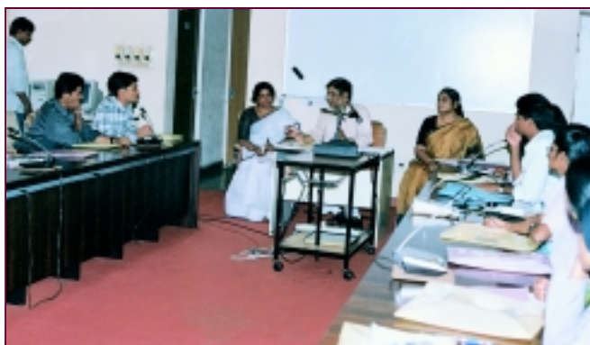
Director interacting with the participants during a vocational training programme

The Institute during the year conducted 193 short term training programmes covering 10711 beneficiaries, as per the details given in Annexure-II.