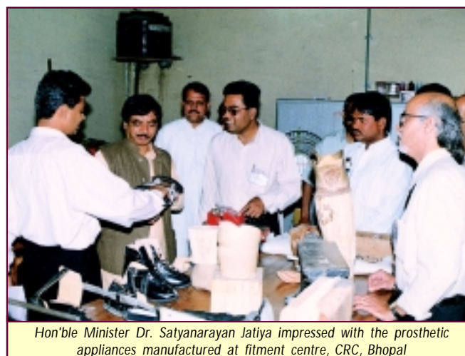
Hon'ble Minister Dr. Satyanarayan Jatiya impressed with the prosthetic appliances manufactured at fitment centre, CRC, Bhopal

Presently the centre is housed in four temporary sheds having 7,500 sq.ft. of area with three play areas namely sensory park, children play park and simulated village park. The centre established fully in November, 2000 is presently, offering the following services: