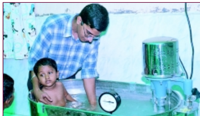
A practical session in hydrotherapy for the students

This course of 4 years' duration is affiliated to Osmania University and prepares professionals to be able to provide comprehensive services to persons with mental retardation. The course has inputs from neurobiology, psychology, special education, speech-language pathology, physiotherapy and occupational therapy. During the year 2001-02, 13 students have passed the course.