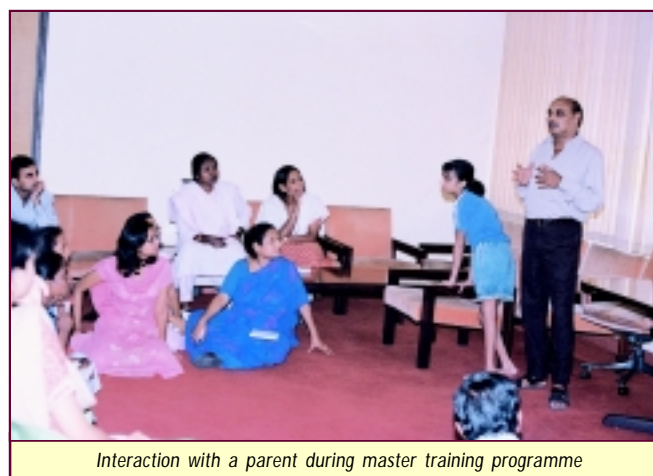
Interaction with a parent during master training programme

Raksha Bandhan, Janmashthami, Independence Day, Christmas celebrations.