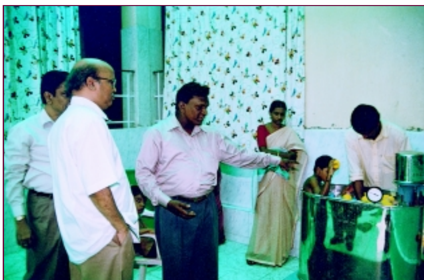
Secretary looks on the demonstration of hydrotherapy

Hydrotherapy is of unique advantage in treating persons with mental retardation particularly those suffering from joint pains, swelling, stiffness, muscle weakness, spasticity etc. The Institute has started providing hydrotherapy services to the persons with mental retardation having various physical problems. The unit has been started in the month of January, 2002.