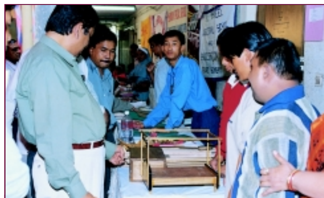
Special employees demonstrating their talents at NIMH

65 training programmes for 4066 persons with disabilities were organized in the District Disability Rehabilitation Centres. These programmes were primarily meant for imparting vocational skills and social integration.