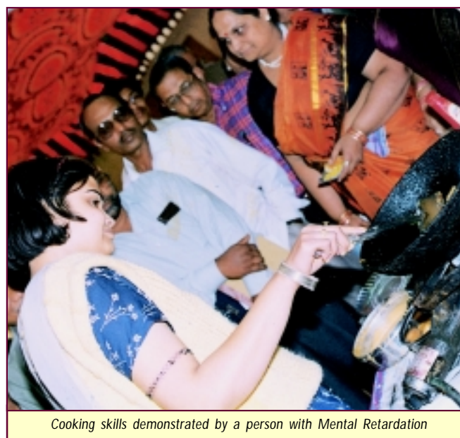
Cooking skills demonstrated by a person with Mental Retardation

Socio-economic rehabilitation of persons with mental retardation is promoted through the services of vocational training and job placement. Adults with mental retardation are placed in generic training initially and on-the-job training subsequently. On the