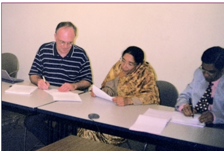
Deliberations of JWG Meeting at Pittsburgh, USA

The Indian team took the opportunity of visiting Human Engineering Research Lab, Rehabilitation Engineering Research Center, Center for Assistive Technology and Pittsburgh Vision Services.