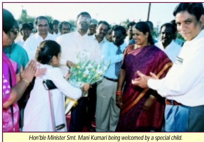
Hon'ble Minister Smt. Mani Kumari being welcomed by a special child.

The seventh national meet of special employees was held at Secunderabad during 19-20 December, 2001 which was attended by 92 special employees with 75 escorts from 14 States of India. These persons were selected based on their assessment as the best employees in their respective vocational training cum production centres. For creating public awareness and sensitizing the prospective employers, they demonstrated their capacity to avail of productive employment.