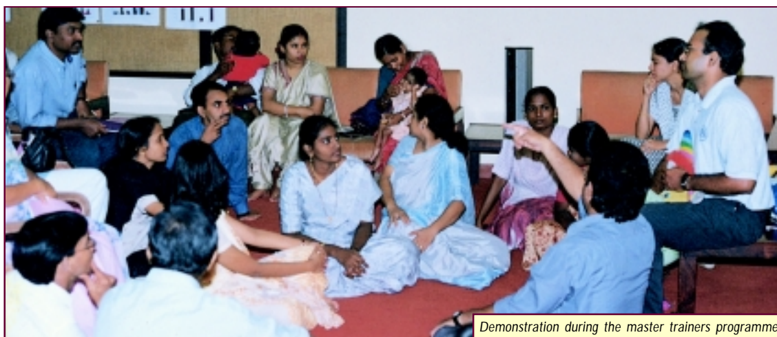
Demonstration during the master trainers programme

*Sp.Ed.: Special Educators, Th.: Therapists, S.W.: Social Workers