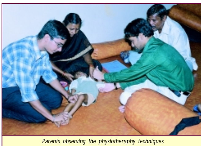
Parents observing the physiotherapy techniques

Children with mental retardation develop motor skills such as sitting and walking slower than normal children. About 15 percent of them also have cerebral palsy and other physical impairment. After detailed assessment, demonstration of therapeutic exercises for correcting posture and movement is given. Clients requiring assistive devices and appliances as also corrective surgery are referred to appropriate agencies.