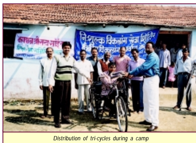
Distribution of tri-cycles during a camp

The performance of the CRC during the year is shown in Table V and Table VI.