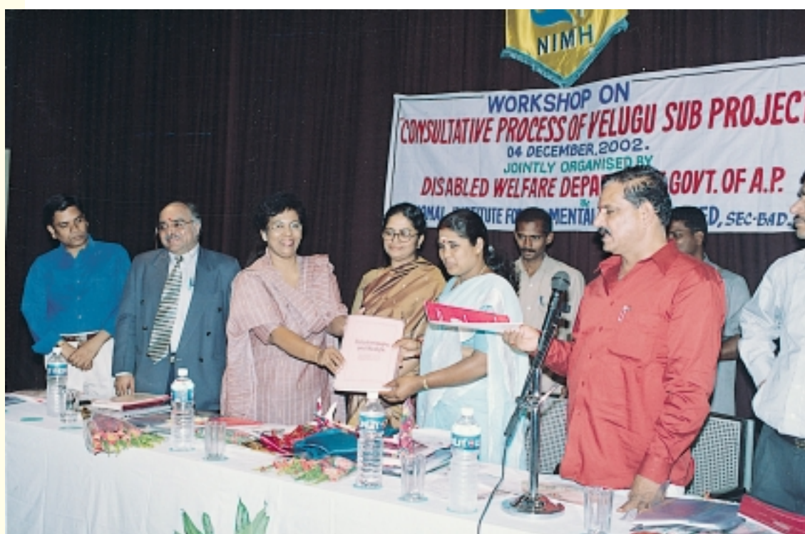
Smt. Mani Kumari, Minister for Disabled welfare, Govt of AP releasing a document on Velugu