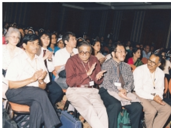
Delegates of the national conference