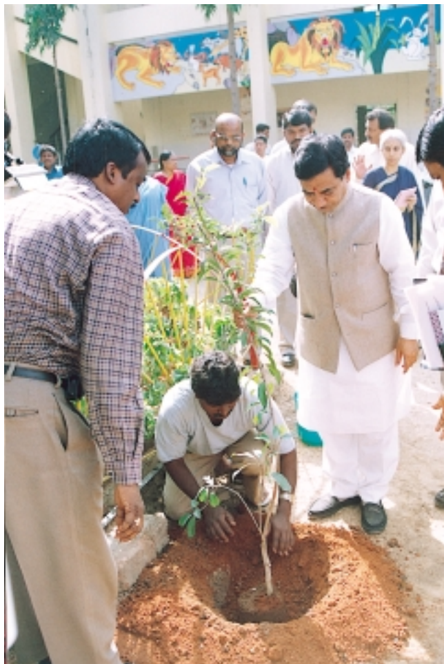
Union Minister planting a sapling during his visit

and achievements of the Institute. After the presentation, the Minister had a brief discussion with the faculty members of the Institute. He witnessed the programmes and services offered by the Institute and distributed flowers to the children.