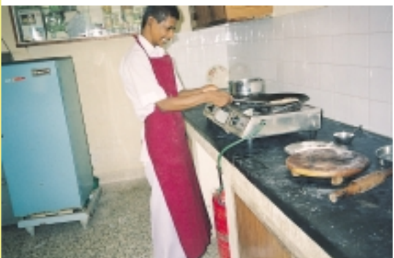
Participating in cooking activities