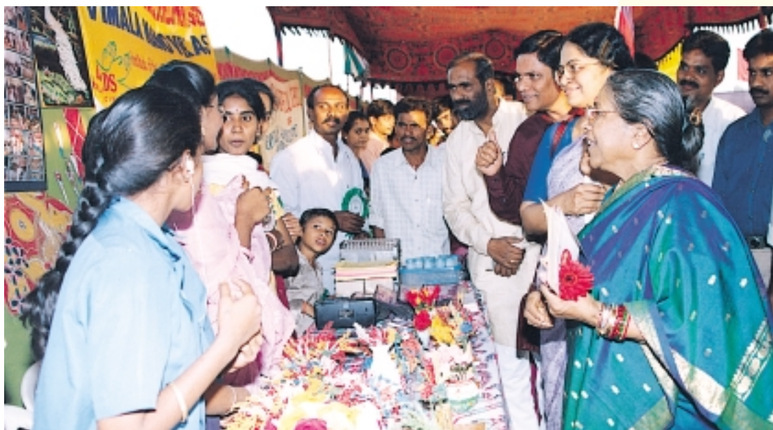
Smt. Haripriya Rangarajan, Lady Governor of AP interacting with the participants at the exhibition

On the occasion of World Day for the Disabled on 3 rd December, 2002, the Institute conducted the following week-long celebrations in collaboration with Disabled Welfare Department, Government of Andhra Pradesh: