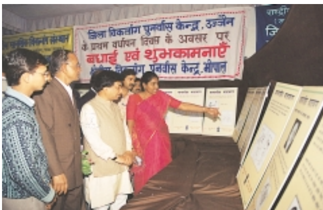
Dr. Satyanarayan Jatiya, Union Minister for Social Justice and Empowerment watching the Posters developed by DDRC, Ujjain

On the occasion of annual day celebrations of DDRC, Ujjain an exhibition of centres and services for persons with disability in the country was organized on 27.12.2002, in which the Institute participated and displayed the teaching/learning material, teacher-made aids, softwares, products of vocational section, daily living adaptations and publications developed by the Institute.