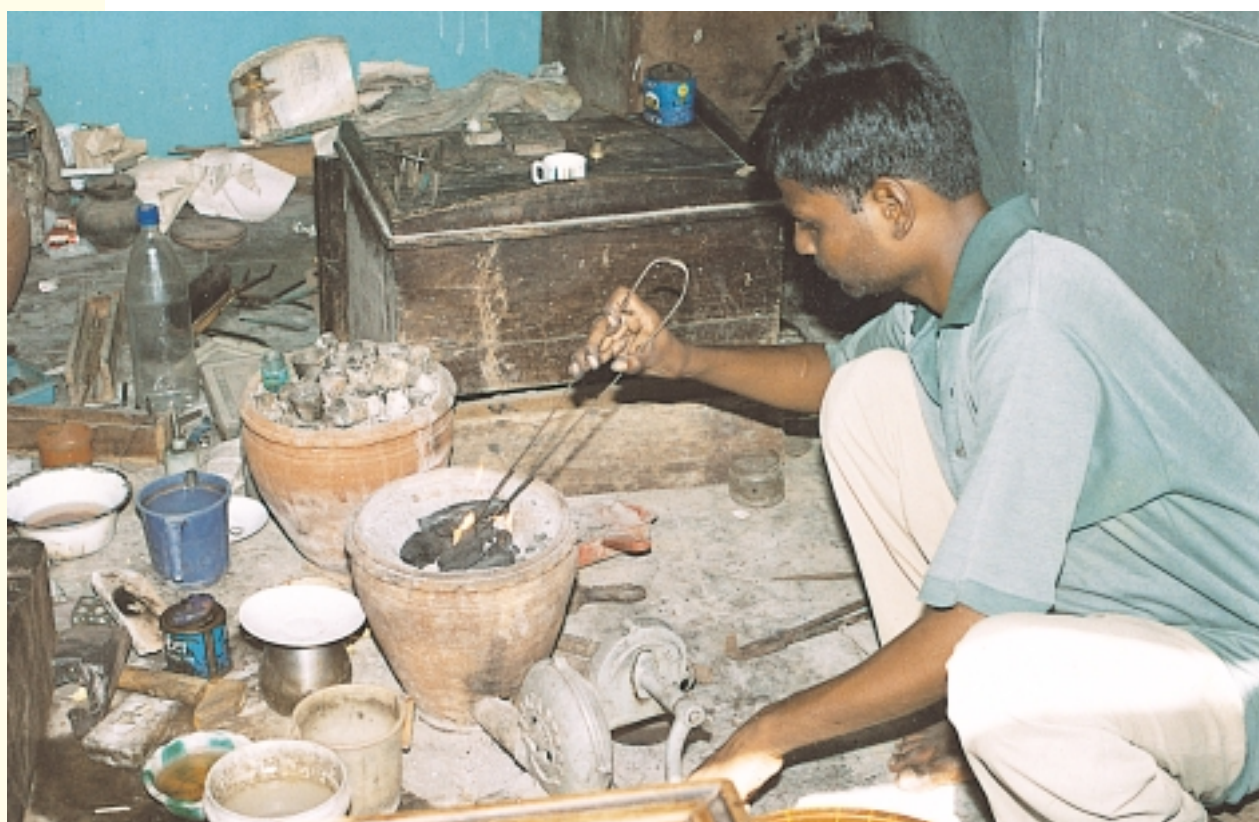
Person with mental retardation at goldsmithy work

Socio-economic rehabilitation of persons with mental retardation is promoted through the services of vocational training and job placement. Adults with mental retardation are placed in generic training initially and on-the-job training subsequently. On-the-job training varies from one client to the other depending upon the job opportunities available to the client in the locality where he lives. Long term support is provided to the client till he/she is able to carry on the job independently at the site where the job is located.