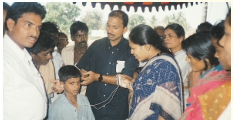
A camp of Aids and appliances distribution