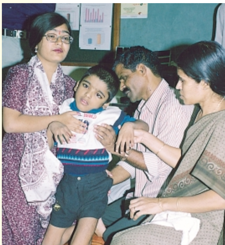
Demonstration of early intervention techniques to the parents

Clients with mental retardation with associated medical conditions such as epilepsy, hyperkinetic behaviour, upper respiratory tract infections, nutritional problems are provided with drugs and related medical advice. The Institute has in-house experts in paediatrics and psychiatry. Clients are referred to outside experts if necessary. Drugs are provided free of cost to the families with low income.