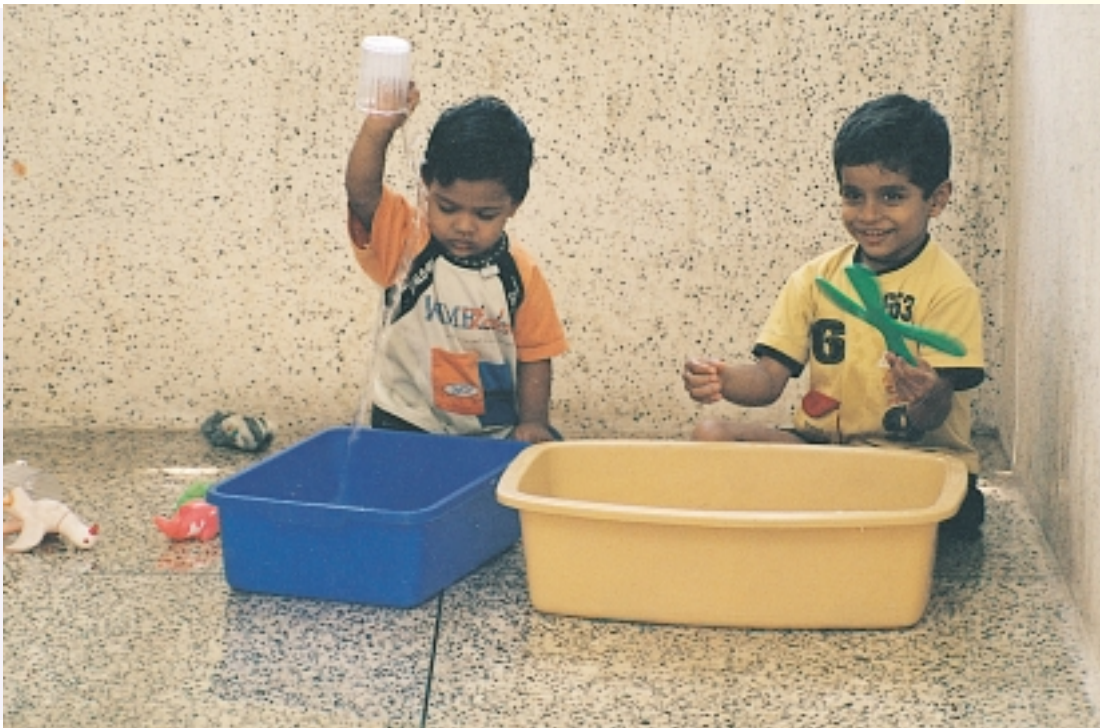
Children with artistic problems enjoying play

It is estimated that 75% of persons with autism are mentally retarded. As the children with mental retardation and autism are found in schools for the persons with mental retardation it is essential that appropriate educational services are provided to them to achieve 'zero reject'. With this end in view