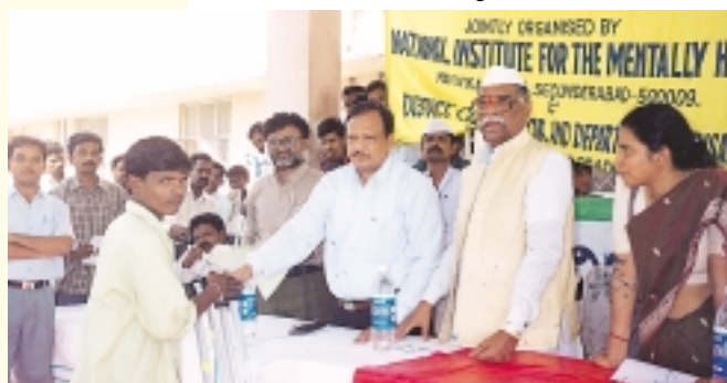
Distribution of aids and appliances

Detailed assessment and evaluation of the needs of persons with disabilities in the following areas: