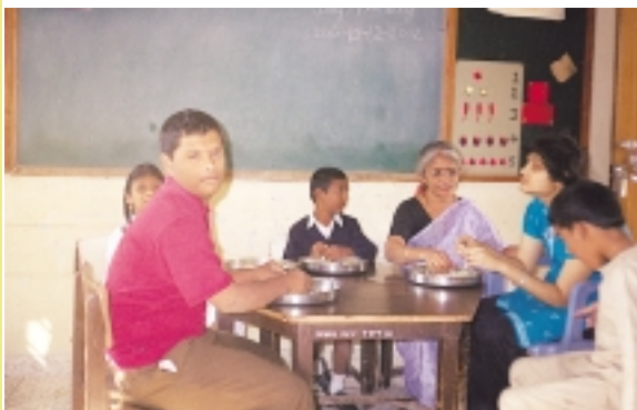
Children in lunch session

The special education centre serves as a model and demonstrative laboratory. 100 children attended the school regularly during the year 2002-03. They participated in the following events.