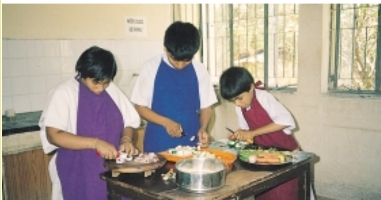
Children learning cooking skills