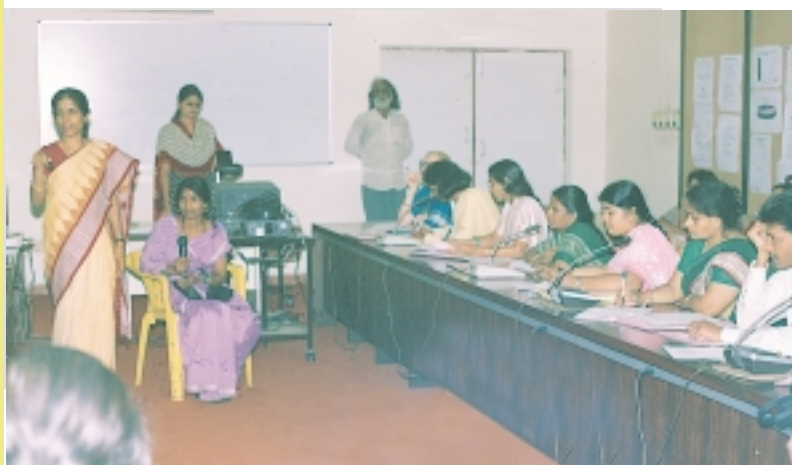
A session of workshop on Behaviour skills