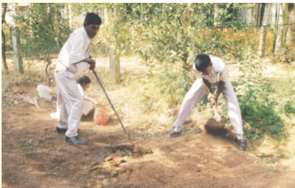
Persons with mental retardation work in the garden

Children with mental retardation are assessed on current level of functioning in the various skill areas such as self-help skills, gross and fine motor skills, functional reading and writing skills, time, money and related cognitive skills. Parents are involved in all stages of assessment, planning of an individualised educational programme and implementation of the IEP. Learning aids and appliances as appropriate to Indian context are utilised. Computer assisted training modules are also utilised in needy clients to speed up the efficiency of the special education services.