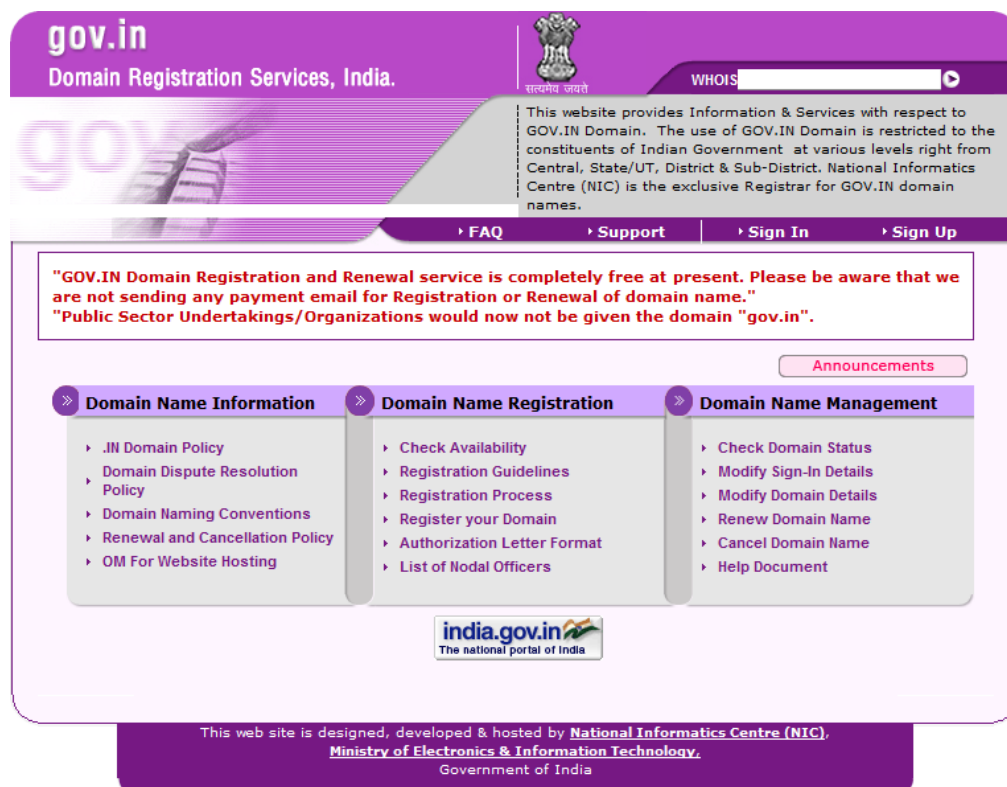
Figure: Screenshot of Domain Registration Service website https://registry.gov.in

For detailed information and step-by-step procedure on how to register a .GOV.IN Domain, one may visit http://registry.gov.in .