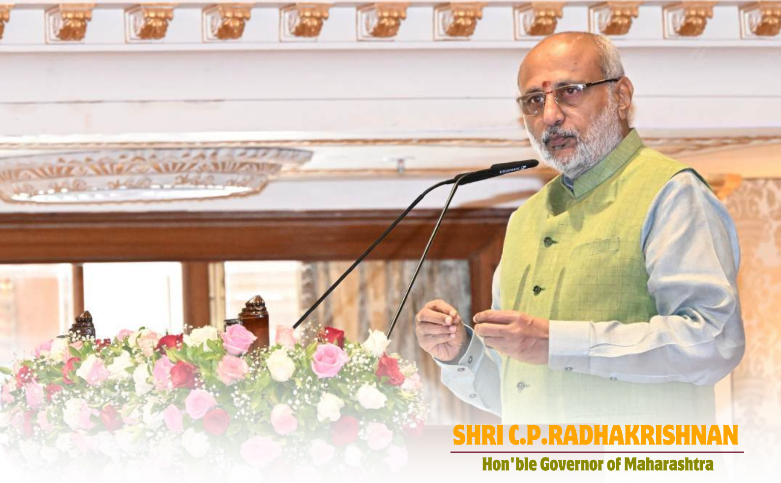
SHRI C.P.RADHAKRISHNAN Hon'ble Governor of Maharashtra

I touch and salute the holy feet of Bharath Mata, the Most Powerful and the Most Merciful.