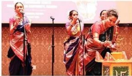
Swami Ramanand Teerth Marathwada University students perform a folk dance at Raj Bhavan, in Mumbai, on Friday.

Draw Governor's appreciation for Goa's traditional Dhalo and Diwali folk dance performances