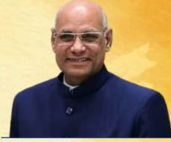
Shri Ramesh Bais