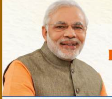
Shri Narendra Modi