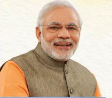
श्री नरेंद्र मोदी