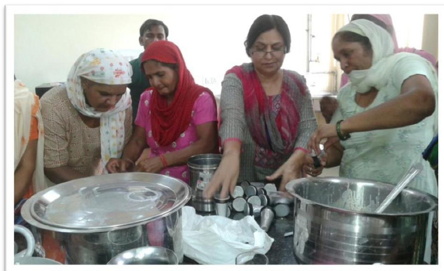
SHG women being taught how to make Kulfi