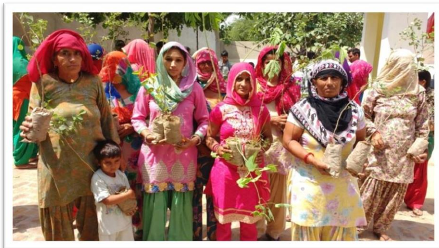
Village: - Kalali, District: - Bhiwani

Plantation under “Har Ghar Haryali” scheme by SHG Women