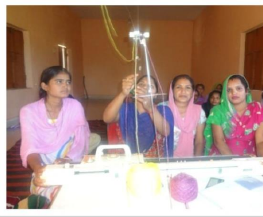
Knitting of woolens