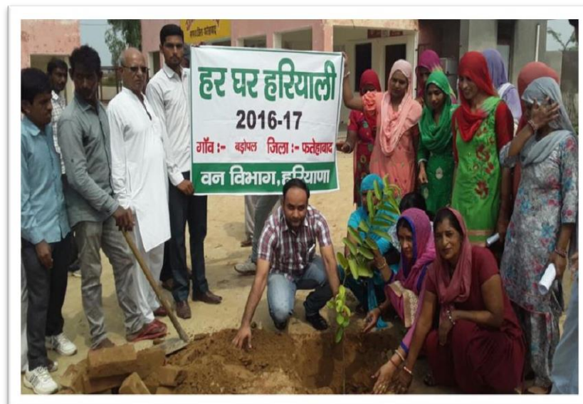
Village: - Badopal, District: - Fatehabad