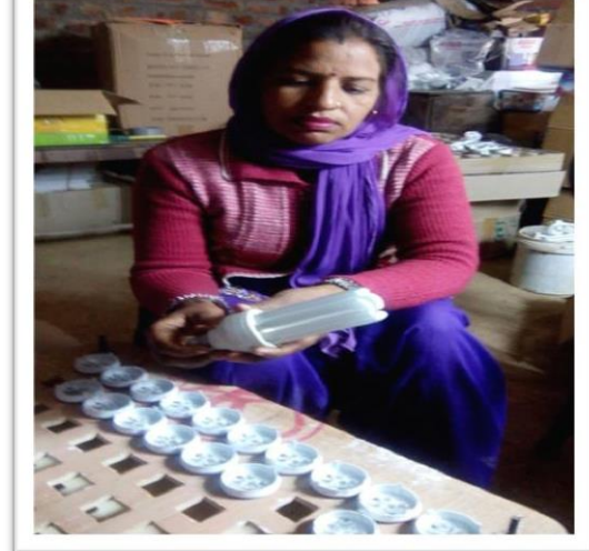
CFL Bulb Making