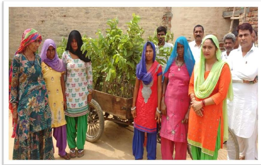
Village: - Kirdhan, District: - Fatehabad