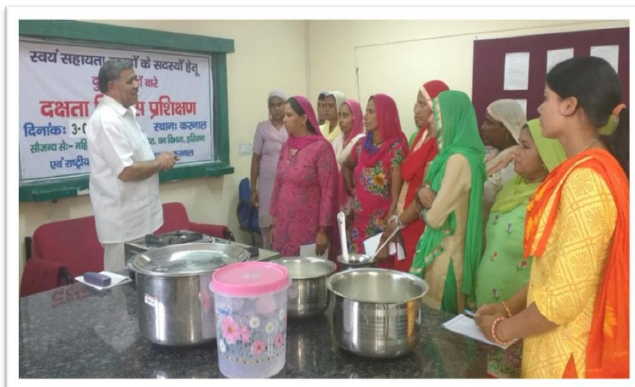
SHG women learning how to make Paneer