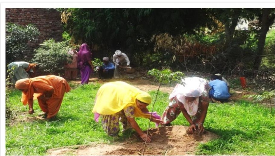
Village: - Chowki, District: - Panchkula