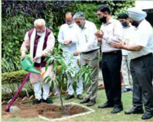
Haryana Chief Minister, Sh. Manohar Lal planting a sapling of Amrapali plant on the occasion of 72nd State Level Van Mahotsav at his residence in Chandigarh on July 25, 2021. Cooperation Minister, Dr. Banwari Lal is also seen in the picture