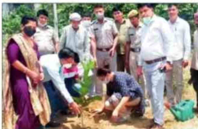
सामुदायिक स्वास्थ्य केंद्र में पौधरोपण करते लोग। www