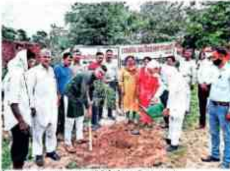
बलवंती : राजकीय उच्च विद्यालय बलवंती में पौधरोपण कार्य सफल चल रहा है।

राजकीय उच्च विद्यालय बलवंती में वन विभाग द्वारा रोपित किए गए 250 पौधों का शुभारंभ कार्यक्रम। वन विभाग के अधिकारी, शिक्षक, छात्रों और स्थानीय लोगों की संयुक्त श्रम से रोपण कार्य सफलतापूर्वक चल रहा है।