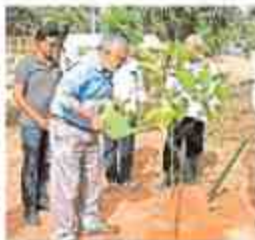
सोमवारी के कार्यक्रम का हिस्सा बनने के बाद सभी ने जलवायु परिवर्तन से निपटारे के लिए जलवायु परिवर्तन रीपोरट तैयार करने में शामिल हुए।

जलवायु परिवर्तन का रीपोरट : जलवायु परिवर्तन के रीपोरट को तैयार करने में शामिल है। जलवायु परिवर्तन के कारणों को शामिल करने में शामिल है। जलवायु परिवर्तन के कारणों को शामिल करने में शामिल है।