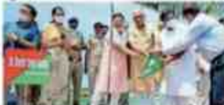
विहिम के अधिकारियों ने पौधों का वितरण करने में मदद की।

72वें वन महोत्सव पर लघुसूचियालय परिसर में जलप्रस्तरीय कार्यक्रम आयोजित किया गया। विभिन्न विभागों के अधिकारियों, कर्मियों, महिलाओं, बच्चों, युवाओं, वृद्धों, और अन्य लोगों की भागीदारी के साथ कार्यक्रम का आयोजन किया गया। कार्यक्रम में विभिन्न विभागों के अधिकारियों, कर्मियों, महिलाओं, बच्चों, युवाओं, वृद्धों, और अन्य लोगों की भागीदारी के साथ कार्यक्रम का आयोजन किया गया।