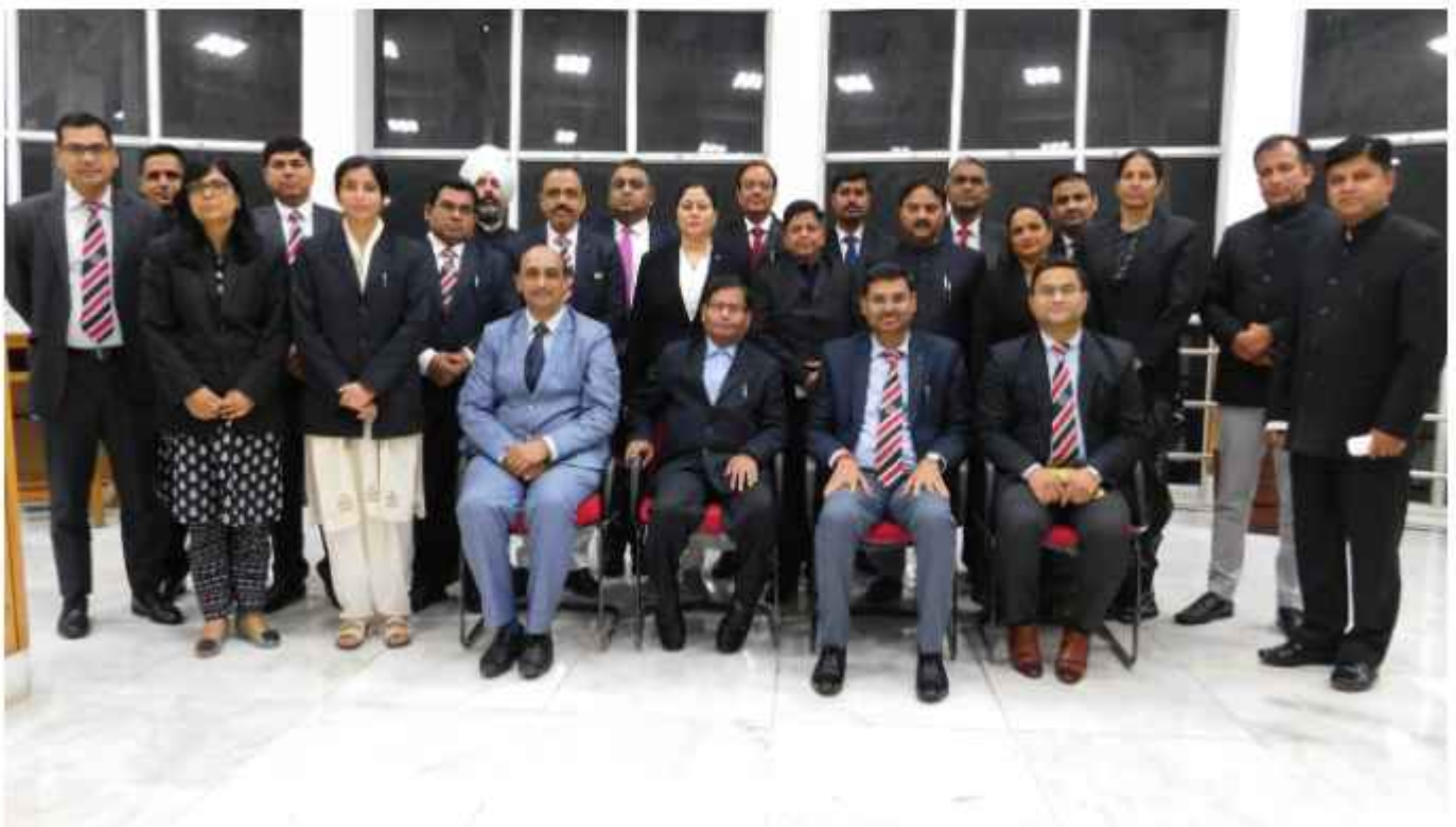
Workshop for Civil and Criminal Law relating to Appeals, Revision for ADJs (IInd phase) on 23 rd and 24 th of August, 2022