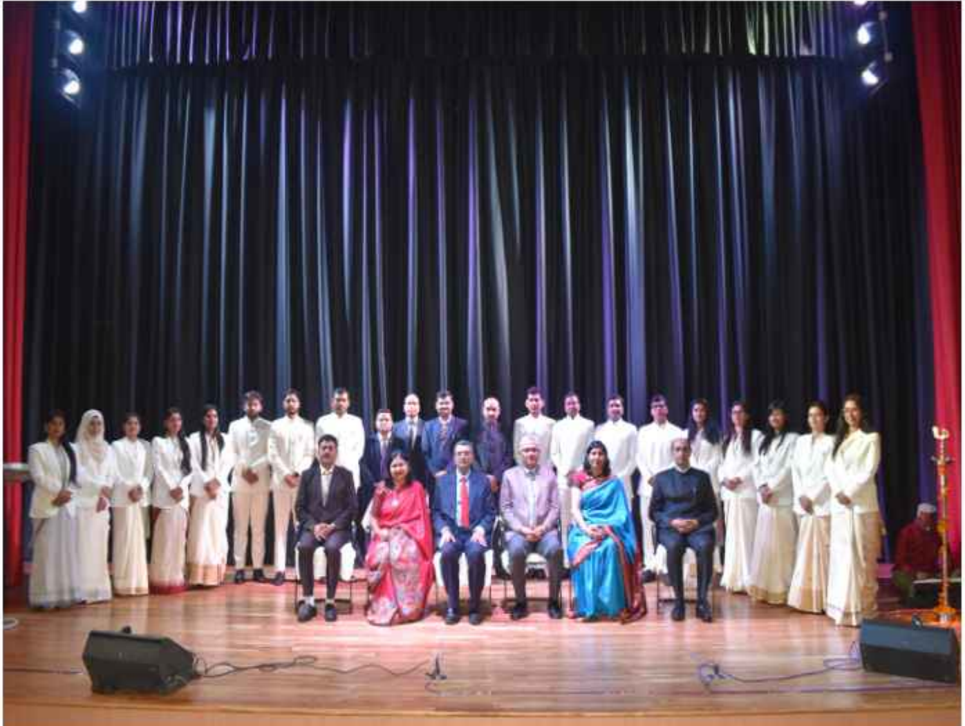
Foundation Training Programme for Newly Recruited Civil Judges (J.D), 2019 Batch (IIIrd phase of Institutional Training) from 01.07.2022 to 05.10.2022