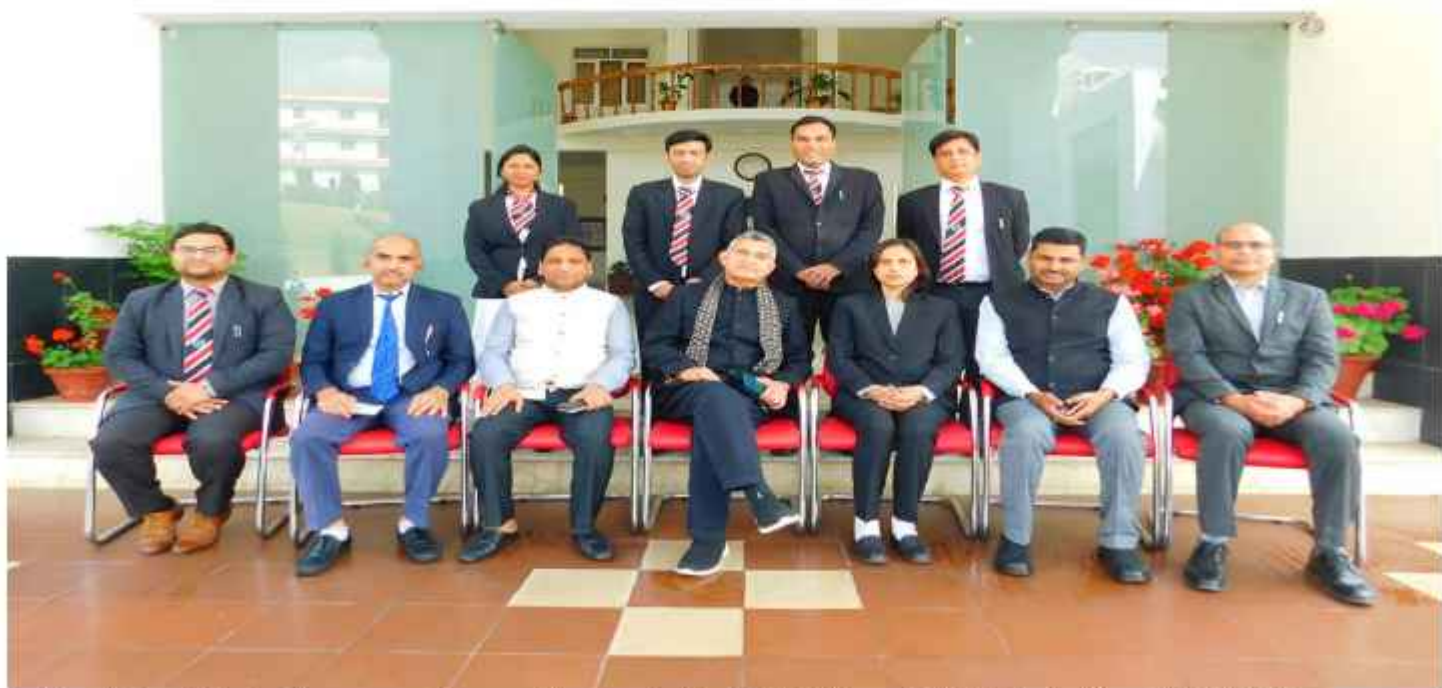
Foundation Training Programme for recently promoted Judicial Officers in H.J.S. Cadre from 26.04.2024 to 25.05.2024.