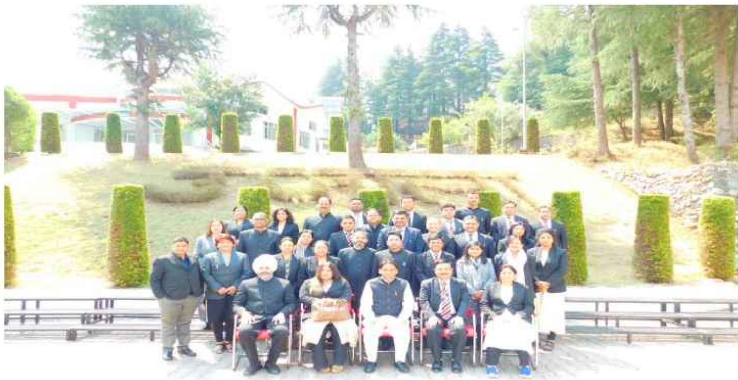
Three days Training Programme on new Criminal Laws for ADJs (Vth Phase) from 11.06.2024 to 13.06.2024