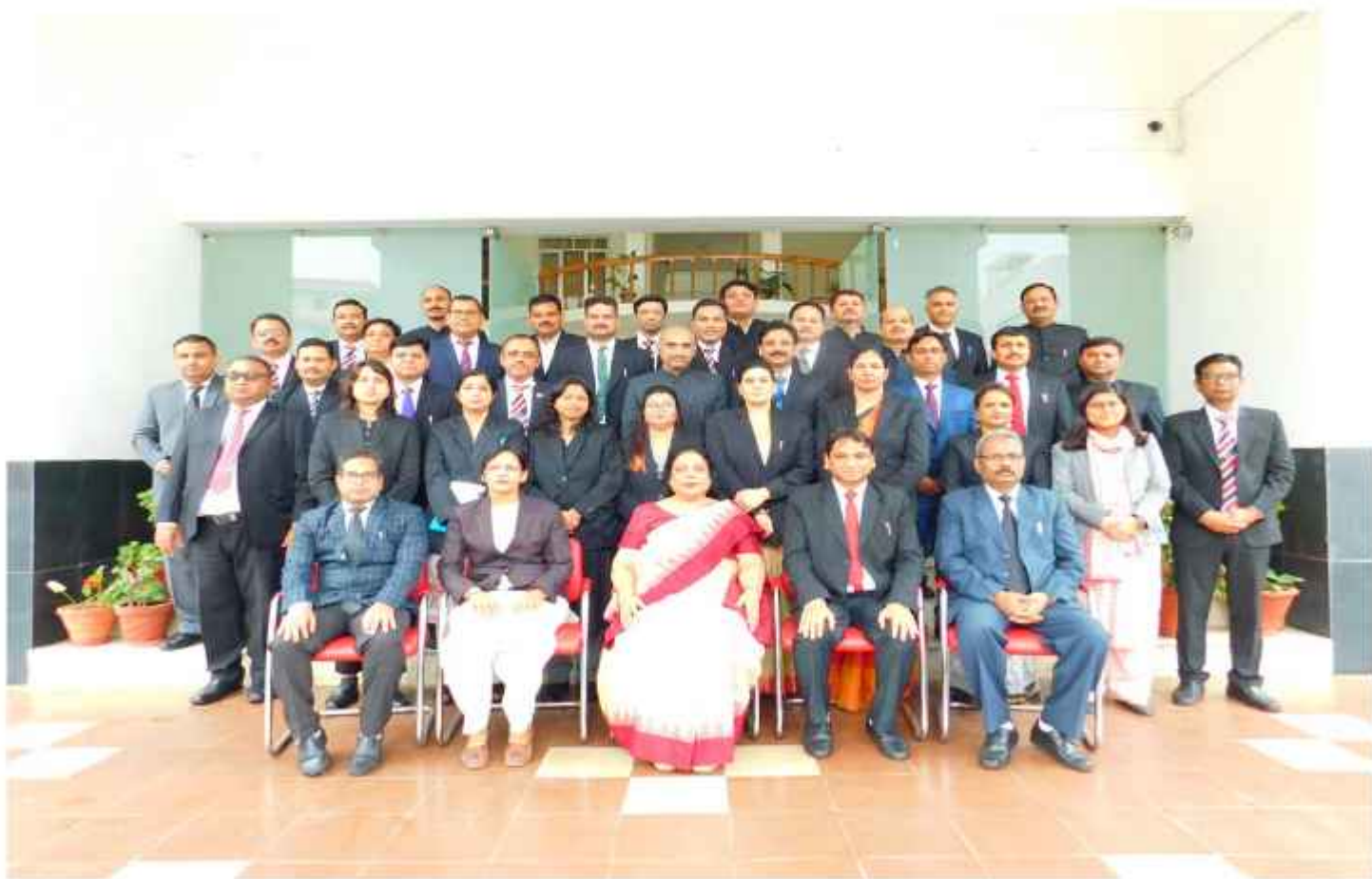
Three days Training Programme on new Criminal Laws for ADJs (VI phase) from 19.06.2024 to 21.06.2024