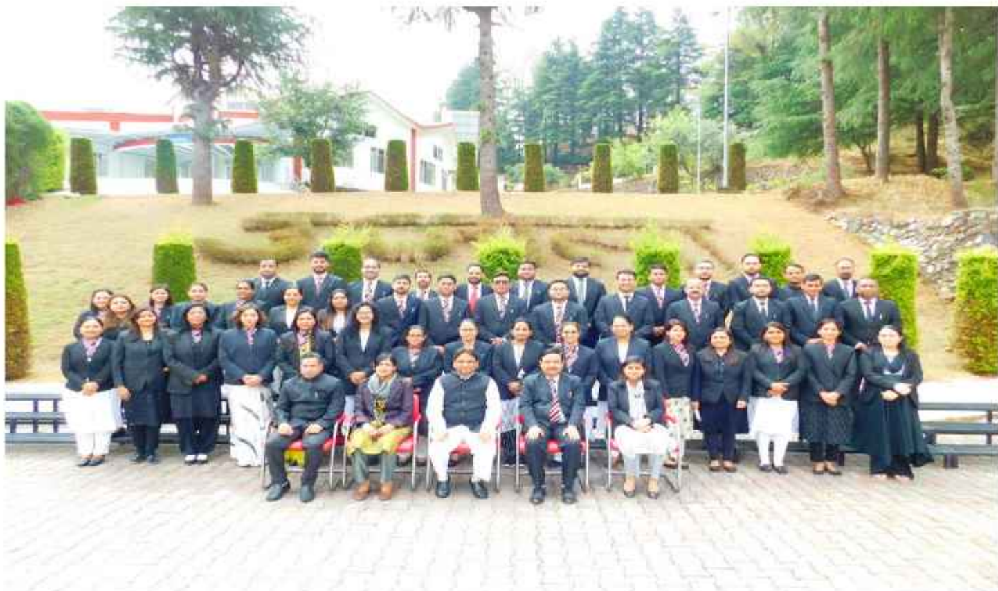
Three days Training Programme on new Criminal Laws for Civil Judges (J.D.)/Judicial Magistrate (1 st phase) from 22.05.2024 to 24.05.2024