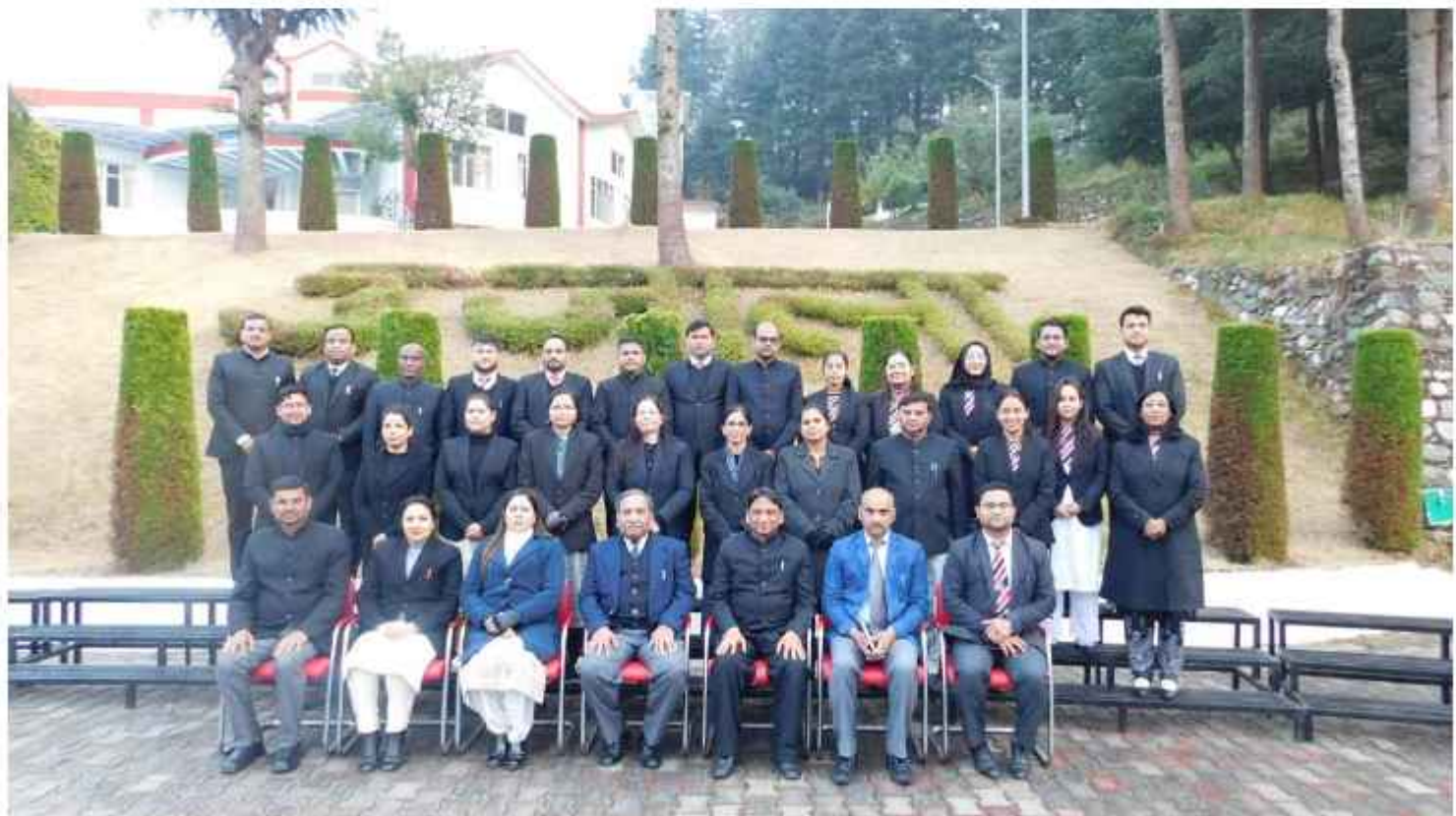
Two days Workshop on emerging trends in Cyber Law, Cyber Crimes including Financial frauds in collaboration with Indian Cyber Crime Coordination (I4C), MHA (IIIrd Phase) from 19.12.2023 to 20.12.2023.