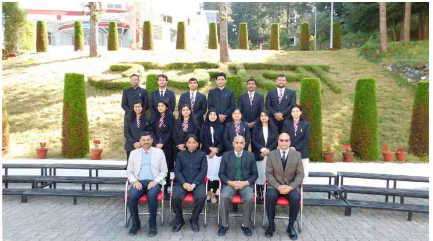
Refresher Course for Civil Judge (J.D.), 2019 Batch from 26.10.2023 to 09.11.2023.