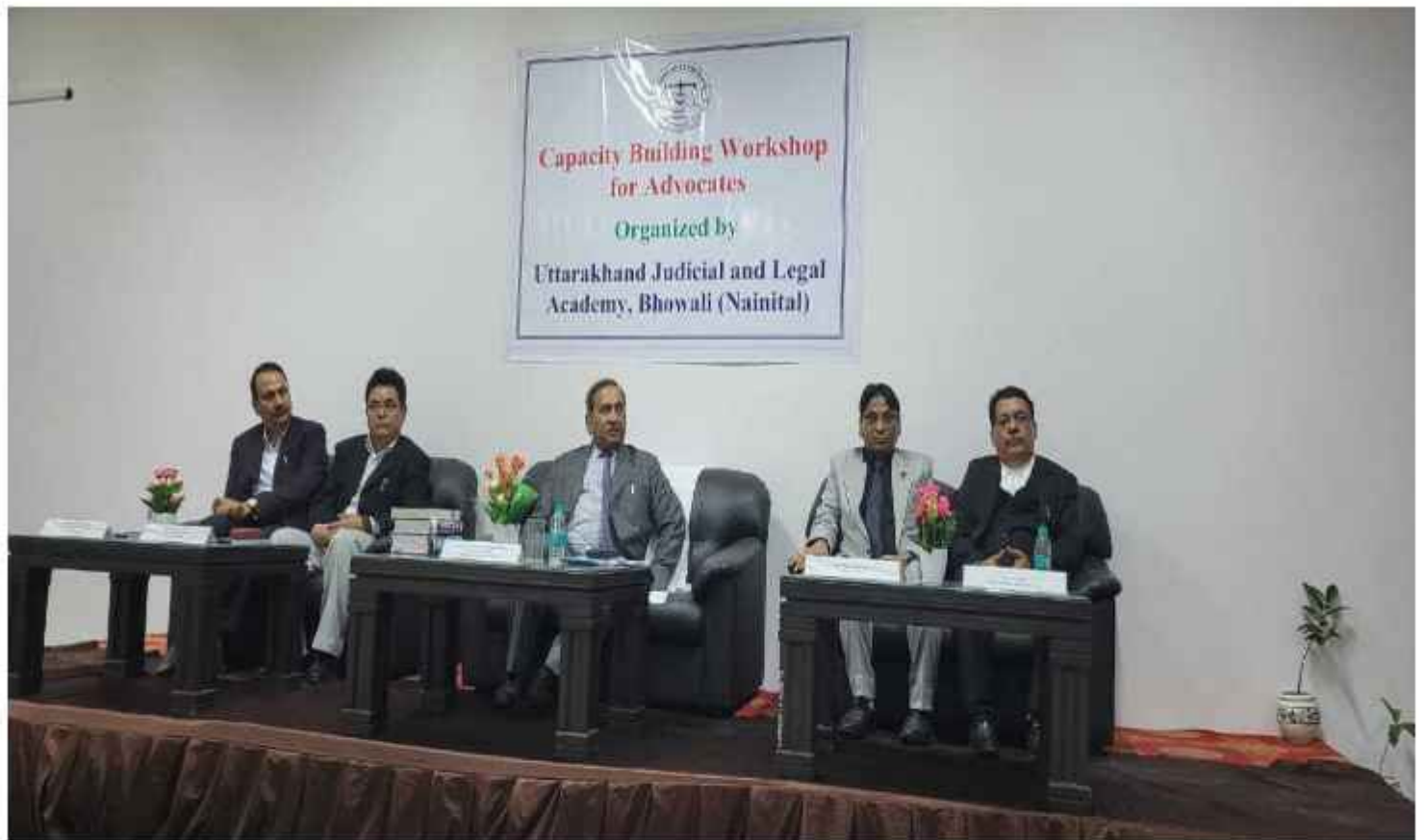
Training Programme on Capacity Building of Advocates of District Udham Singh Nagar (1 st Phase) on 06.11.2023.