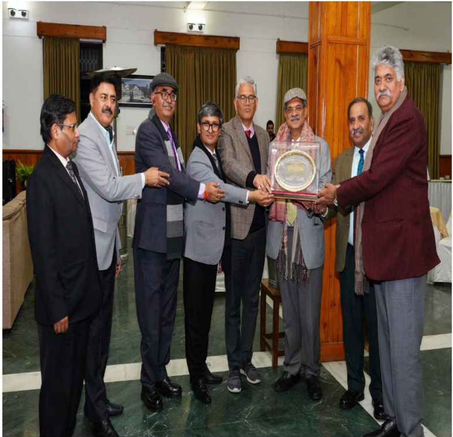
Hon'ble Judges presenting memento to Hon'ble Mr. Justice Vipin Sanghi, the Chief Justice of the High Court of Uttarakhand on the occasion of Superannuation of His Lordship.