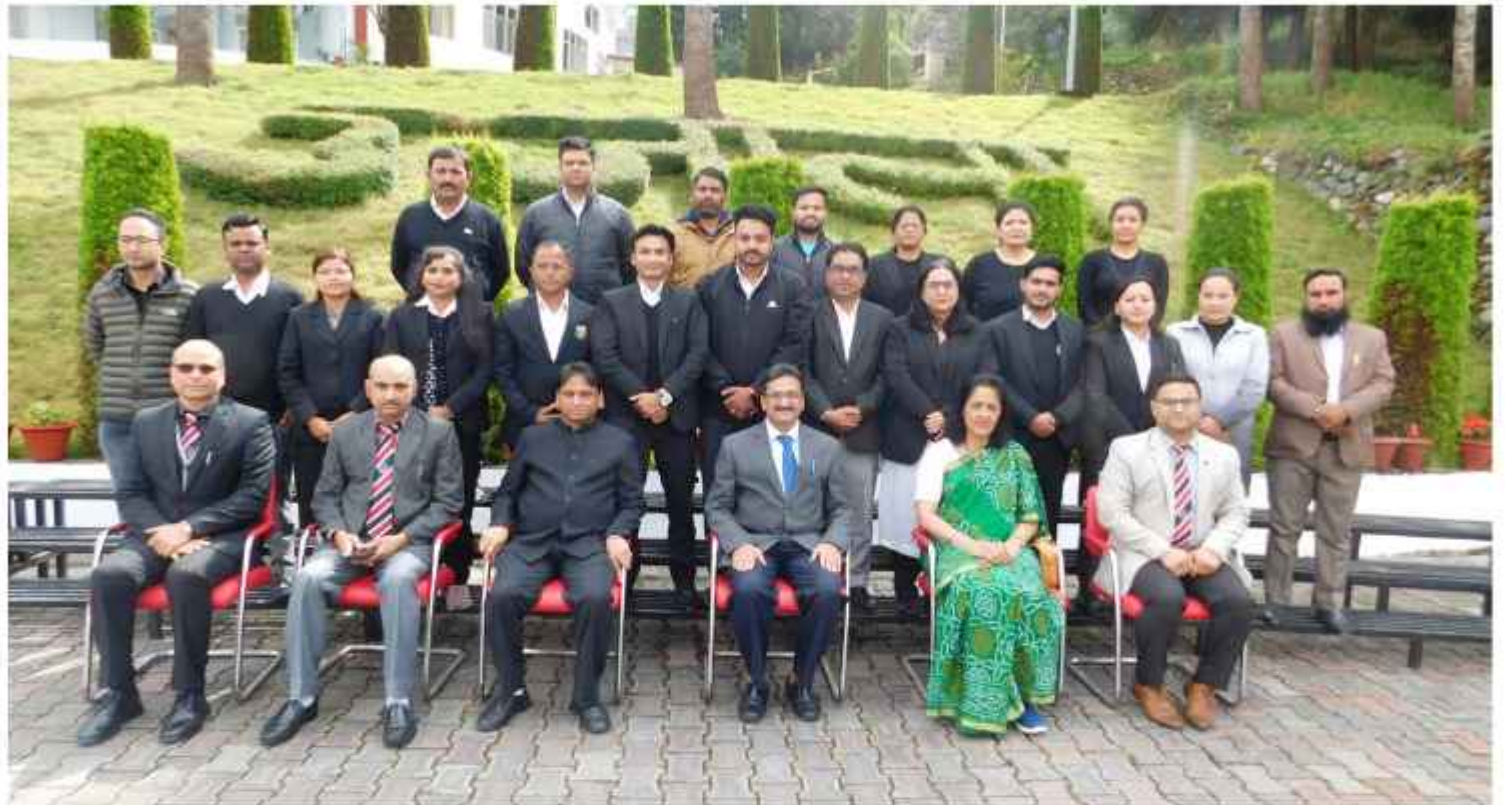
40 hours Training Programme on Mediation for Mediator-Advocates of High Court of Uttarakhand (1 st Phase) from 15.10.2023 to 19.10.2023.