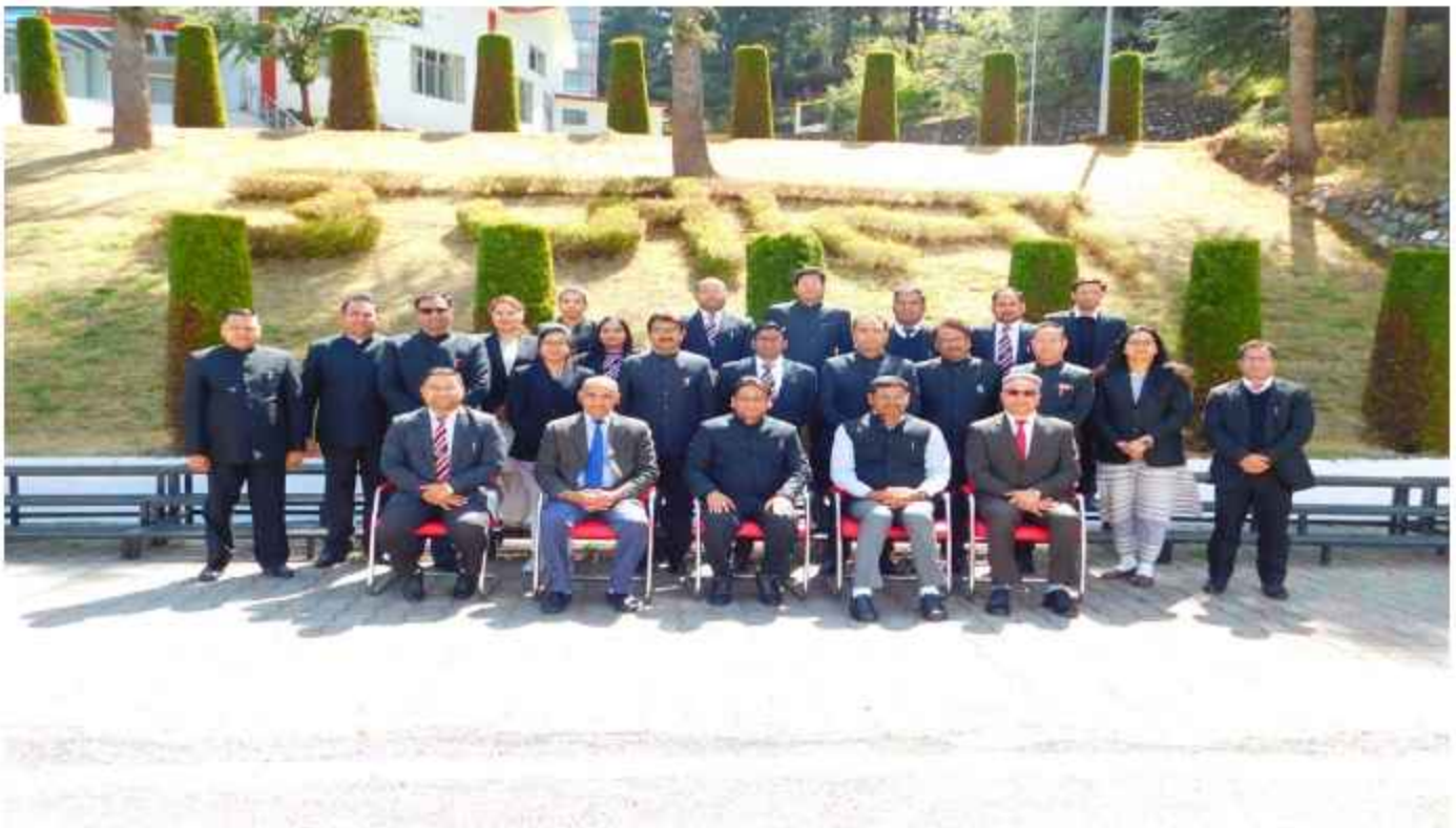
Refresher Course on Criminal Laws and Procedures during the period from 12.03.2024 to 16.03.2024