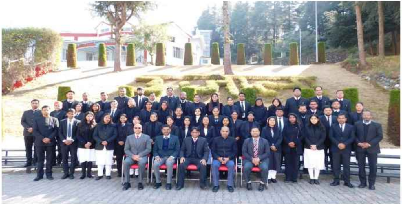
Training for Newly Appointed Assistant Prosecution Officers (APOs) of the State during the period from 02.01.2024 to 31.01.2024