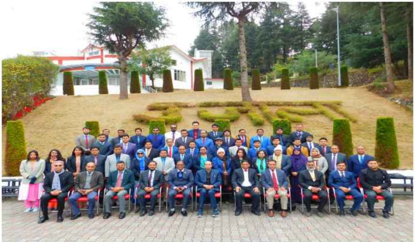
Training Programme for Bangladesh Judges and Judicial Officers during the period from 17.02.2024 to 23.02.2024