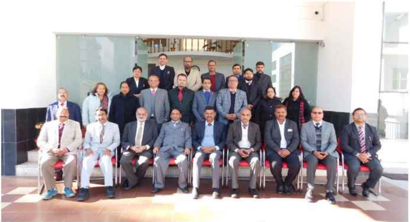
40 hours Training Programme for Advocates of High Court on Mediation (II nd Phase) during the period from 08.01.2024 to 12.01.2024