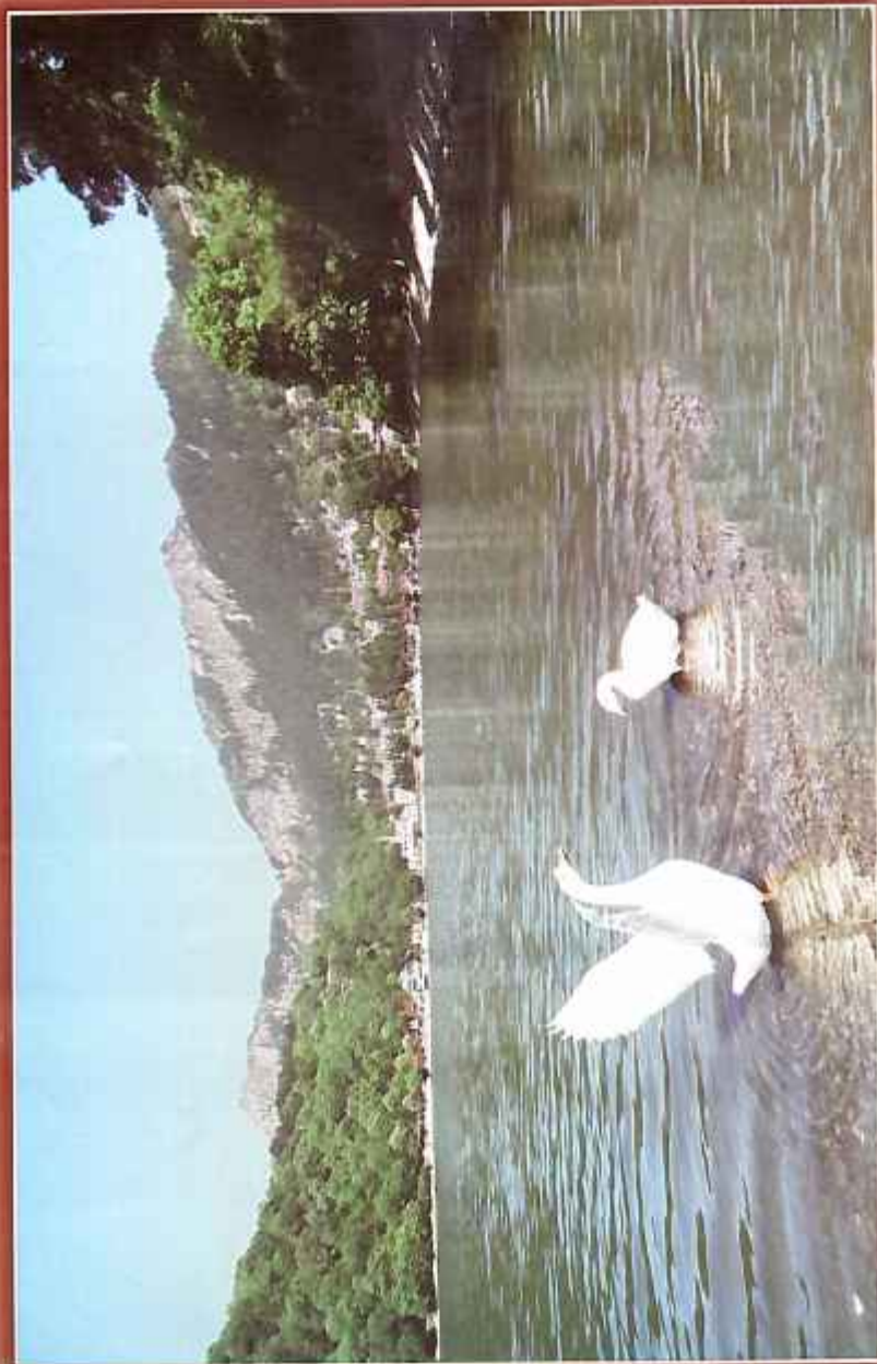
View of Nainital