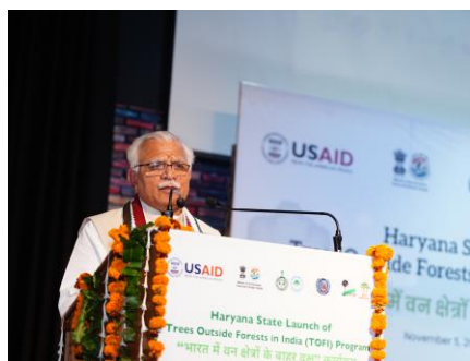
SHRI. MANOHAR LAL KHATTAR HON'BLE CHIEF MINISTER, HARYANA