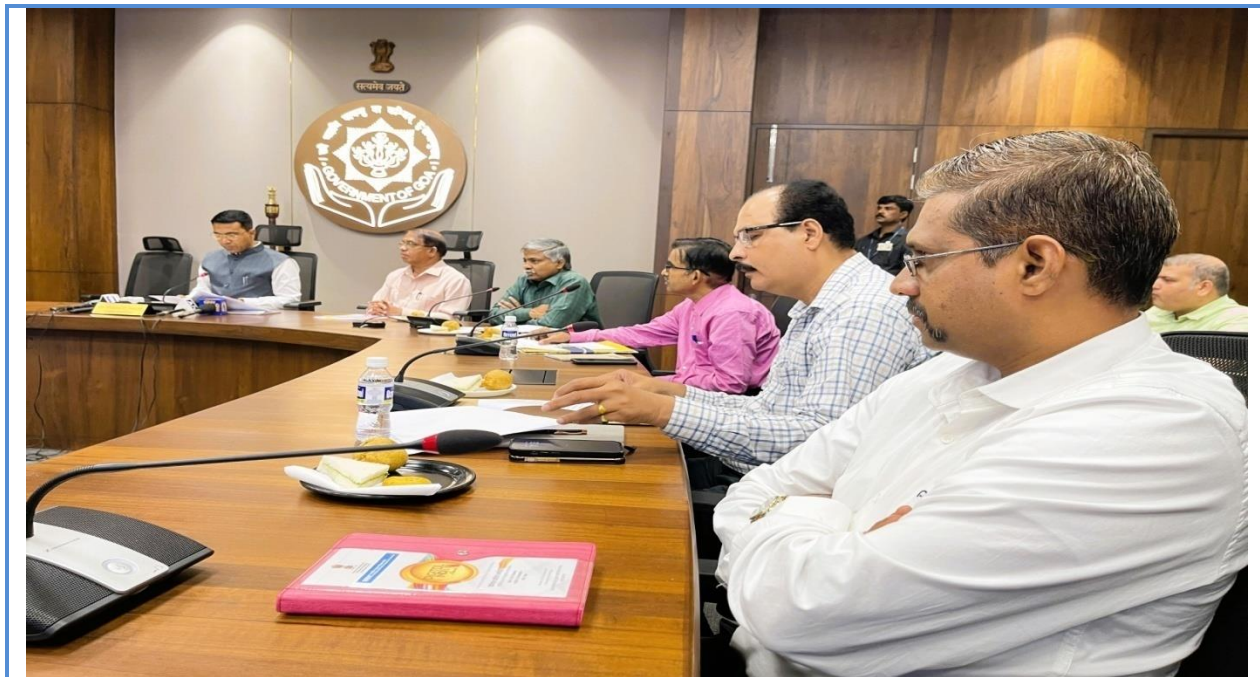
The Portal was Launched by Honble Chief Minister of Goa in the Distinguished Presence of Honble Minister for Co-Operation, attend by Principal Finance Secretary, Joint Secretary ( Finance), State Informatics Officer NIC Goa, ASIO NIC Goa and other Senior Officials from Commercial tax Department and NIC Goa.

The interface disseminates information for all eligible individuals to take full advantage of this scheme by submitting their applications through the online portal before the deadline on 07/03/2024. By embracing digital advancements, the Government of Goa is not only providing financial relief but also ensuring a secure and efficient experience for all participants