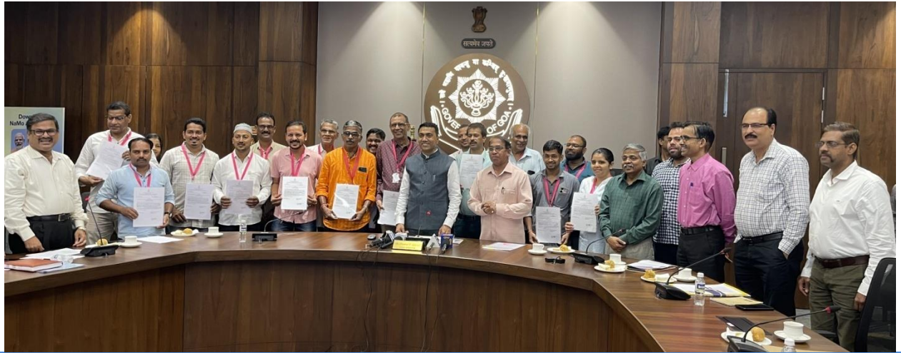
The Digitally signed waiver certificate processed and obtained from the online portal is distributed by Honble Chief Minister to all the beneficiaries