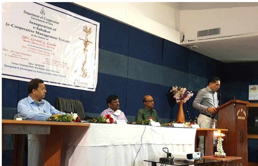
Shri. Govind Gaude, Minister of Cooperation, addressing the event