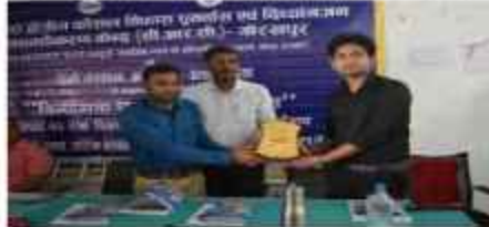
आरएसआई द्वारा आयोजित कार्यक्रम का आयोजन किया गया। कार्यक्रम का आयोजन गोरखपुर में एक जन जागरूकता कार्यक्रम का आयोजन किया। इसमें 250 से ज्यादा लोग शामिल हुए।

गोरखपुर, दिव्यांगता पुनर्वास पर जन जागरूकता कार्यक्रम का आयोजन किया गया। कार्यक्रम का आयोजन गोरखपुर में एक जन जागरूकता कार्यक्रम का आयोजन किया। इसमें 250 से ज्यादा लोग शामिल हुए। कार्यक्रम का आयोजन गोरखपुर में एक जन जागरूकता कार्यक्रम का आयोजन किया। इसमें 250 से ज्यादा लोग शामिल हुए।