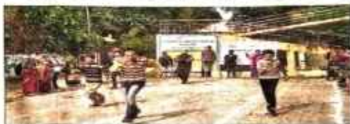
गुरुवार को गोरखपुर में आयोजित नीबू दौड़ में भाग लेते दिव्यांग।