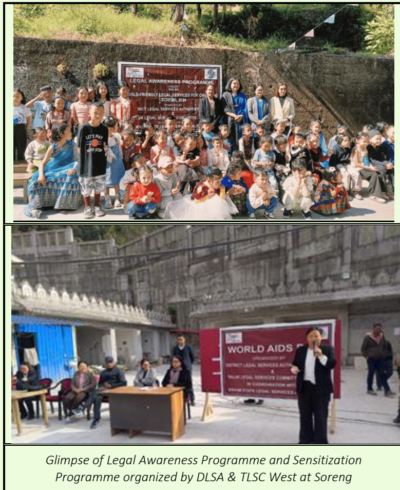
Glimpse of Legal Awareness Programme and Sensitization Programme organized by DLSA & TLSC West at Soreng