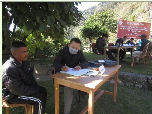
Legal awareness programme on the occasion of Human Rights Day on 10th December 2025 and Consumer Day falling on 24th December 2025 at State Central Prison, Rongyek on 10.12.2025