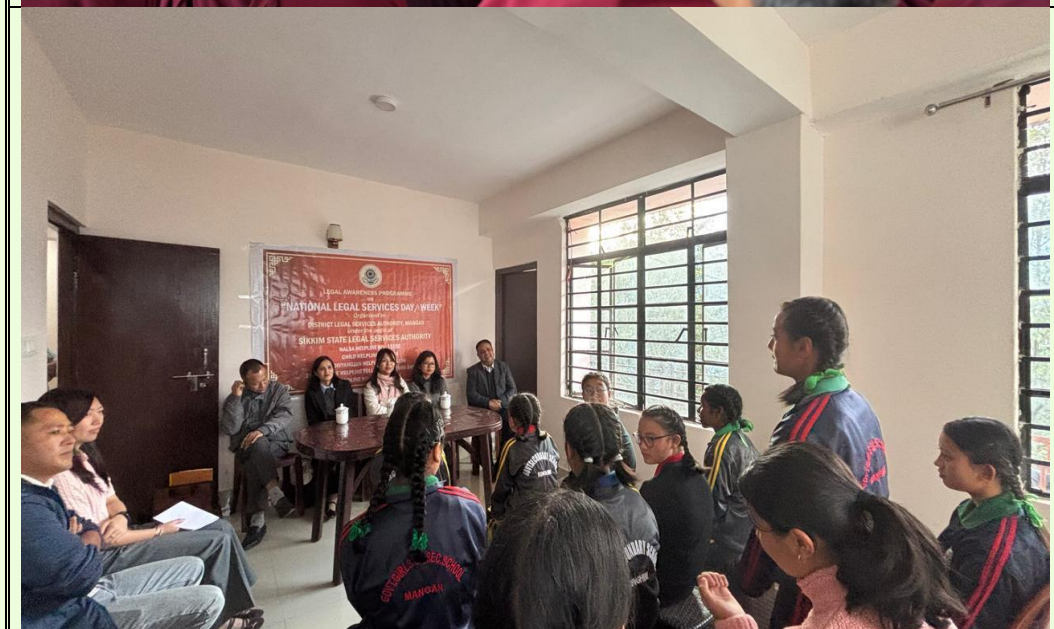
A week-long observance of National Legal Services Day/Week organized by DLSA Mangan