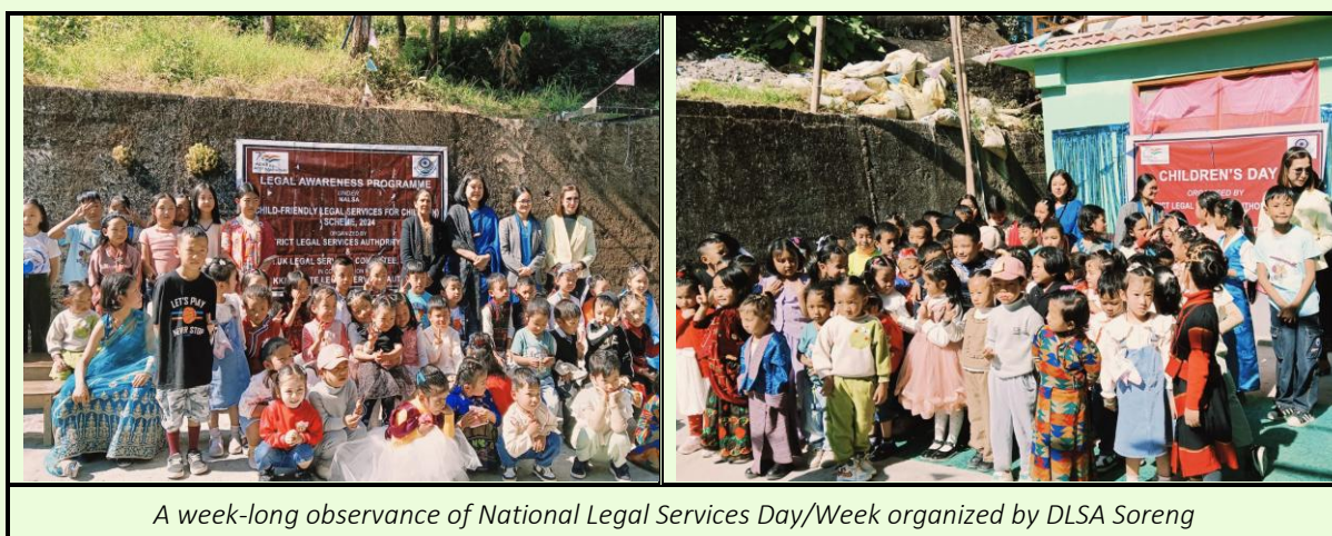
A week-long observance of National Legal Services Day/Week organized by DLSA Soreng