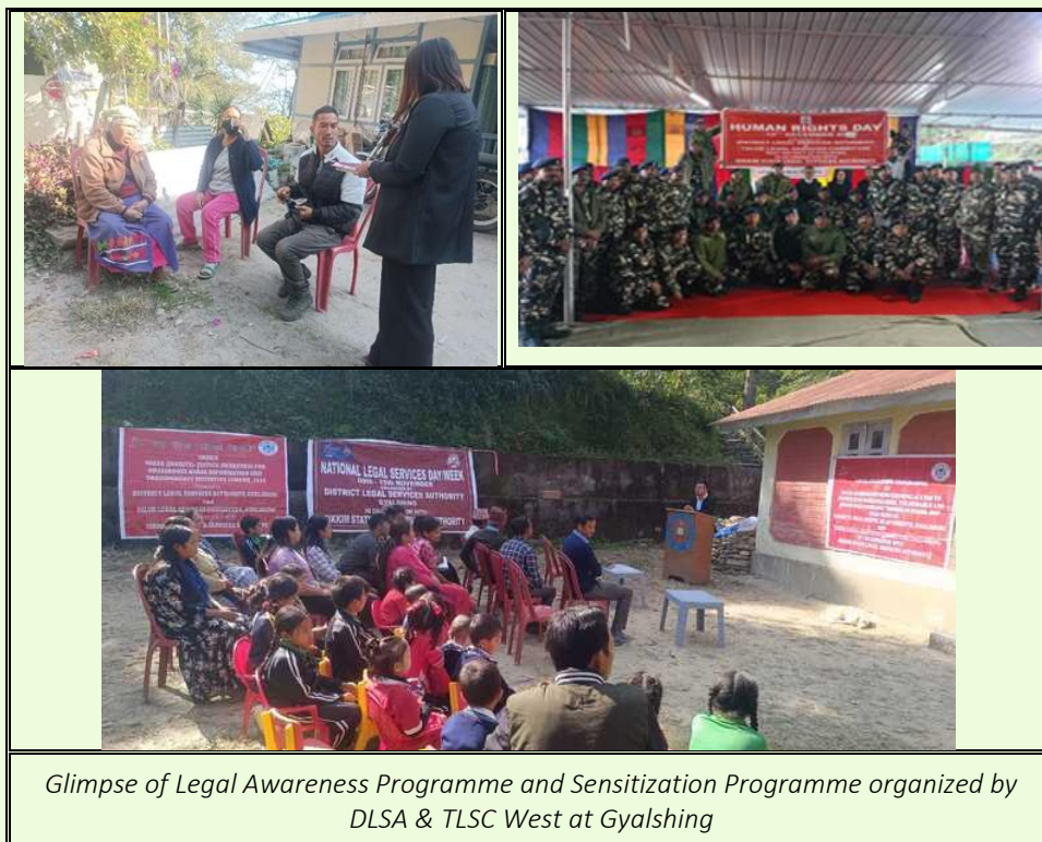
Glimpse of Legal Awareness Programme and Sensitization Programme organized by DLSA & TLSC West at Gyalshing