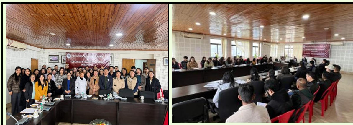
Positive Mental Health Programme for the employees of Cooperative Department, Government of Sikkim on 1st November, 2025 at the Conference Hall of Sikkim SLSA, Gangtok

The Member Secretary, Sikkim SLSA delivered the welcome address while the vote of thanks was proposed by the Under Secretary, Sikkim SLSA.