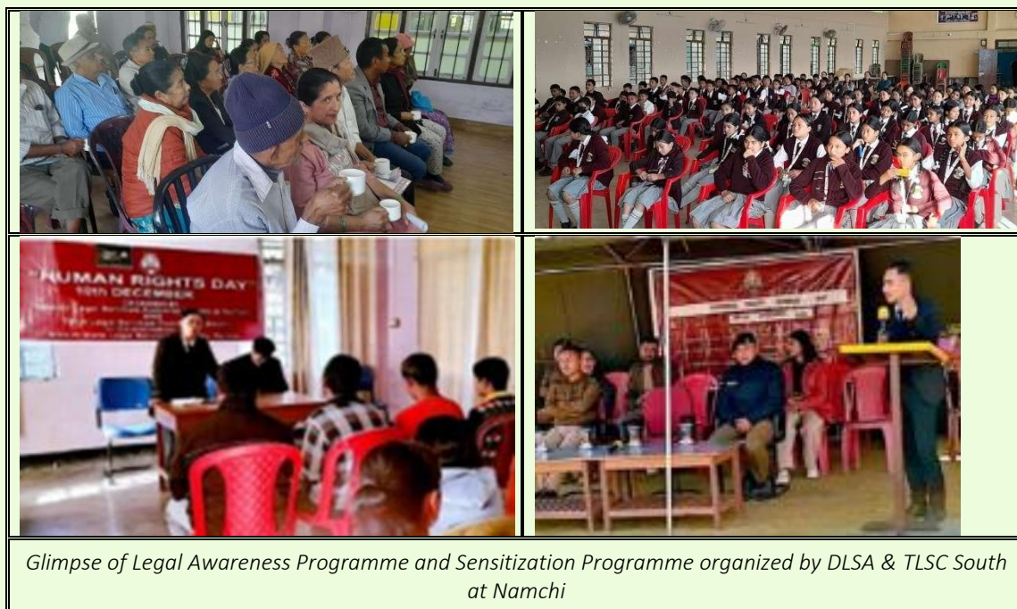
Glimpse of Legal Awareness Programme and Sensitization Programme organized by DLSA & TLSC South at Namchi