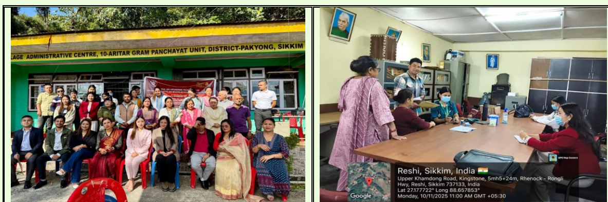
A week-long observance of National Legal Services Day/Week organized by DLSA Pakyong