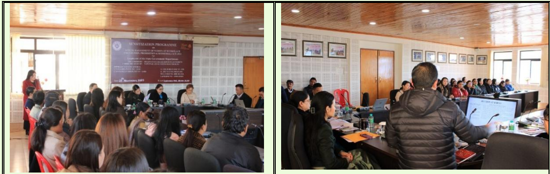
Sexual Harassment of Women at Workplace (Prevention, Prohibition & Redressal) Act, 2013 for the employees and Members of Internal Complaints Committee of the Transport Department, Commercial Tax Division, Finance Department and Income Tax Department on 29th December, 2025 at the Conference Hall of Sikkim SLSA