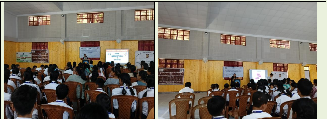
Awareness programme on NALSA (Child-Friendly Legal Services for Children) Scheme, 2024 organised by DLSA Soreng and TLSC Soreng in co-ordination with Sikkim SLSA on 01.09.2025 at Govt. Sec. School Pakki Gaon, Soreng District