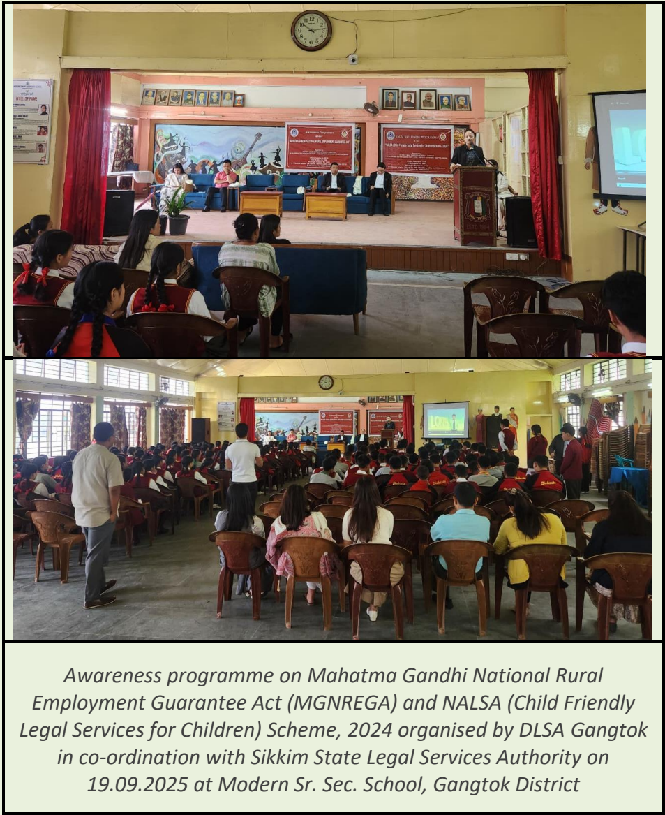
Awareness programme on Mahatma Gandhi National Rural Employment Guarantee Act (MGNREGA) and NALSA (Child Friendly Legal Services for Children) Scheme, 2024 organised by DLSA Gangtok in co-ordination with Sikkim State Legal Services Authority on 19.09.2025 at Modern Sr. Sec. School, Gangtok District