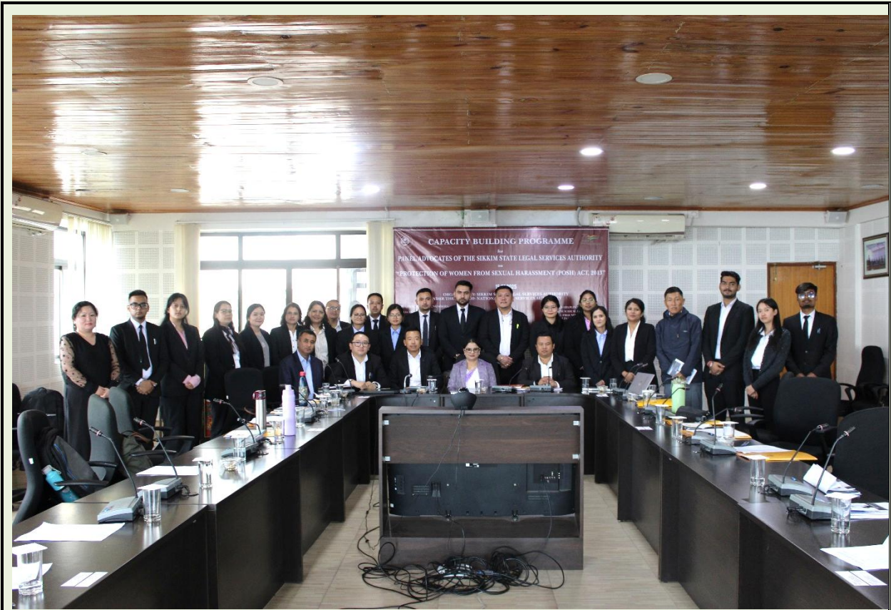
Capacity Building Programme for Panel Advocates of the Sikkim State Legal Services Authority on ‘Protection of Women from Sexual Harassment (POSH) Act, 2013’ at Office of Sikkim SLSA at Gangtok District on 15.07.2025