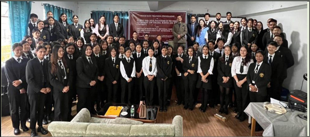
Four Days Training Programme for student Para Legal Volunteers of the Sikkim Government Law College, Burtuk and ICFAI University under the NALSA scheme for PLVs (Revised) & Module for the Orientation-Induction Refresher Courses for PLV Training at the Burtuk College, Gangtok from 09th to 12th September 2025, Gangtok District

The critical aspects of the Juvenile Justice Act, 2015, Schemes of NALSA, Labour laws and free legal aid etc were discussed.