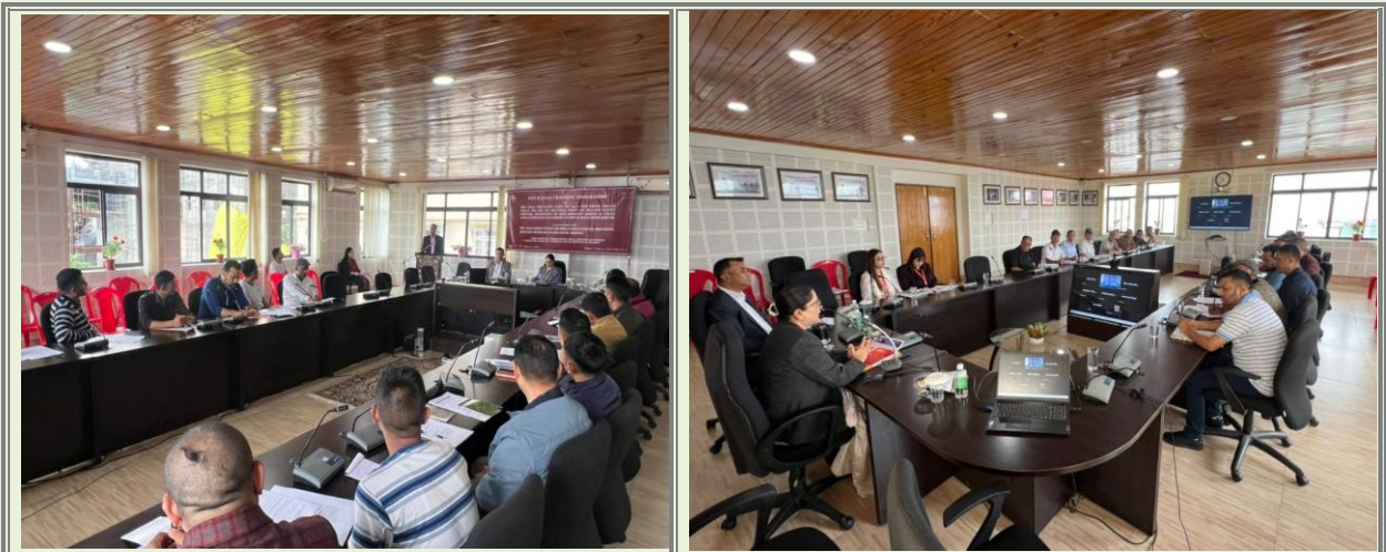
Four-day training programme for para-legal volunteers selected from widows of deceased defence personnel, ex-servicemen or their dependents residing in civilian areas, and spouses or adult children of currently serving defence personnel under the NALSA Scheme for PLVs (Revised), including the module for orientation– induction refresher courses for PLV training at the Office of Sikkim SLA from 17 th to 20 th September 2025, Gangtok District.

Topics deliberated, discussed and educated on were critical aspects of the Juvenile Justice Act, 2015, Schemes of NALSA, property laws, Labour laws, critical aspects of legal framework concerning youth individuals, Equal Remuneration Act, 1976 and free legal aid.