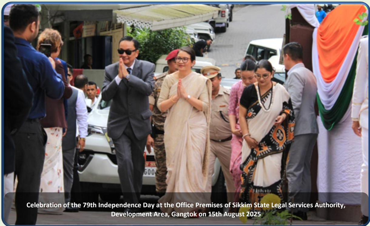
Celebration of the 79th Independence Day at the Office Premises of Sikkim State Legal Services Authority, Development Area, Gangtok on 15th August 2025