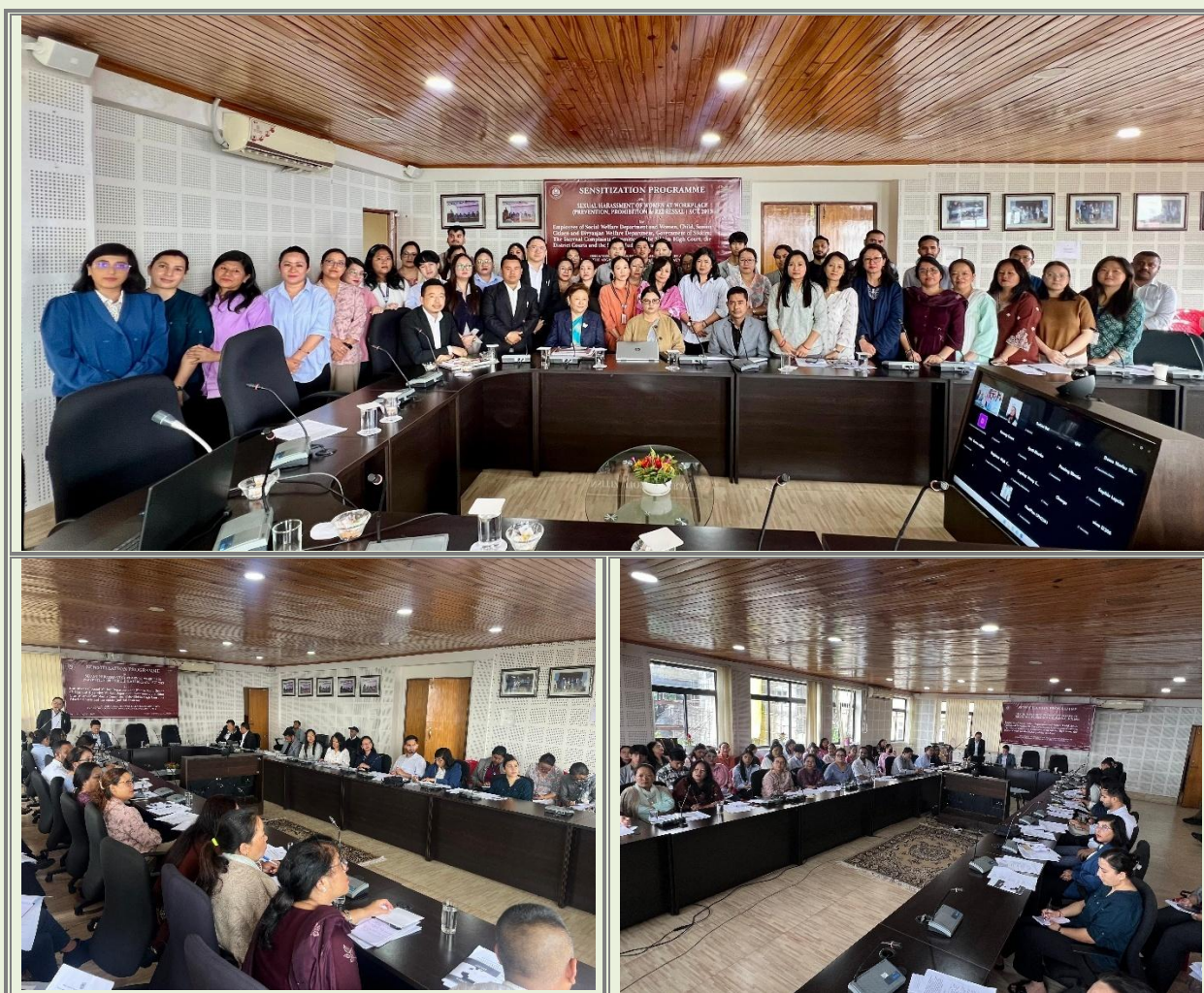
Sensitization Harassment of Women at Workplace (Prevention, Prohibition & Redressal) Act, 2013 for Employees of Social Welfare Department and Women, Child, Senior Citizen and Divyanjan Welfare Department, Government of Sikkim; The Internal Complaints Committee of the Sikkim High Court, the District Courts and the Sikkim Judicial Academy held at Sikkim SLSA office on 29 th August 2025, Gangtok District.