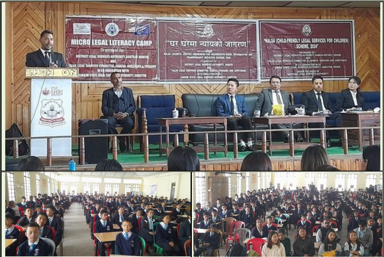
Awareness programme on NALSA (Child-Friendly Legal Services for Children) Scheme, 2024 and Ghar Gharma Nyaiko Jagran under NALSA (JAGRITI- Justice Awareness for Grassroots Rural Information and Transparency Initiative) Scheme, 2025 along with Micro Legal Literacy Camp organised by DLSA Namchi and TLSC Namchi, Jorethang & Yangang in co-ordination with Sikkim SLSA on 08.09.2025 at Ravangla VC Ganju Lama Sr. Sec. School, Namchi District.