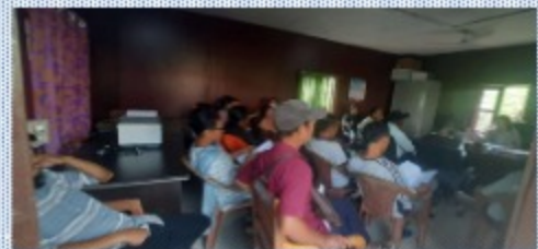
Vignette from the programme organized by DLSA Senapati, Manipur