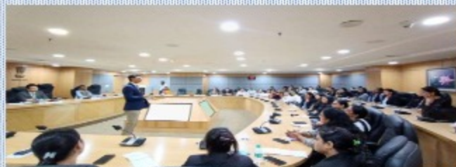
Vignettes from programme organized by Delhi SLISA for lawyers of Rape Crisis Cell