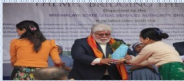
Vignettes from the programme organized by Meghalaya SLISA