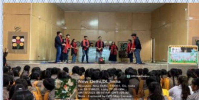
Vignettes from the programme organized by DLSA South-West, Delhi