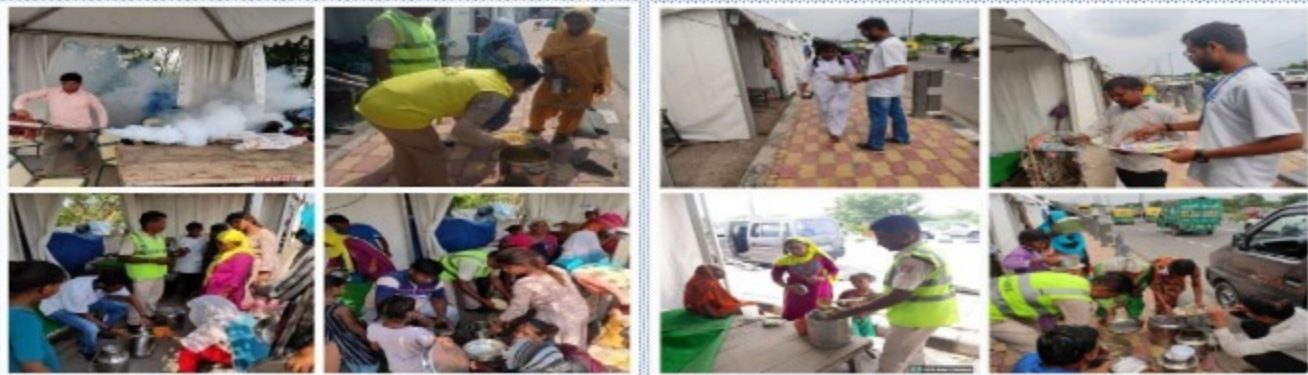
Vignettes from the programme organized by DLSA, Central District, Delhi