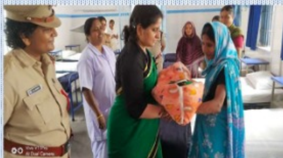
Vignettes from the programme at Special Prison for women, Chanchalguda, Hyderabad (right)