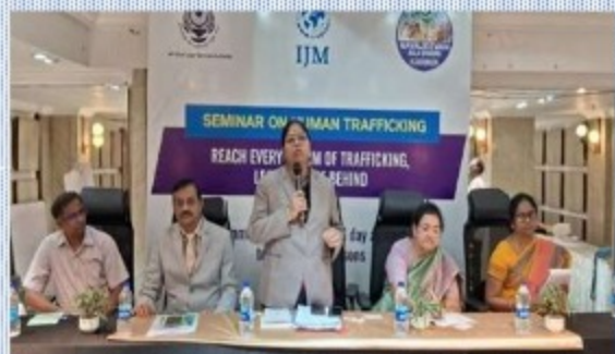
Vignette from the programme organized by Andhra Pradesh SLISA