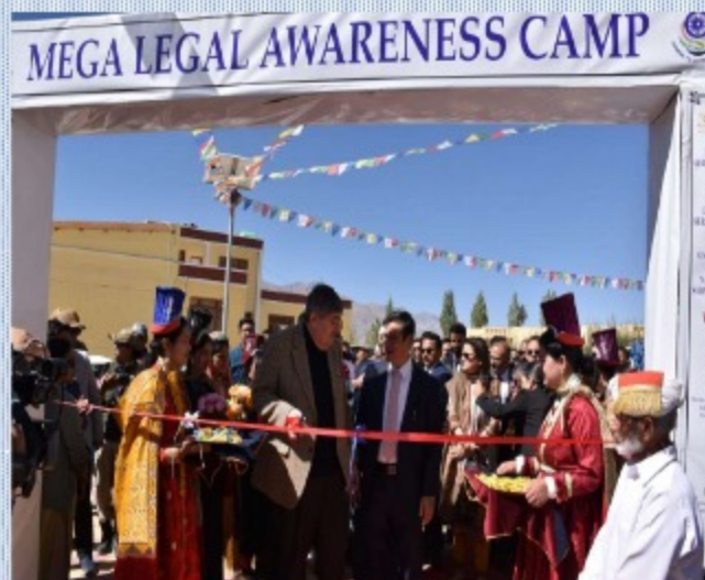
Vignettes from the Mega Legal Awareness Camp at Leh