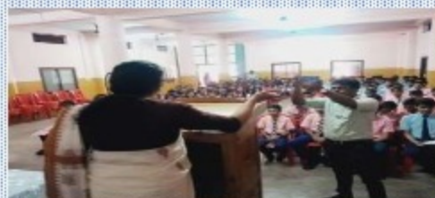
Vignette from the programme organized by DLSA, Pathanamthitta, Kerala