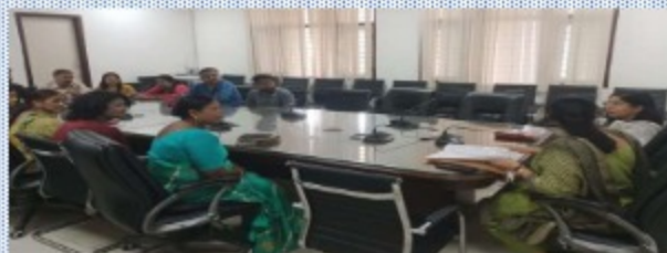
Vignettes from programme organized by Chandigarh DLSA