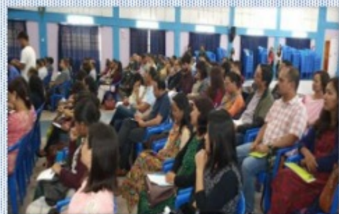
Vignettes from the programme organized by DLSA East Khasi Hills, Meghalaya