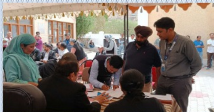
Vignettes from Ladakh