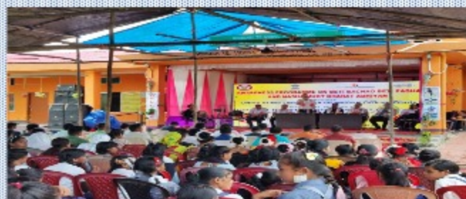
Vignettes from the programme organized by DLSA, Dhubri, Assam