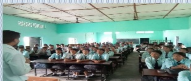
Vignette from the programme organized DLSA, Golaghat (above) Vignette from the programme organized by Sikkim SLISA (below)