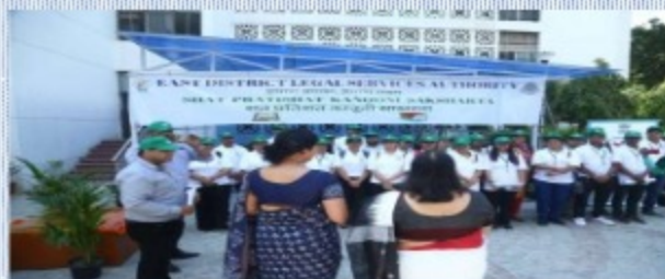
Vignettes from the programme organized by DLSA East, Delhi