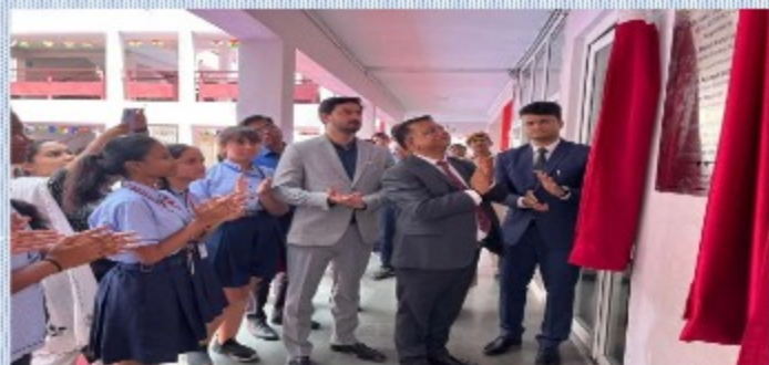
Vignette from the programme organized by DLSA New Delhi District, Delhi