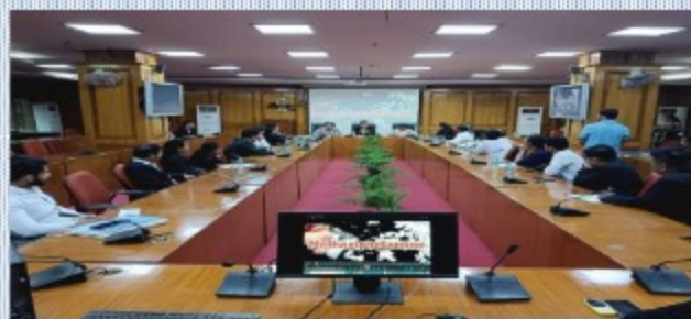
Vignettes from programme at Karkardooma Court Complex, Delhi