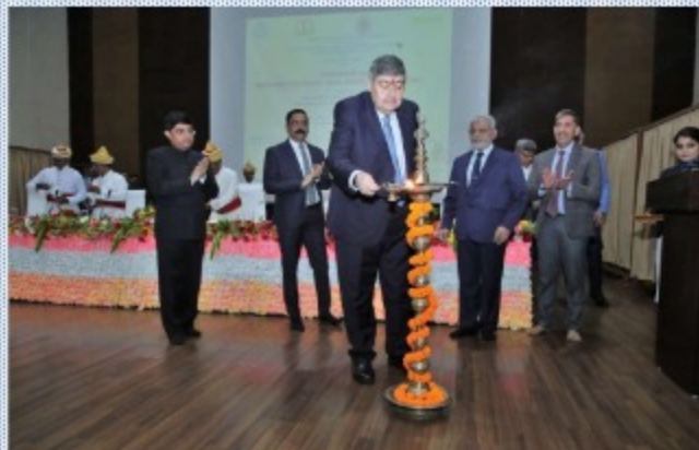
Vignettes from the programme at Jharkhand Judicial Academy