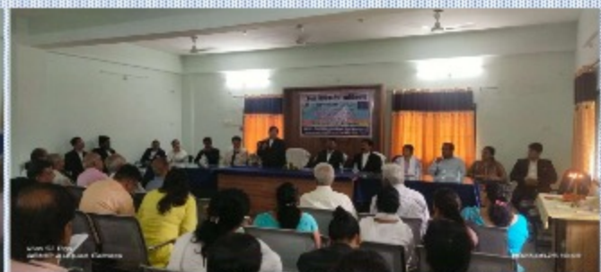
Vignettes from the programme organized by DLSA, Janjgir, Chhattisgarh