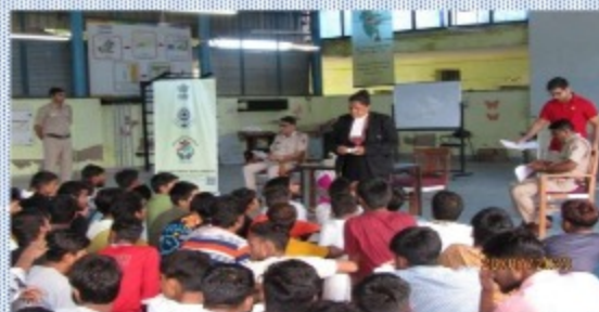
Vignette from the programme at Tihar Jail (above) Vignette from the programme at District Jail, Leh (below)