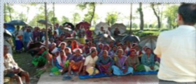
Vignettes from the programme organized by DLSA Sonitpur, Assam