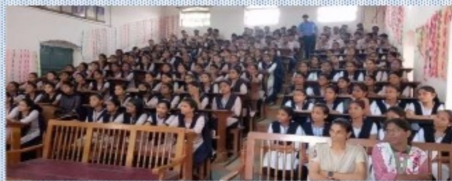
Vignettes from the programme organized by DLSA Vizianagram, Andhra Pradesh