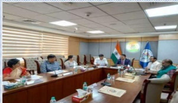
Vignettes from programme organized by Delhi SLISA for Principle Magistrates, JJBs