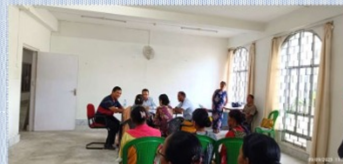
Vignettes from Meghalaya