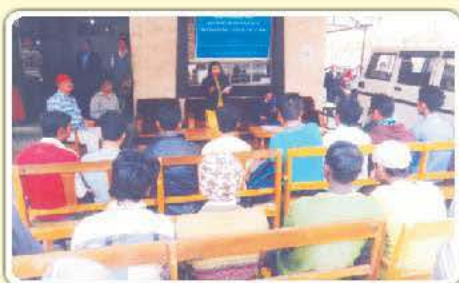
District Courts premises, Sichey, East Sikkim