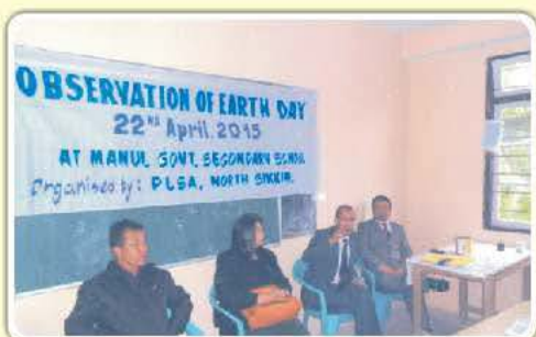
Gout. Sec. School, Manul, North Sikkim