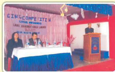
North Sikkim Academy, North Sikkim