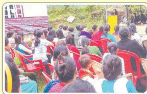
Yuksom, West Sikkim