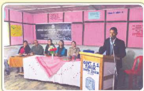
Govt. Sec. School, Turuk