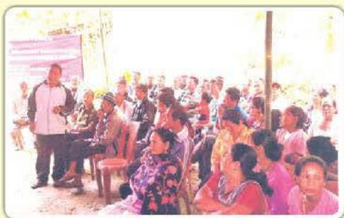
Nayabusty, Gyalshing, West Sikkim