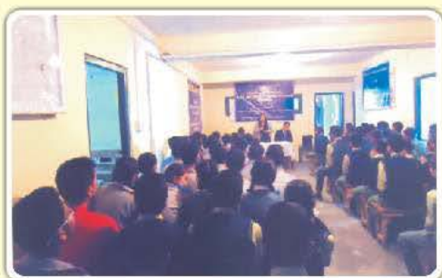
Kyi-De-Khang Sec. School, Sichey, Gangtok, East Sikkim