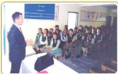
Kyi-De-Khang Sec. School, East Sikkim