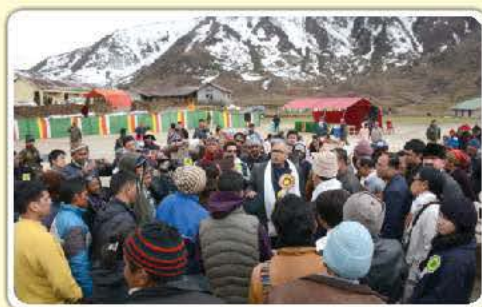
Hon'ble Mr. Justice Deepak Gupta, Chief Justice, High Court of Tripura/Patron-in-Chief, Tripura SLISA discussing with local gentries