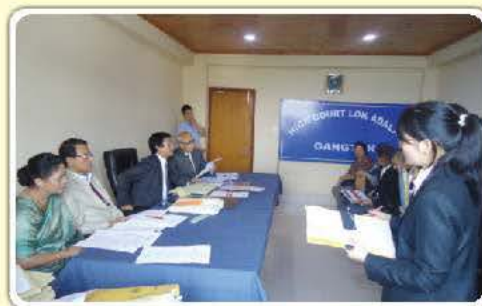
High Court Lok Adalat in progress