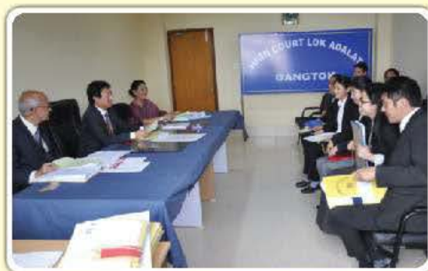
High Court Lok Adalat in progress