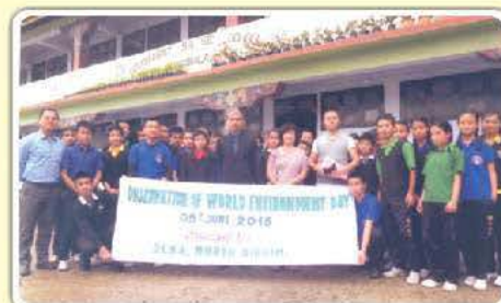
Govt. Sr. Sec. School, Mangshila, North Sikkim