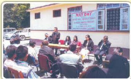
Civil Court premises, Gyalshing, West Sikkim