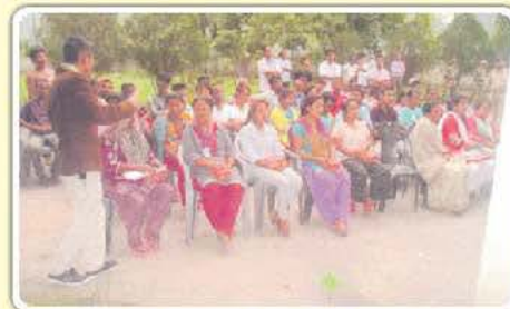
Manpur, South Sikkim