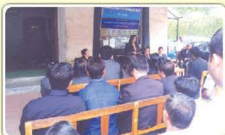
District Courts premises, East Sikkim