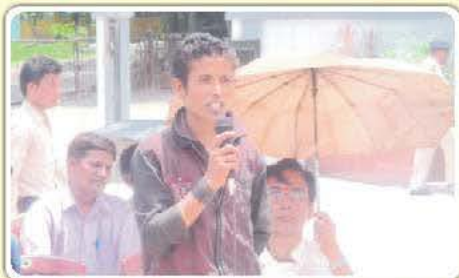
Interaction with Labour at Mamring, South Sikkim