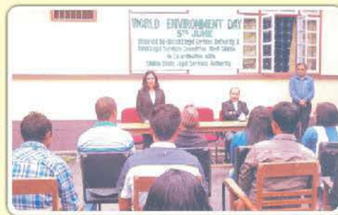
Civil Court premises, Gyalshing, West Sikkim