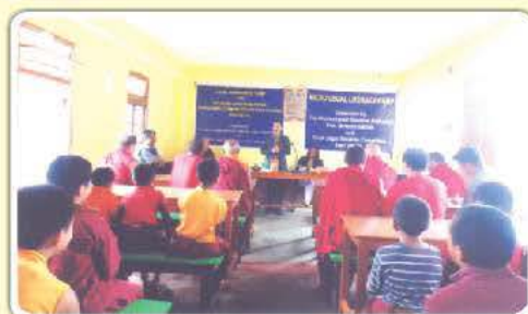
Ngor Gumpa, Rongyek, East Sikkim