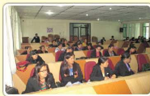
PLVs attending the training

Similarly, three days advanced training for the Para-Legal Volunteers was organized by District Legal Services Authority (West) and Taluk Legal Services Committee (West) in coordination with Sikkim State Legal Services Authority in the District Consumer Redressal Forum, Gyalshing, West Sikkim from 24 th April, 2015 to 26 th April, 2015. 06 Para-Legal Volunteers attended the training programme.