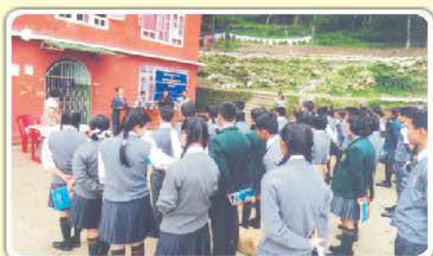
Prashanti Vidya Mandir Sec. School, Sichey, Gangtok, East Sikkim