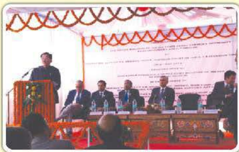
Mr. Pawan Chamling, Hon'ble Chief Minister of Sikkim delivering an address in the inaugural function