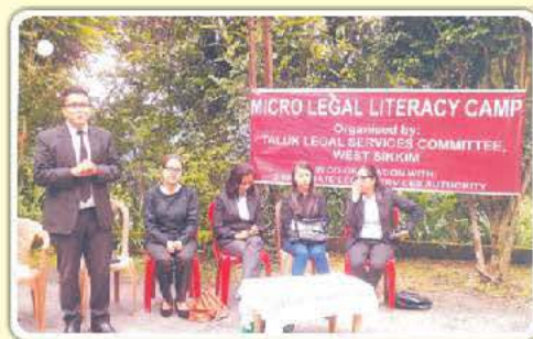
Byadong, West Sikkim