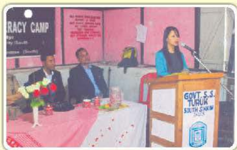
Govt. Sec. School, Turuk, South Sikkim