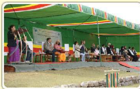
Awareness Programme at Gnathang, East Sikkim