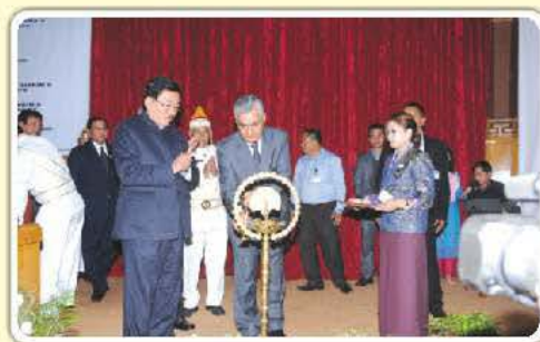
Hon'ble Mr. Justice T.S. Thakur lighting the inaugural lamp in presence of Mr. Pawan Chamling, Hon'ble Chief Minister of Sikkim

The function was attended by Hon'ble Executive Chairmen of North-Eastern SLSAs, Member Secretaries, Judicial Officers, Ex-Officio Members of Sikkim SLSA, officers from the State Departments, Panel Advocates, faculty members and students from Sikkim Government Law College and Sikkim University, and other dignitaries.