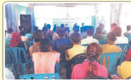
Construction site of District Court, Kyongsa, West Sikkim