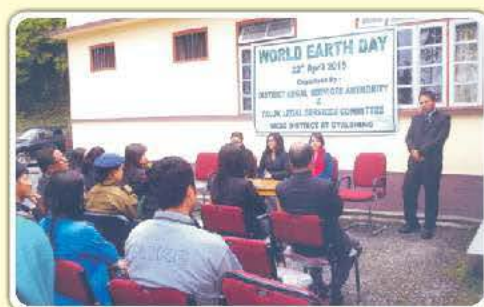
Civil Court premises, Gyalshing, West Sikkim