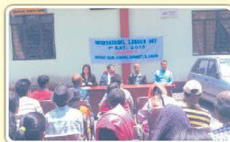
Civil Court premises, Mangan, North Sikkim