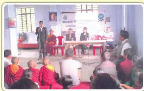
Perbing Gumpa, South Sikkim