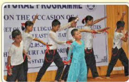
Glimpses of Cultural Programme

Similarly, Advocates and dance troupe from Cultural Department of Sikkim and Rongong Youth Club also participated in the programme.