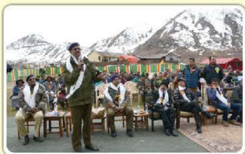
Interaction with Army Personnel during the Awareness Programme