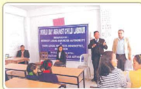
Khorong Govt. Primary School, West Sikkim