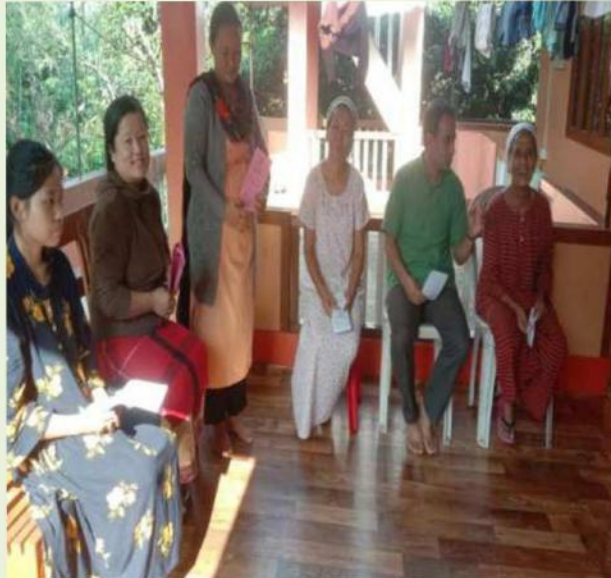
Door-to-Door Campaign conducted by Dlsa (East) at Gangtok