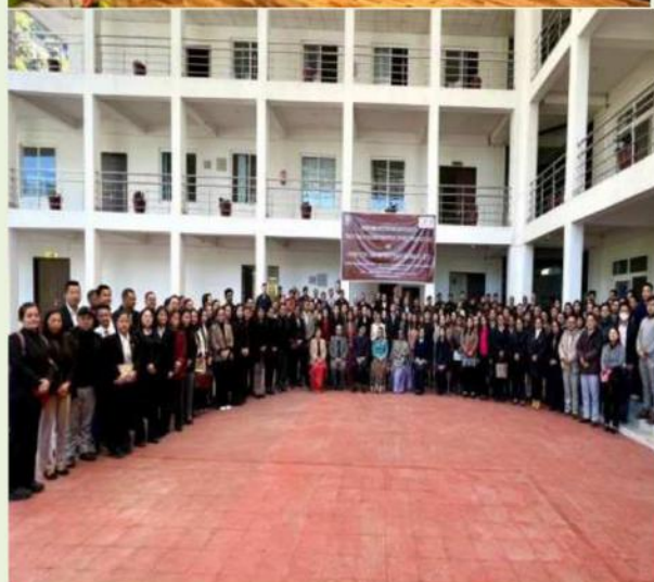
Training Programme on the proper and effective implementation of “Protection of Children from Sexual Offences (POCSO) Act, 2012 read with Protection of Children from Sexual Offences (POCSO) Rules, 2012 and Juvenile Justice (Care and Protection of Children) Act, 2015” held on 26 th November, 2022 at Sikkim Judicial Academy, Sokeythang, East Sikkim.