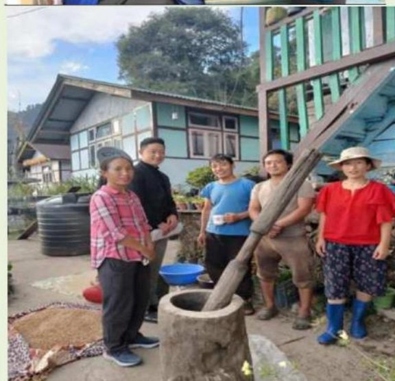
Door-to-Door Campaign conducted by Dlsa (North) at Mangan