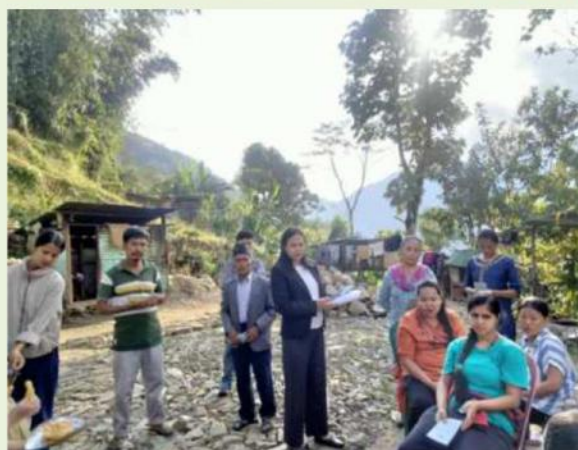
Door-to-Door Campaign conducted by Dlsa (West) at Gyalshing