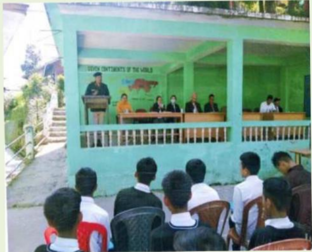
Government Secondary School, Lingee Paiyong