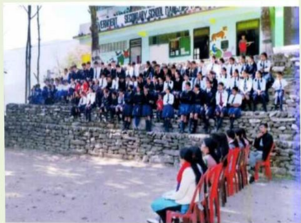
Government Secondary School, Manzing