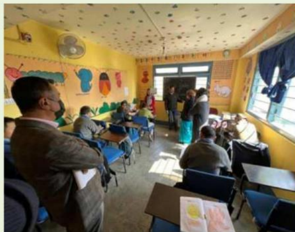
Special School for Children with Disabilities, Gangtok