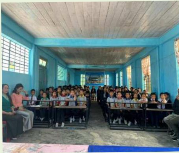
Government Secondary School, Pachak, Pakyong