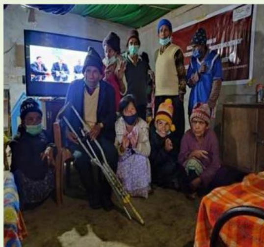
Tintek Lee Aal Old Age Home at Tintek, Gangtok