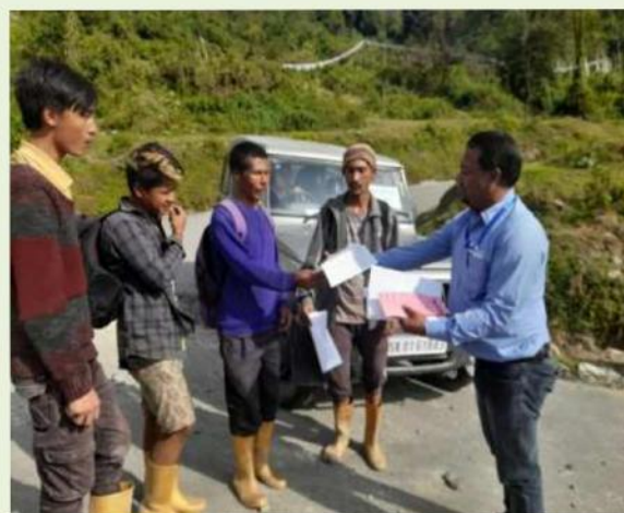
Door-to-Door Campaign conducted by Dlsa (South) at Namchi