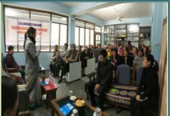
Sangkalang, Dzongu, Mangan district