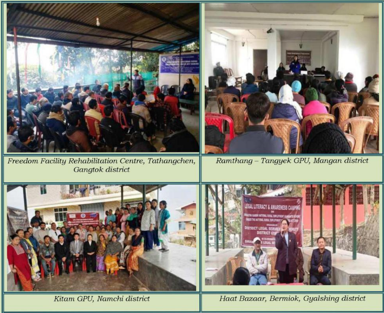
Glimpses of the awareness programme