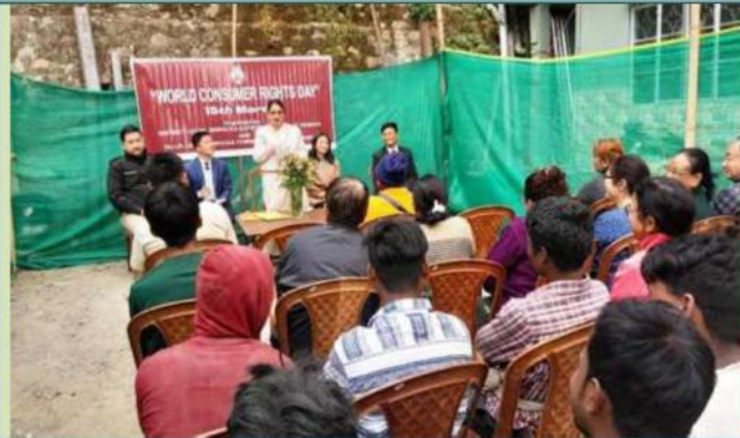
Debrung, Namchi district