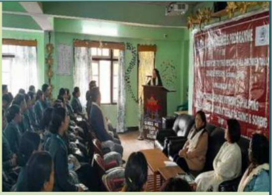
District Institute of Education and Training, Kyongsa, Gyalshing district