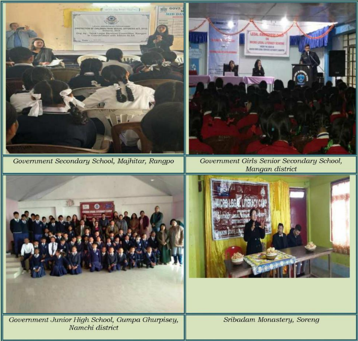
Glimpses of the awareness programme