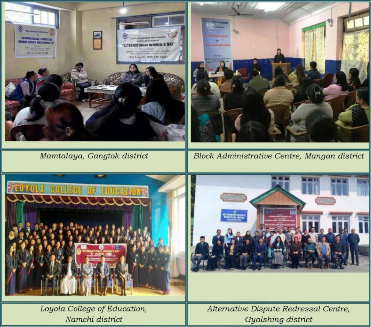
Glimpses of the awareness programme

Further, as a publicity drive, Sikkim SLSA published messages on legal rights of women in local newspapers/dailies as well as broadcasted awareness of Rights of Women in All India Radio and also disseminated awareness on Rights of Women through local cable network.