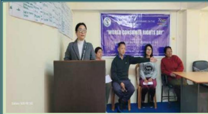
Panchayat Bhawan, Syari, Gangtok district