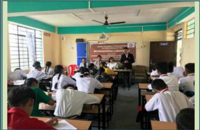
Government Secondary School, Ringhim, Mangan District