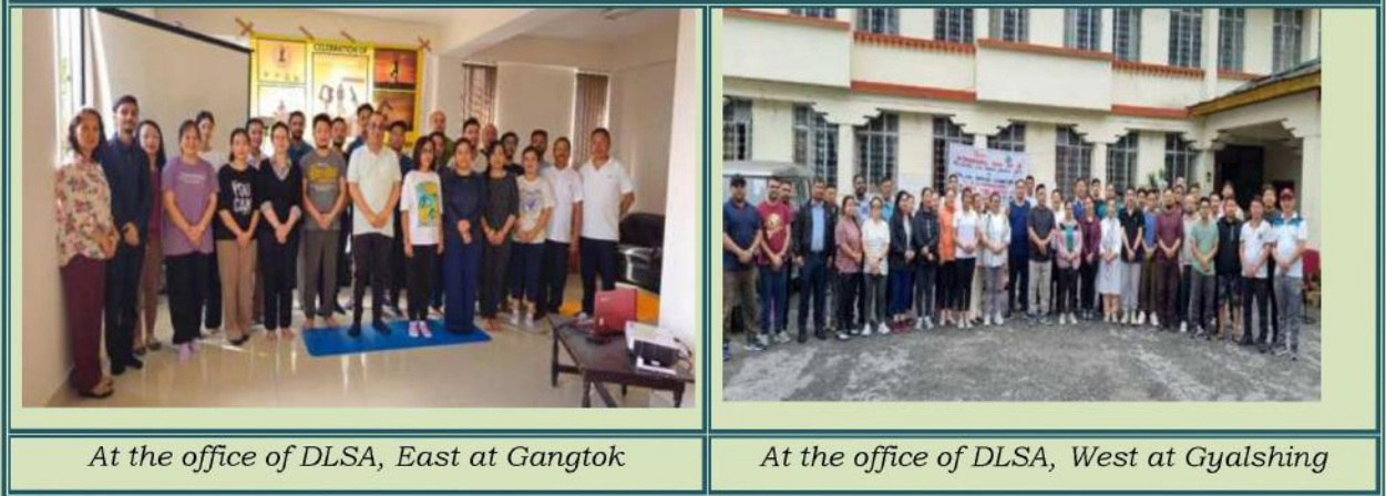
At the office of DLSA, East at Gangtok