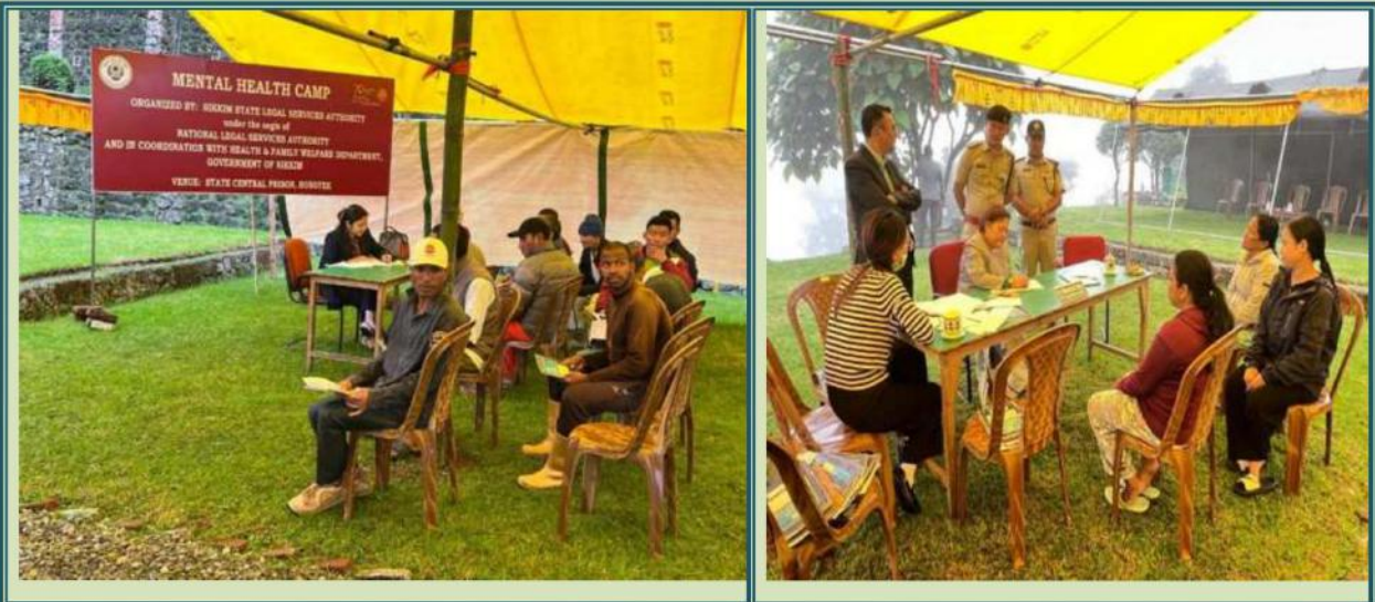
Mental Health Camp at State Central Prison, Rongyek, Gangtok District on 15 th June, 2024