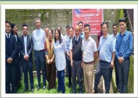
World Environment Day at District Court premises, Gyalshing