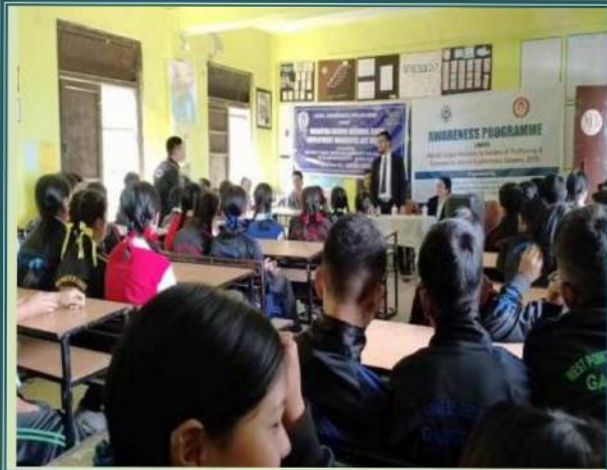
West Point Senior Secondary School, Tathangchen, Gangtok District