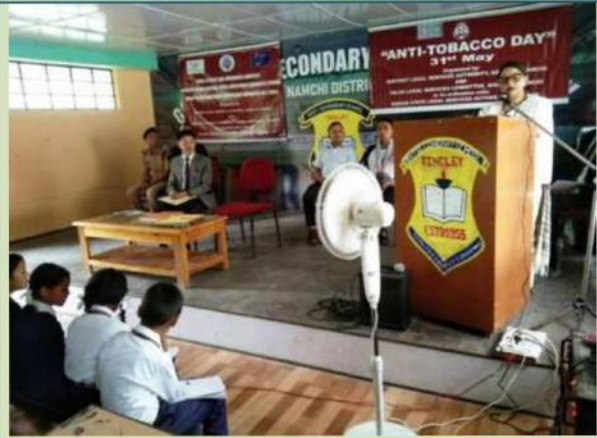
Anti – Tobacco Day at Government Secondary School, Tingley, Namchi District