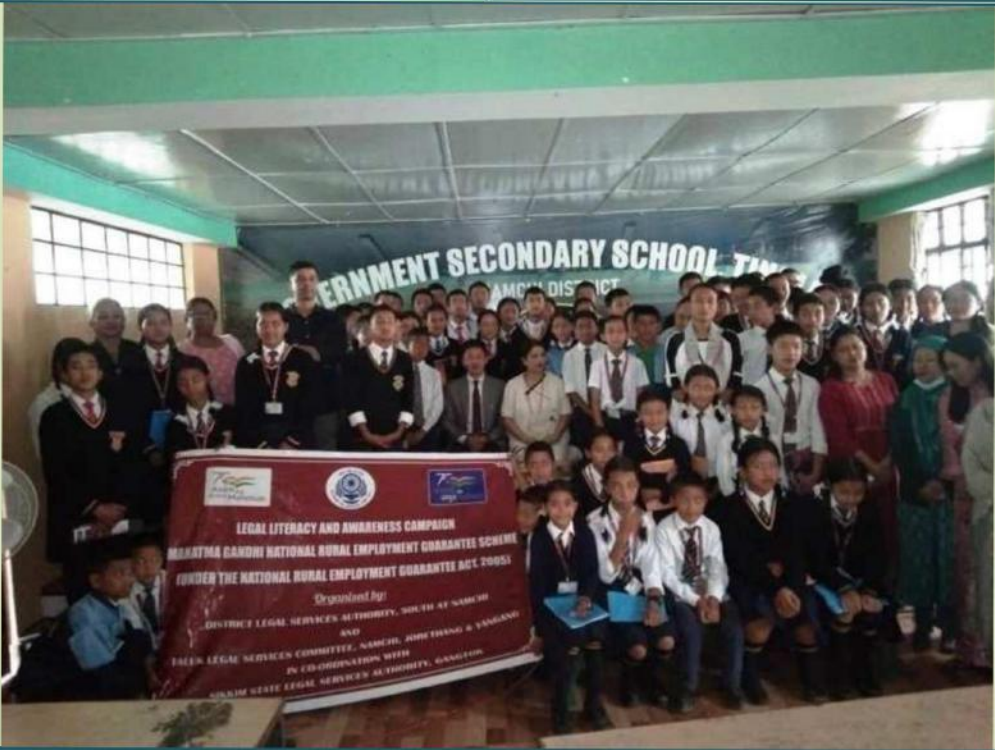
Tingley Secondary School, Namchi District