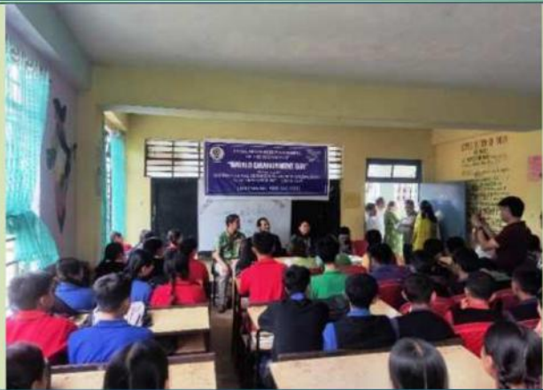
World Environment Day at Government Senior Secondary School, Ranka, Gangtok District