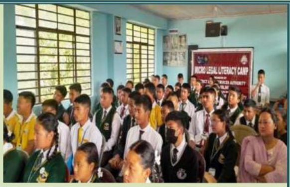
Government Senior Secondary School, Lingchom, Gyalshing District