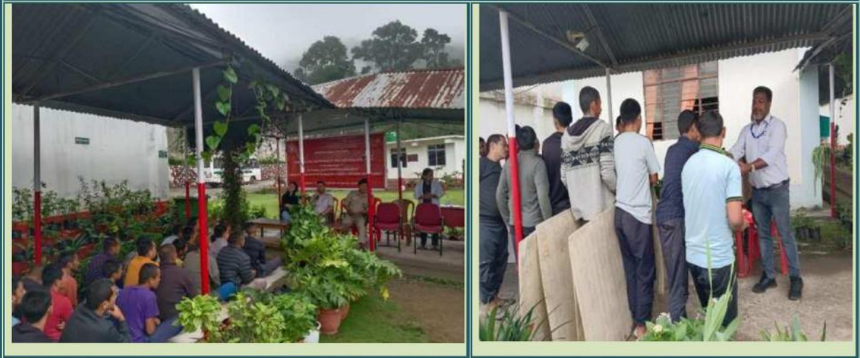
Mental Health Camp at District Prison, Boomtar, Namchi District on 15 th June, 2024