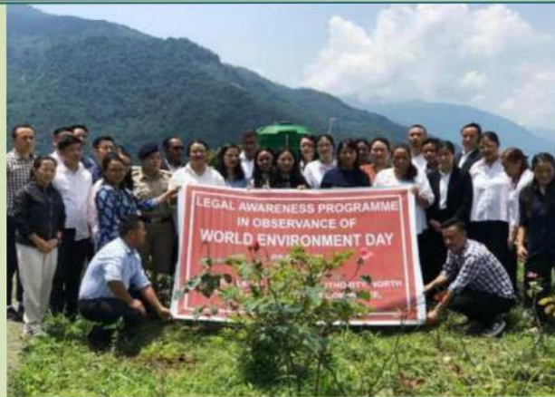
World Environment Day at District & Sessions Court, Mangan District