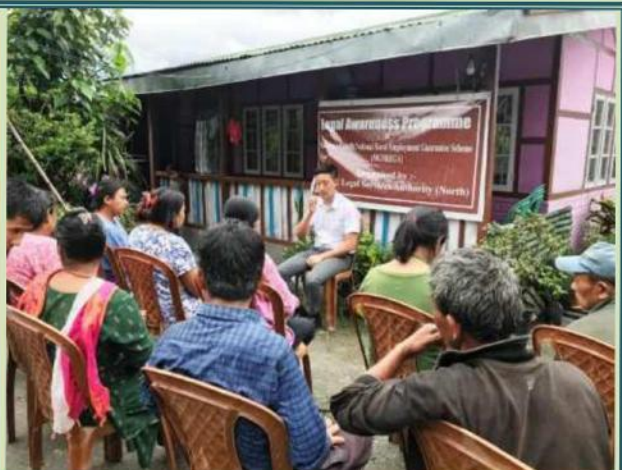
Rangrang, Mangan District