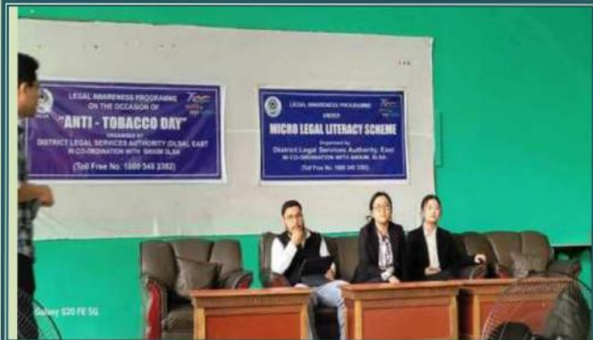
Government Secondary School, Chanatar, Rangpo, Pakyong District