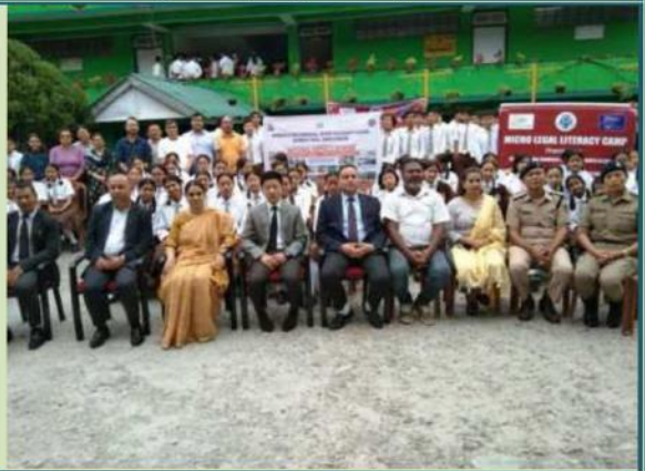
PM SHRI Government Senior Secondary School, Bermiok – Tokal, Namchi