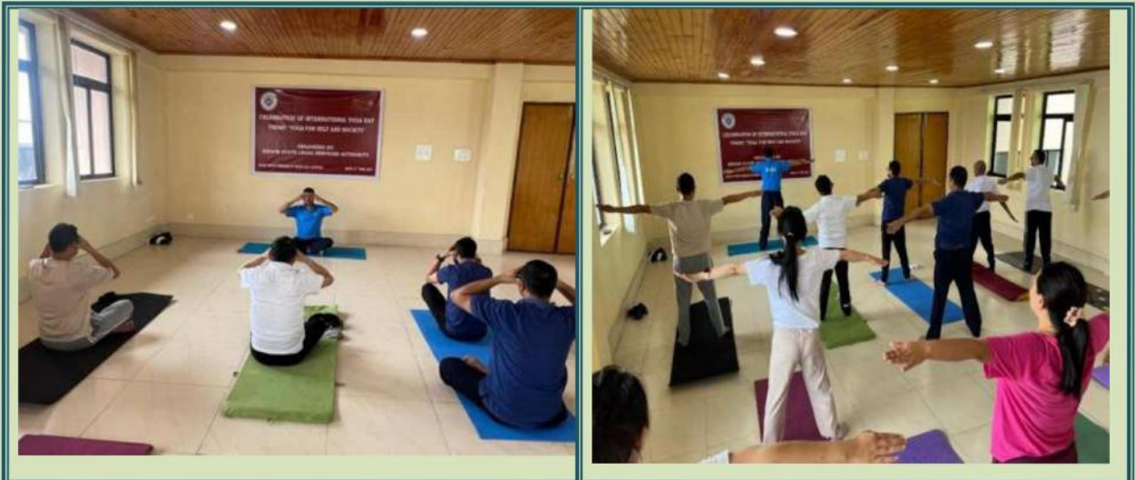
At the office of Sikkim State Legal Services Authority, Development Area, Gangtok.

The International Yoga Day was also observed by all the District Legal Services Authorities and Taluk Legal Services Committees.