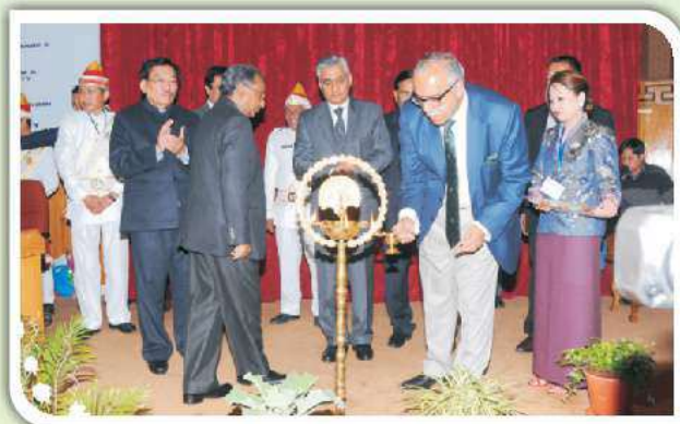
Hon'ble Mr. Justice Deepak Gupta, Patron-in-Chief, Tripura SLSA