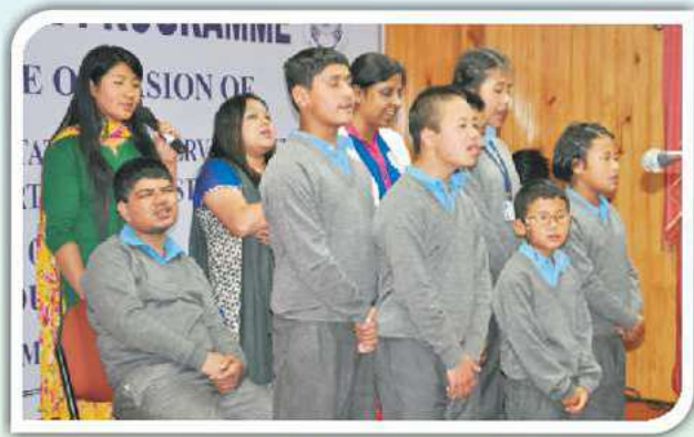
Group song by Spastic Society, Gangtok