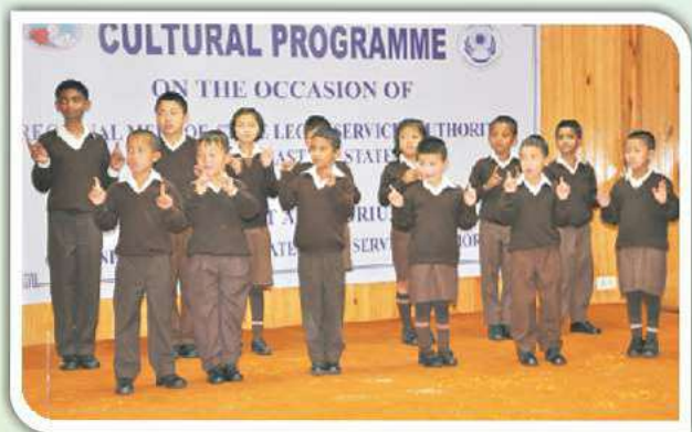
Action song by children from Special School for Hearing Impaired, Gangtok