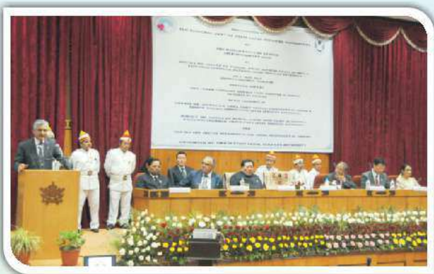
Hon'ble Mr. Justice T.S. Thakur addressing the gathering