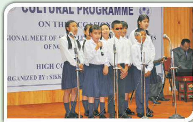
Group song by Blind School, Namchi, South Sikkim