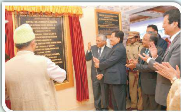
Hon'ble Mr. Justice T.S. Thakur and Hon'ble Chief Minister of Sikkim opening the plaque of the new building of Sikkim SLSA