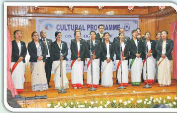
Welcome song by Members, Bar Association of Sikkim, Gangtok