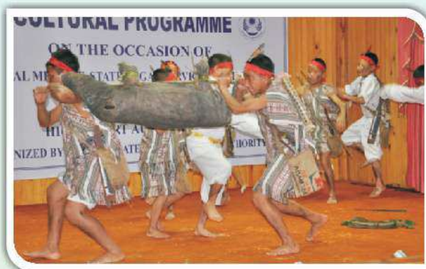
Traditional Lepcha Dance by Padma Odzer Choeiling School, Chongyek, East Sikkim