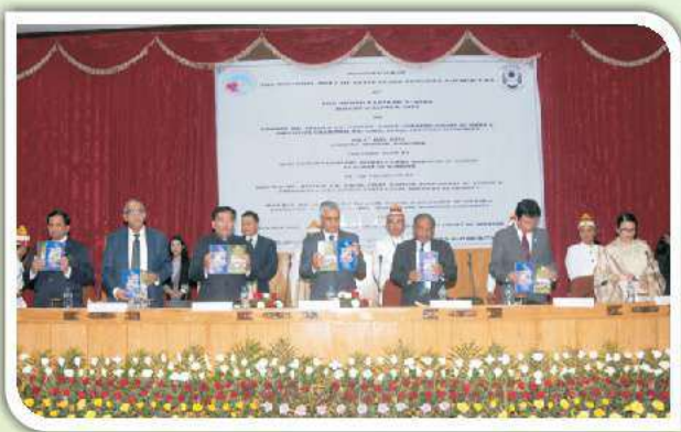
Releasing of amended version of the book "Lessons in Law" for standards IX and XI by the dignitaries