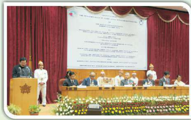
Hon'ble Chief Minister of Sikkim addressing the gathering