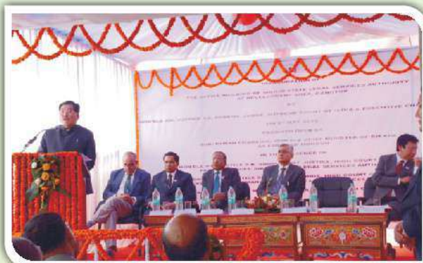
Hon'ble Chief Minister of Sikkim