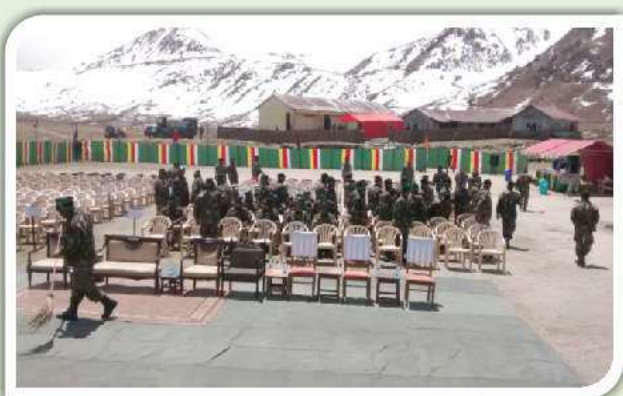
Army Jawans cleaning the area for the Awareness Programme