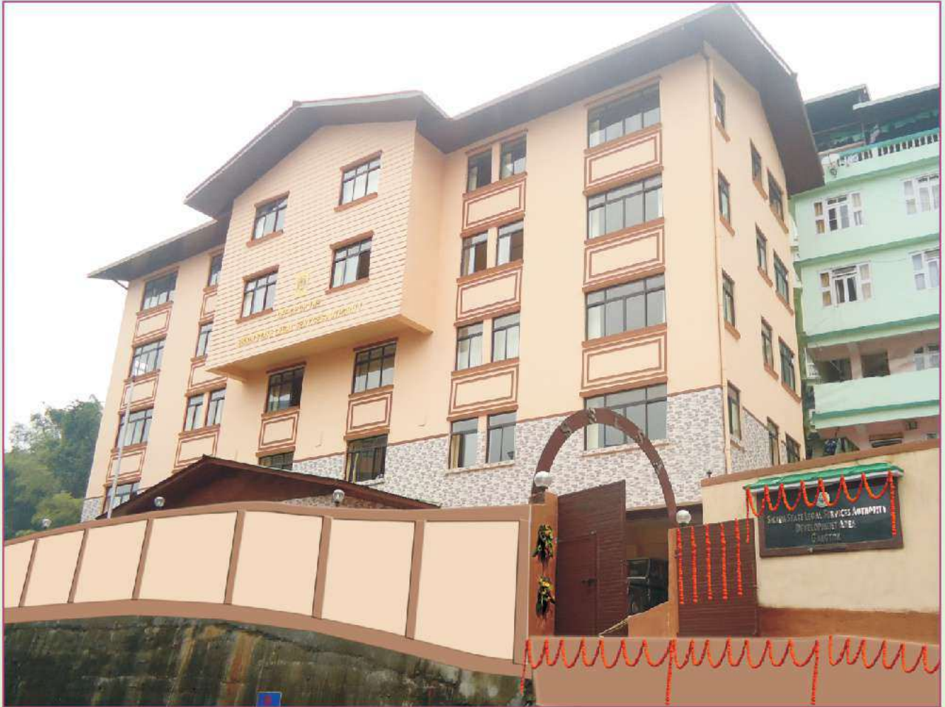
New Office building of Sikkim State Legal Services Authority, Development Area, Gangtok Phone : 03592 207753 (O) Tele-Fax Email: sikkim_slsa@live.com Website: http://sikkimslsa.nic.in