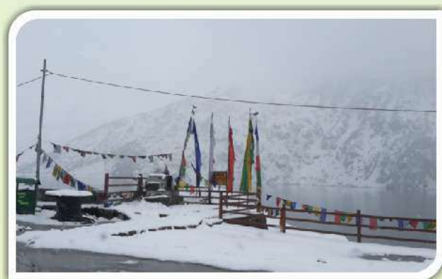
Tsongu Lake during the recce