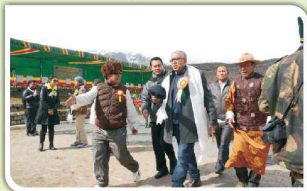
Conclusion of the programme