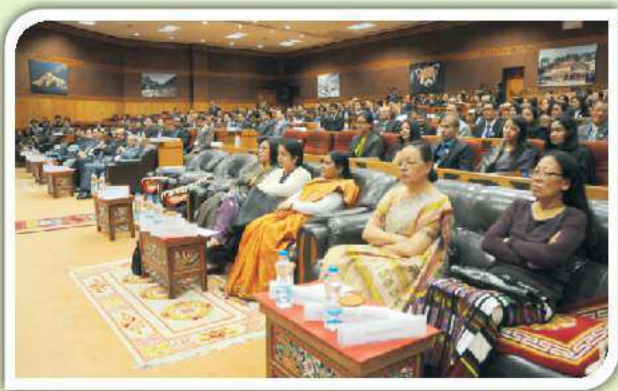
Spouses of the dignitaries