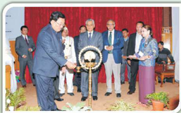
Mr. Pawan Chamling Hon'ble Chief Minister of Sikkim