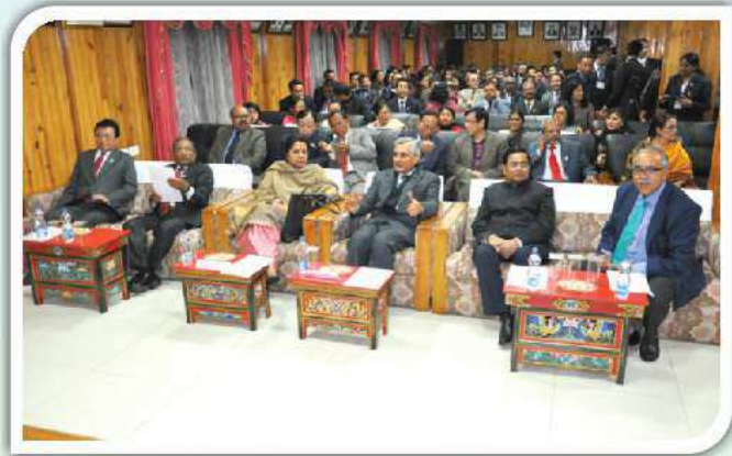
Hon'ble dignitaries enjoying the Cultural show