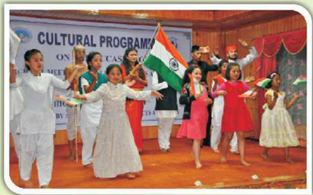
(We are Indians) skit by NGO 'Zest', Gangtok