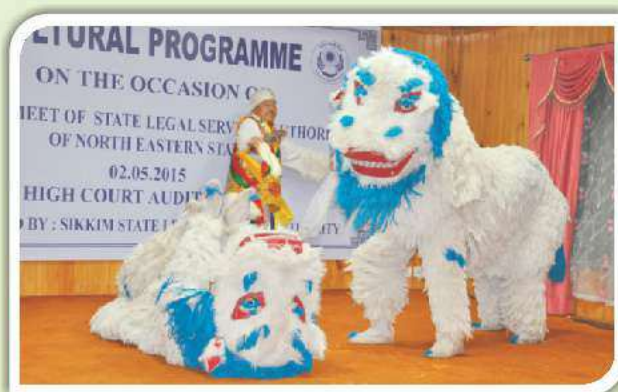
"Singhi" (Snow Lion) Dance by Cultural Affairs and Heritage Deptt., Govt. of Sikkim