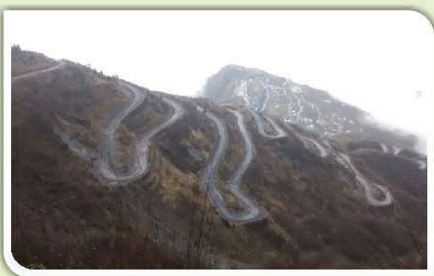
Zuluk during second recce on 25 th April, 2015