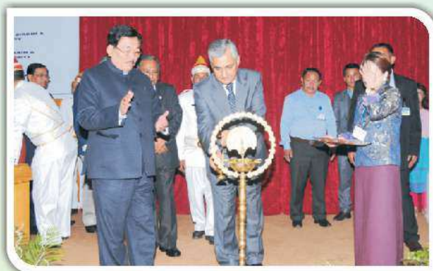
Hon'ble Mr. Justice T.S. Thakur, Executive Chairman, NALSA