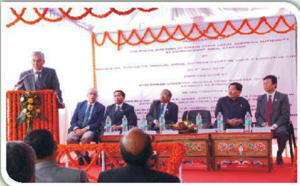
Hon'ble Mr. Justice T.S. Thakur