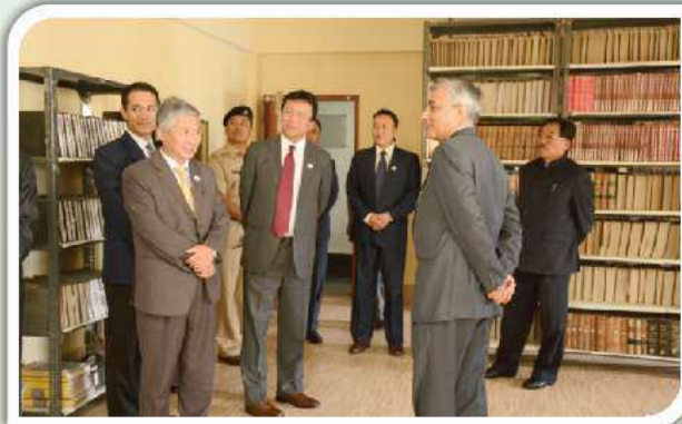
Visit of Office Library of Sikkim SLSA by the dignitaries