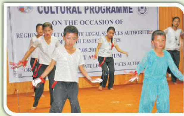
Children of Tarcon-Lee Shelter Home, Mangon, North Sikkim