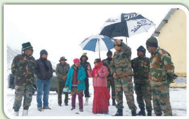
Addl. Secy., Sikkim SLISA with Panel Advocates, Panchayat Members, Army Officers and Sikkim Police during the recce on 25 th April, 2015