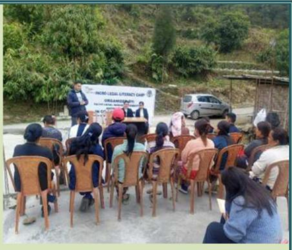
Dewanitar, Soreng district