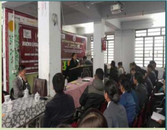
District Institute of Education and Training (DIET), Namchi district