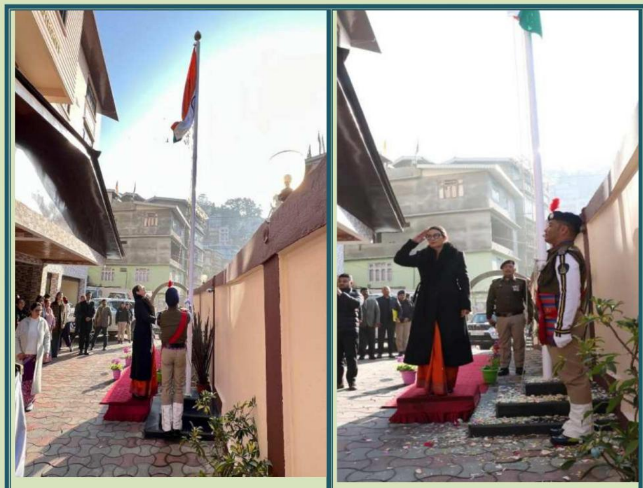
Celebration of 76th Republic Day on 26th January, 2025 in the office premises of Sikkim SLISA, at Development Area, Gangtok

The programme was attended by Judicial Officers, Senior Advocates, Panel Advocates, Officers and staff members of the Sikkim SLISA.