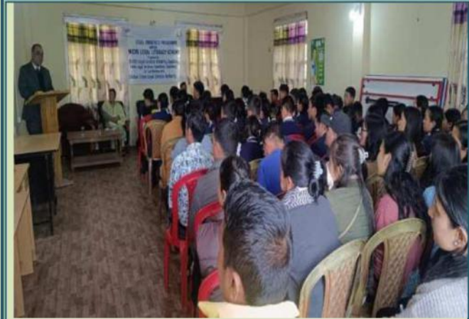
Sardong GPU, Gyalshing district