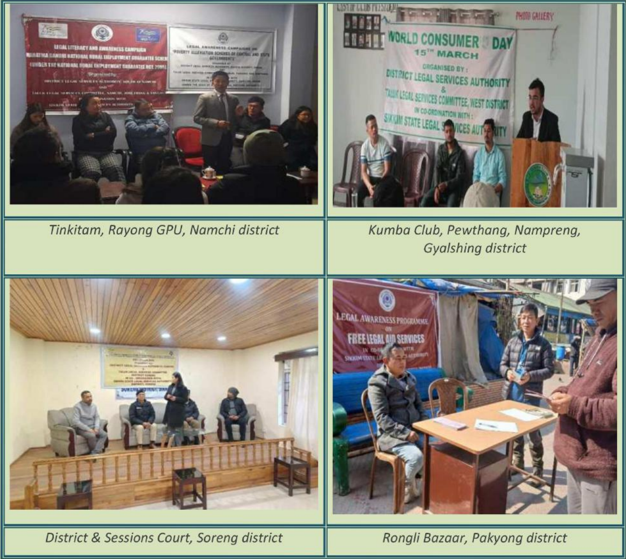
Tinkitam, Rayong GPU, Namchi district