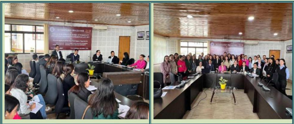
Sensitization Programme on Sexual Harassment of Women at Workplace (Prevention, Prohibition & Redressal) Act, 2013 for female employees and Members of Internal Complaints Committee of Labour Department, Government of Sikkim on 29th March, 2025 at the Conference Hall of Sikkim SLSA, Development Area, Gangtok

The welcome address was delivered by the Member Secretary, Sikkim SLSA while the vote of thanks was proposed by the Deputy Secretary, Sikkim SLSA.