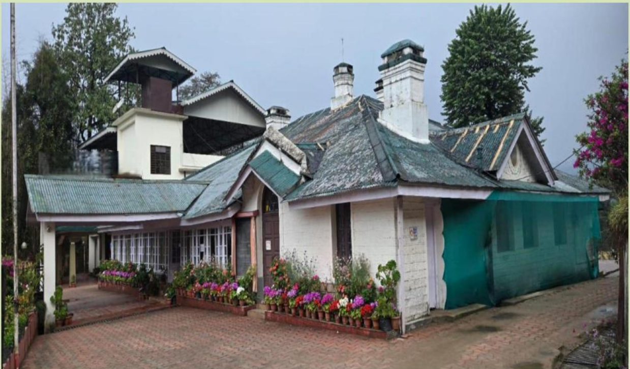
Former office building of Sikkim State Legal Services Authority, Forest Colony, Gangtok